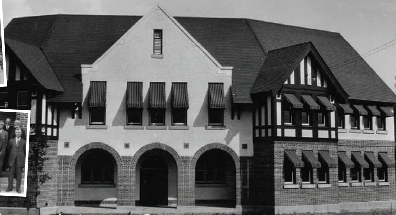
55. Court House, Salmon Arm