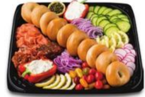
Lox & Bagel Tray 16-inch serves 10-12