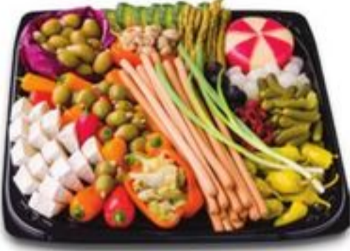
Cocktail Tray 12-inch serves 15-20