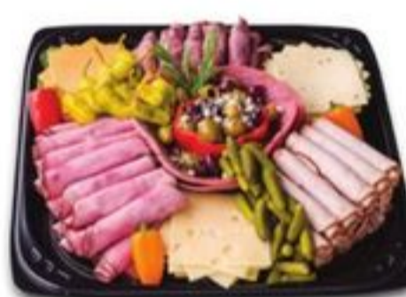
Classic Meat & Cheese Tray 12-inch serves 15-20 16-inch serves 20-30 18-inch serves 30-40