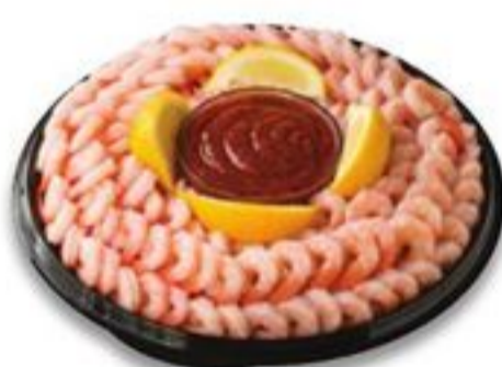
Bounty Shrimp Party Tray Serves 8-12