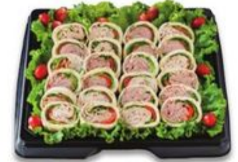
Pinwheel Tray 16-inch serves 12-16 18-inch serves 16-18