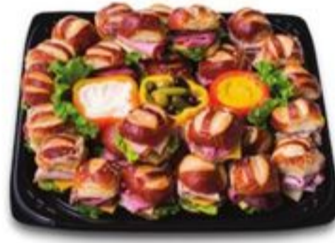
Pretzel Roll Slider Tray 16-inch serves 25-27 18-inch serves 40-45