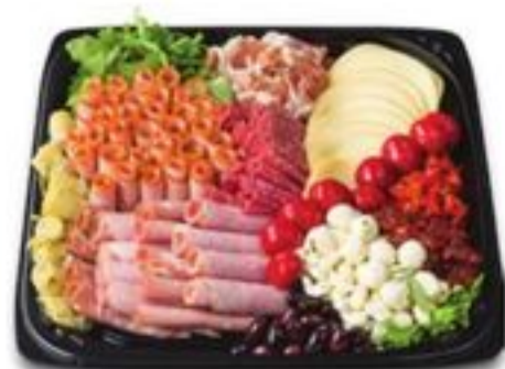
Italian Tray 16-inch serves 15-20