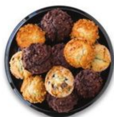
Muffin Platter Serves 12