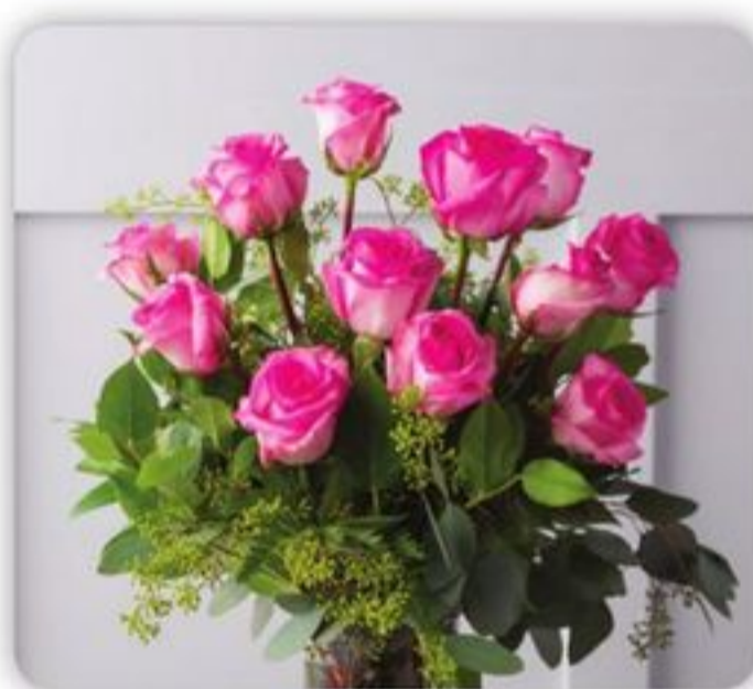
Illusion Rose Bouquet