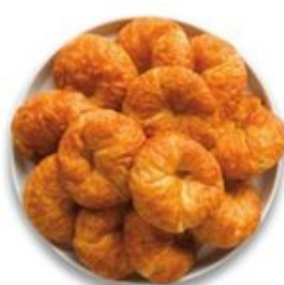
Croissant Platter Serves 12