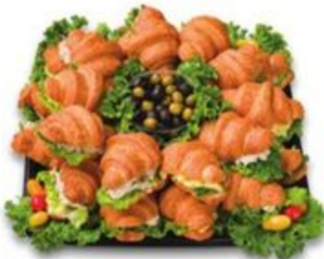
Mini Salad Croissant Tray 16-inch serves 12-16 18-inch serves 16-24