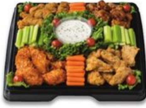
Wing Fling Tray 16-inch serves 12-16