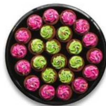
Brownie Bite Platter Serves 20-24