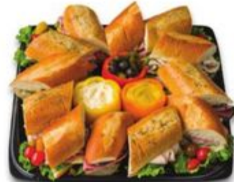
Hoagie Sandwich Tray 16-inch serves 12-14