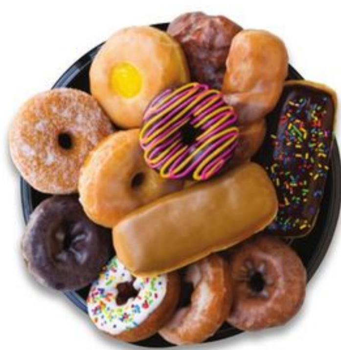
Donut Platter 12 assorted Serves 12

Start the day with fresh morning treats everyone will love. Our sweet and savory selection is expertly made in-store.