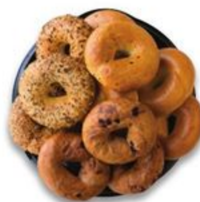
Bagel Platter Serves 12