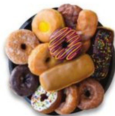
Donut Platter Serves 12