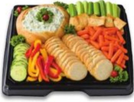
Big Dipper Tray 16-inch serves 15-20