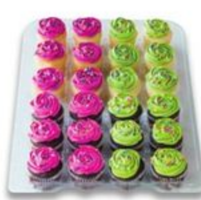
Cupcake Tray Serves 24