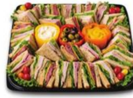
Finger Sandwich Tray 16-inch serves 12-16 18-inch serves 18-24