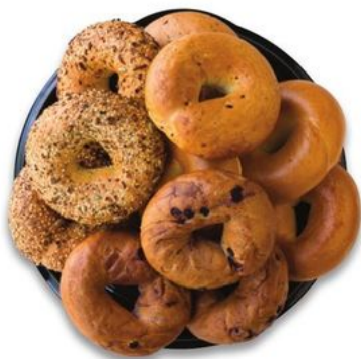
Bagel Platter 12 assorted Serves 12