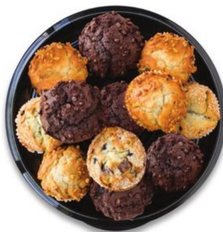
Muffin Platter 12 assorted Serves 12