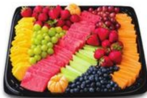
Fruit Tray 16-inch serves 20-25 18-inch serves 25-30