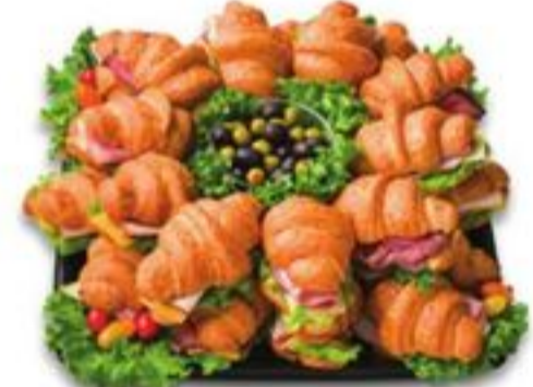
Mini Croissant Tray 16-inch serves 12-16 18-inch serves 16-24