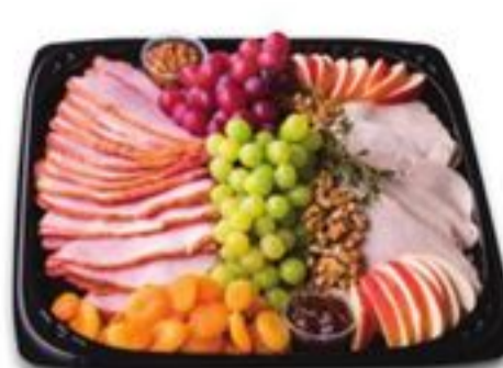
Carving Tray 16-inch serves 18-20