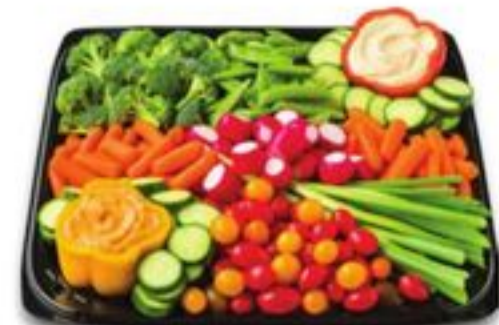
Vegetable & Hummus Tray 16-inch serves 20-25 18-inch serves 25-30