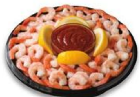
Admiral's Feast Party Tray Serves 6-8