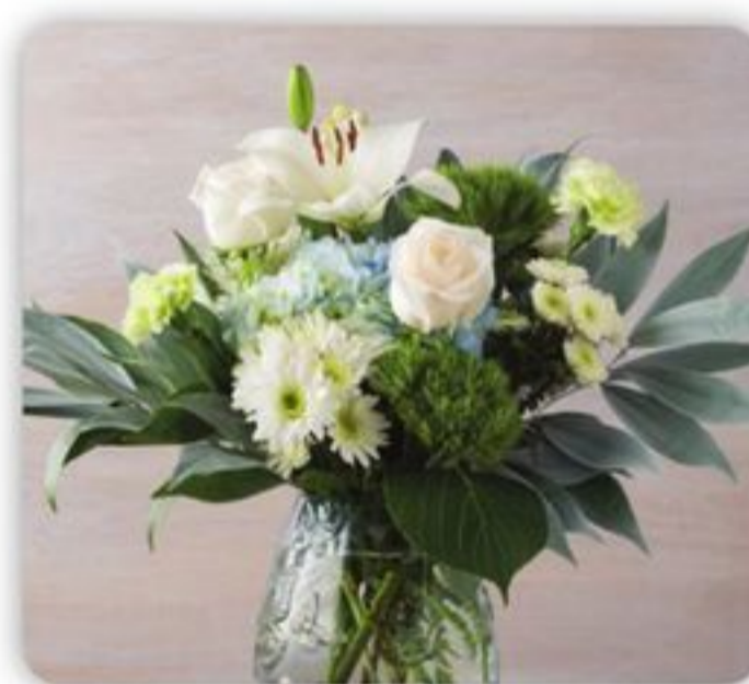
Elegant Romance Bouquet