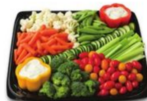
Vegetable & Dip Tray 16-inch serves 20-25 18-inch serves 25-30