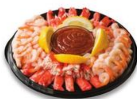
Kick'd Up Combo Party Tray Serves 4-6