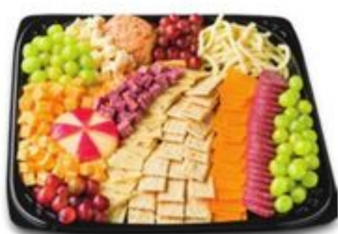
Classic Party Pack 16-inch serves 15-20