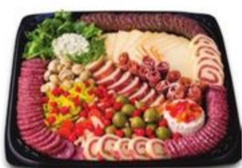
Italian Sampler 16-inch serves 15-20