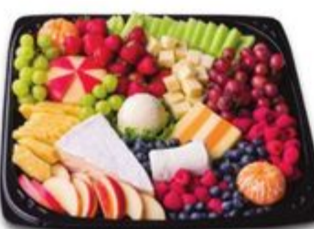
Fine Cheese & Fruit Tray 16-inch serves 15-20