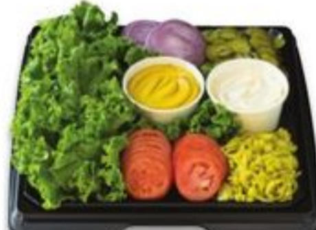
Condiment Tray 16-inch serves 12-16