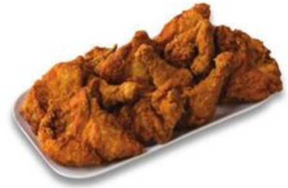
Fried Chicken Party Pack 50 Pieces, 100 Pieces 150 Pieces