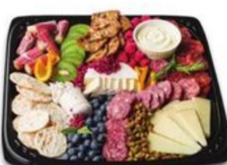
Elegant Charcuterie Tray 12-inch serves 15-20