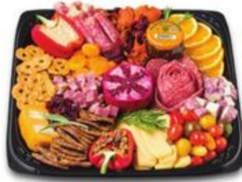
Harvest Tray 12-inch serves 15-20