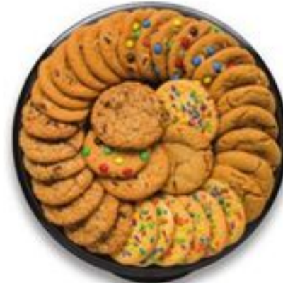
Cookie Platter Serves 36-50