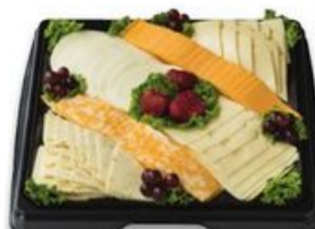
Sliced Cheese Tray 16-inch serves 20-25 18-inch serves 25-30