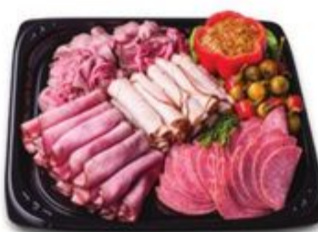
Meat Lover's Tray 12-inch serves 12-16 16-inch serves 20-25 18-inch serves 25-30