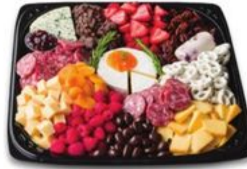
Sweet Treat Tray 12-inch serves 15-20