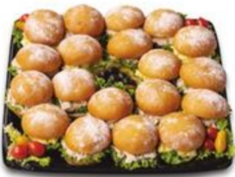
Salad Sandwich Tray 12-inch serves 10-12 16-inch serves 16-24