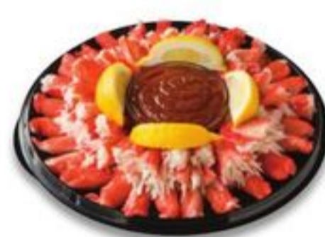
Alaskan Snow Leg Surimi Party Tray Serves 6-8