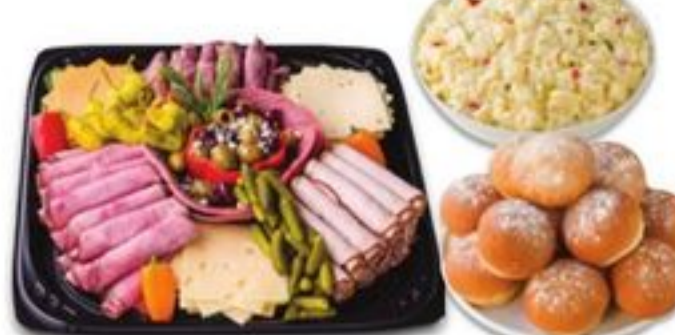
Deli Party Pack serves 20-24