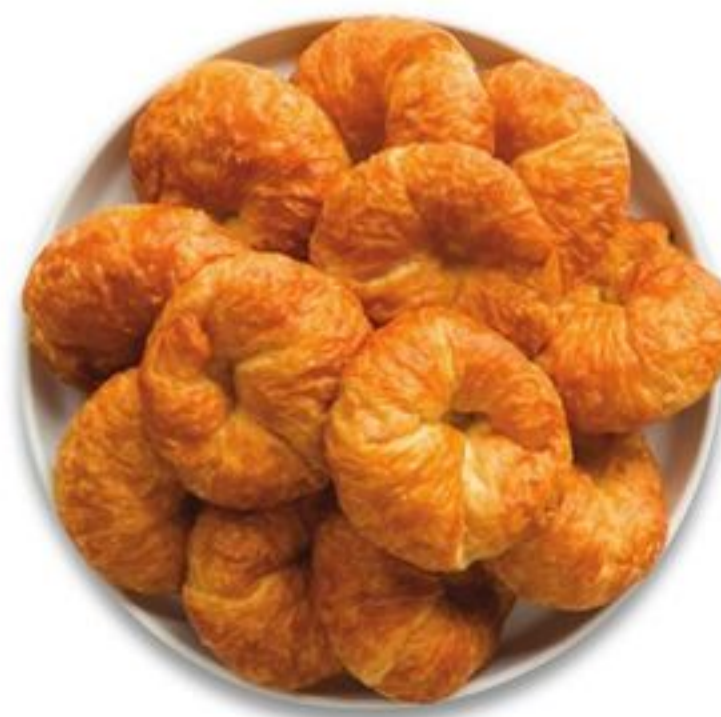
Croissant Platter 12 plain Serves 12