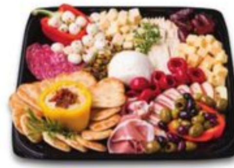
Mediterranean Tray 12-inch serves 15-20