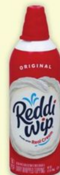
Reddi-Wip Aerosol Whipped Topping 6.5-oz. Selected varieties.