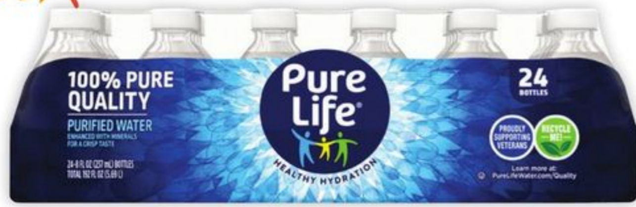
Pure Life Water 24-pack, 8-oz. Plus deposit and fees.