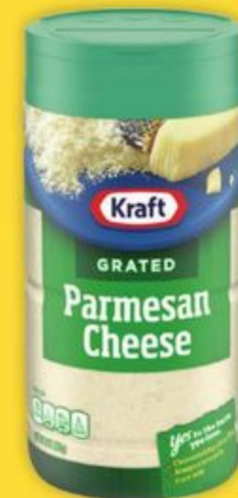
Kraft Grated Parmesan Cheese 8-oz. Selected varieties.