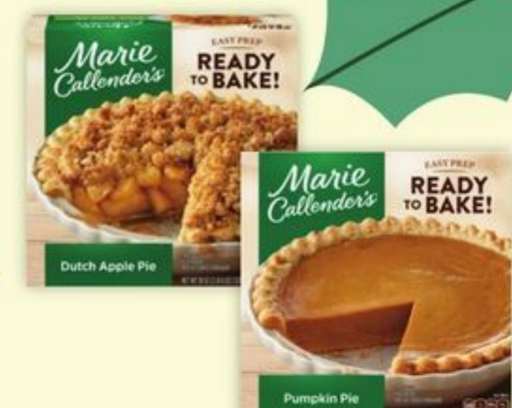
Marie Callender's Fruit or Cream Pie 25.6 to 40-oz. Selected varieties.