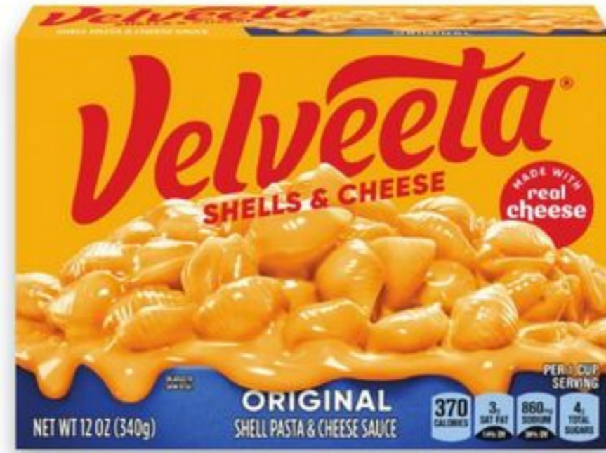
Kraft Liquid Macaroni & Cheese 10.9 to 14-oz. Selected varieties.