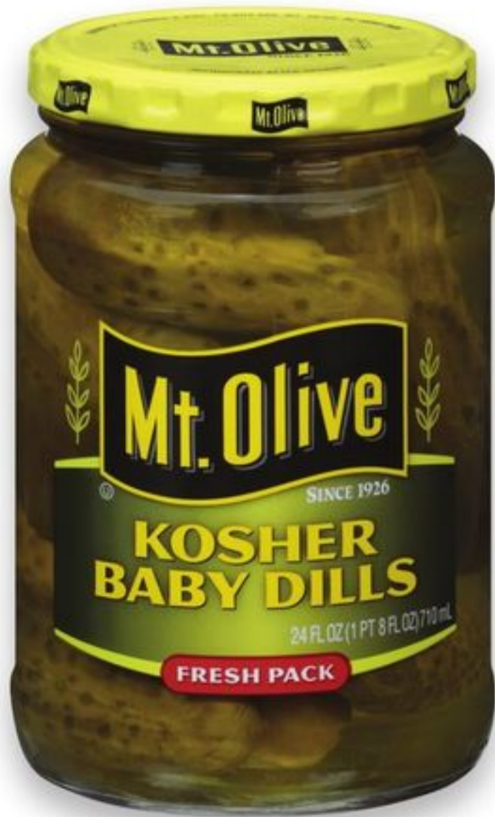
Mt. Olive Pickles 24-oz. Selected varieties.