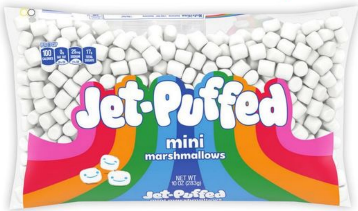
Kraft Jet-Puffed Mini Marshmallows 10-oz. Member Price: $3.00 ea.