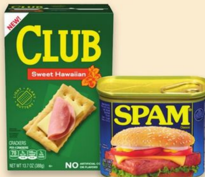
Kellogg's Club Crackers 11 to 13.7-oz. Spam Luncheon Meat 12-oz. Selected varieties.

SAVE $2* when you BUY Kellogg's Club Crackers and Spam Luncheon Meat