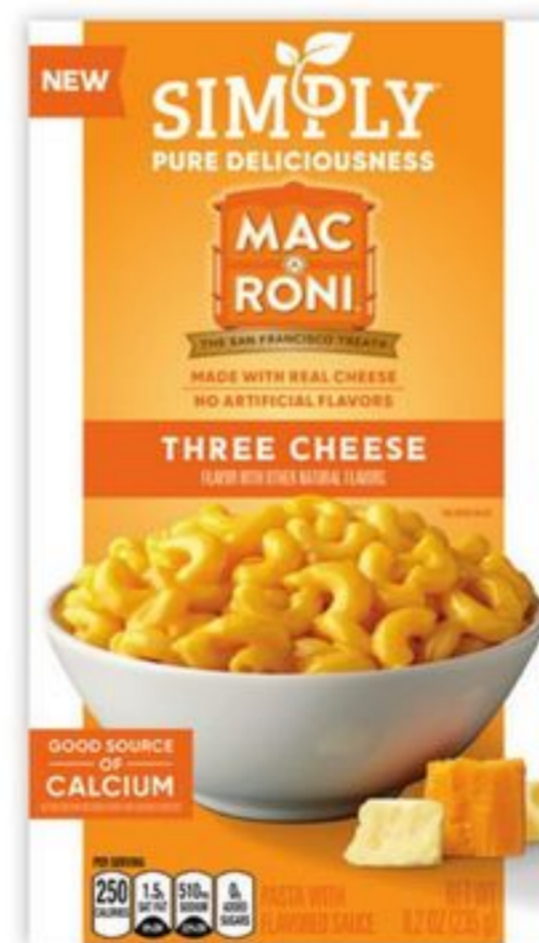
Simply Mac-a-Roni 8.2-oz. Selected varieties. Member Price: $2.00 ea.