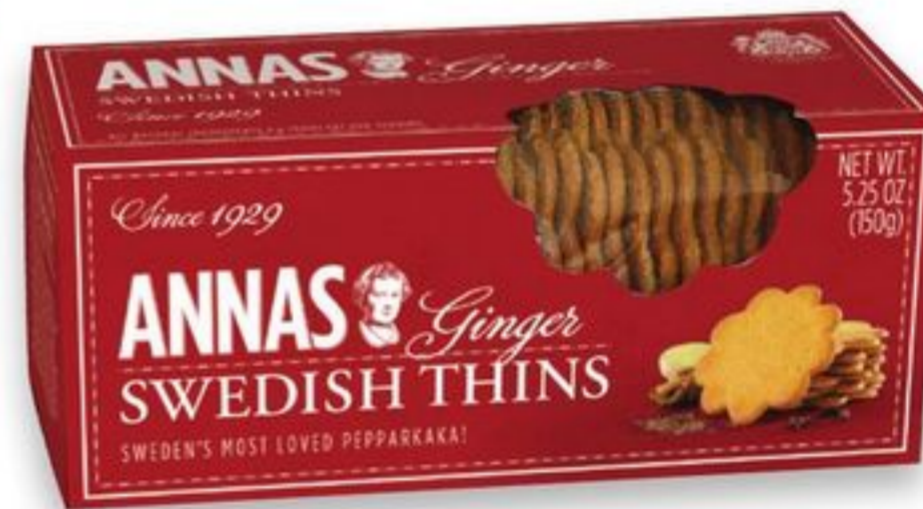
Annas Ginger Thins 5.25-oz. Member Price: $3.00 ea.