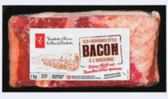
PC® OLD FASHION STYLE BACON SELECTED VARIETIES 1 KG 20115704_EA