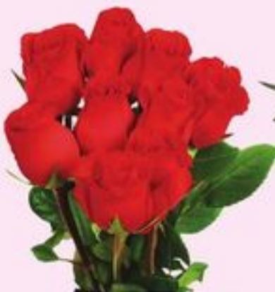
INTERMEDIATE ROSE BUNCH 9 STEM 21586298_EA