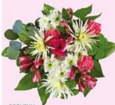
PREMIUM GIFTING BOUQUET SELECTED VARIETIES 21436381_EA/21436382_EA