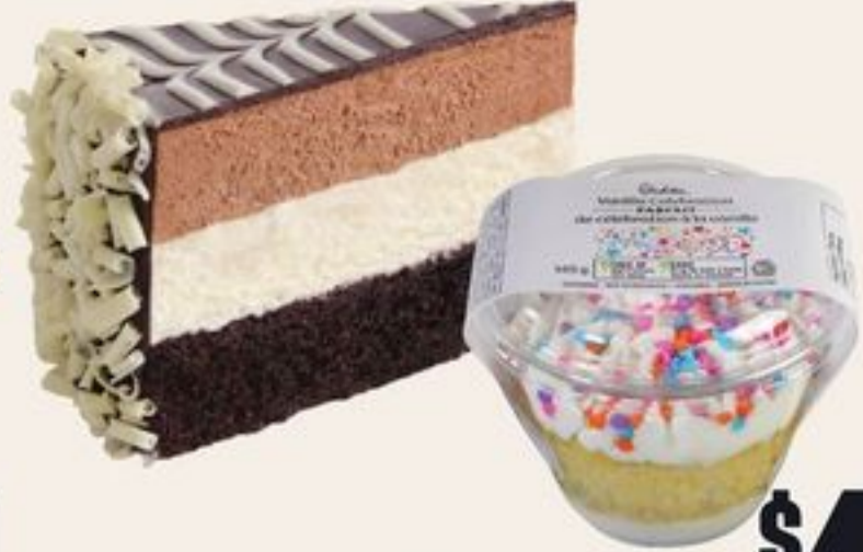
LA ROCCA CAKE SLICE 137-187 G OR CHARLOTTE'S PARFAIT 133-145 G SELECTED VARIETIES 21496254_EA/21496255_EA