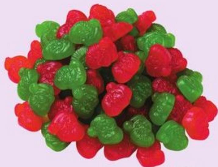
HOLIDAY JUBES 21626733_KG