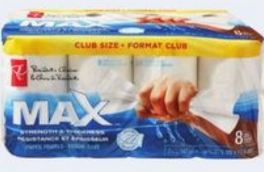
PC® MAX® PAPER TOWELS 8=24 ROLLS 21542607_EA