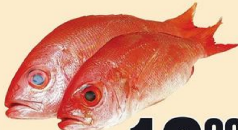
FRESH B-LINER SNAPPER WHOLE 37.46/KG FRESH SEAFOOD ITEMS SUBJECT TO AVAILABILITY 20123419_KG