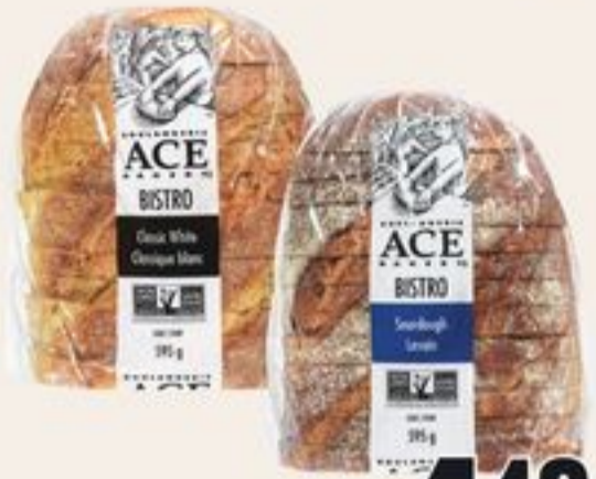
ACE BAKERY BISTRO LOAF WHITE OR SOURDOUGH 595 G 21616092_EA/21616156_EA