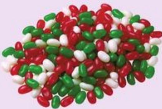
HOLIDAY JELLY BEANS 21626742_KG