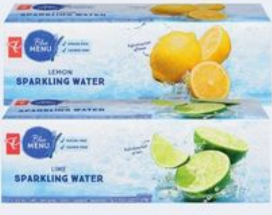
PC® OR BLUE MENU® SPARKLING WATER SELECTED VARIETIES 12X355 ML 20668034001_C01 20668034002_C01