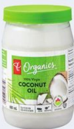
PC® ORGANICS COCONUT OIL 860 ML 20893349_EA