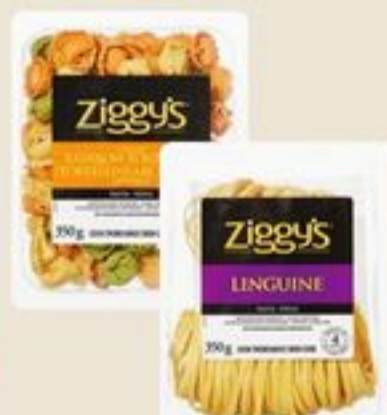
ZIGGY'S® PASTA SELECTED VARIETIES 350/360 G 21521168_EA/21521170_EA