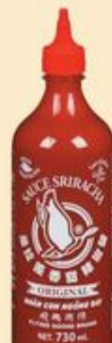
FLYING GOOSE BRAND SRIRACHA SAUCE 730 ML 21499017_EA