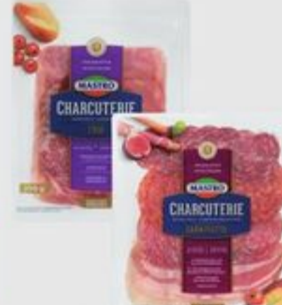
MASTRO TRIOS SELECTED VARIETIES 150/250 G 21064064_EA/21554465_EA