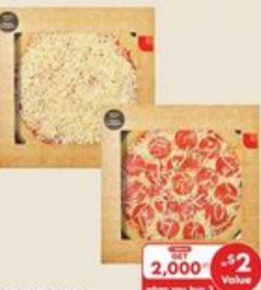
12" TAKE AND BAKE PIZZA SELECTED VARIETIES 510-739 G 21456393_EA 21456401_EA