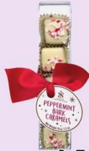
WHITE PEPPERMINT CARAMELS 70 G 21626645_EA