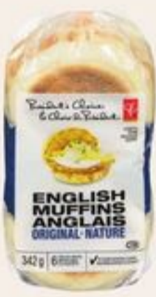
PC® OR BLUE MENU® ENGLISH MUFFINS SELECTED VARIETIES 6'S 20810728_EA/21015902_EA