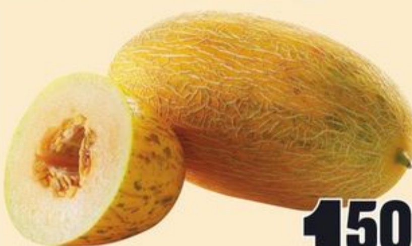
HAMI MELON PRODUCT OF U.S.A. 3.31/KG 21051297001_KG