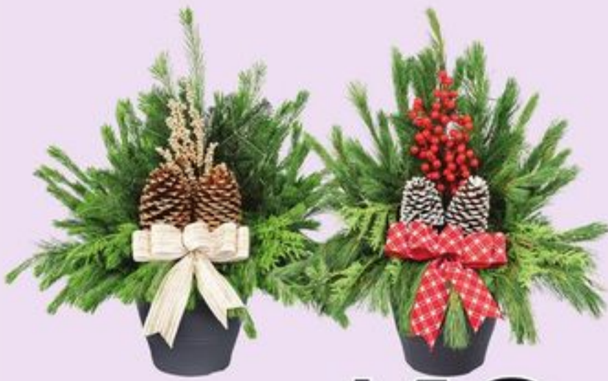
PC* LARGE OUTDOOR ARRANGEMENT WITH PINE AND BERRIES EACH 20144803_EA