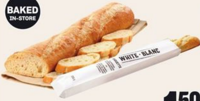
BAGUETTE WHITE OR WHOLE WHEAT 255 G 21529211_EA