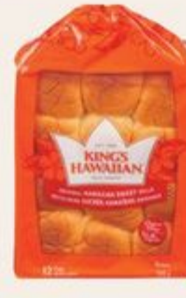
KING'S HAWAIIAN ROLLS SELECTED VARIETIES AND SIZES 21475970_EA/21489931_EA