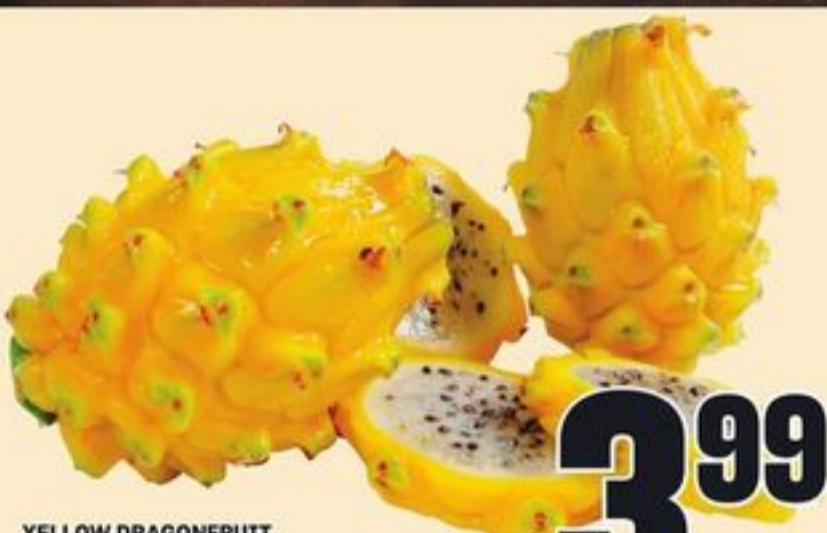
YELLOW DRAGONFRUIT PRODUCT OF COLOMBIA EACH 20626393001_EA