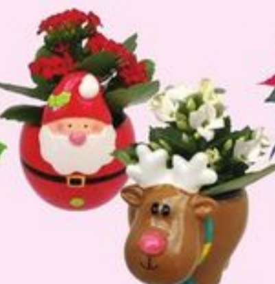
HOLIDAY MINIS 21194496_EA