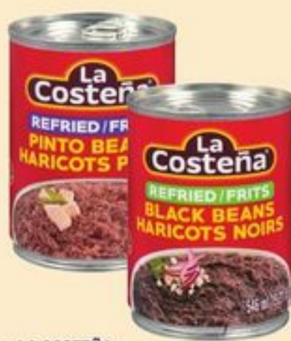
LA COSTEÑA REFRIED BEANS SELECTED VARIETIES 546 ML 20054076001_EA 20054076002_EA