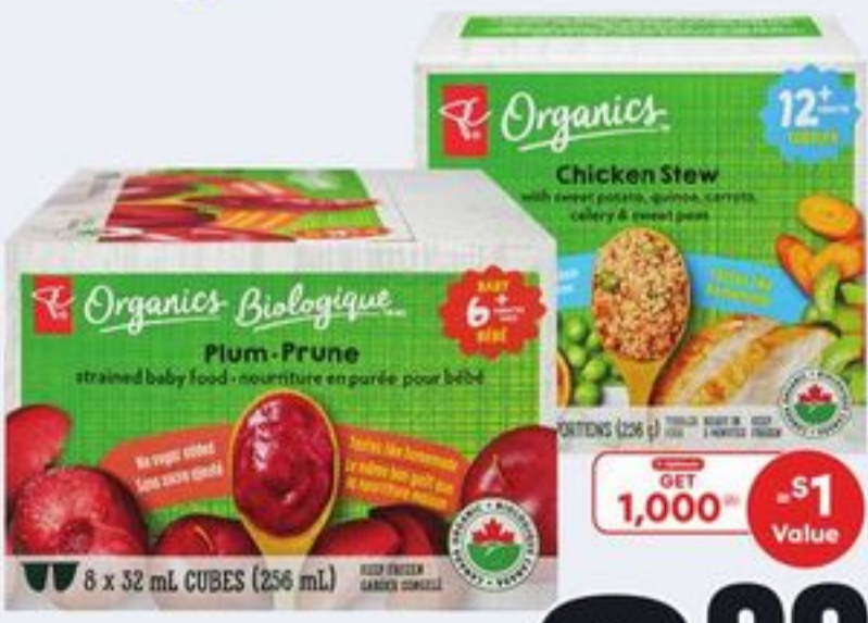
PC® ORGANICS FROZEN BABY FOOD SELECTED VARIETIES 8X32 ML/2X128 G 21563528_EA/21563751_EA