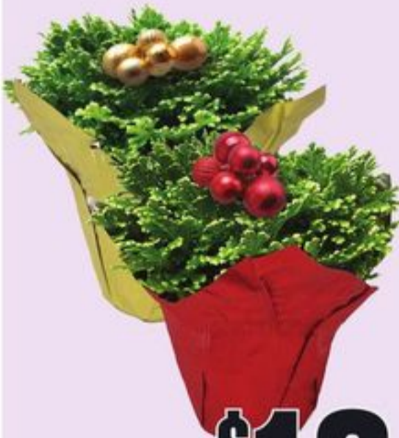
FROSTY FERN 6 INCH 21201502_EA