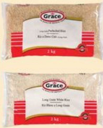
GRACE RICE 2 KG 21577947_EA 21578185_EA