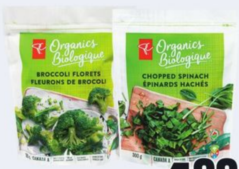
PC® ORGANICS VEGETABLES SELECTED VARIETIES 300-500 G 20416869002_EA/21008161_EA