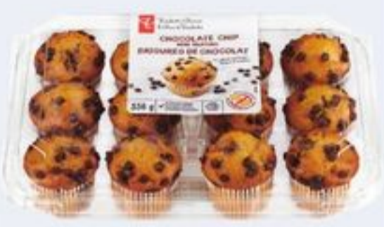
PC® MINI MUFFINS SELECTED VARIETIES 12'S 21488839_EA