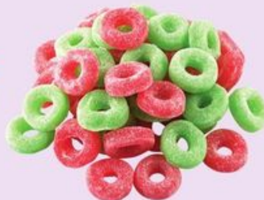
RED AND GREEN JELLY WREATHS OR HOLIDAY JELLY MIX 21626586_KG/21626537_KG