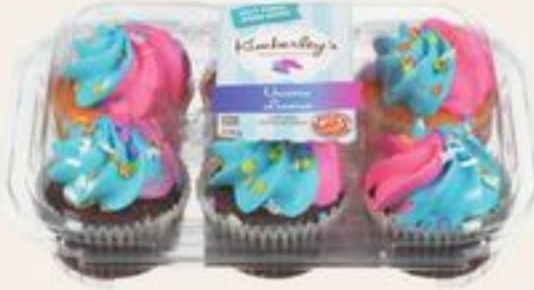
KIMBERLEY'S CUPCAKES SELECTED VARIETIES 6'S 21595212_EA