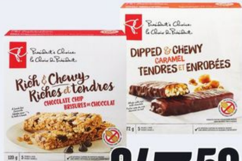
PC® GRANOLA BARS SELECTED VARIETIES 120-175 G 20912735_EA/21540695_EA