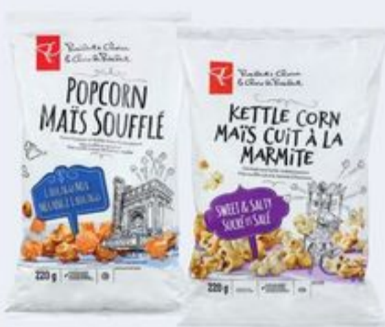
PC® READY TO EAT POPCORN SELECTED VARIETIES 220-250 G 20555781_EA/20910769_EA