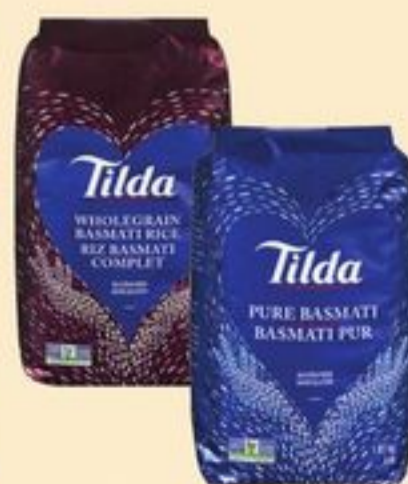
TILDA RICE SELECTED VARIETIES 4 LB 20013920_EA 20436365_EA