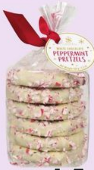
PEPPERMINT PRETZELS 150 G 21626664_EA