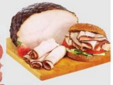
PC® NATURAL CHOICE™ TURKEY SERVICE CASE MEATS SELECTED VARIETIES 20059548_KG