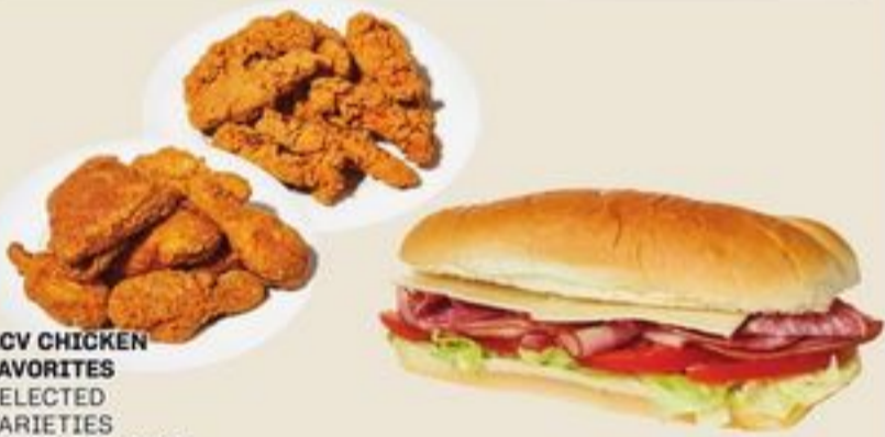
GCV CHICKEN FAVORITES SELECTED VARIETIES (TENDERS, FRIED CHICKEN OR BONELESS BITES), SERVED HOT OR CHILLED 320-700 G 20137058_EA/20992187_EA