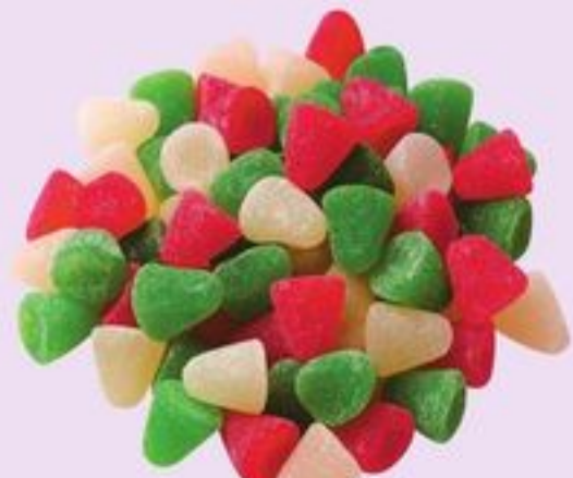
HOLIDAY JUMBO GUMS 21626520_KG