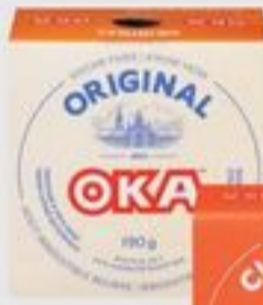
OKA SELECTED VARIETIES 190 G 20920756_EA/20921279_EA