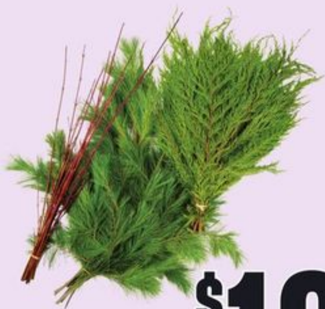
PC* BOUGHS OR BRANCHES SELECTED VARIETIES 20213216_EA/20214311_EA