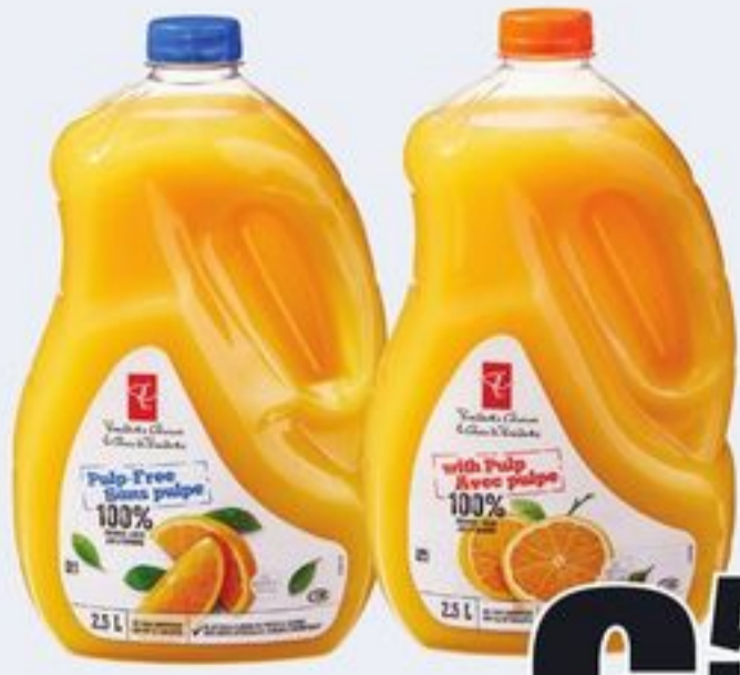
PC® ORANGE JUICE SELECTED VARIETIES 2.5 L 21531644_EA/21531646_EA