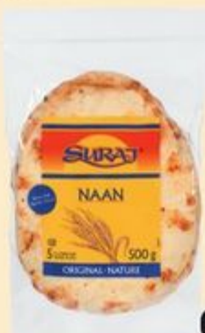
SURAJ NAAN SELECTED VARIETIES 5'S 21051353_EA