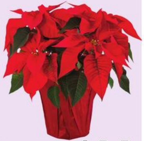
6 INCH POINSETTIA 20036549_EA