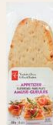
PC® FLATBREAD 220/300 G OR SURAJ® NAAN 5'S SELECTED VARIETIES 20910044_EA/21051353_EA