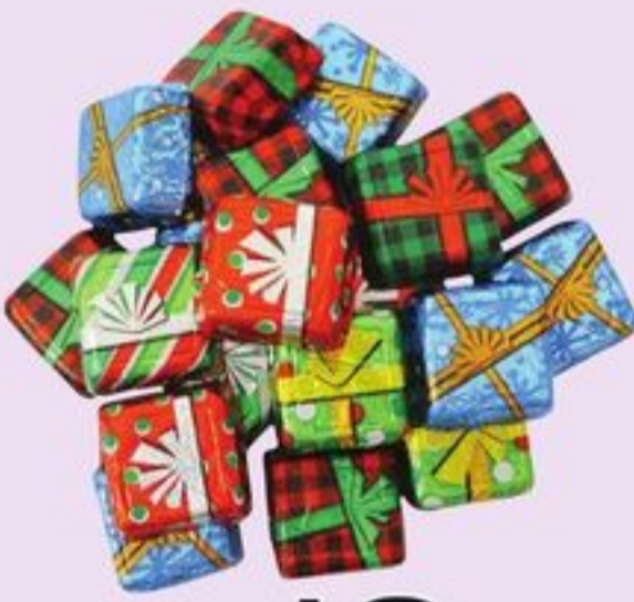
CHOCOLATE PRESENTS 21626536_KG