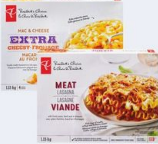
PC® OR BLUE MENU® MEAT OR VEGETABLE LASAGNA OR MAC & CHEESE ENTRÉES SELECTED VARIETIES, FROZEN 1.13 KG 20314880_EA/20326534_EA