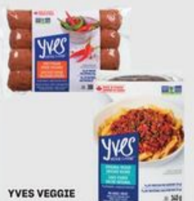
YVES VEGGIE GROUND MEAT OR SAUSAGES SELECTED VARIETIES 156-380 G 20507159_EA 20596775_EA