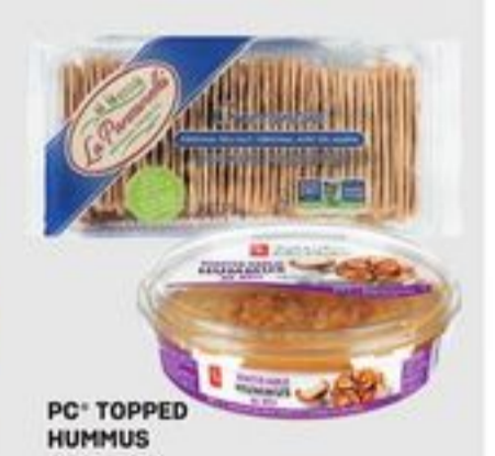
PC® TOPPED HUMMUS 280 G OR LA PANZELLA 170 G SELECTED VARIETIES 20811384_EA 21348433_EA