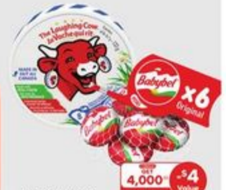
BABY BEL G'S, LAUGHING COW 12'S OR CHEESE DIPPERS SELECTED VARIETIES 20319107_EA/20574332_EA