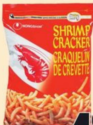
NONGSHIM SHRIMP CRACKERS SELECTED VARIETIES 200/400 G 20418200_EA