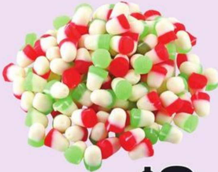
HOLIDAY JU JUBE MIX CHERRY AND LIME FLAVOUR 21626754_KG