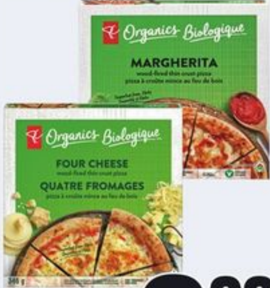
PC® ORGANICS PIZZA SELECTED VARIETIES 340-400 G 21092257_EA/21092293_EA