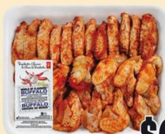
PC WORLD OF FLAVOURS™ SPLIT BUFFALO CHICKEN WINGS AIR CHILLED 13.23/KG 21454262_KG