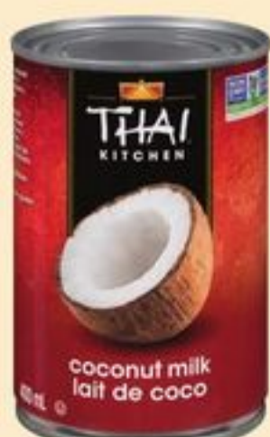
THAI KITCHEN COCONUT MILK SELECTED VARIETIES 400 ML 20661711_EA