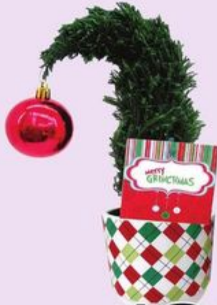
GRINCHMAS TREE 20930473_EA