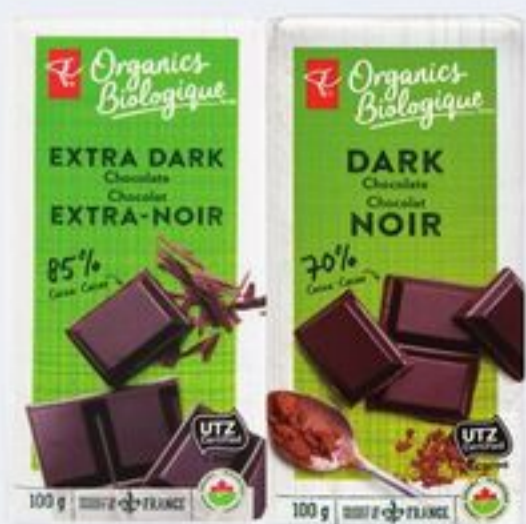
PC® ORGANICS CHOCOLATE SELECTED VARIETIES 100 G 21215946_EA 21215962_EA