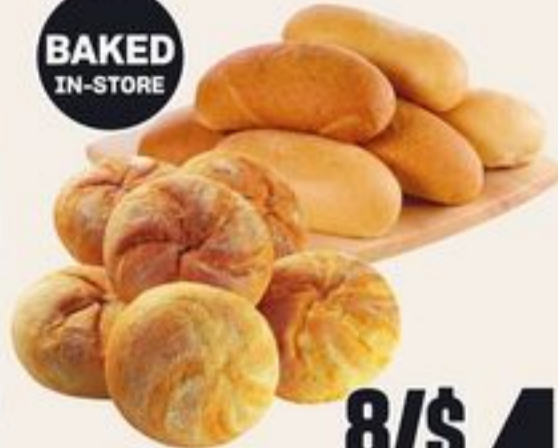
BULK ROLLS SELECTED VARIETIES 20076950_EA