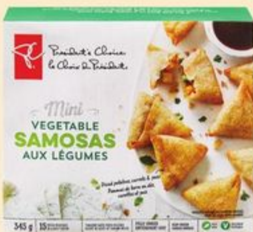
PC MINI VEGETABLE SAMOSAS FROZEN 345 G 20810330_EA