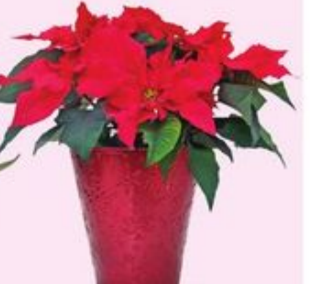
POINSETTIA IN UPGRADED TIN 8 INCH 20287881_EA