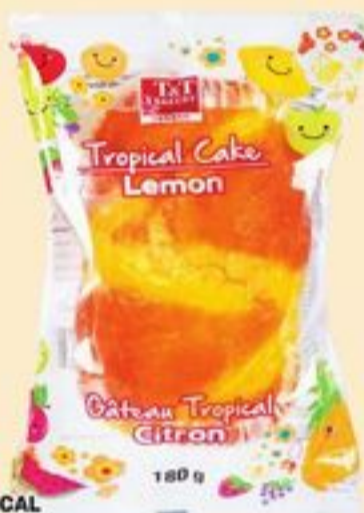
T&T BAKERY TROPICAL SNACK CAKES SELECTED VARIETIES 180 G 20826539_EA