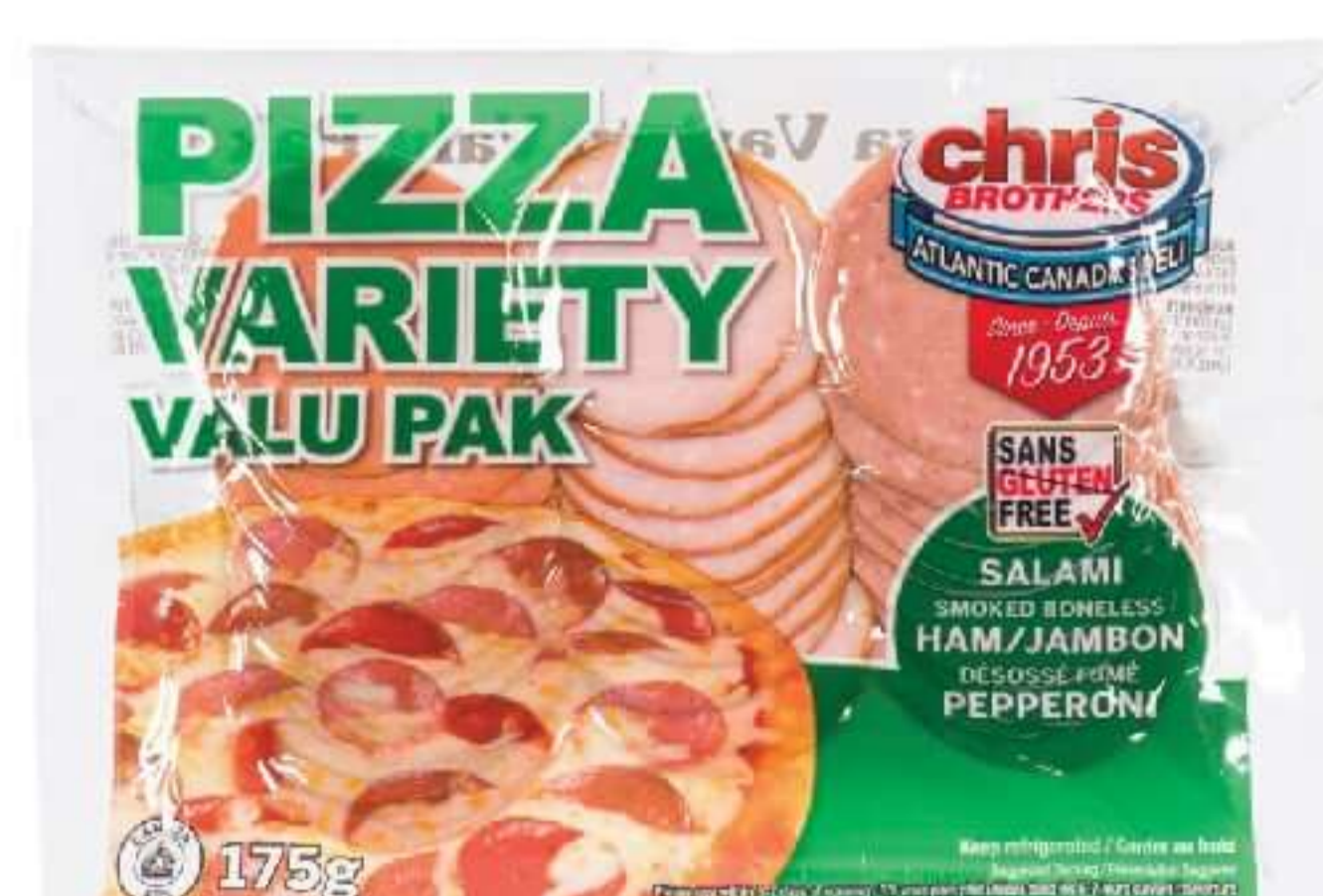
CHRIS BROTHERS PIZZA VARIETY VALU PAK 175g