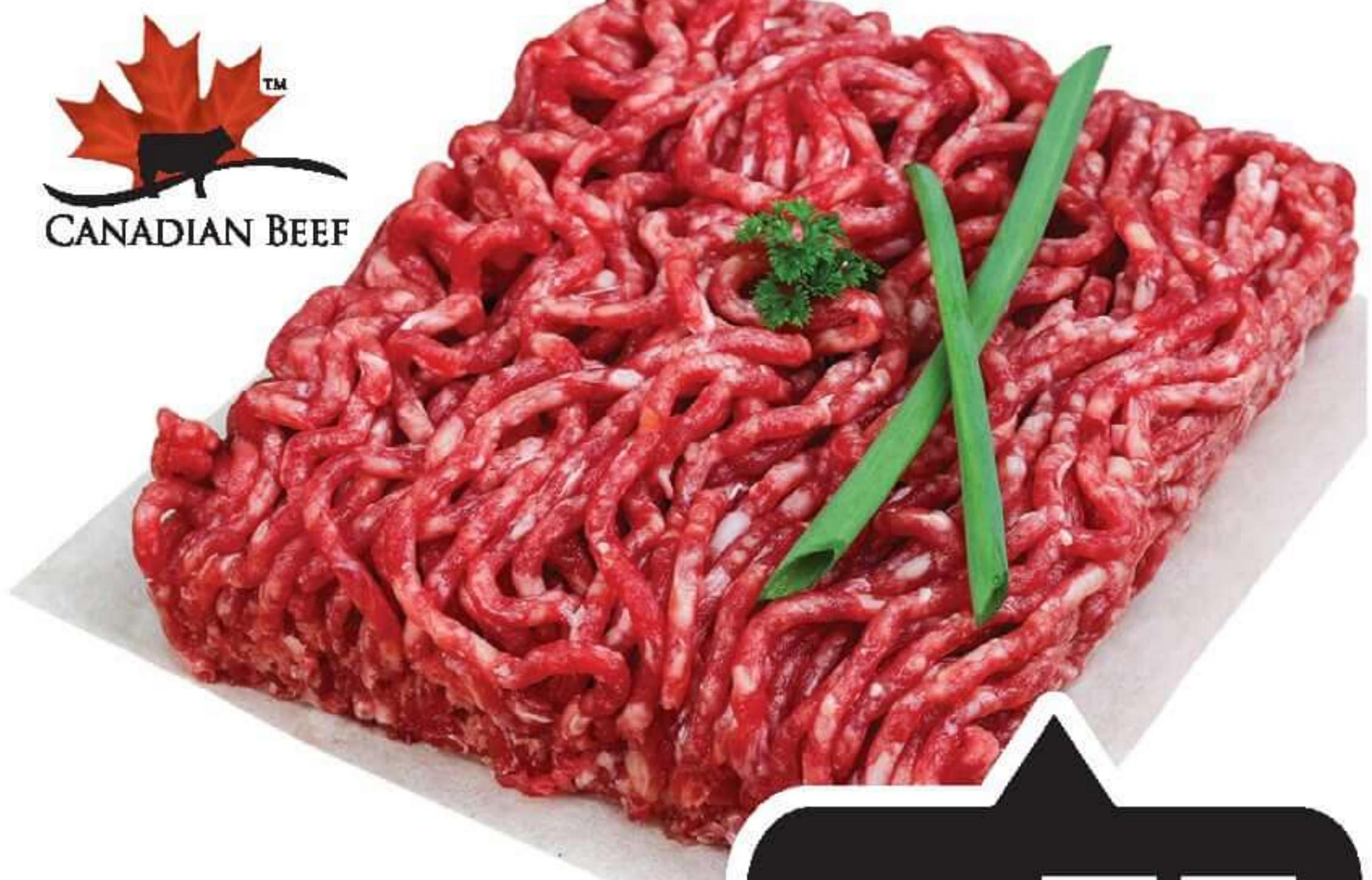
FRESH LEAN GROUND BEEF Family Pack 12.72 kg