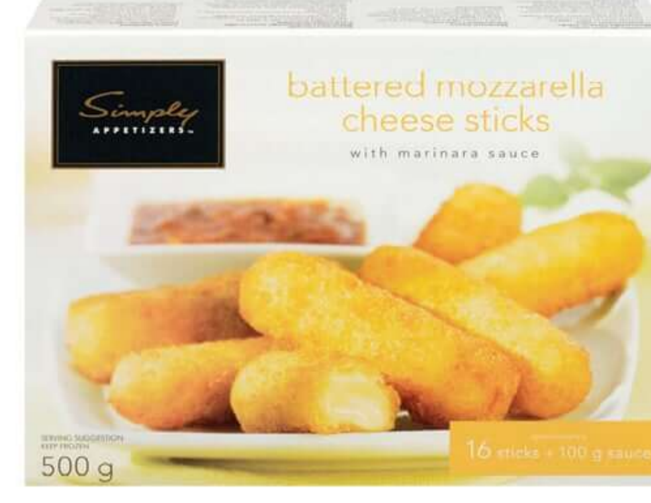
SIMPLY MOZZARELLA CHEESE STICKS 500g