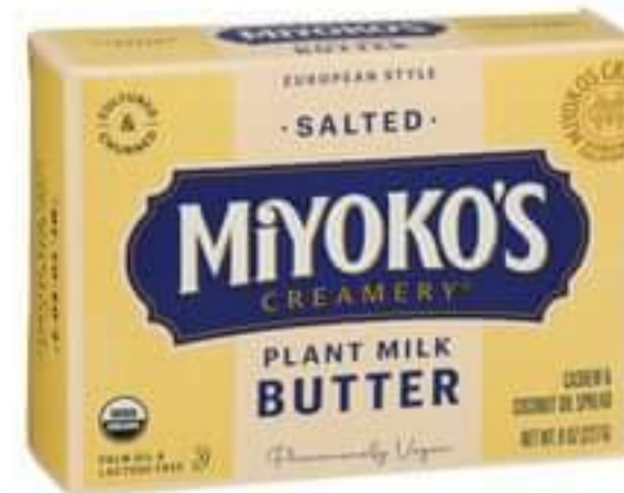
Miyoko's Organic Cultured Vegan Butter selected varieties