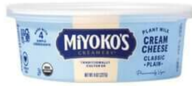
Miyoko's Organic Vegan Cream Cheese selected varieties

For food enthusiasts eager to explore dairy-free options, Miyoko's offers an organic plant milk creamery, producing exceptional vegan cheese and butter. We inspire you to make food choices that not only taste amazing but also contribute to a better world.