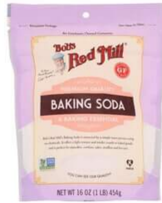
Bob's Red Mill Baking Soda

Homemade for the holidays. Celebrate better with Bob's Red Mill baking ingredients.