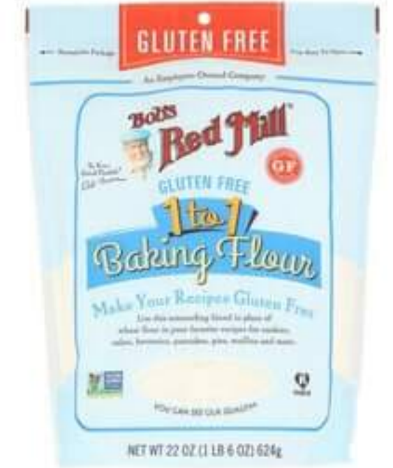
Bob's Red Mill 1 to 1 Baking Flour