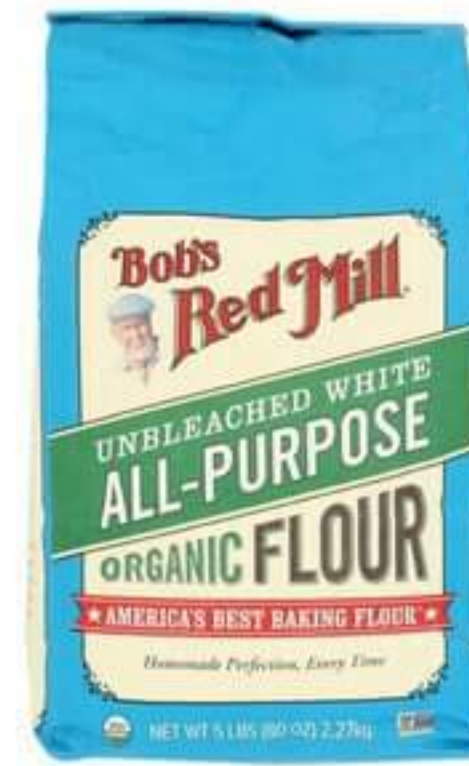
Bob's Red Mill Organic Flour selected varieties