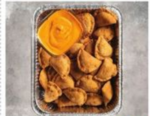
25 COUNT Mini Meat Pies Tray $25 99