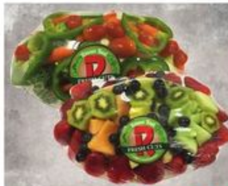
FRESH MADE IN OUR PRODUCE DEPARTMENT Vegetable or Fruit Luau Bowl $6 49 LB