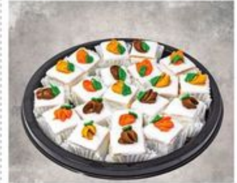
LARGE 20 CT White Almond Petit Fours $24 99