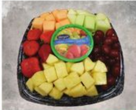
FRESH MADE IN OUR PRODUCE DEPT 12 INCH Fruit Tray With Dip $23 99