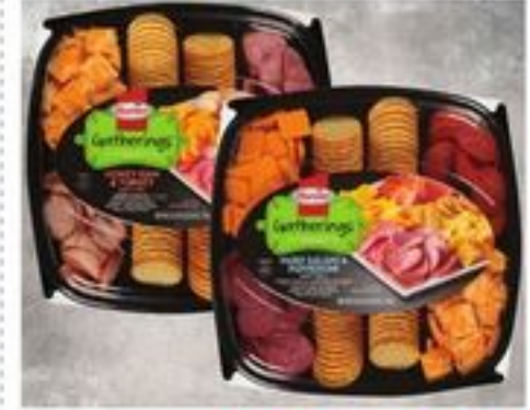
28 OZ Hormel Gatherings Party Tray $14 99