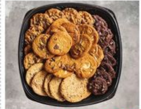
24 COUNT Gourmet Cookie Tray $32 99