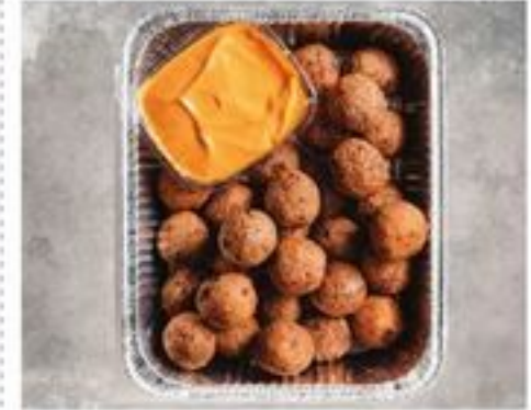
40 COUNT Boudin Balls $39 99