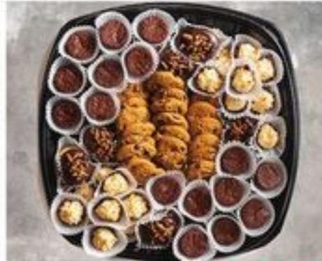
66 COUNT Cookie & Brownie Tray $29 99