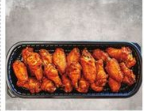
20 COUNT Chicken Wings $17 99