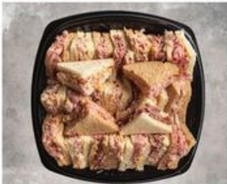
24 COUNT Finger Sandwich Tray $18 99