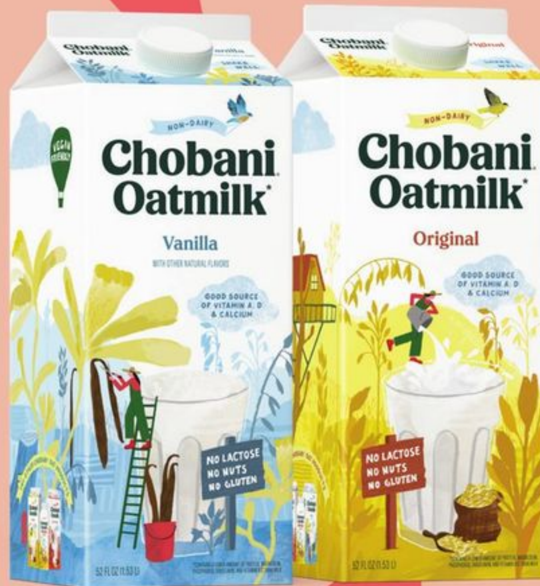
Chobani Oatmilk 52-oz. Selected varieties.

EXCLUSIVE DIGITAL COUPON 3 99 ea Member Price