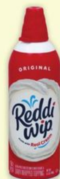
Reddi-Wip Aerosol Whipped Topping 6.5-oz. Selected varieties. Member Price: $3.50 ea.