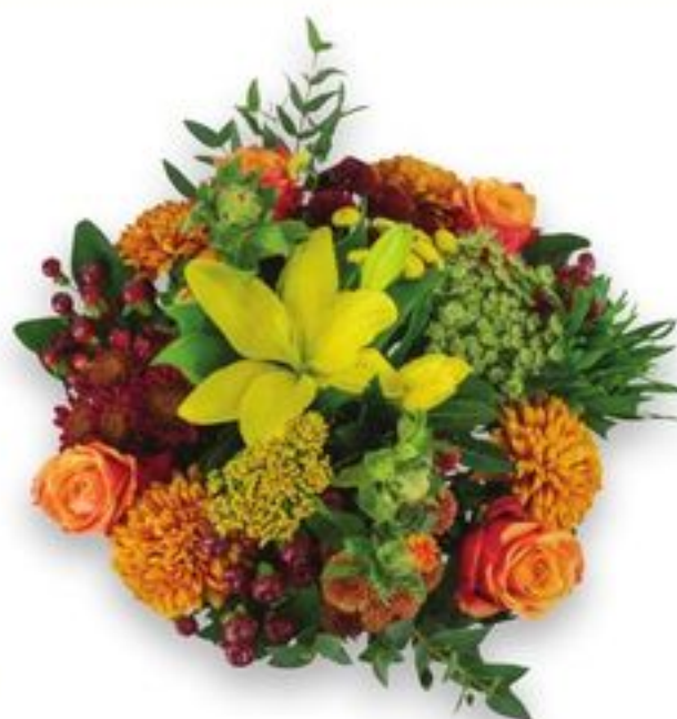
debi lilly design™ Fall Premium Bouquet