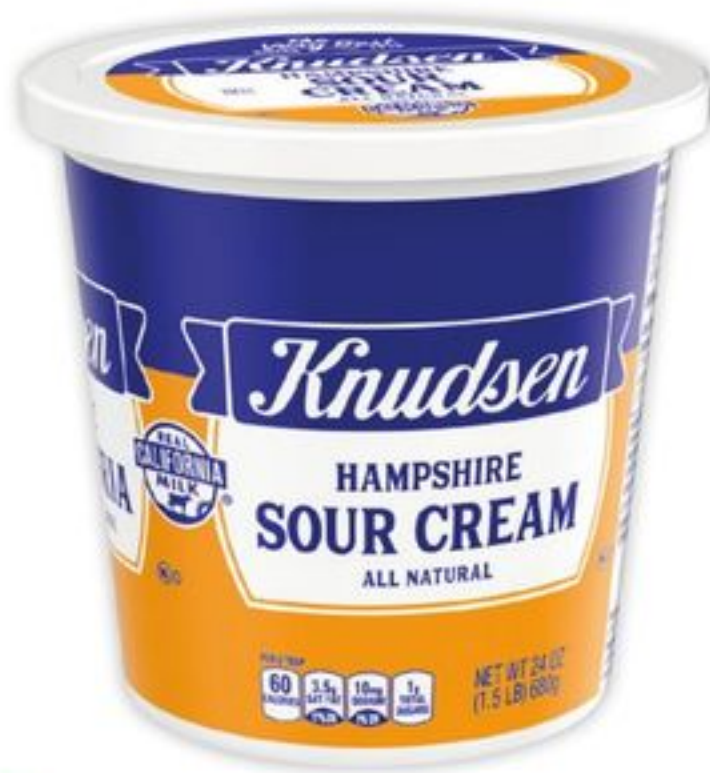
Knudsen Sour Cream 24-oz.