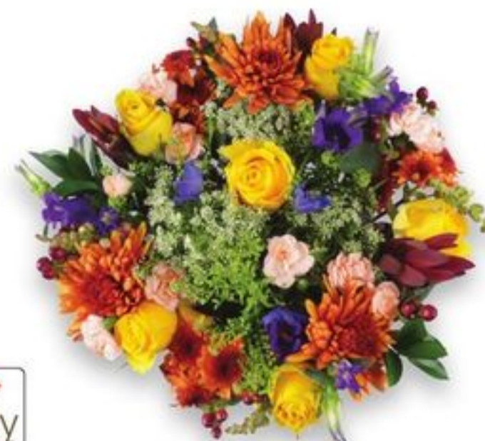
debi lilly design™ Fall Lux Bouquet