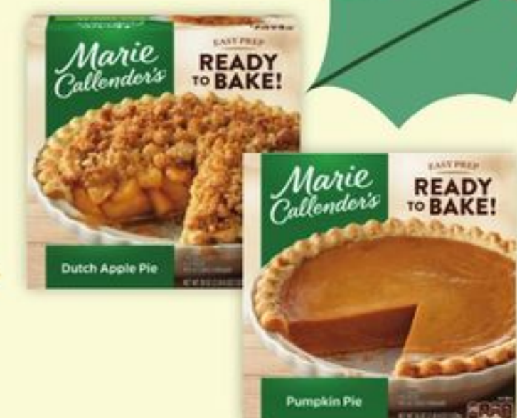
Marie Callender's Fruit or Cream Pie 25.6 to 40-oz. Selected varieties.