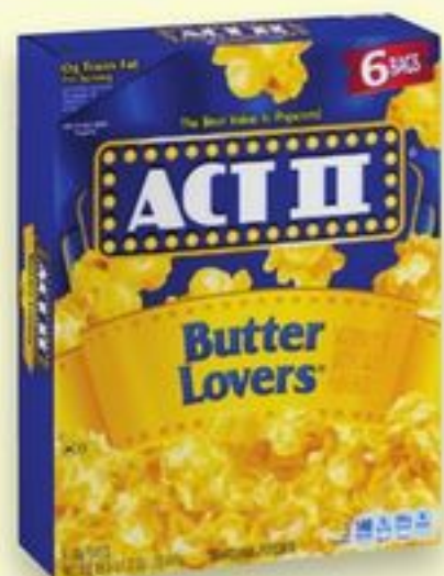
ACT II Butter Popcorn 6-ct. Selected varieties.

Safeway for U® coupon must be downloaded to your account prior to purchase. Must use Safeway for U® account. Expires 12/3/24.