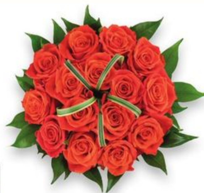
debi lilly design™ Rose Chic Bouquet