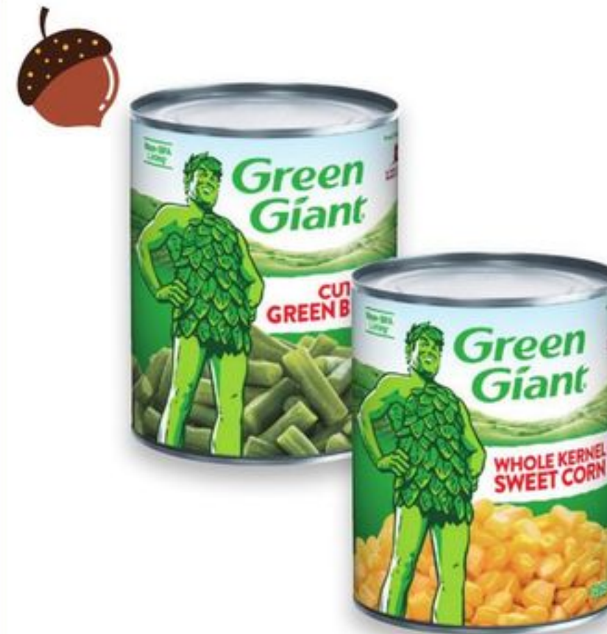
Green Giant Canned Vegetables 14.5 to 15.25-oz. Selected varieties. Member Price: $1.00 ea.