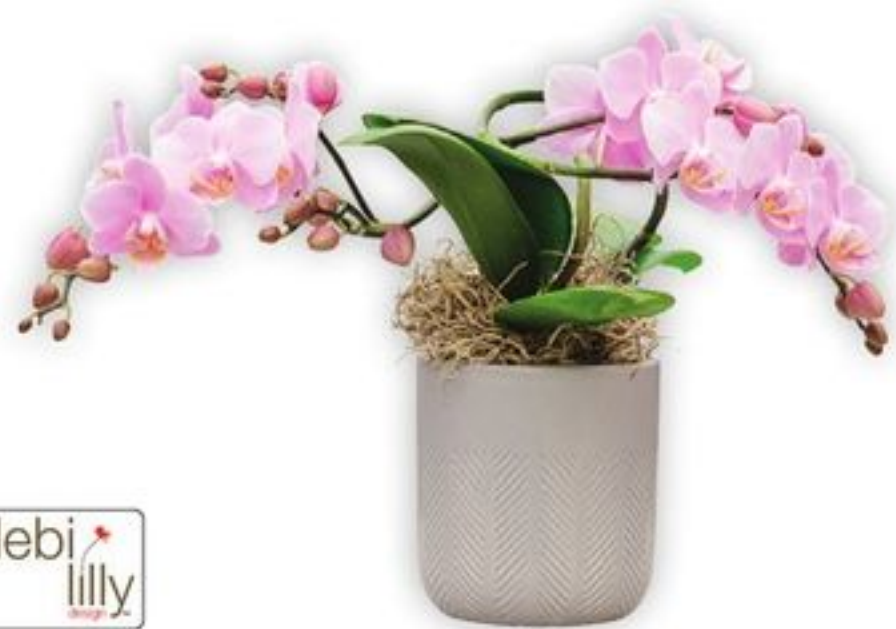
debi lilly design™ Bramble Orchid 3-in.