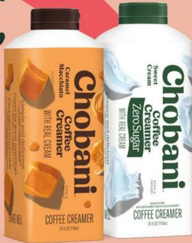
Chobani Creamer 24-oz. Selected varieties.

EXCLUSIVE DIGITAL COUPON 3 99 ea Member Price