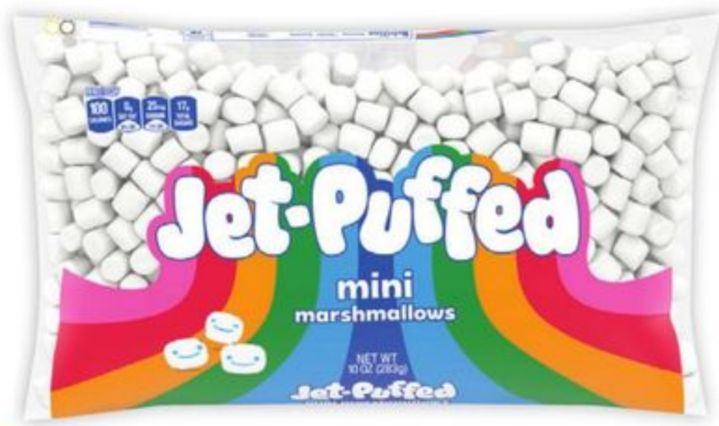
Kraft Jet-Puffed Mini Marshmallows 10-oz. Member Price: $2.00 ea.