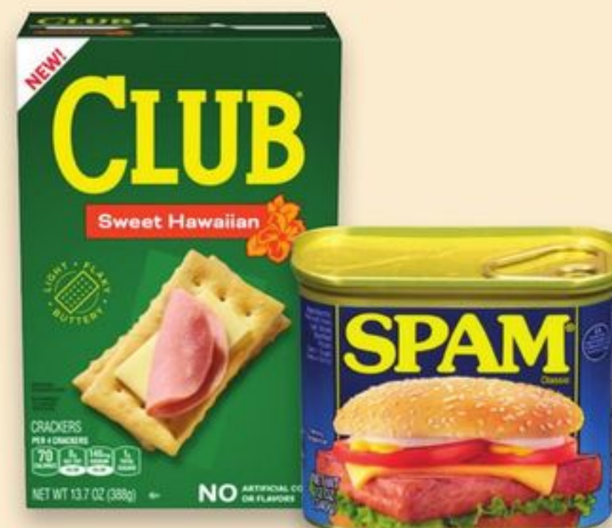
Kellogg's Club Crackers 11 to 13.7-oz. Spam Luncheon Meat 12-oz. Selected varieties.

SAVE $2* when you BUY Kellogg's Club Crackers and Spam Luncheon Meat