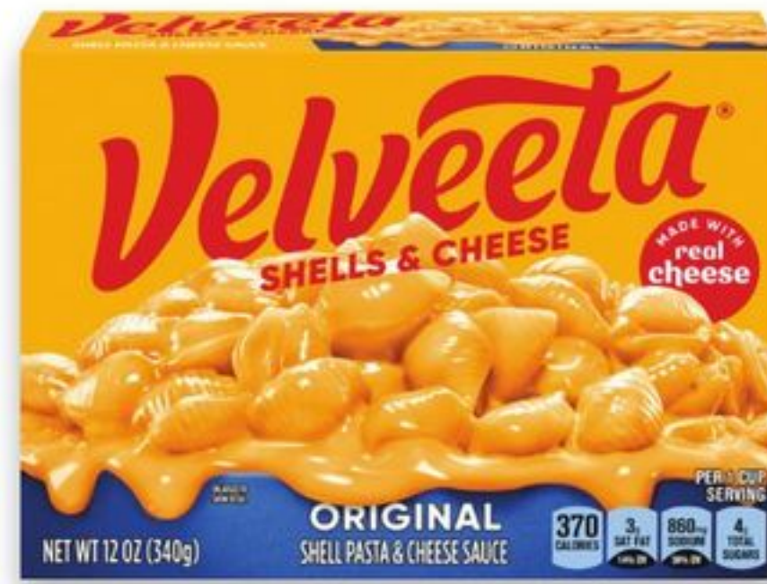
Kraft Liquid Macaroni & Cheese 10.9 to 14-oz. Selected varieties.