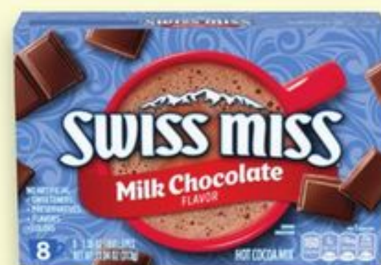
Swiss Miss Hot Cocoa Mix 8-ct. Selected varieties. Member Price: $2.50 ea.