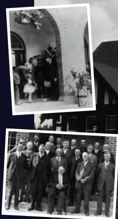
55. Court House, Salmon Arm