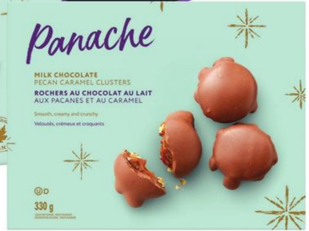
PANACHE Milk Chocolate Pecan Caramel Clusters 330 g