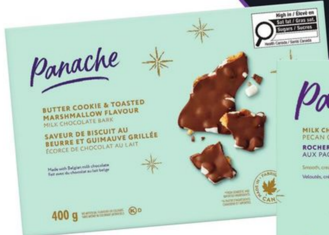
PANACHE Butter Cookie & Toasted Marshmallow Flavour Milk Chocolate Bark 400 g