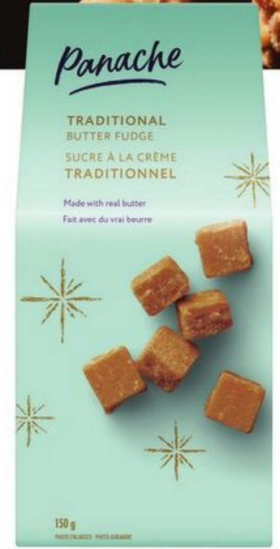
PANACHE Traditional Butter Fudge 12x150 g