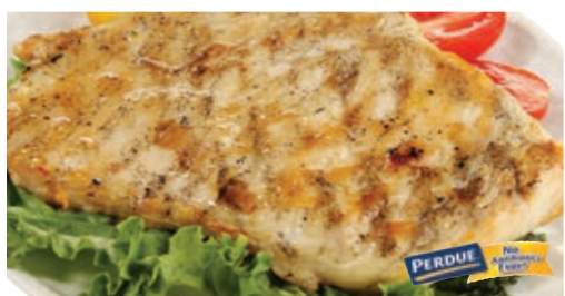
Perdue Marinated Boneless & Skinless Chicken Breasts Rosemary & Balsamic, Chipotle Lingonberry or Honey Sracha