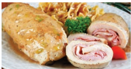
Stuffed & Seasoned Boneless Chicken Breast Cordon Bleu Fully Prepared & Ready to Cook