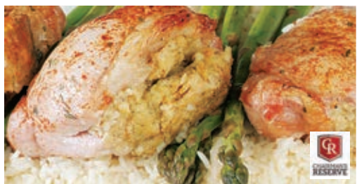
Premium Chairman's Reserve Boneless Center Cut Pork Chops Ready to Bake • Stuffed & Seasoned