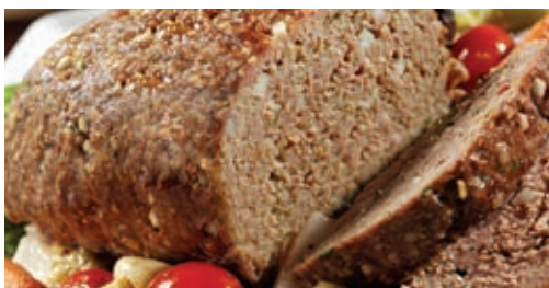
Robert's Own Store Made Panned Meatloafs 2.5 Lb. Avg. • Freshly Prepared & Ready to Cook