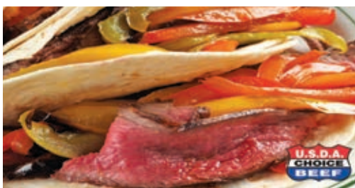
U.S.D.A. Choice Beef Marinated Beef Fajita Strips With Vegetables Lean & Tender