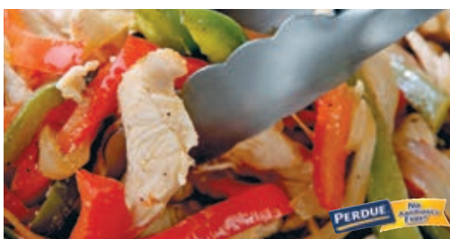
Perdue Marinated Chicken Fajita Strips With Vegetables Freshly Prepared