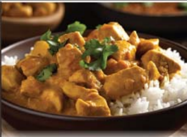
Fresh, Never Frozen Boneless Skinless Chicken Leg Meat