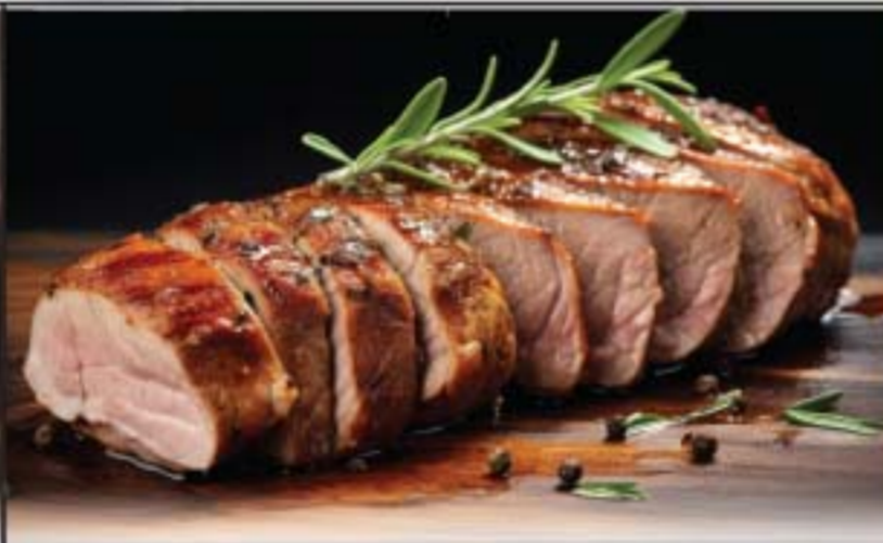
Fresh Boneless Pork Loin Roast