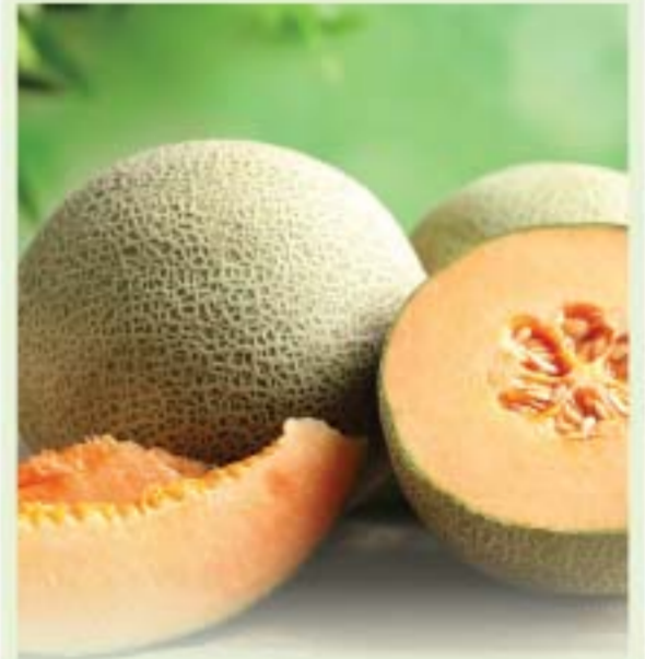
Large Cantaloupe 49¢ lb.

Wednesday & Thursday November 13th - 14th