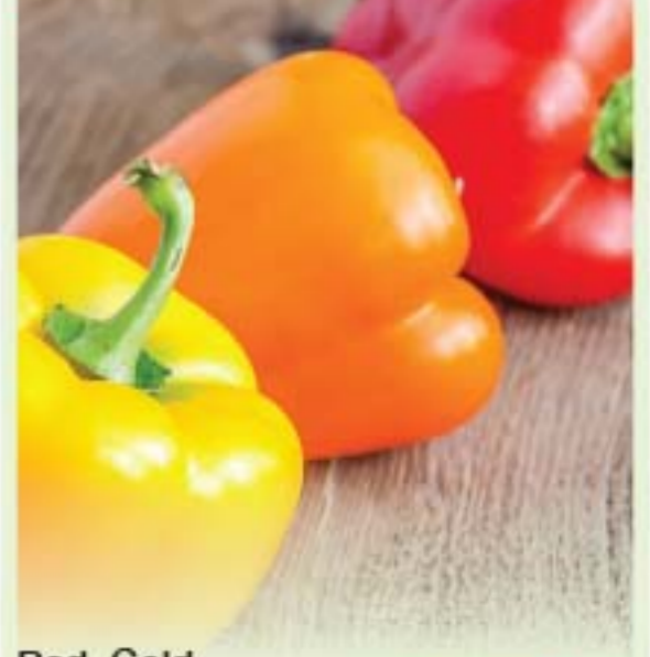
Red, Gold, Green or Orange Bell Peppers 77¢ ea.