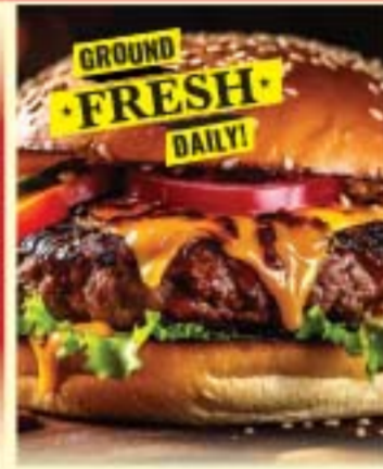
90% Extra Lean Ground Beef