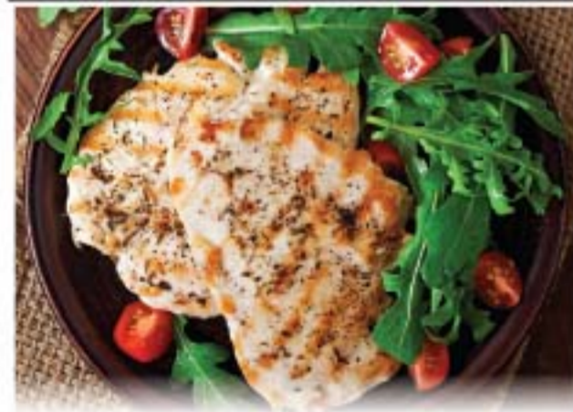
Fresh, Never Frozen Boneless Skinless Chicken Breast