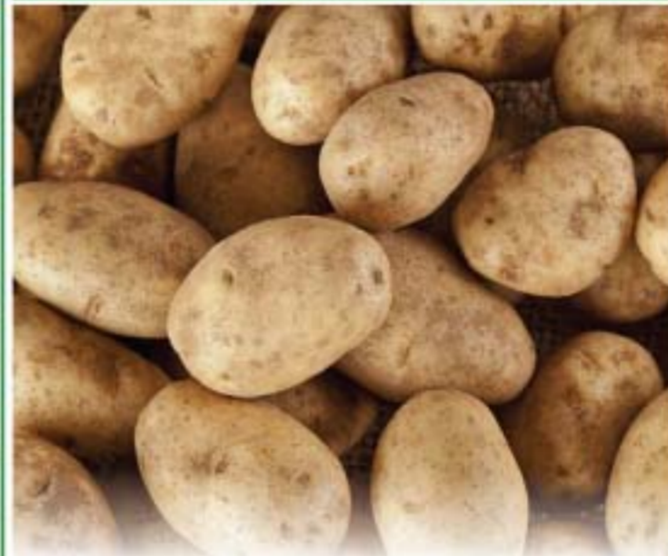
Potatoes 10 lb. bag 3 99 ea.