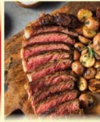
Fresh New York Strip Steaks