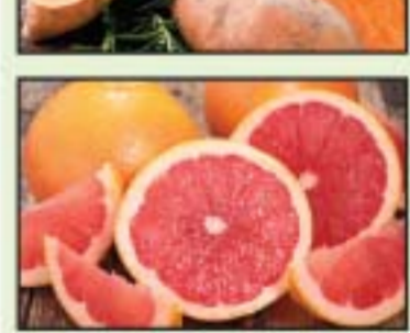
Pink Grapefruit 1 25 ea.