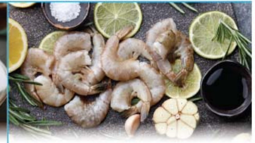
16-20 count Jumbo Raw Shrimp