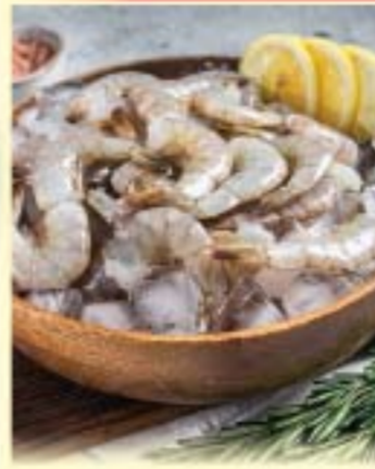
16-20 count Large Raw Shrimp