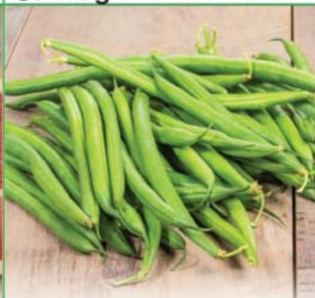
Green Beans 1 99 lb.