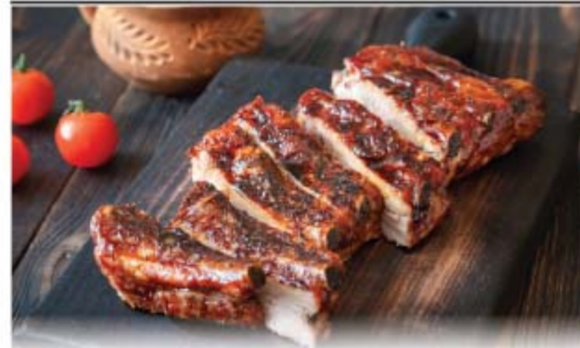
Fresh Meaty Pork Shoulder Country Style Ribs