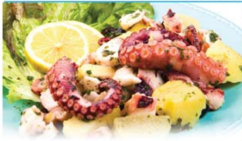
Cooked Cut Pieces Octopus