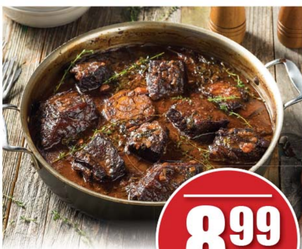
Meaty Beef Flanken Style Ribs or Short Ribs