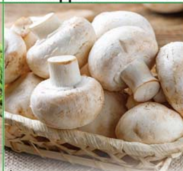
Large Monterey Whole Mushrooms 2 99 lb.