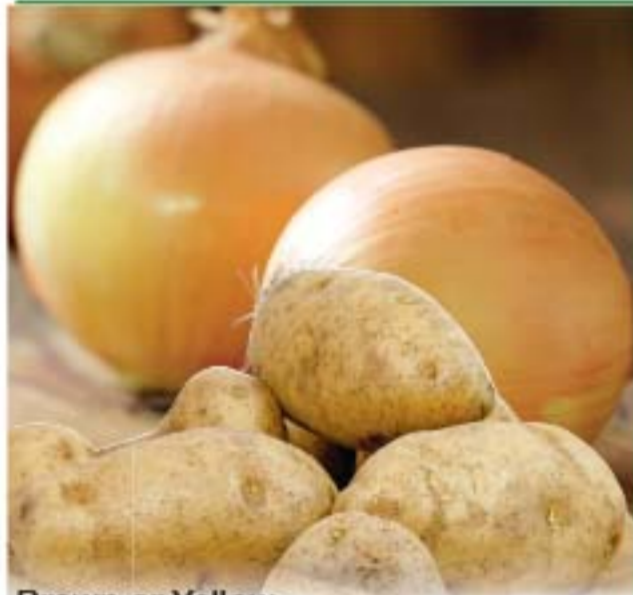
Brown or Yellow Onions or Premium Russet Potatoes 59¢ lb.