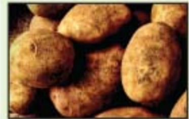
Premium Russet Potatoes 49¢ lb.