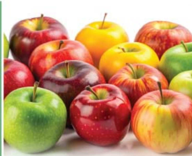
Large Gala, Fuji, Granny Smith or Premium Red Delicious Apples 99¢ lb.