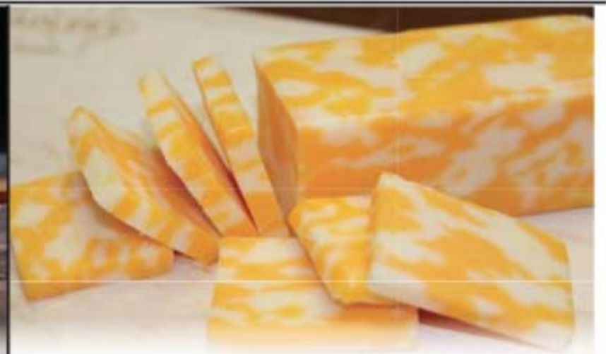
Value Pack, All Natural Monterey Jack or Colby Long Horn Cheese