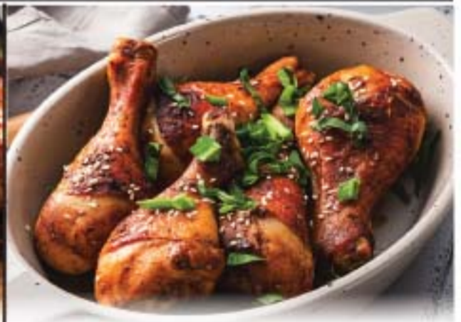
Fresh Never Frozen Chicken Drumsticks