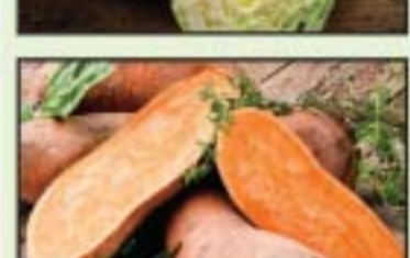
Sweet Yams 99¢ lb.