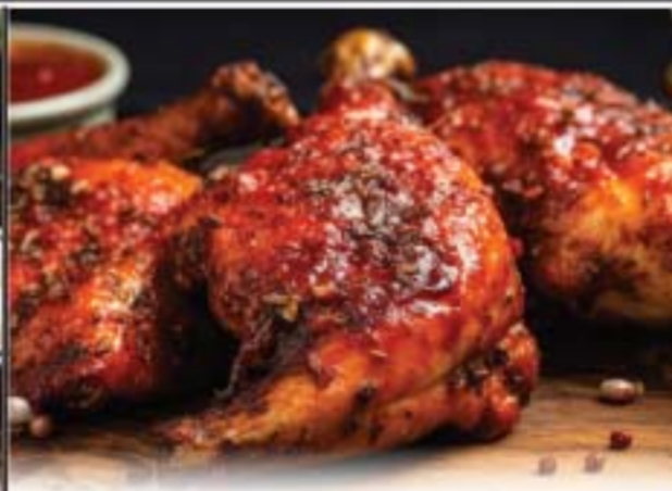
Fresh Never Frozen Chicken Leg Quarters