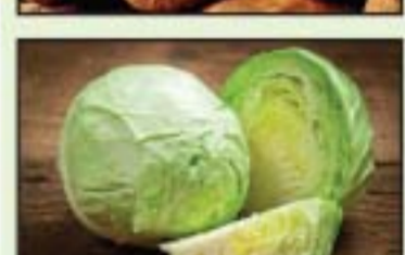
Green Cabbage 59¢ lb.