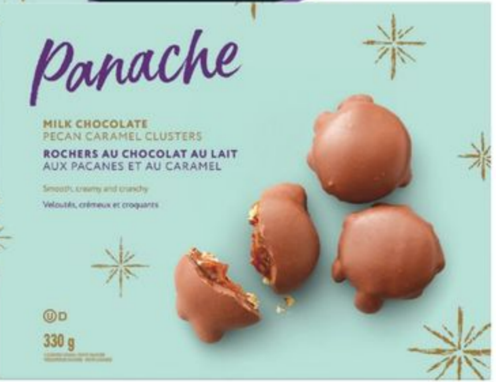
PANACHE Milk Chocolate Pecan Caramel Clusters 330 g