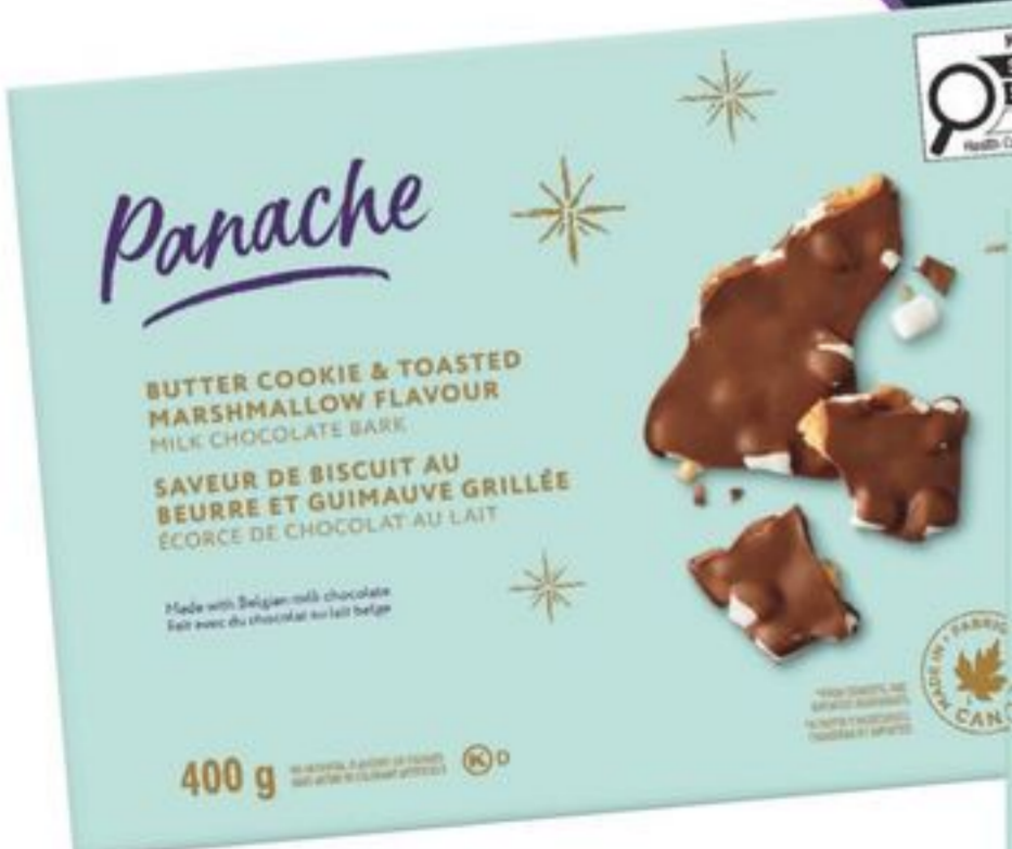
PANACHE Butter Cookie & Toasted Marshmallow Flavour Milk Chocolate Bark 400 g