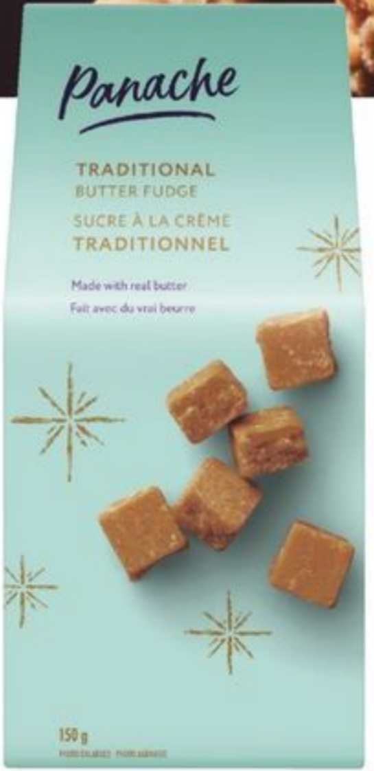
PANACHE Traditional Butter Fudge 12x150 g