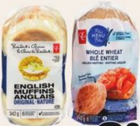
PC® OR BLUE MENU® ENGLISH MUFFINS SELECTED VARIETIES 6'S 20810728_EA/21015902_EA