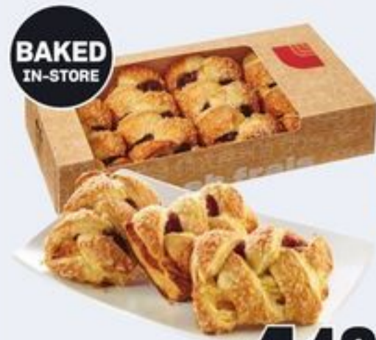
BAKED IN-STORE MINI BRAIDED STRUDELS OR MAPLE PECAN DANISH SELECTED VARIETIES 4'S 21464137_EA/21464199_EA