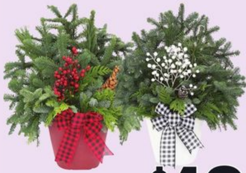
OUTDOOR HOLIDAY ARRANGEMENT SELECTED VARIETIES 21349738_EA