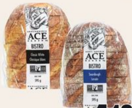
ACE BAKERY BISTRO LOAF WHITE OR SOURDOUGH 595 G 21616092_EA/21616156_EA