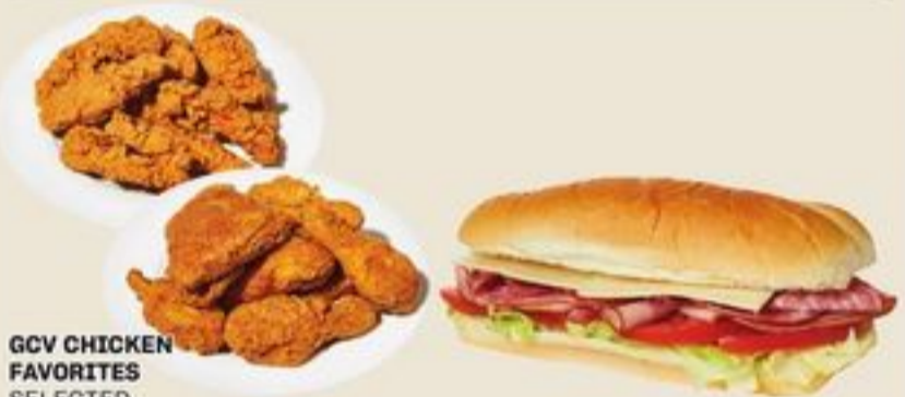
GCV CHICKEN FAVORITES SELECTED VARIETIES (TENDERS, FRIED CHICKEN OR BONELESS BITES), SERVED HOT OR CHILLED 320-700 G 20137058_EA/20992187_EA