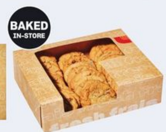
BAKED IN-STORE MINI COOKIES SELECTED VARIETIES 24'S 21596672_EA