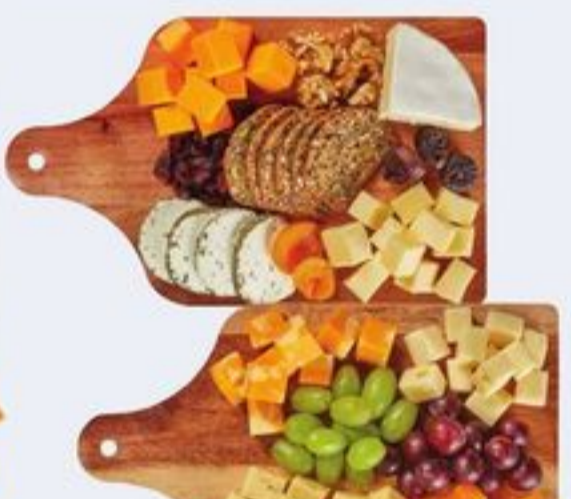
CHARCUTERIE BOARD SELECTED VARIETIES 211-433 G 21405538_EA 21405571_EA