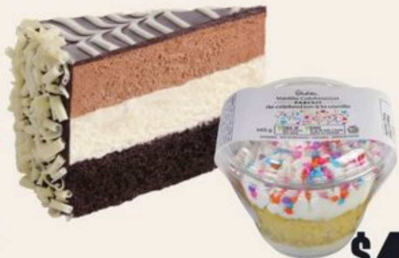
LA ROCCA CAKE SLICE 137-187 G OR CHARLOTTE'S PARFAIT 133-145 G SELECTED VARIETIES 21496254_EA/21496255_EA