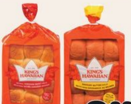
KING'S HAWAIIAN ROLLS SELECTED VARIETIES AND SIZES 21475970_EA/21489831_EA