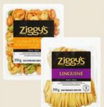
ZIGGY'S® PASTA SELECTED VARIETIES 350/360 G 21521168_EA/21521170_EA