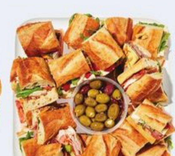
GOURMET SANDWICH PLATTER AN ASSORTMENT OF ARTISAN SANDWICHES INCLUDING ITALIAN CLASSIC, ROAST BEEF GOUDA, TURKEY BACON CLUB, CHICKEN BRIE FIG, HAM AND CHEESE ON FRESHLY BAKED BAGUETTE, PERFECTLY PAIRED WITH MIXED OLIVES SERVES 12-14 21558211_EA