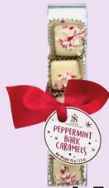
WHITE PEPPERMINT CARMELS 70 G 21626645_EA