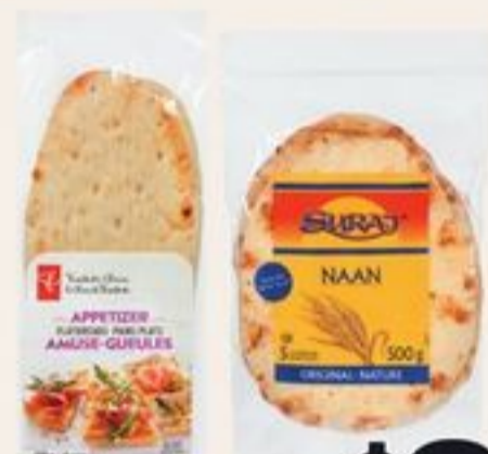
PC® FLATBREAD 220/300 G OR SURAJ® NAAN 5'S SELECTED VARIETIES 20910044_EA/21051353_EA