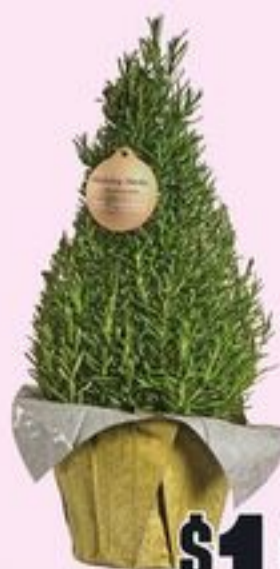
ROSEMARY 4 INCH 21354963_EA