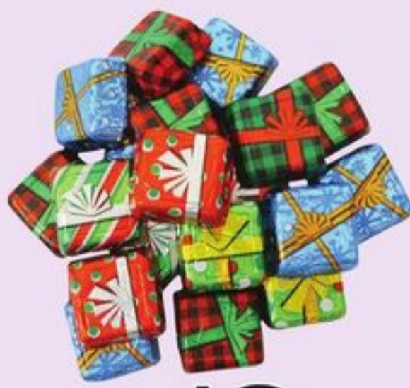
CHOCOLATE PRESENTS 21626536_KG