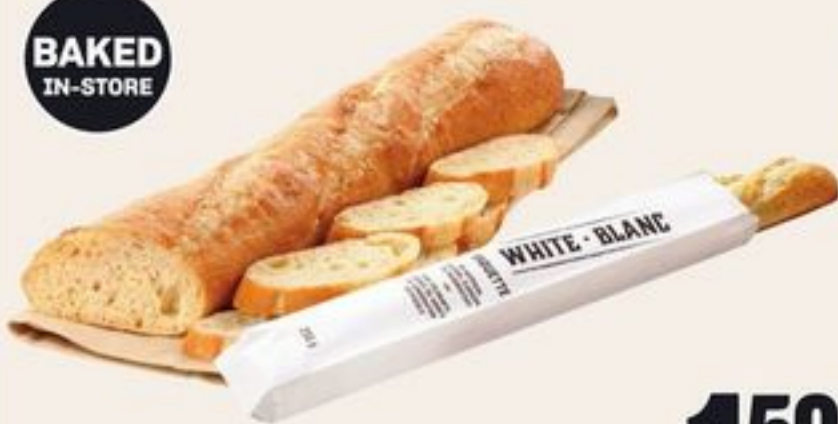
BAGUETTE WHITE OR WHOLE WHEAT 255 G 21529211_EA