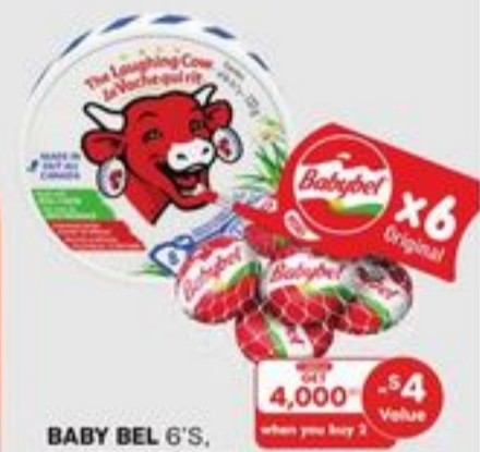
BABY BEL G'S, LAUGHING COW 12'S OR CHEESE DIPPERS SELECTED VARIETIES 20319107_EA/20574332_EA