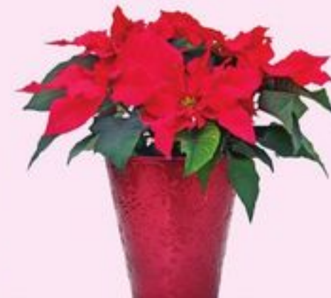
POINSETTIA IN UPGRADED TIN 8 INCH 20287881_EA