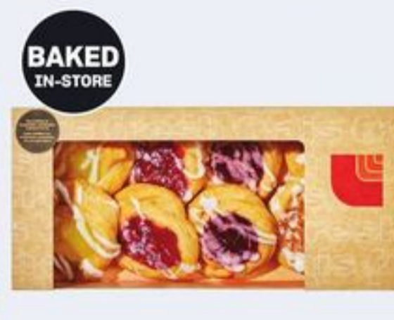
BAKED IN-STORE MINI DANISH ASSORTED VARIETIES 8'S 214763209_EA