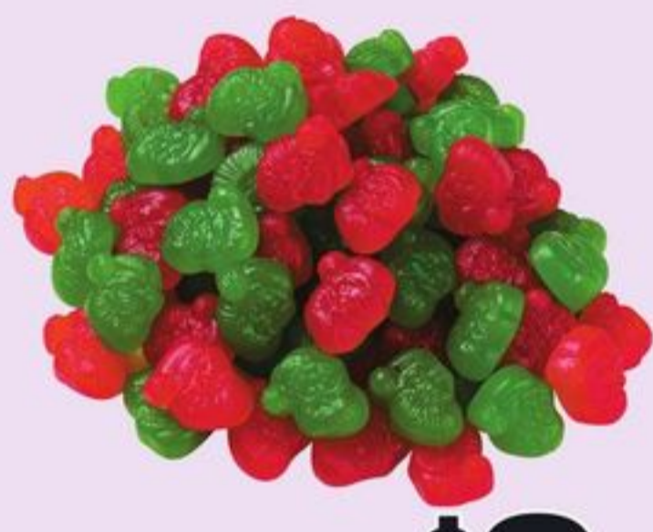
HOLIDAY JUBES 21626733_KG