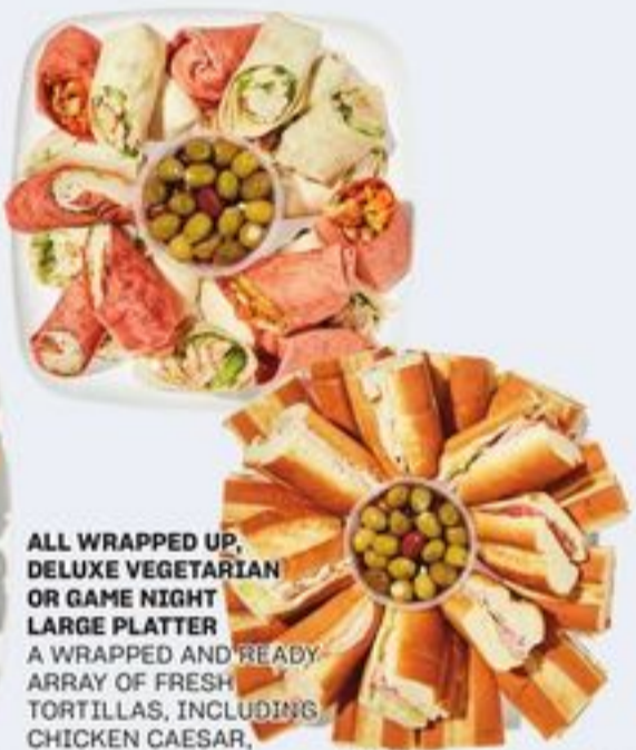
ALL WRAPPED UP, DELUXE VEGETARIAN OR GAME NIGHT LARGE PLATTER A WRAPPED AND READY-TO-EAT ARRAY OF FRESH TORTILLAS, INCLUDING CHICKEN CAESAR, CRISPY CHICKEN LOUISIANA HOT, SWEET CHILI CHICKEN, AND TURKEY AVOCADO BACON, PERFECTLY PAIRED WITH MIXED OLIVES SERVES 10-12 21557920_EA/21558136_EA