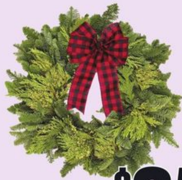
HOLIDAY WREATH WITH BOW SELECTED VARIETIES 24 INCH 21349757_EA