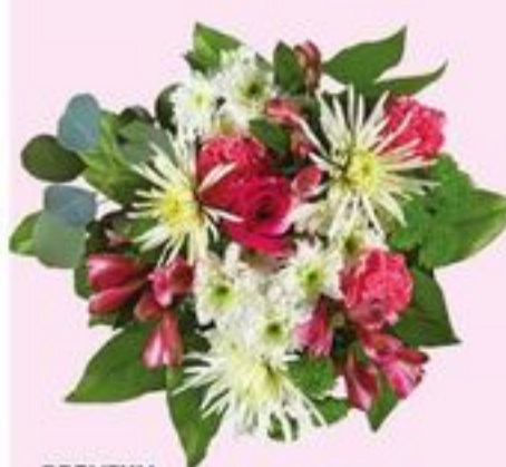
PREMIUM GIFTING BOUQUET SELECTED VARIETIES 21436381_EA/21436382_EA