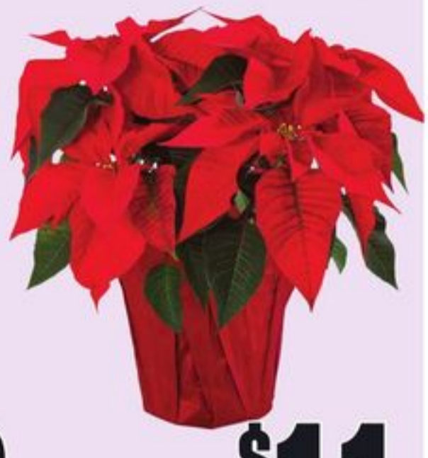
6 INCH POINSETTIA 20036549_EA