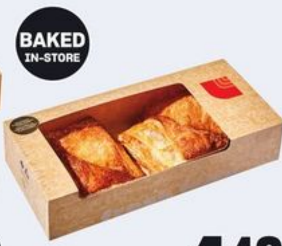
BAKED IN-STORE TURNOVERS SELECTED VARIETIES 4'S 214659196_EA