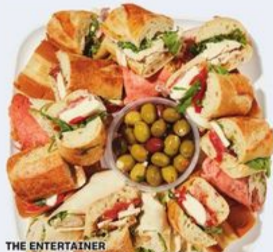
THE ENTERTAINER A MUST-HAVE FOR ANY PARTY, IT OFFERS GUESTS A SELECTION OF OUR FAVORITE SANDWICHES INCLUDING ITALIAN CLASSIC, CHICKEN BRIE FIG, BOCCONCINI ROASTED TOMATO ON FRESH BAKED BAGUETTE, HAND ROLLED TORTILLA WRAPS WITH CHICKEN CAESAR, TURKEY AVOCADO BACON, AND CRISPY CHICKEN LOUISIANA HOT. FRESHLY PREPARED SUBS MADE WITH ROAST BEEF, ASSORTED, HAM AND CHEESE, PERFECTLY PAIRED WITH MIXED OLIVES SERVES 8-10 21558213_EA