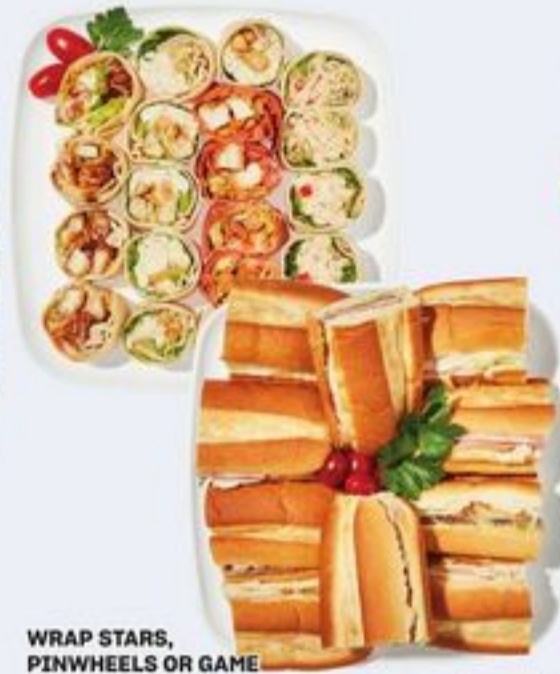
WRAP STARS, PINWHEELS OR GAME NIGHT PLATTER SMALL ROLL UP TO THE PARTY WITH A TRAY OF WRAPS, PINWHEELS OR ASSORTED DELI MEAT ON FRESH SUB BUNS SERVES 8-10 21557919_EA/21558135_EA