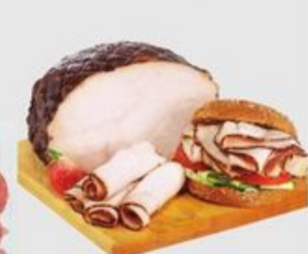
PC® NATURAL CHOICE™ TURKEY SERVICE CASE MEATS SELECTED VARIETIES 20059548_KG