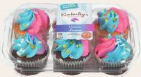
KIMBERLEY'S CUPCAKES SELECTED VARIETIES 6'S 21595212_EA