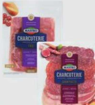
MASTRO TRIOS SELECTED VARIETIES 150/250 G 21064064_EA/21554465_EA