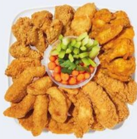
WING N TENDERS PLATTER 20 CHICKEN WINGS BREADED OR UNBREADED, SAUCE OF YOUR CHOICE, 12 CHICKEN TENDERS PAIRED WITH CARROTS AND CELERY 21559272_EA