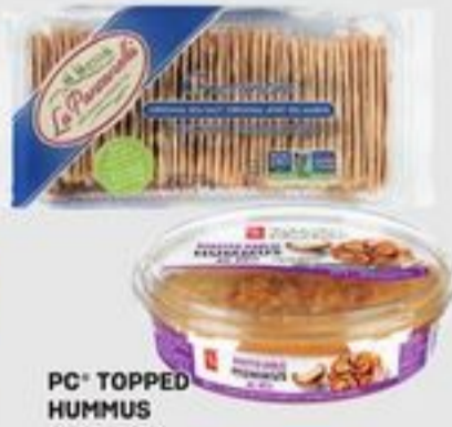
PC® TOPPED HUMMUS 280 G OR LA PANZELLA 170 G SELECTED VARIETIES 20811384_EA 21348433_EA