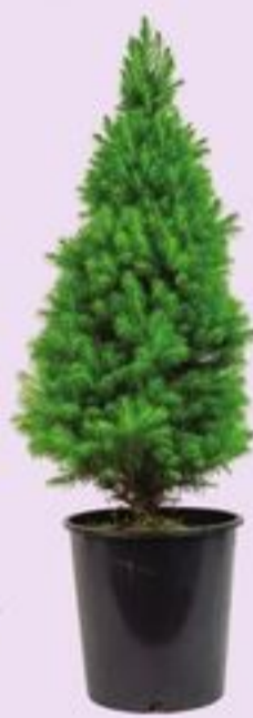
4 INCH CONIFER 21638836_EA