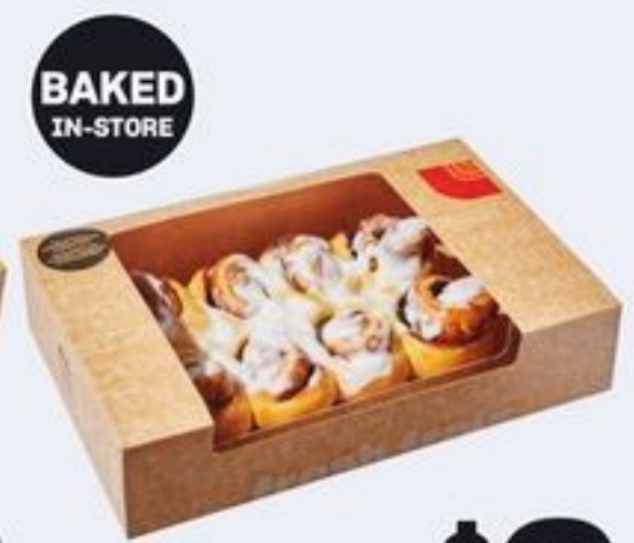
BAKED IN-STORE CINNAMON BUNS, DANISH OR CREAM CHEESE ICED 10'S 21467583_EA