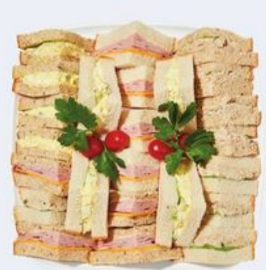
CLASSIC TEA SANDWICH PLATTER AN ASSORTMENT OF FINGER-SIZED SANDWICHES MADE WITH WHITE AND WHOLE WHEAT BREAD INCLUDING HAM AND CHEESE, TUNA, AND EGG SALAD SERVES 6-8 21558137_EA