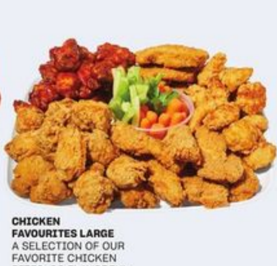
CHICKEN FAVOURITES LARGE A SELECTION OF OUR FAVORITE CHICKEN BITES; 30 FLAVORFUL CHICKEN WINGS, BREADED AND UN-BREADED, 12 CLASSIC AND CRUNCHY CHICKEN STRIPS, 20 JUICY BREADED BONELESS CHICKEN BITES, PAIRED WITH CELERY AND CARROTS SERVED CHILLED (INCLUDES 62 PIECES) 21559159_EA