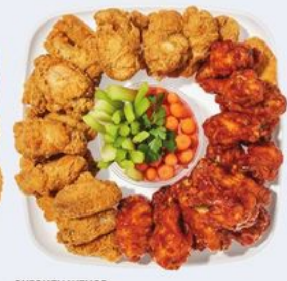
CHICKEN WINGS PLATTER FLAVORFUL CHICKEN WINGS BREADED AND UN-BREADED, AVAILABLE PLAIN OR WITH YOUR CHOICE OF SAUCE, PAIRED WITH CELERY AND CARROTS SERVED CHILLED (INCLUDES 40 PIECES) SERVES 8-10 21558990_EA