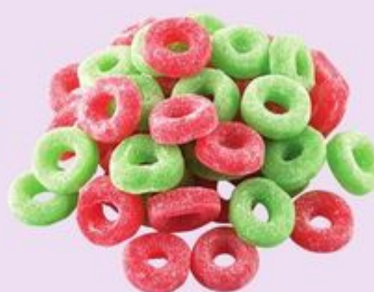
RED AND GREEN JELLY WREATHS OR HOLIDAY JELLY MIX 21626586_KG/21626537_KG