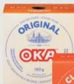
OKA SELECTED VARIETIES 190 G 20920756_EA/20921279_EA