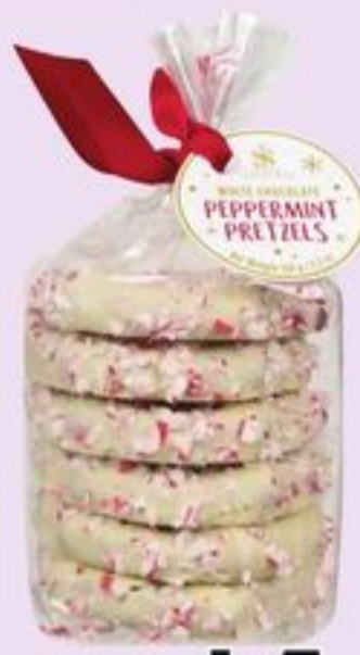
PEPPERMINT PRETZELS 150 G 21626664_EA