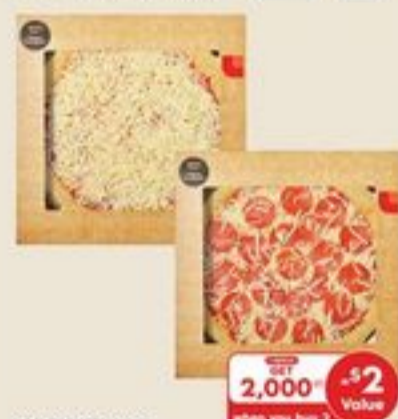
12" TAKE AND BAKE PIZZA SELECTED VARIETIES 510-739 G 21456393_EA 21456401_EA