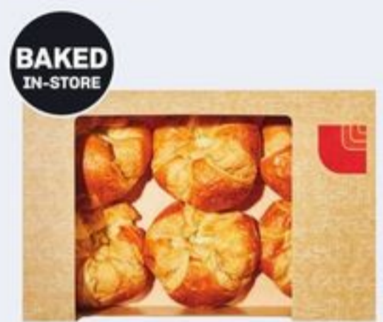
BAKED IN-STORE PLAIN CROISSANTS 6'S 21030153_EA