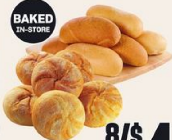
BULK ROLLS SELECTED VARIETIES 20076950_EA