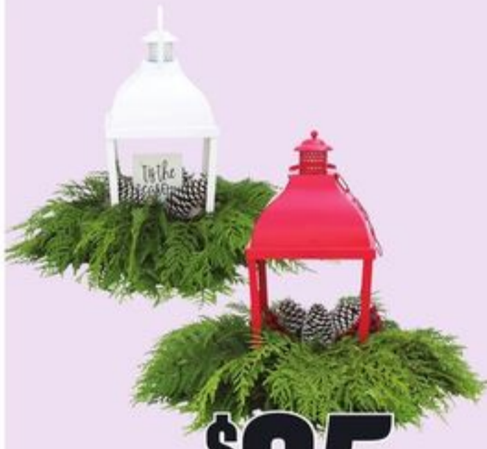
GREENERY LANTERN 21215675_EA