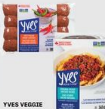
YVES VEGGIE GROUND MEAT OR SAUSAGES SELECTED VARIETIES 156-380 G 20507159_EA 20596775_EA