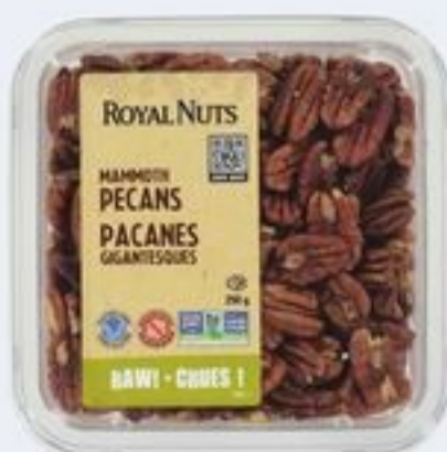
ROYAL NUTS PECANS 250 G 21192386_EA