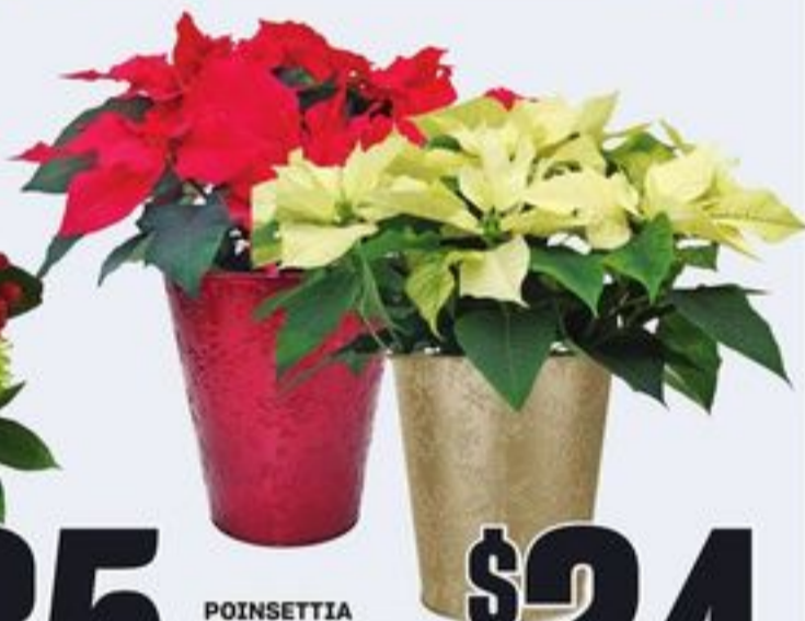
POINSETTIA IN UPGRADED TIN 8 INCH EACH 20287881_EA