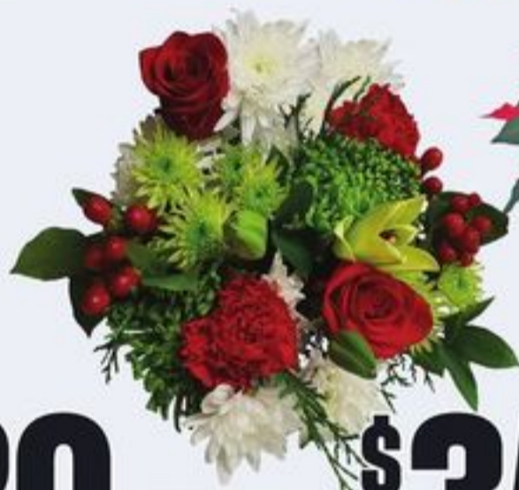
PREMIUM HOLIDAY BOUQUET EACH 21340765_EA