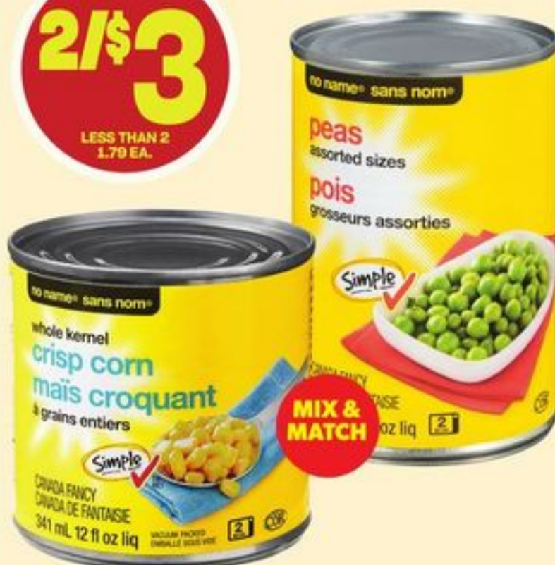
NO NAME® CANNED VEGETABLES SELECTED VARIETIES 341/398 ML 20303822_EA/20323322_EA