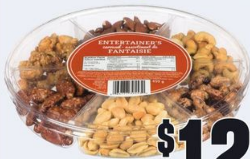
ENTERTAINER CAROUSEL 450 G 20907779_EA