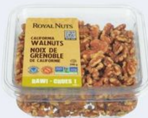
ROYAL NUTS CALIFORNIA WALNUTS 240 G 20771610_EA