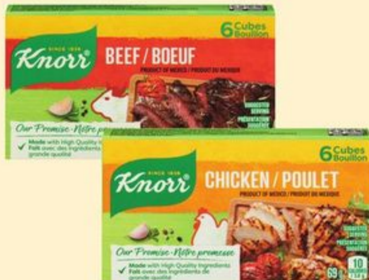
KNORR BOUILLON CUBES SELECTED VARIETIES 39-63 G 20297436001_EA/20297436002_EA