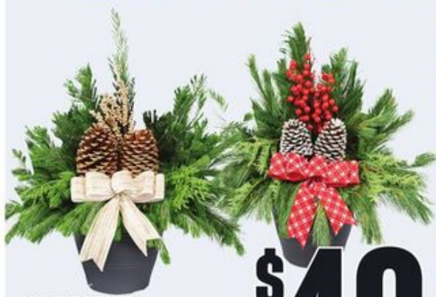
PC® LARGE OUTDOOR ARRANGEMENT WITH PINE & BERRIES EACH 20144803_EA