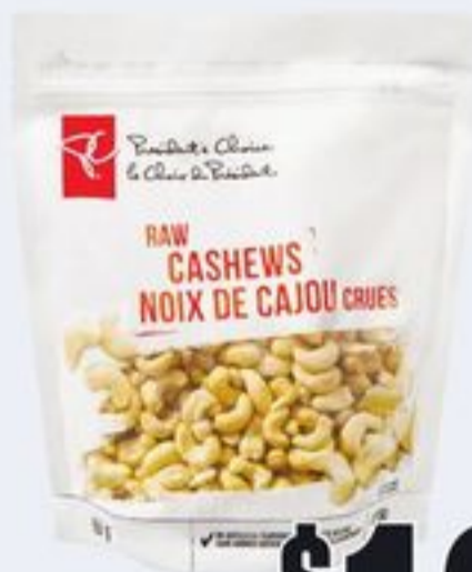
PC® RAW CASHEWS 680 G 21404971_EA