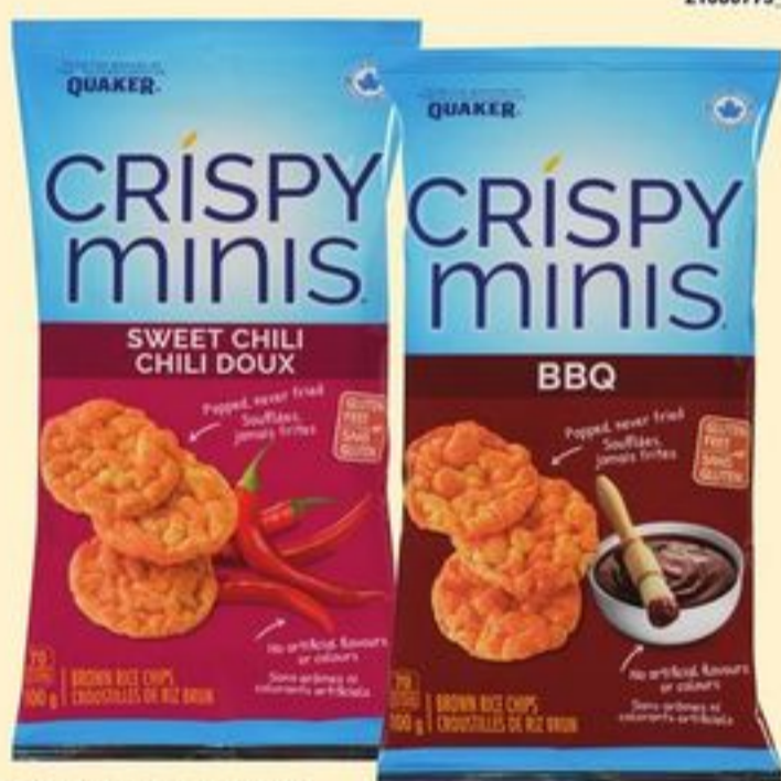
QUAKER CRISPY MINIS OR LARGE RICE CAKES SELECTED VARIETIES 90-173 G 20850854_EA/20850958_EA