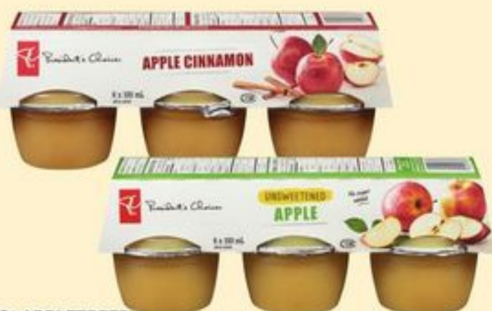
PC® APPLE TREE™ APPLE SAUCES SELECTED VARIETIES 6X100 ML 20309701001_EA/20309701002_EA