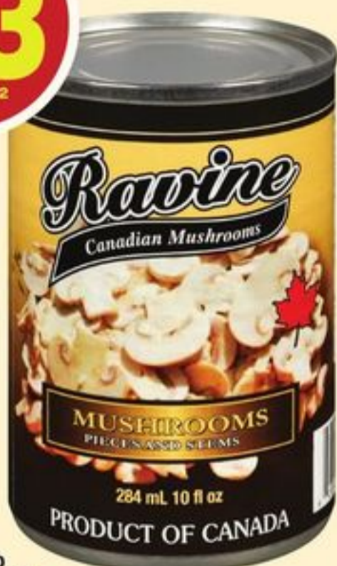
RAVINE CANNED MUSHROOM PIECES AND STEMS 284 ML 21298248_EA