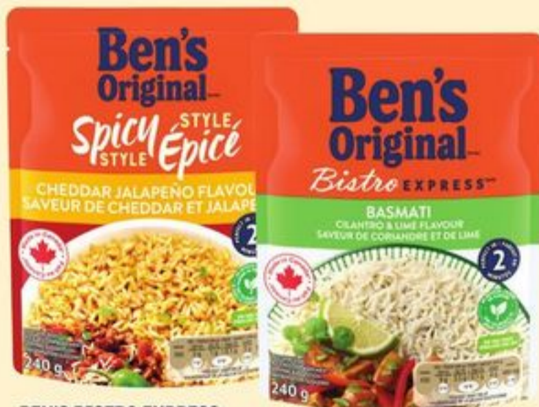
BEN'S BISTRO EXPRESS SELECTED VARIETIES 240/250 G 21404827_EA/21404840_EA