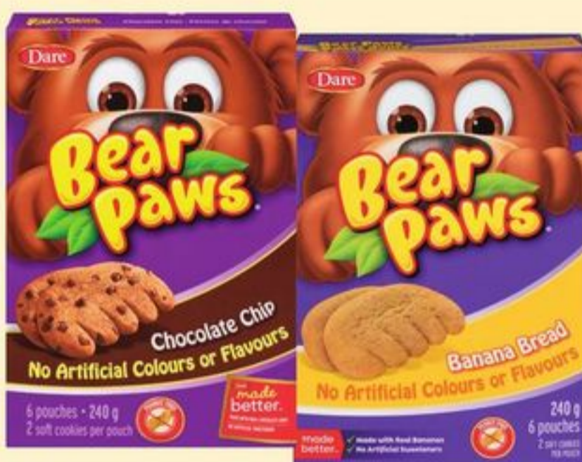
DARE BEAR PAWS COOKIES SELECTED VARIETIES 168-240 G 21080779_EA/21080791_EA