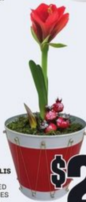
AMARYLLIS GARDEN SELECTED VARIETIES EACH 21340765_EA

Set the mood, hang some cheer and enjoy the scents of the season.