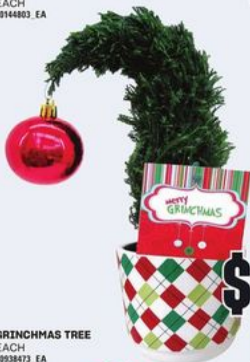
GRINCHMAS TREE EACH 20938473_EA