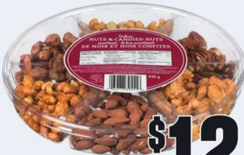
NUTS CAROUSEL 450 G 20907921_EA