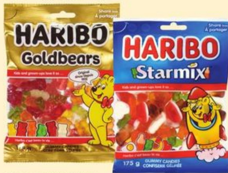
HARIBO GUMMY CANDY SELECTED VARIETIES 170-175 G 21519578_EA/21519517_EA