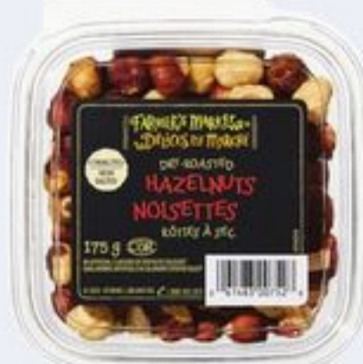
FARMER'S MARKET™ HAZELNUTS 175 G 21519996_EA