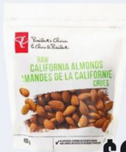
PC® RAW ALMONDS 400 G 21408053_EA