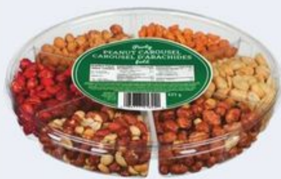
PARTY PEANUTS CAROUSEL 625 G 21107309_EA