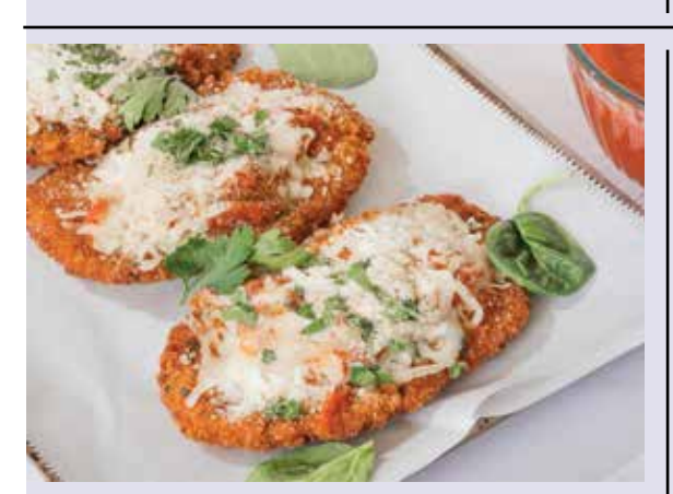
CHICKEN PARMIGIANA BREADED CHICKEN BREAST TOPPED WITH TOMATO SAUCE, FRESH MOZZARELLA, AND PARSLEY.