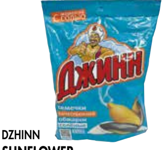
SUNFLOWER SEEDS 350G