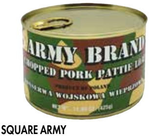
CHOPPED PORK PATTIE LOAF