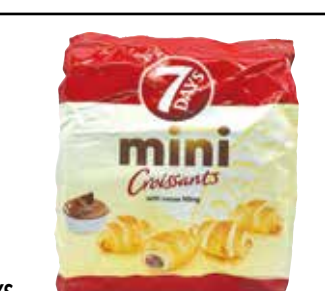
7 DAYS MINI CROISSANT CHOCOLATE