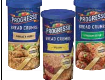
PROGRESSO BREAD CRUMBS $249