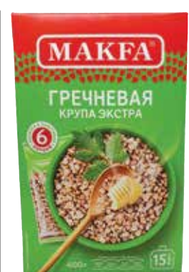
MAKFA BUCKWHEAT BOIL IN BAGS, 5 X 80G 99 ¢