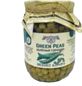
GOLDEN FLEECE GREEN PEAS 720G