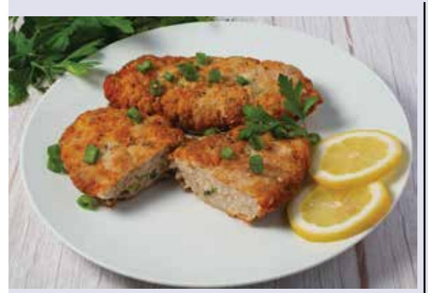
SHNITZEL TENDER FRIED PORK SCHNITZEL.