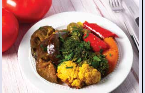
GRILLED VEGETABLES GRILLED EGGPLANT, COLORED PEPPERS, ONIONS, AND GARLIC.