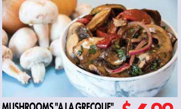
MUSHROOMS "A LA GRECQUE" MARINATED SLICED MUSHROOMS WITH RED PEPPERS AND BALSAMIC VINEGAR.