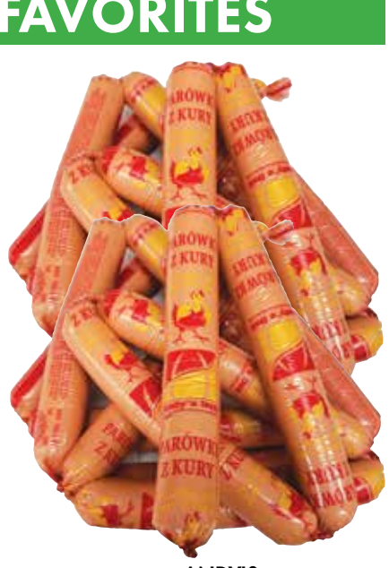
ANDY'S CHICKEN WIENERS