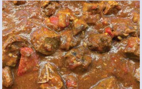
BEEF GULYASH SLOW COOKED TENDER BEEF WITH RED PEPPERS AND ONIONS, MIXED IN TOMATO SAUCE.