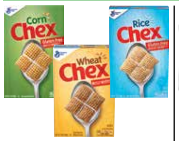
GENERAL MILLS CHEX CEREAL