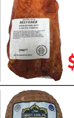
BELVEDER SMOKED PORK BUTTS