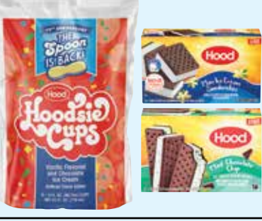
HOOD ICE CREAM CUPS AND SANDWICHES