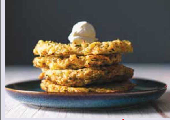
ZUCCHINI PANCAKES CRISPY AND DELICIOUS FRIED ZUCCHINI PANCAKES.