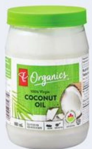
PC® ORGANICS COCONUT OIL 860 ML 20893349_EA