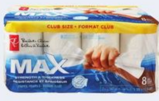
PC® MAX® PAPER TOWELS 8=24 ROLLS 21542607_EA