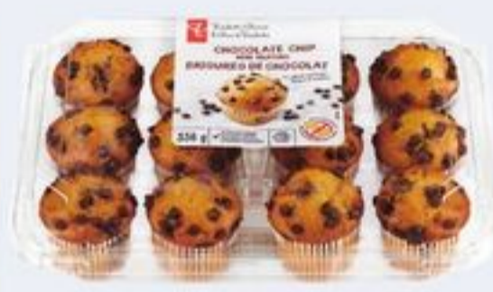
PC® MINI MUFFINS SELECTED VARIETIES 12'S 21488839_EA