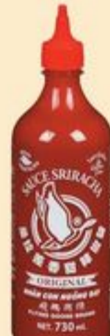
FLYING GOOSE BRAND SRIRACHA SAUCE 730 ML 21499017_EA