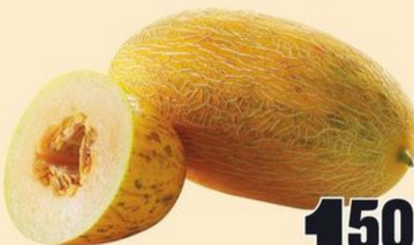
HAMI MELON PRODUCT OF U.S.A. 3.31/KG 21051297001_KG

Members-Only Price ™ 2 99 Non-members 3 99