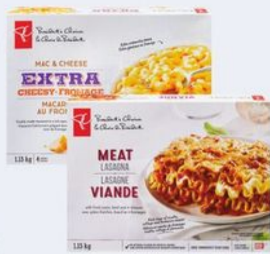
PC® OR BLUE MENU® MEAT OR VEGETABLE LASAGNA OR MAC & CHEESE ENTRÉES SELECTED VARIETIES, FROZEN 1.13 KG 20314880_EA/20326534_EA