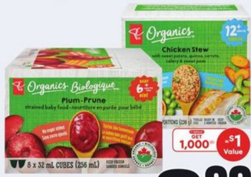
PC® ORGANICS FROZEN BABY FOOD SELECTED VARIETIES 8X32 ML/2X128 G 21563528_EA/21563751_EA