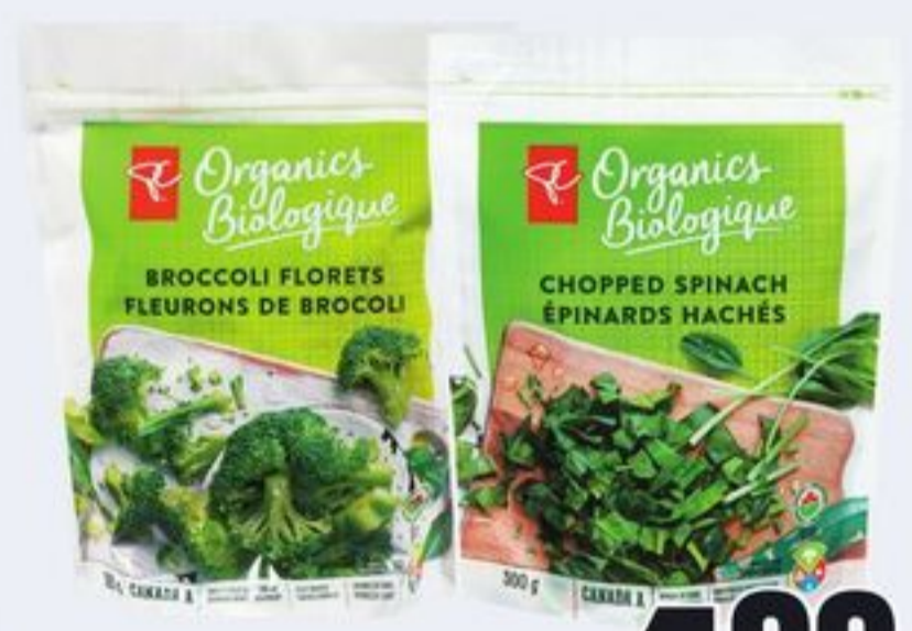
PC® ORGANICS VEGETABLES SELECTED VARIETIES 300-500 G 20416869002_EA/21008161_EA