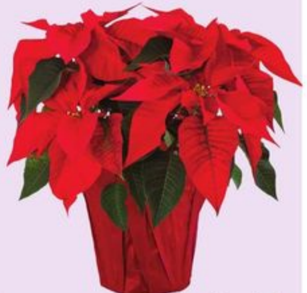
6 INCH POINSETTIA 20030549_EA