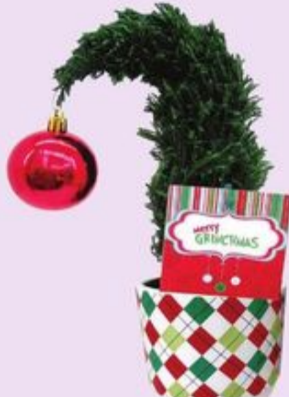
GRINCHMAS TREE 20930473_EA