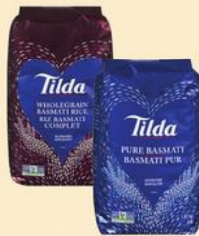
TILDA RICE SELECTED VARIETIES 4 LB 20013920_EA 20436365_EA