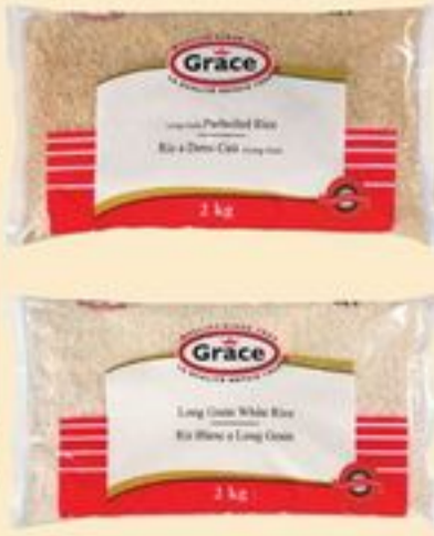
GRACE RICE 2 KG 21577947_EA 21578185_EA