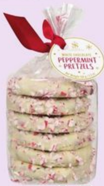
PEPPERMINT PRETZELS 150 G 21626664_EA