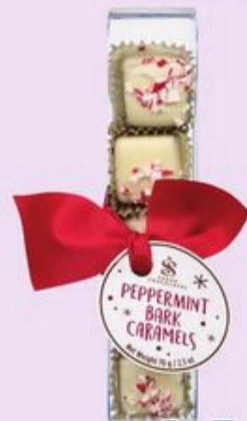
WHITE PEPPERMINT CARAMELS 70 G 21626645_EA