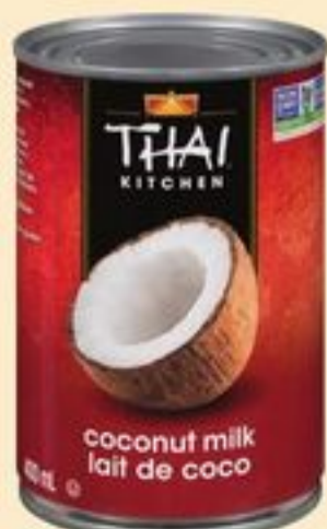
THAI KITCHEN COCONUT MILK SELECTED VARIETIES 400 ML 20661711_EA