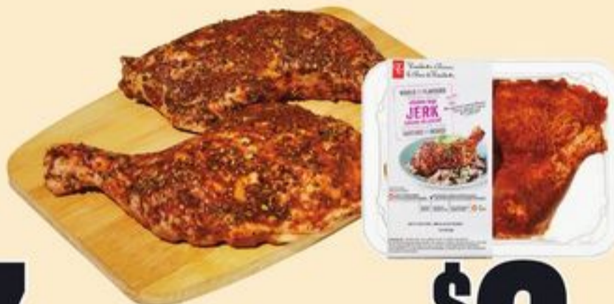
PC WORLD OF FLAVOURS™ JERK CHICKEN LEGS AIR CHILLED 13.23/KG 21454286_KG