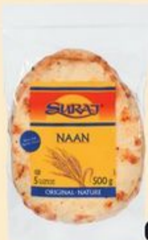
SURAJ NAAN SELECTED VARIETIES 5'S 21051353_EA