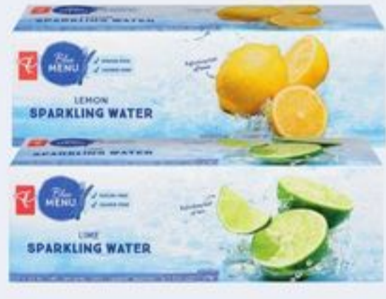
PC® OR BLUE MENU® SPARKLING WATER SELECTED VARIETIES 12X355 ML 20668034001_C01 20668034002_C01