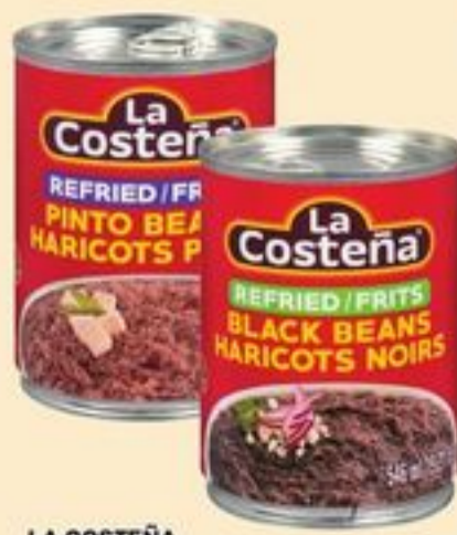
LA COSTEÑA REFRIED BEANS SELECTED VARIETIES 546 ML 20054076001_EA 20054076002_EA