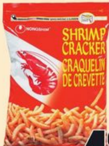
NONGSHIM SHRIMP CRACKERS SELECTED VARIETIES 200/400 G 20418200_EA