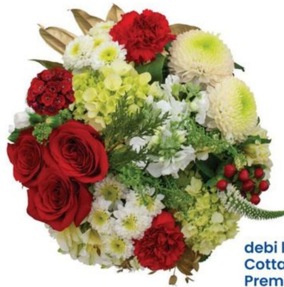
debi lilly design™ Cottage Christmas Premium A