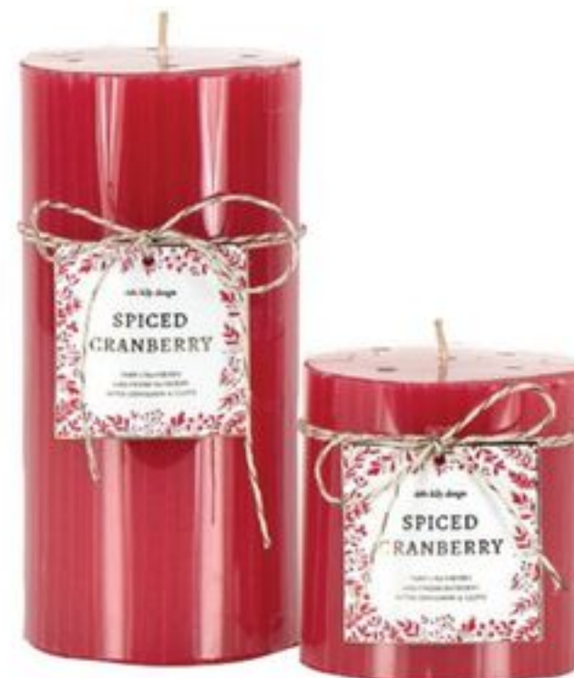
debi lilly design™ Cranberry Pillar Candle