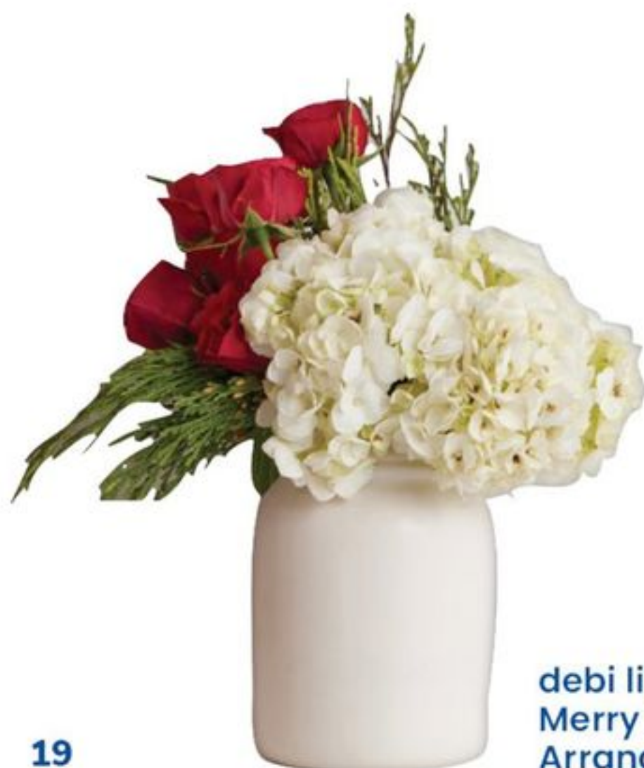
debi lilly design™ Merry Holiday Arrangement