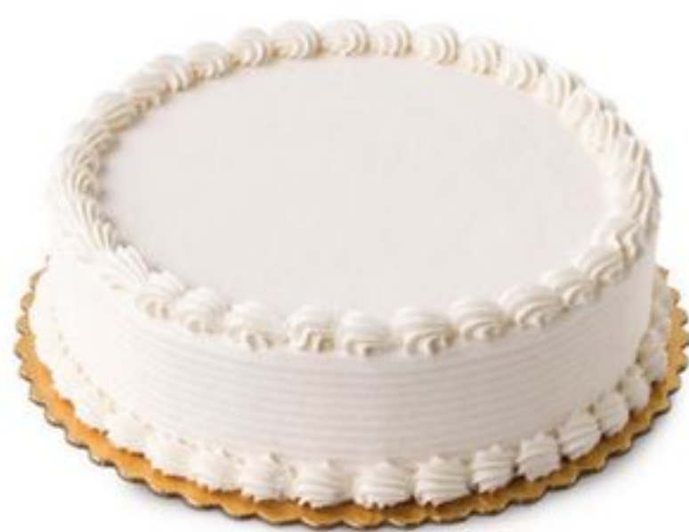
Single Layer Serves 6-8 people

Pick the perfect size cake for your occasion. Word of advice: having too much is better than not enough.