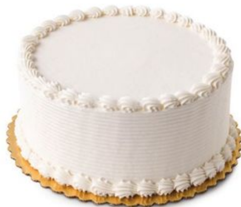
Double Layer Serves 8-10 people