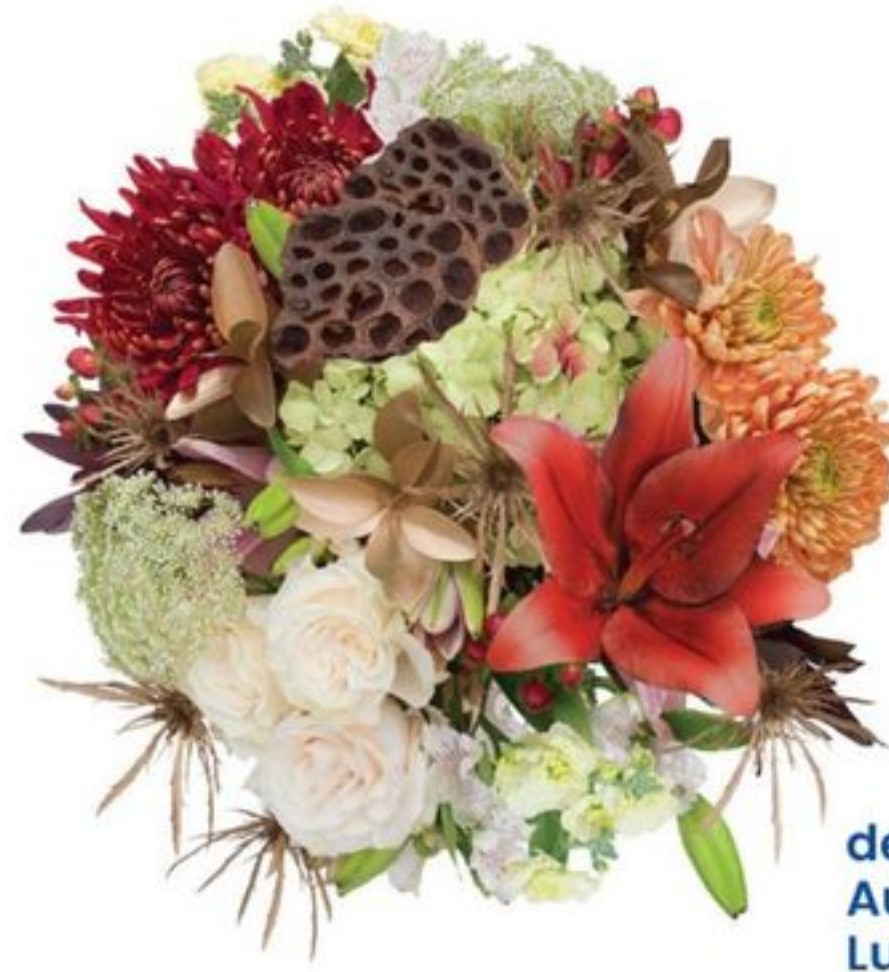
debi lilly design™ Autumn Leaves Lux Bouquet