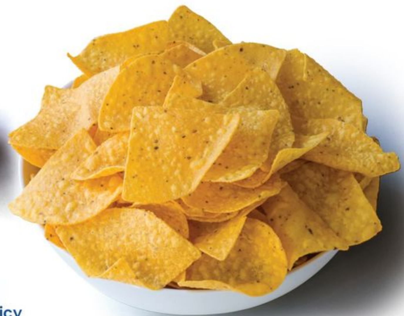
Deli Tortilla Chips