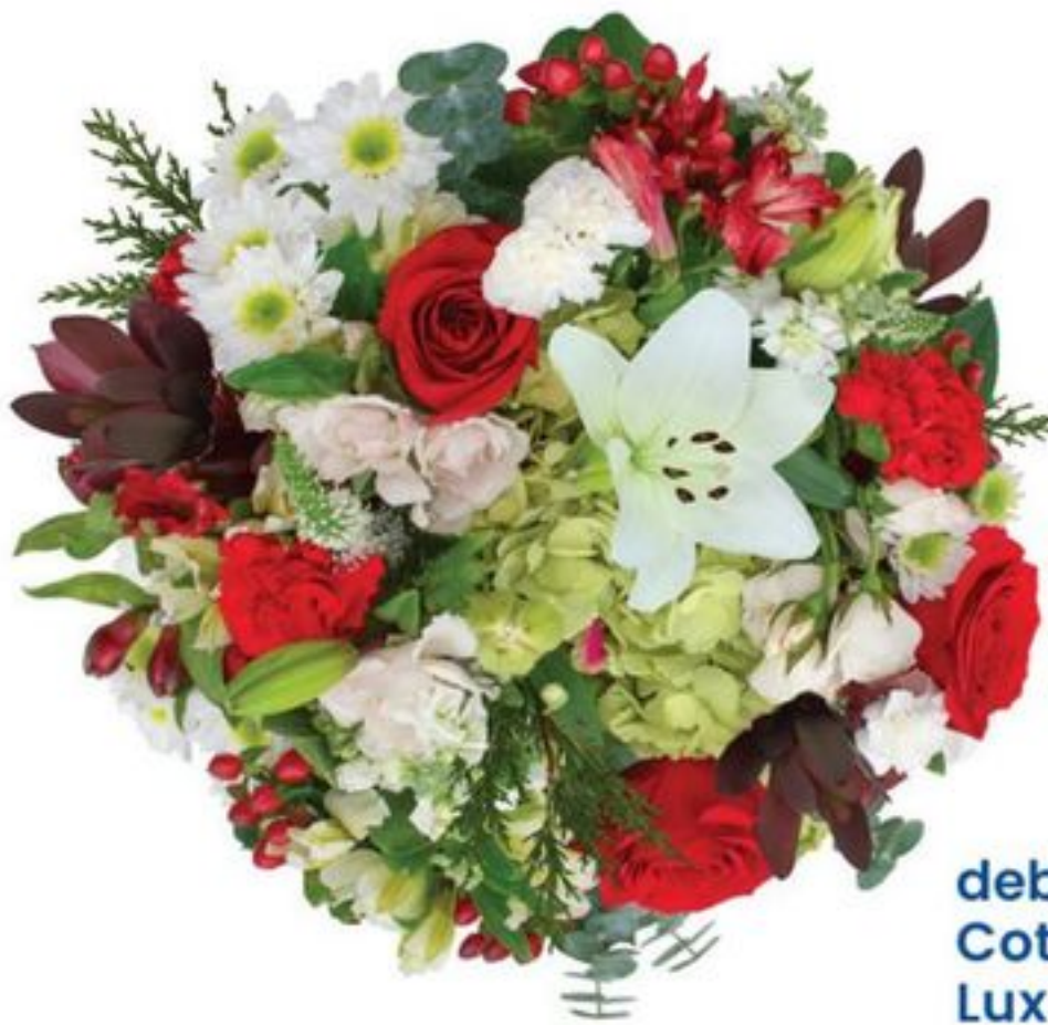
debi lilly design™ Cottage Christmas Lux A