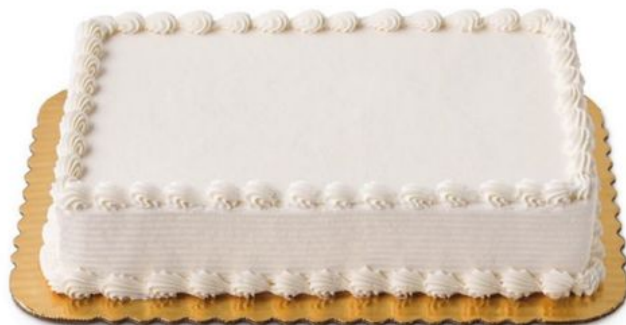
¼ Sheet Serves 20-24 people