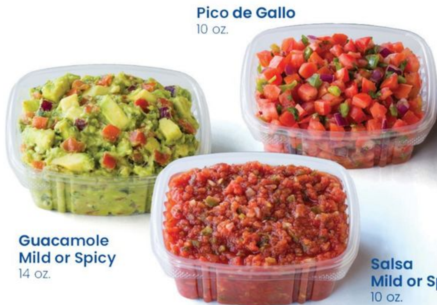
Guacamole Mild or Spicy 14 oz.

WHETHER YOU'RE HOSTING AN OFFICE LUNCH OR HAVING FRIENDS OVER TO WATCH THE GAME, OUR SANDWICHES ARE PREPARED WITH THE FRESHEST, MOST DELICIOUS INGREDIENTS, INCLUDING FRESH-CUT MEATS, FRESH-BAKED BREAD AND SPECIALTY CHEESES.