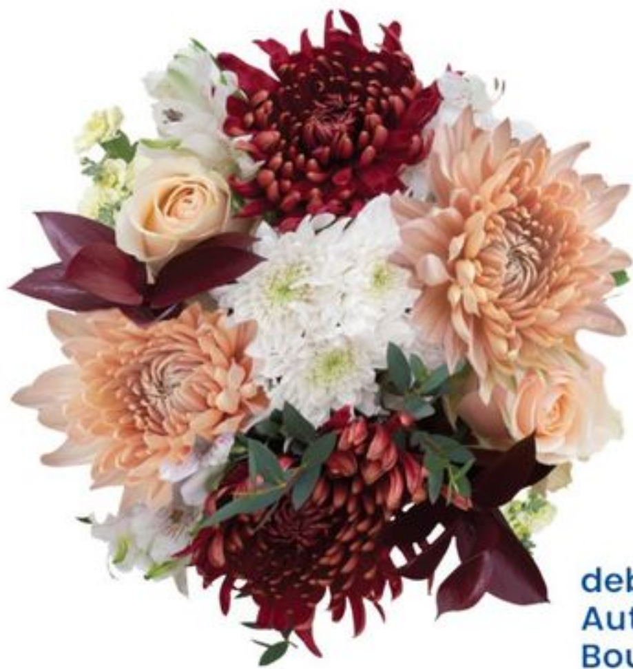
debi lilly design™ Autumn Leaves Bouquet