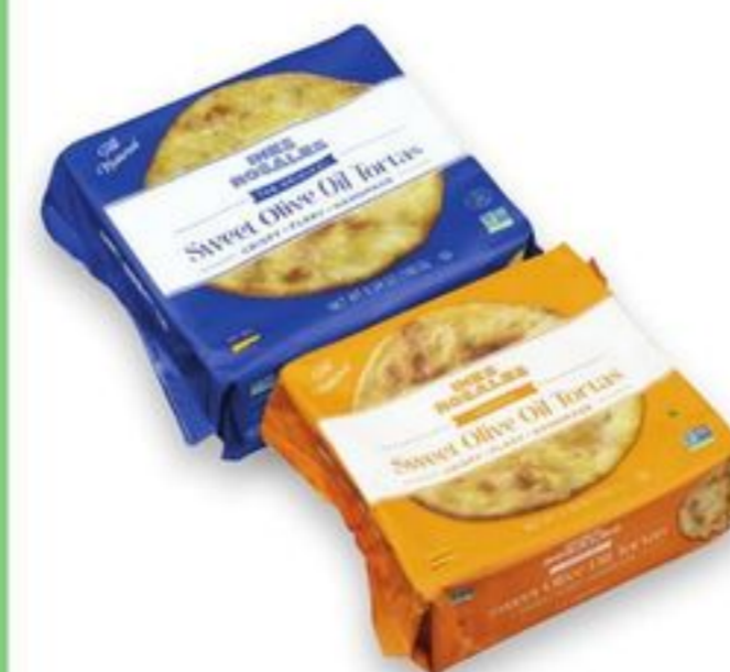
Ines Rosales Tortas 6.34-oz. Selected varieties.