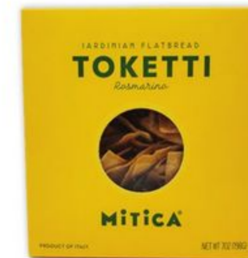
Mitica Toketti Flatbread 7-oz. Selected varieties.