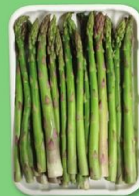
Small Asparagus Tray 10-oz.