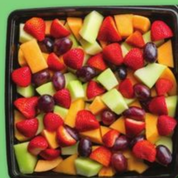
Family Size Fruit Salad Tray 83-oz.