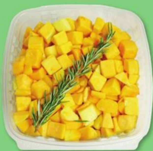
Butternut Squash with Rosemary 32-oz.