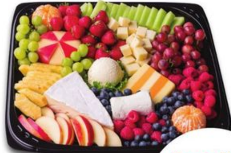
Fine Cheese & Fruit Tray