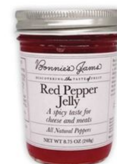
Bonnie's Jams 8.75-oz. Selected varieties.