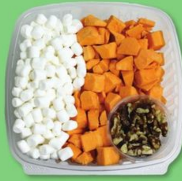
Candied Yams 25-oz.