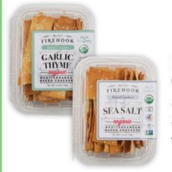
Firehook Crackers 5.5-oz. Selected varieties.