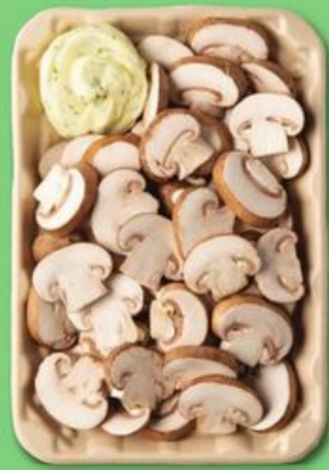
Mushrooms with Roasted Garlic Butter Tray 8.75-oz.