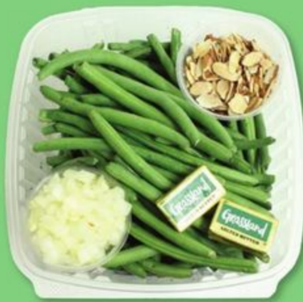
Charred Green Beans 18-oz.