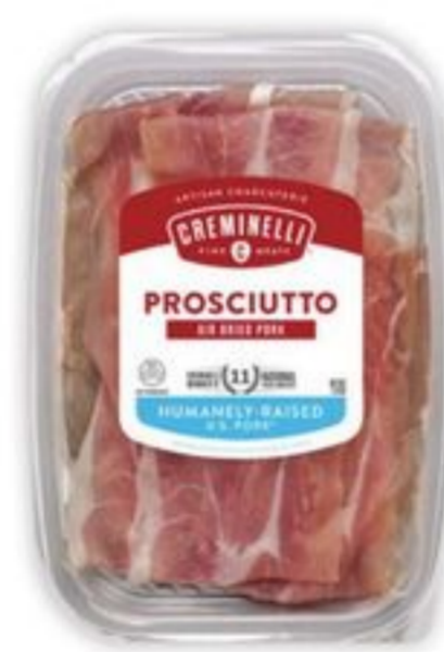
Creminelli Prosciutto 2-oz.