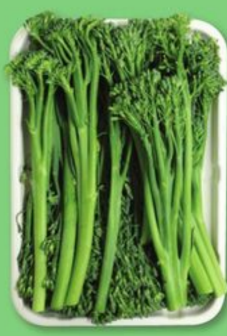
Small Broccolini Tray 7-oz.