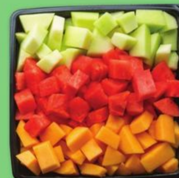
Family Size Melon Medley 83-oz.