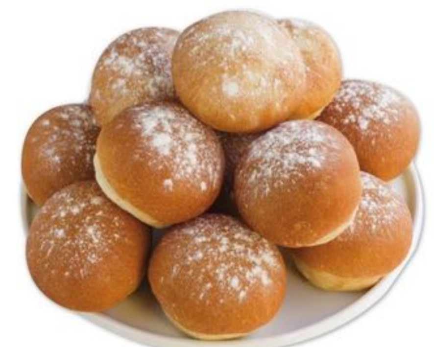
Fresh Baked Dinner Rolls 12-ct. Selected varieties.