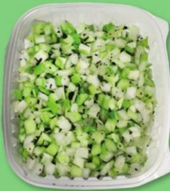
Stuffing Mix 20-oz.