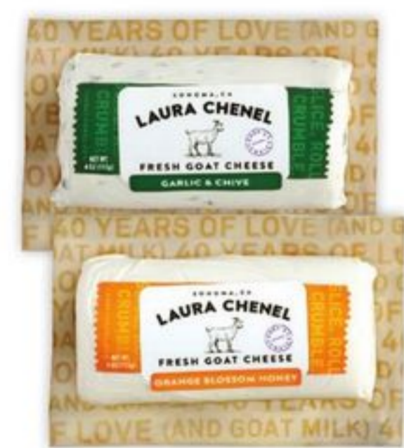
Laura Chenel Goat Cheese Log 4-oz. Selected varieties.