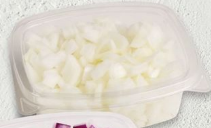
Chopped Yellow Onions 6-oz.