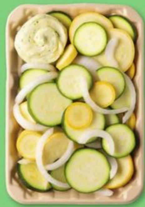
Small Squash Tray with Garlic Butter 14-oz.

Veggies come pre-packaged, pre-cut and full of delicious flavoring. Just cook and enjoy.