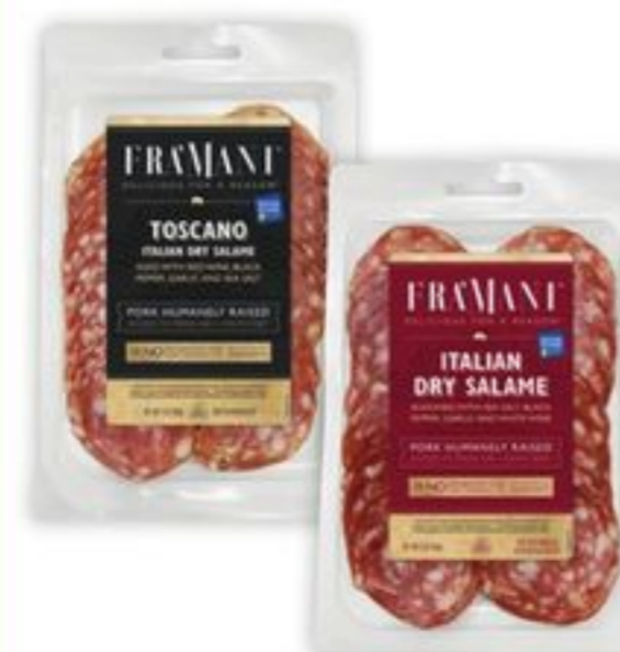
Fra'Mani Sliced Salame 2.5-oz. Selected varieties.