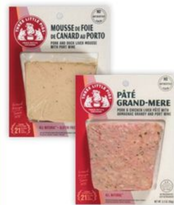
Three Little Pigs Pâté 5.5-oz. Selected varieties.