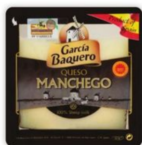
Garcia Baquero Queso Manchego 5.28-oz.