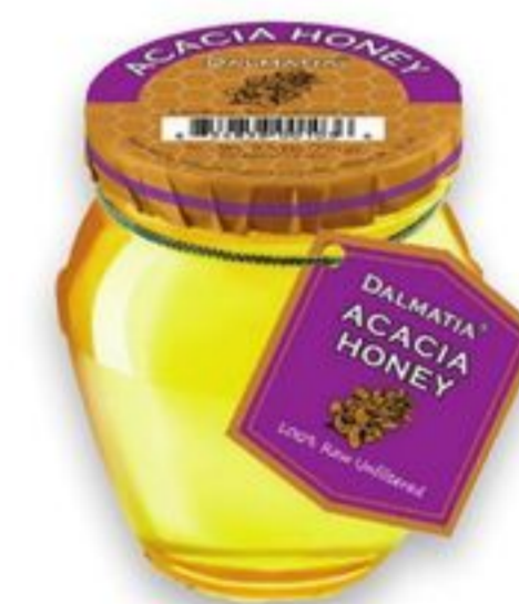
Dalmatia Acacia Honey 8.8-oz.