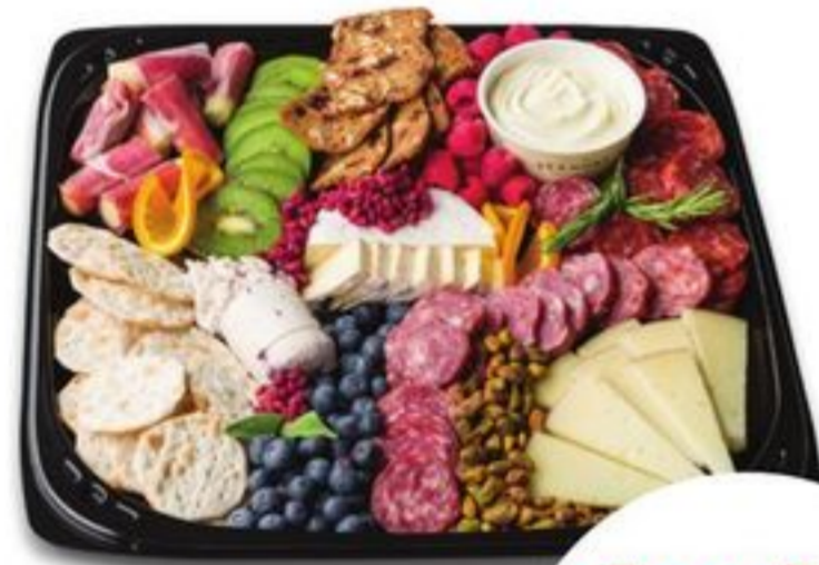
Elegant Charcuterie Tray