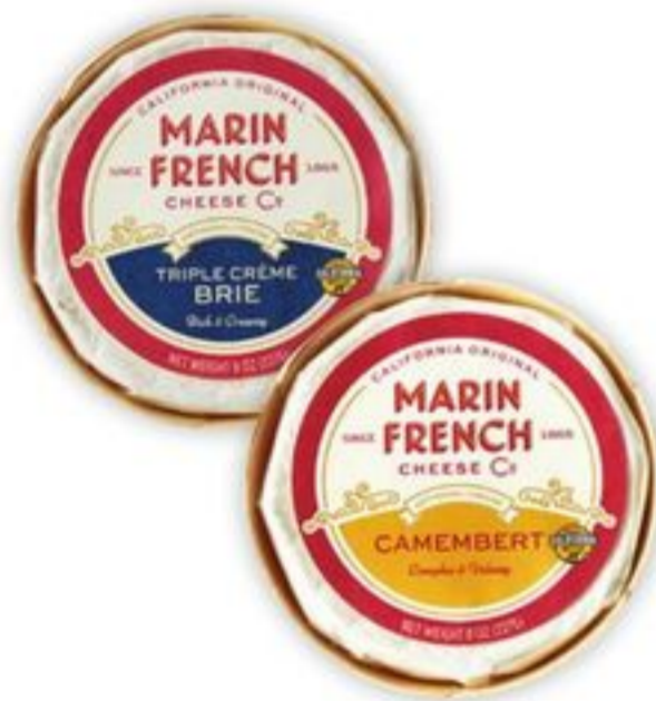
Marin French Brie Cheese 8-oz. Selected varieties.