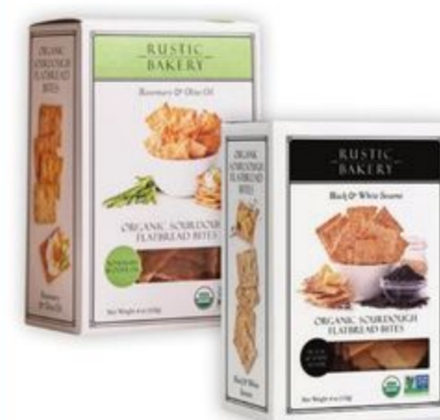
Rustic Bakery Bites 4-oz. Selected varieties.