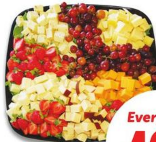
Simply Stated Cheese Platter