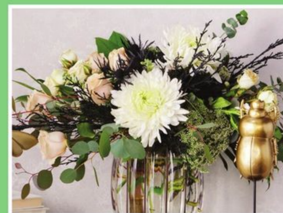
Fall Mum In 6-inch pot.