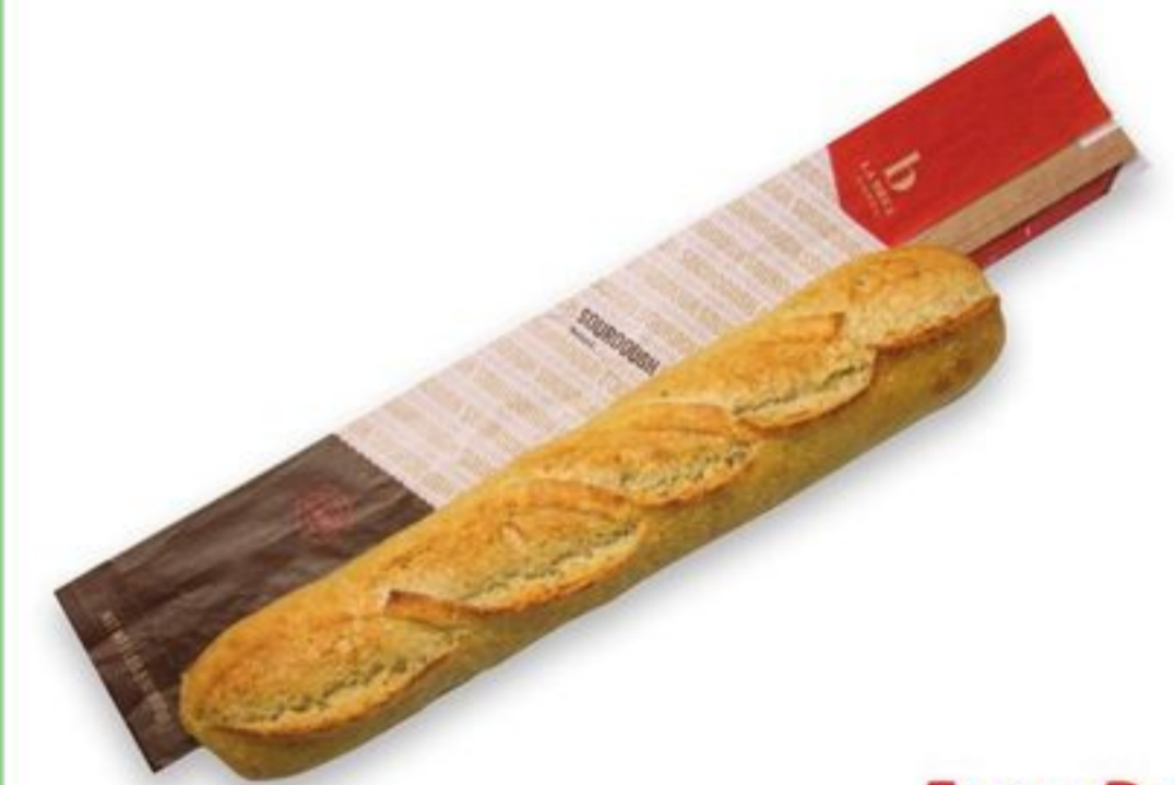
La Brea Bread Selected sizes and varieties.

Every holiday celebration should include a freshly baked loaf of French bread. Our specialty breads are sure to fill this holiday with cheer.