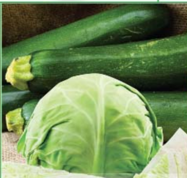
Italian Squash or Green Cabbage 79¢ lb.