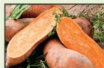
Sweet Yams 99¢ lb.