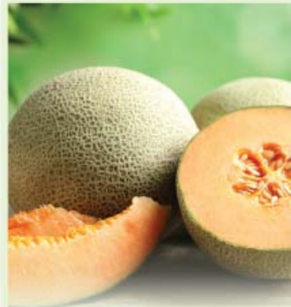
Large Cantaloupe 49¢ lb.

Wednesday & Thursday November 13th - 14th