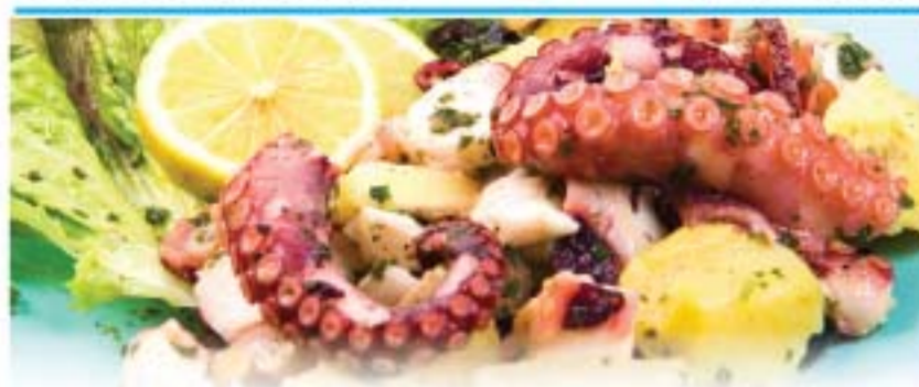
Cooked Cut Pieces Octopus