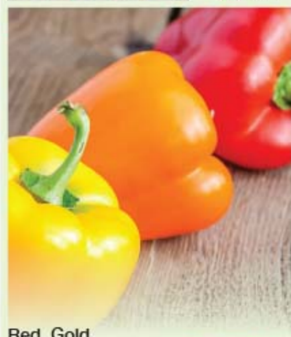
Red, Gold, Green or Orange Bell Peppers 77¢ ea.