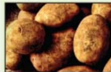
Premium Russet Potatoes 49¢ lb.