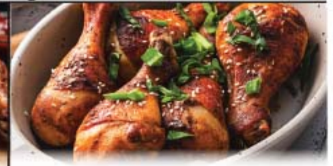
Fresh Never Frozen Chicken Drumsticks