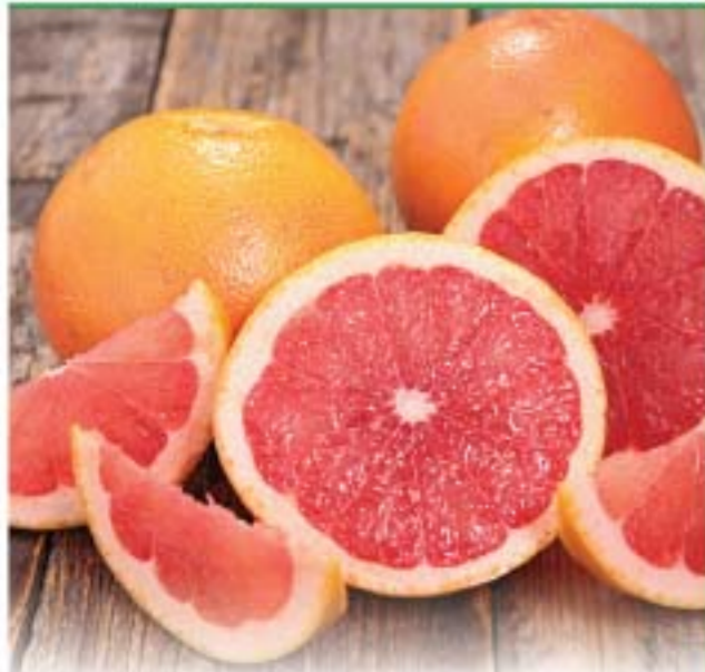
Pink Grapefruit 2 for 3