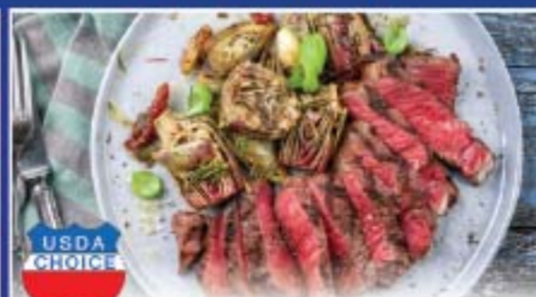
USDA Choice Boneless Center Cut Chuck Steaks