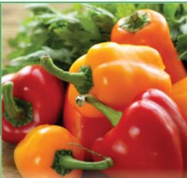
Red, Gold, Green or Orange Bell Peppers 5 for 5