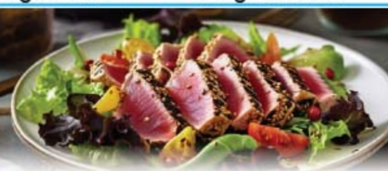
Wild Caught Ahi Tuna Steaks