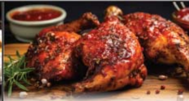
Fresh Never Frozen Chicken Leg Quarters