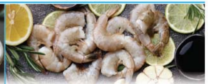
16-20 count Jumbo Raw Shrimp