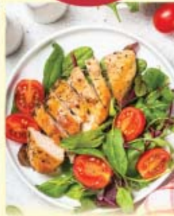
Fresh Never Frozen Boneless Skinless Chicken Breast