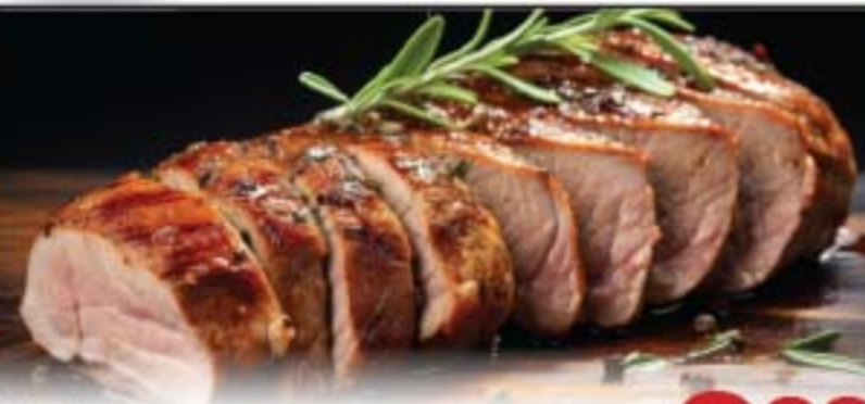
Fresh Boneless Pork Loin Roast