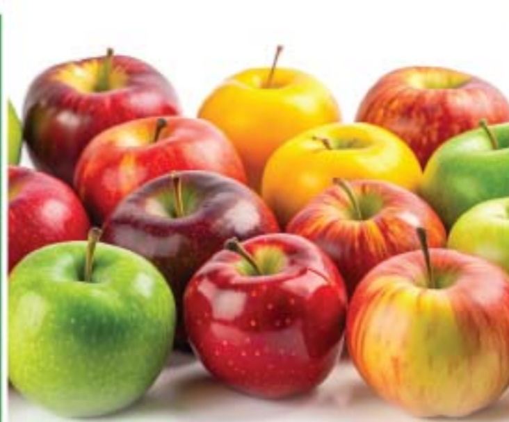
Large Gala, Fuji, Granny Smith or Premium Red Delicious Apples 99¢ lb.