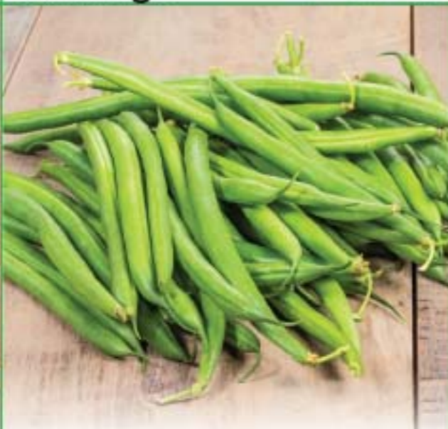
Green Beans 1 99 lb.