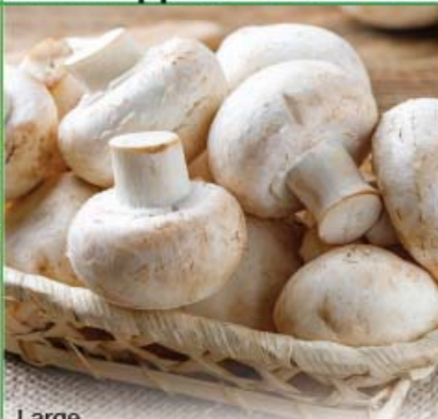
Large Monterey Whole Mushrooms 2 99 lb.