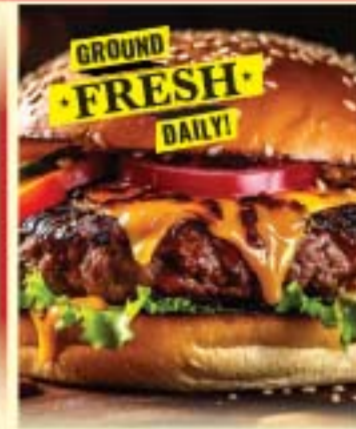
90% Extra Lean Ground Beef