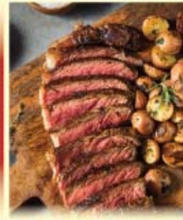
Fresh New York Strip Steaks