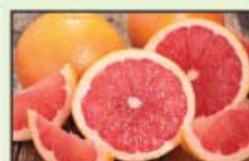
Pink Grapefruit 1 25 ea.