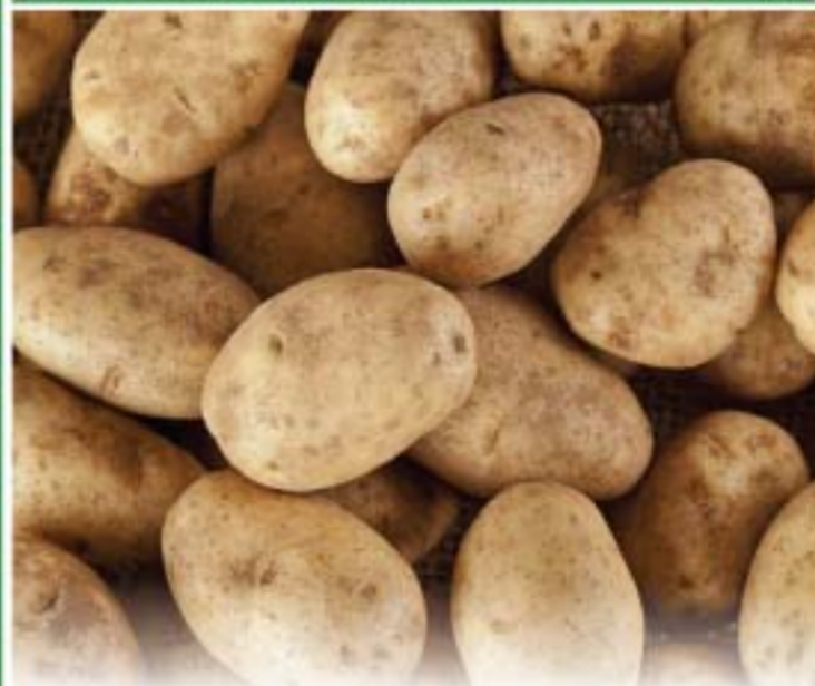
Potatoes 10 lb. bag 3 99 ea.