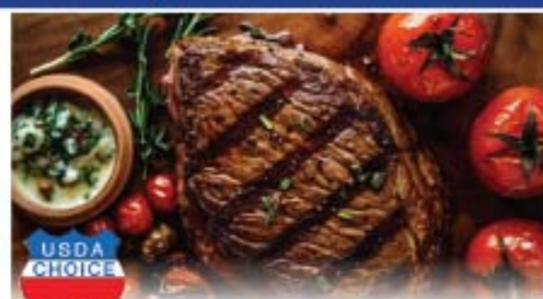
USDA Choice Beef Ranch Steaks Carne para Asar de Res

3 day sale Friday-Sunday November 15th - 17th