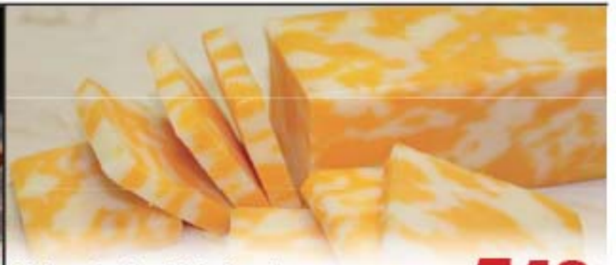
Value Pack, All Natural Monterey Jack or Colby Long Horn Cheese