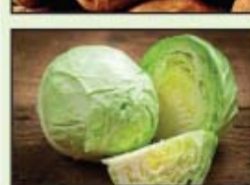
Green Cabbage 59¢ lb.