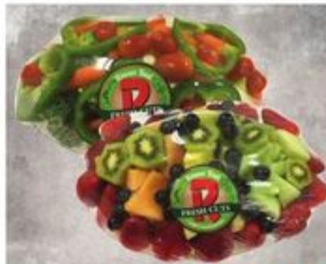
FRESH MADE IN OUR PRODUCE DEPARTMENT Vegetable or Fruit Luau Bowl $6 49 LB