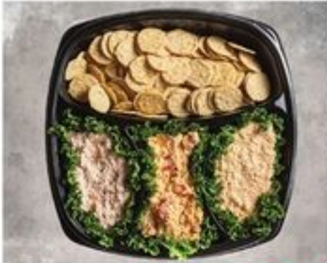
FEATURES SALMON, SHRIMP & CAJUN KRAB DIPS Seafood Dip Platter $28 99