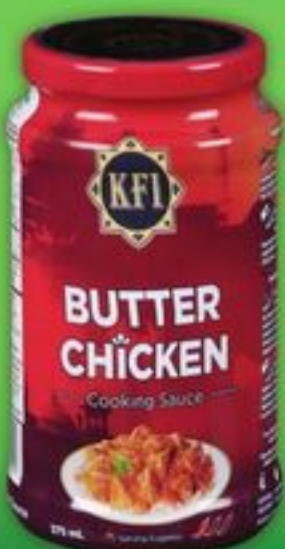
KFI SAUCES 375 ML SELECTED VARIETIES

ALL AISLES LEAD HOME KITCHENS OF THE WORLD 4.99 EACH