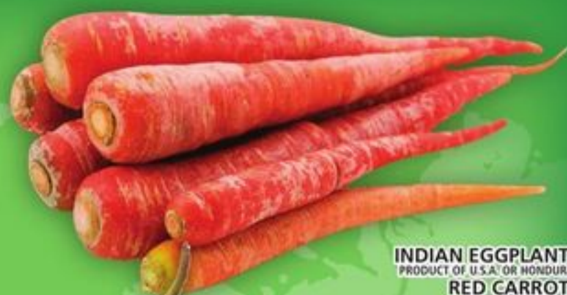
INDIAN EGGPLANTS PRODUCT OF U.S.A. OR HONDURAS RED CARROTS PRODUCT OF ONTARIO 4.39/KG

ALL AISLES LEAD HOME KITCHENS OF THE WORLD 2.69 EACH