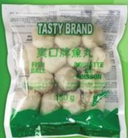
TASTY FISH BALLS 180 G FROZEN SELECTED VARIETIES

ALL AISLES LEAD HOME KITCHENS OF THE WORLD 2.49 EACH