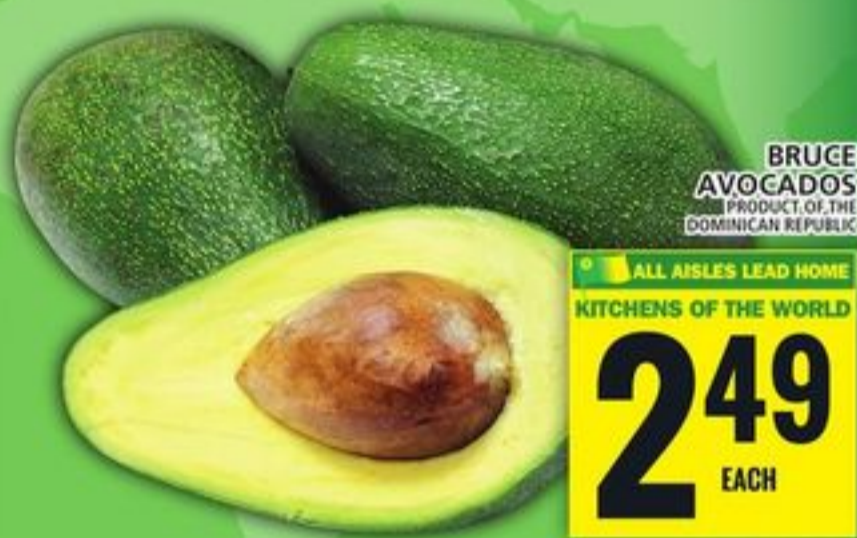
BRUCE AVOCADOS PRODUCT OF THE DOMINICAN REPUBLIC

ALL AISLES LEAD HOME KITCHENS OF THE WORLD 2.69 /LB