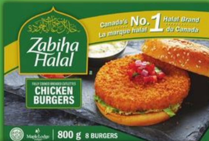
Canada's No. 1 Halal Brand La marque halal du Canada

ALL AISLES LEAD HOME KITCHENS OF THE WORLD 7.99 EACH