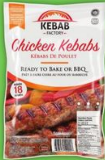
KEBAB FACTORY CHICKEN KEBABS 1.02 KG FROZEN SELECTED VARIETIES

ALL AISLES LEAD HOME KITCHENS OF THE WORLD 2.99 EACH