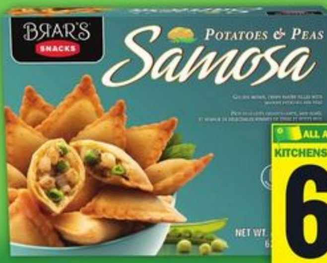
BRAR'S SAMOSAS 624 G FROZEN SELECTED VARIETIES

ALL AISLES LEAD HOME KITCHENS OF THE WORLD 3.99 EACH