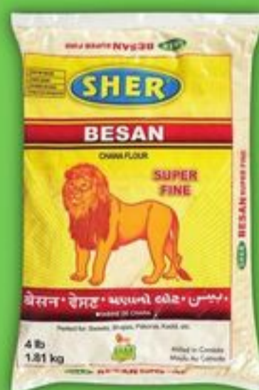
SHER BESAN FLOUR 1.81 KG SELECTED VARIETIES

ALL AISLES LEAD HOME KITCHENS OF THE WORLD 2.99 EACH