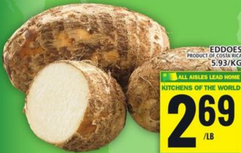
EDDOES PRODUCT OF COSTA RICA 5.93/KG

ALL AISLES LEAD HOME KITCHENS OF THE WORLD 1.99 /LB