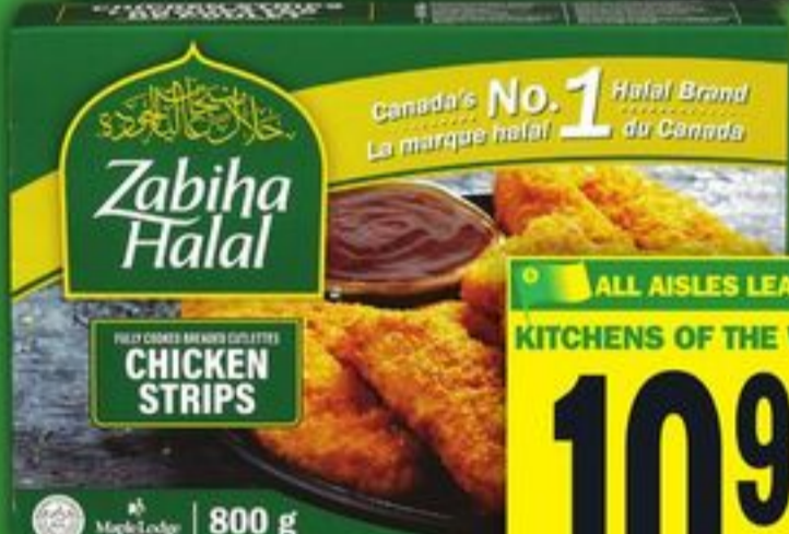
Canada's No. 1 Halal Brand La marque halal du Canada