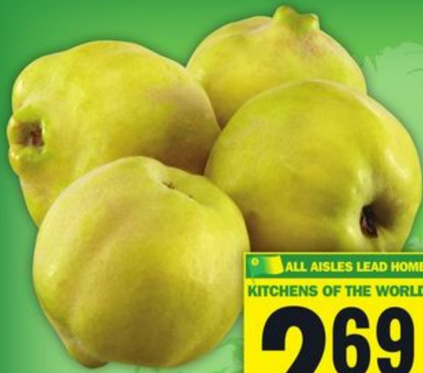
QUINCE PRODUCT OF U.S.A.

ALL AISLES LEAD HOME KITCHENS OF THE WORLD 2.69 EACH