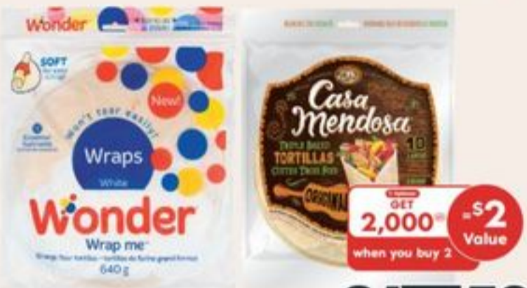
CASA MENDOSA OR WONDER TORTILLAS SELECTED VARIETIES 10 INCH TORTILLAS CASA MENDOSA OU WONDER 20318788_EA/20979626_EA