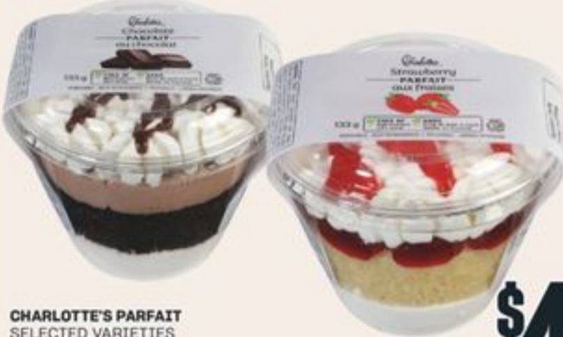
CHARLOTTE'S PARFAIT SELECTED VARIETIES 133/145 G PARFAIT CHARLOTTE'S 21617537_EA/21617592_EA