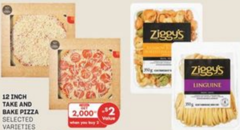
12 INCH TAKE AND BAKE PIZZA SELECTED VARIETIES 510-739 G PIZZA 12 PO CUIRE À LA MAISON 21456393_EA 21456401_EA