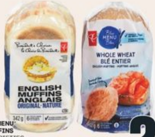
PC® OR BLUE MENU™ ENGLISH MUFFINS SELECTED VARIETIES 6'S MUFFINS ANGLAIS PC™ OU MENU BLEU™ 20810728_EA/21015902_EA