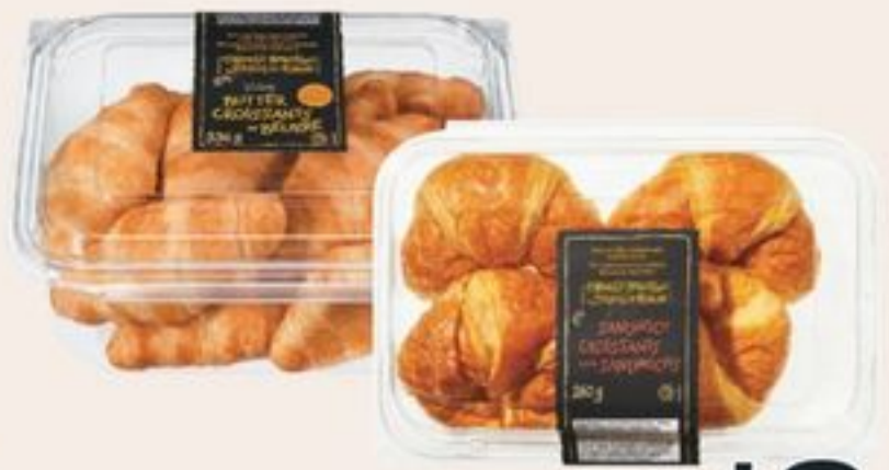
FARMER'S MARKET™ BUTTER CROISSANTS MINI OR SANDWICH 260/336 G CROISSANTS AU BEURRE DÉLICES DU MARCHÉ™ 21032805_EA/21201758_EA