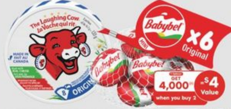
BABY BEL 6'S, LAUGHING COW 12'S OR CHEESE DIPPERS 140 G SELECTED VARIETIES BABYBEL, LA VACHE QUI RIT OU CHEESE DIPPERS 20319107_EA/20574332_EA