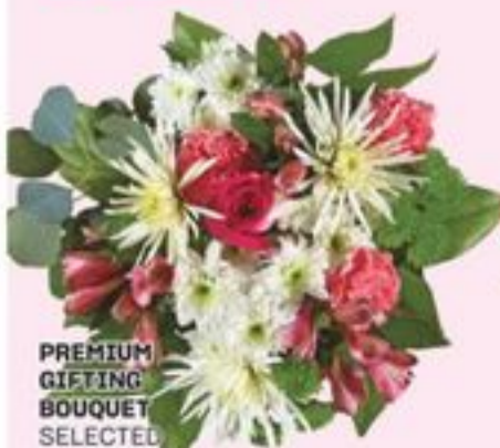
PREMIUM GIFTING BOUQUET SELECTED VARIETIES BOUQUETS-CADEAUX DE QUALITÉ SUPÉRIEURE 21436381_EA 21436382_EA