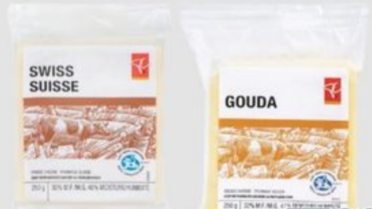
PC® CHEESE BLOCKS SELECTED VARIETIES 250 G BARRES DE FROMAGE PC™ 20770652_EA/20770656_EA