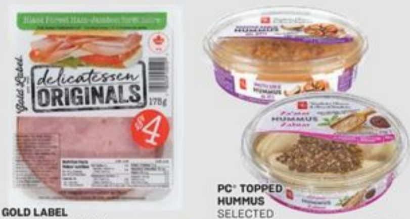
GOLD LABEL SLICED DELI MEAT SELECTED VARIETIES 175 G VIANDES TRANCHÉES GOLD LABEL 21509826_EA