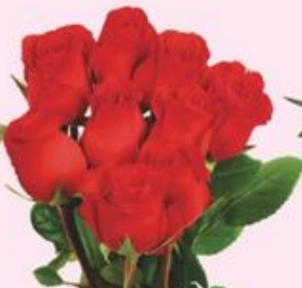
INTERMEDIATE ROSE BUNCH 9 STEM BOUQUET DE ROSES INTERMÉDIAIRE 21586298_EA