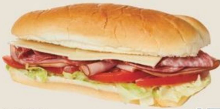
SUB SANDWICH IN-STORE PREPARED BEEF, HAM, TURKEY OR ASSORTED 331/364 G SOUS-MARINS 21623682_EA