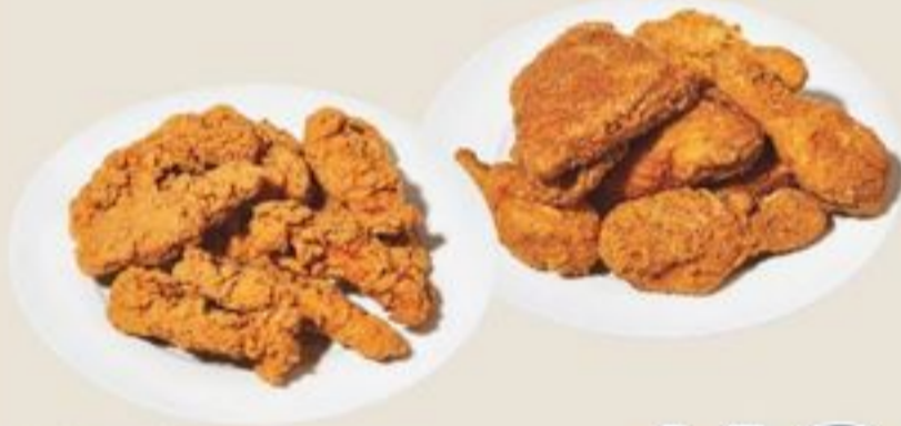
CHICKEN FAVORITES SELECTED VARIETIES SERVED HOT OR CHILLED 320-700 G MORCEAUX PRÉFÉRÉS DE POULET 20137058_EA/20992187_EA

Great to go items plus applicable taxes.