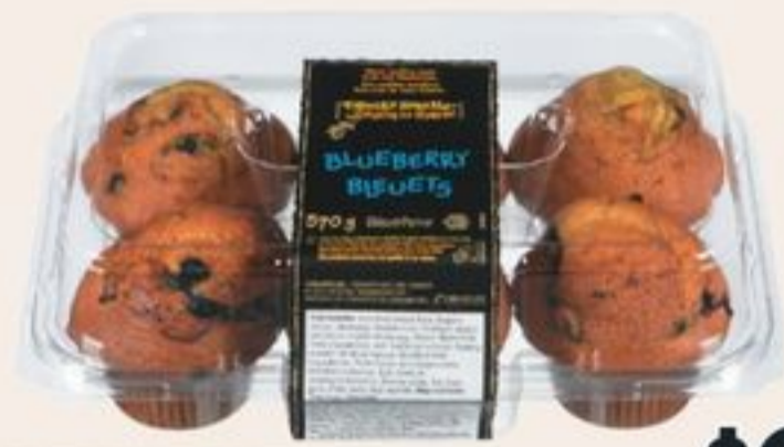
FARMER'S MARKET™ MUFFINS SELECTED VARIETIES 6'S MUFFINS DÉLICES DU MARCHÉ™ 21283356_EA