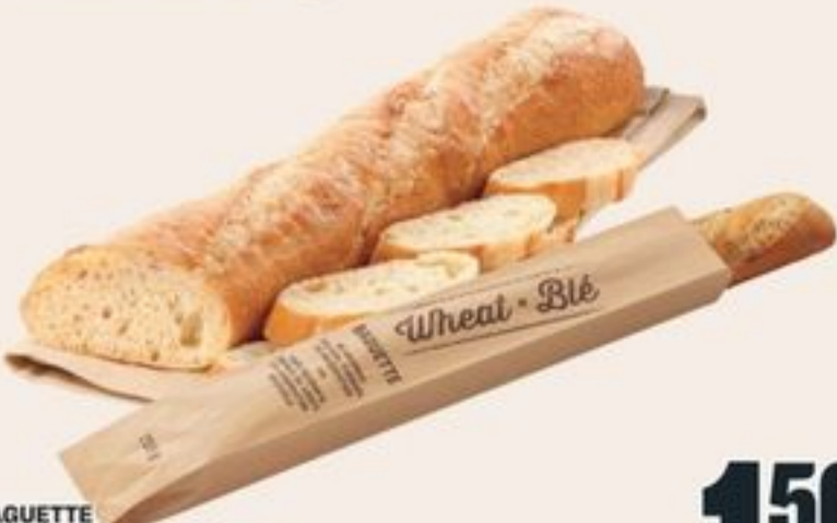
BAGUETTE WHITE OR WHOLE WHEAT 255 G BAGUETTE 21529211_EA/21530097_EA