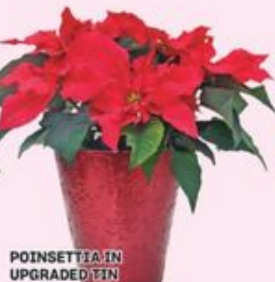
POINSETTIA IN UPGRADED TIN 8 INCH POINSETTIA DANS UN POT DE QUALITÉ SUPÉRIEURE 21615455_EA 20287881_EA