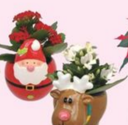
HOLIDAY MINIS MINI-PLANTES DES FÊTES 21194496_EA