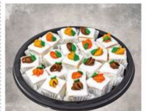
LARGE 20 CT White Almond Petit Fours $24 99