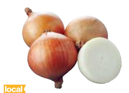
YELLOW ONIONS Grown in Washington

10.99 <sub>••</sub> to eat from the Fish Market SAVE $9.00ea