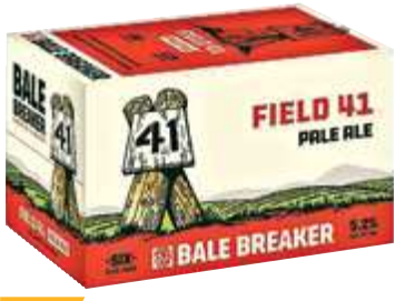
local BALE BREAKER BEER