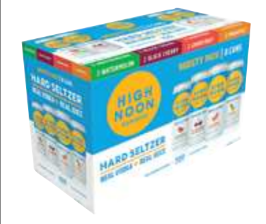
HIGH NOON SELZTERS 8-pack 355 ml