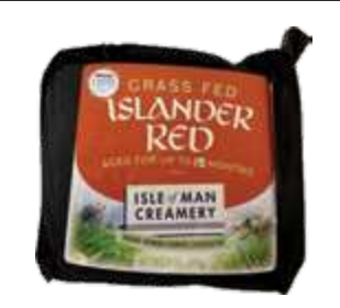
ISLE OF MAN CREAMERY GRASS-FED ISLANDER RED CHEESE SAVE $0.50 6.3 oz