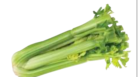
organic ( CELERY

3.99<sub>lb</sub> SHALLOTS Grown in Washington