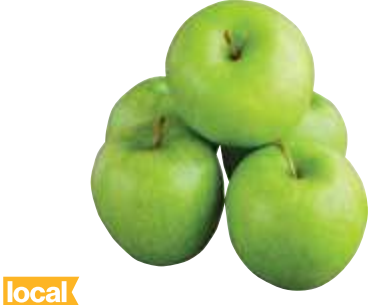
GRANNY SMITH APPLES Grown in Washington