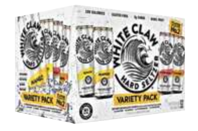
WHITE CLAW SELZTERS 12-pack 12 oz