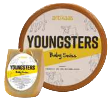
ARTIKAAS BABY SWISS