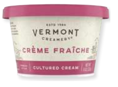
VERMONT CREAMERY CRÈME FRAÎCHE 6.49 8 oz SAVE $0.20