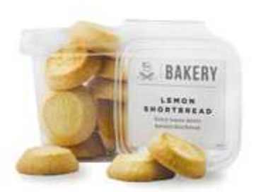
METROPOLITAN MARKET SHORTBREAD COOKIES