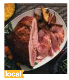
METROPOLITAN MARKET KUROBUTA HALF HAM

NUKUBUIA HALF HAW Bone-in, No added nitrates or nitrites