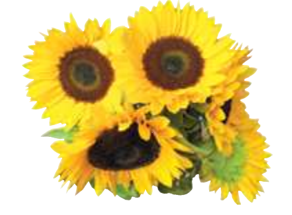
SUNFLOWERS 5-stem bunch