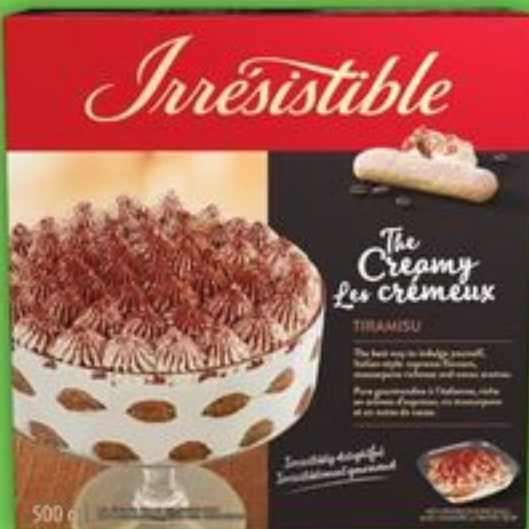
IRRESISTIBLE TIRAMISU 500 G FROZEN

ALL AISLES LEAD HOME KITCHENS OF THE WORLD 19.99 EACH