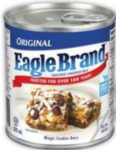
EAGLE BRAND CONDENSED MILK 300 ML SELECTED VARIETIES