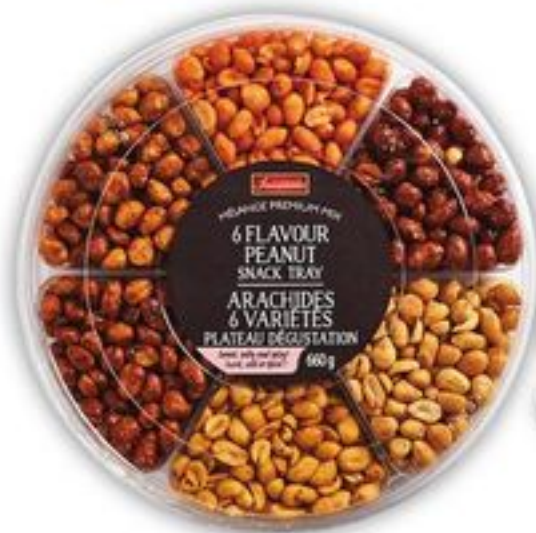
IRRESISTIBLES 6 FLAVOUR PEANUT TRAY 660 G