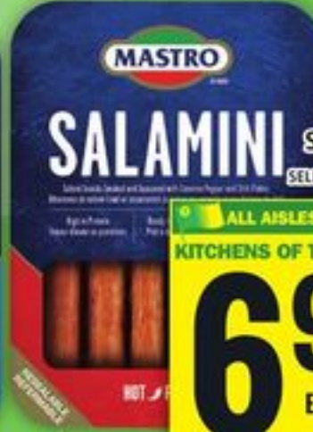
MASTRO SALAMINI HOT 375 G SELECTED VARIETIES

ALL AISLES LEAD HOME KITCHENS OF THE WORLD 6.99 EACH