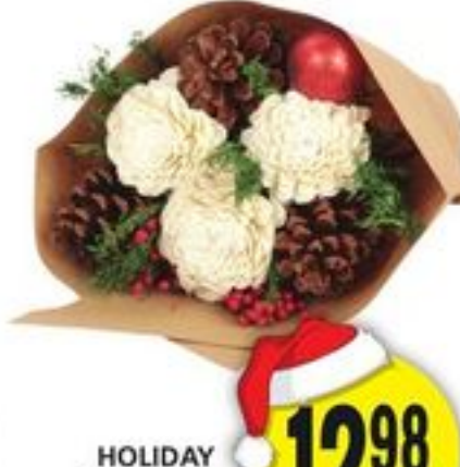
HOLIDAY MIX DRIED BOUQUET ASSORTED MIXES WHILE QUANTITIES LAST