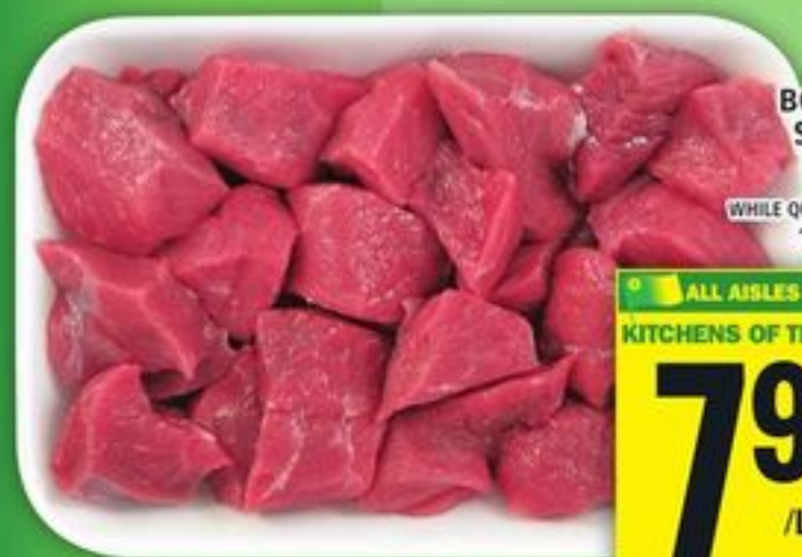
FRESH BONELESS STEWING VEAL GRAIN-FED WHILE QUANTITIES LAST 17.61/KG

ALL AISLES LEAD HOME KITCHENS OF THE WORLD 3.99 EACH