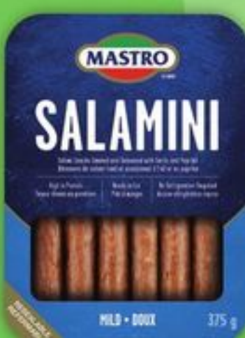
MASTRO SALAMINI MILD • BOLD 375 g

ALL AISLES LEAD HOME KITCHENS OF THE WORLD 7.99 /LB