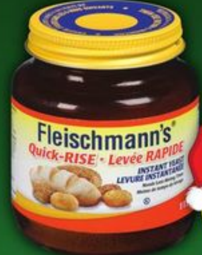
FLEISCHMANN'S INSTANT YEAST 113 G SELECTED VARIETIES