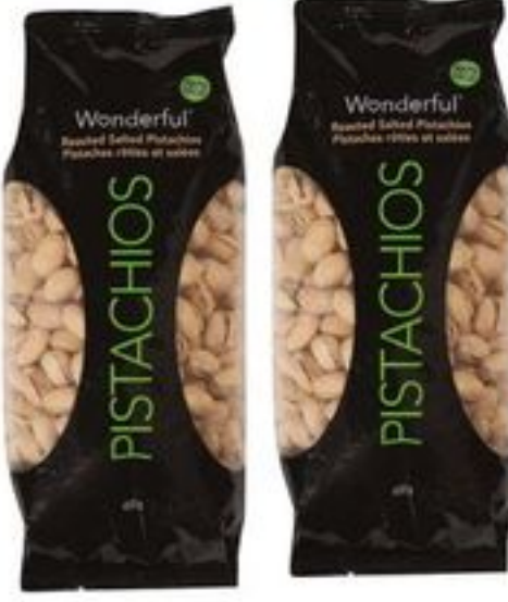
WONDERFUL PISTACHIOS 454 G