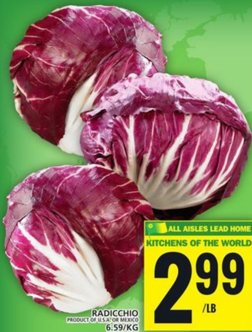
RADICCHIO PRODUCT OF U.S.A. OR MEXICO 6.59/KG

ALL AISLES LEAD HOME KITCHENS OF THE WORLD 2.99 /LB