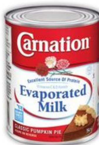
CARNATION MILK 354 ML SELECTED VARIETIES