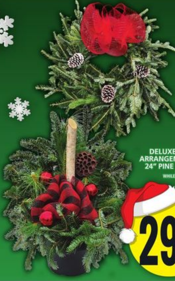
DELUXE HOLIDAY ARRANGEMENTS OR 24" PINE WREATHS SELECTED STORES WHILE QUANTITIES LAST