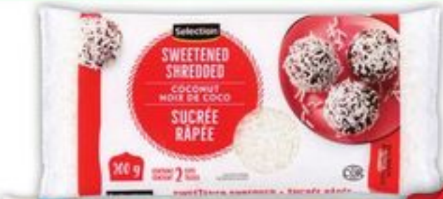
SELECTION COCONUT 300 G SELECTED VARIETIES