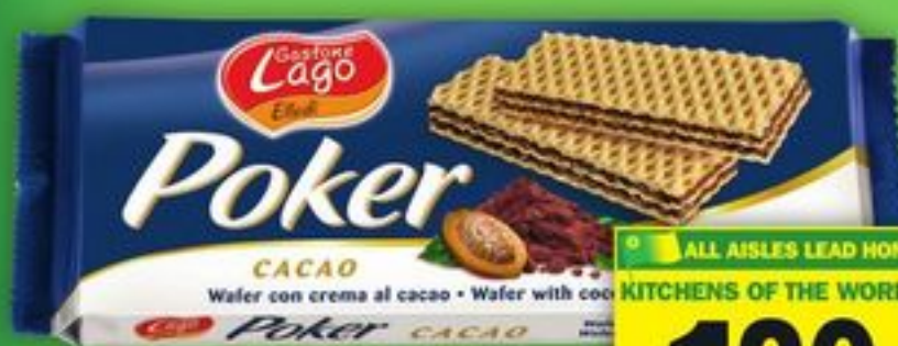
POKER WAFERS 150 G SELECTED VARIETIES

ALL AISLES LEAD HOME KITCHENS OF THE WORLD 5.49 EACH