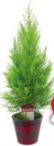
6" LEMON CYPRESS SELECTED VARIETIES WHILE QUANTITIES LAST