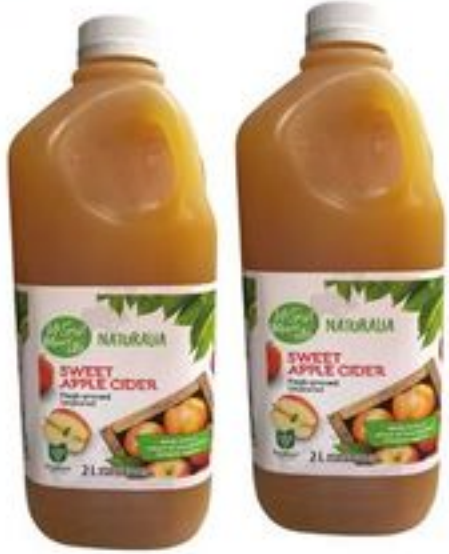
APPLE CIDER PRODUCT OF ONTARIO 2 L