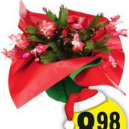
6" ZYGOCACTUS SELECTED VARIETIES WHILE QUANTITIES LAST