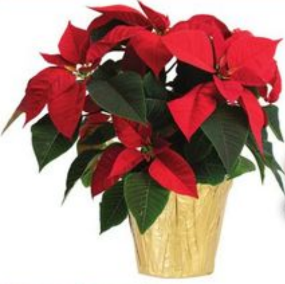
6" POINSETTIA SELECTED VARIETIES WHILE QUANTITIES LAST