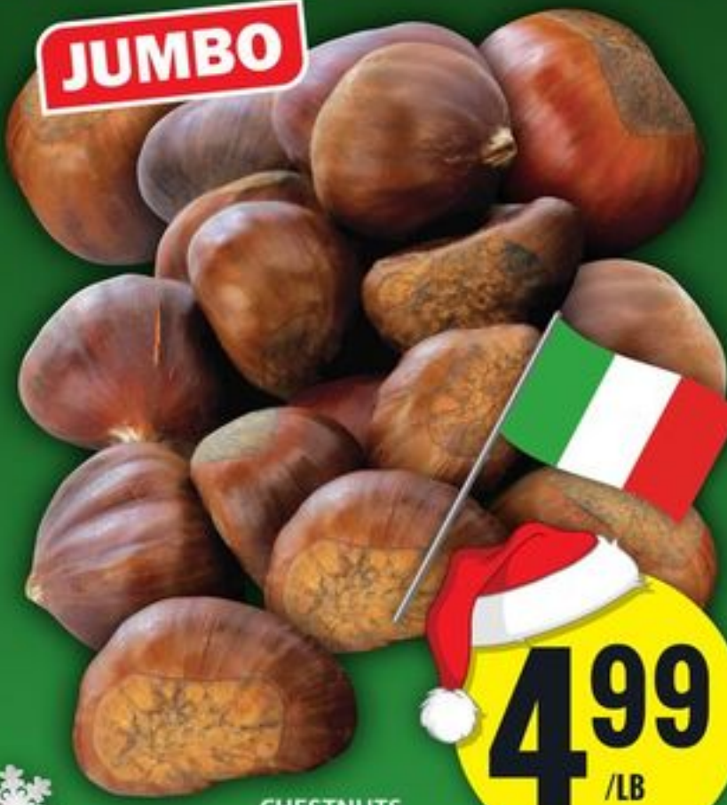
CHESTNUTS PRODUCT OF ITALY 11.00/KG