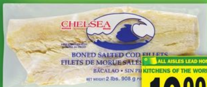
CHELSEA BONED SALTED COD FILLET 908 G SELECTED VARIETIES

ALL AISLES LEAD HOME KITCHENS OF THE WORLD 6.99 EACH