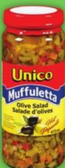
UNICO MUFFULETTA 473 ML SELECTED VARIETIES

ALL AISLES LEAD HOME KITCHENS OF THE WORLD 2.99 EACH