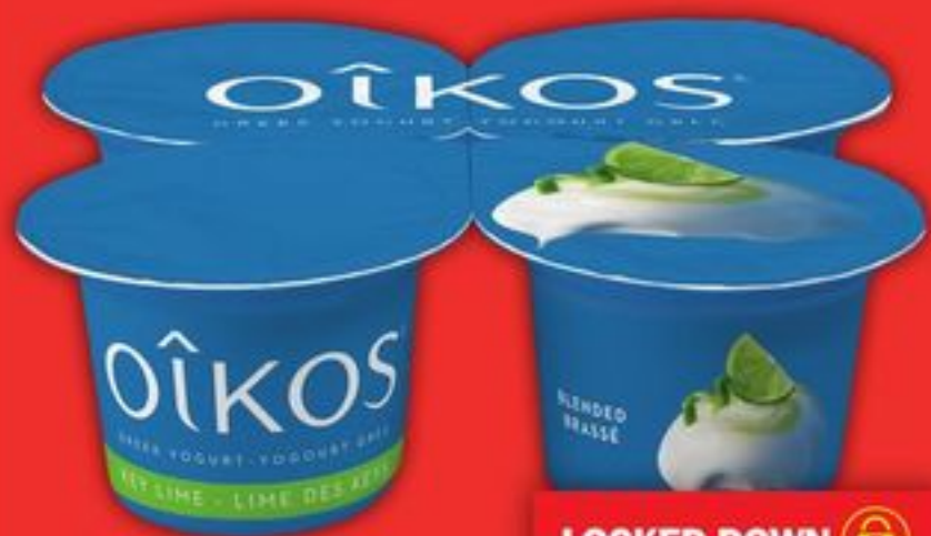
DANONE OIKOS GREEK YOGURT 8 X 100 G SELECTED VARIETIES