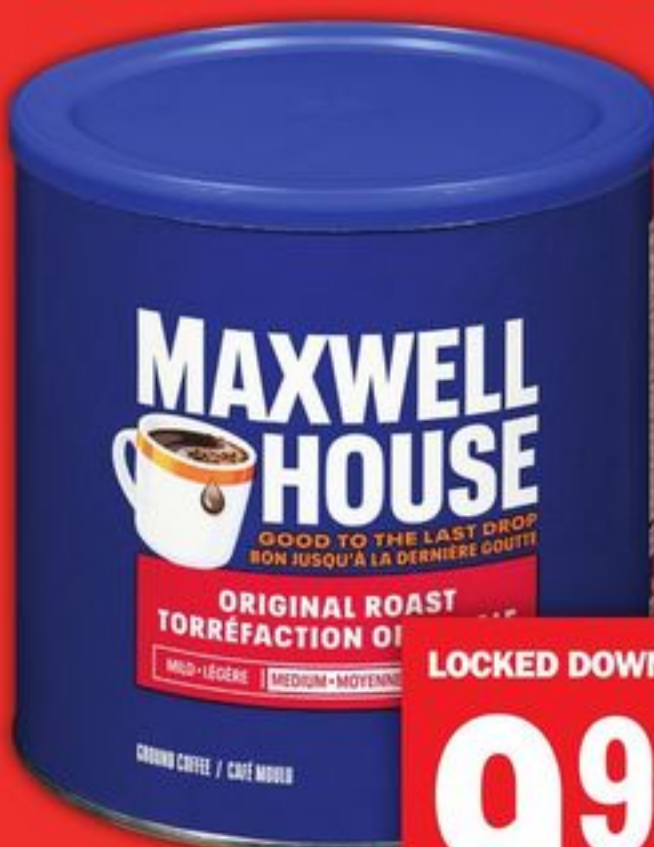
MAXWELL HOUSE GROUND COFFEE 854 - 900 G SELECTED VARIETIES