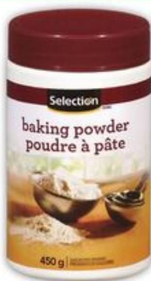
SELECTION BAKING POWDER 450 G SELECTED VARIETIES