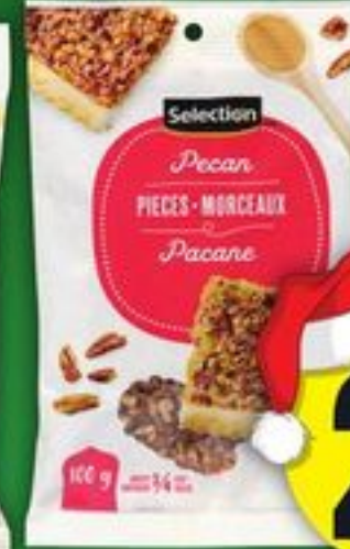
SELECTION BAKING NUTS 100 G SELECTED VARIETIES