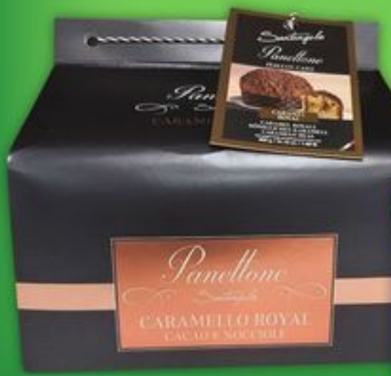
SANTANGELO OR GALUP PANETTONE 750-900 G SELECTED VARIETIES

ALL AISLES LEAD HOME KITCHENS OF THE WORLD 3.29 EACH