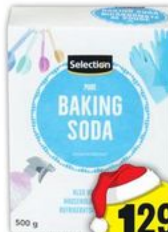
SELECTION BAKING SODA 500 G SELECTED VARIETIES