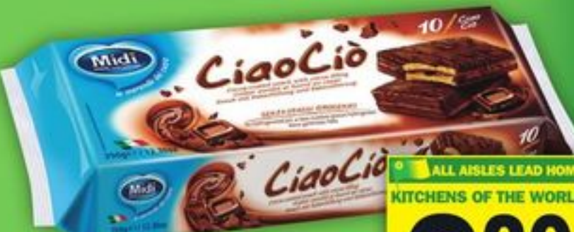
MIDI LOAF CAKES 280-350 G SELECTED VARIETIES

ALL AISLES LEAD HOME KITCHENS OF THE WORLD 1.29 EACH