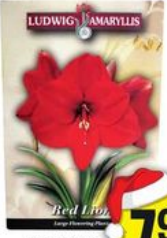
AMARYLLIS BULB KIT SELECTED VARIETIES WHILE QUANTITIES LAST