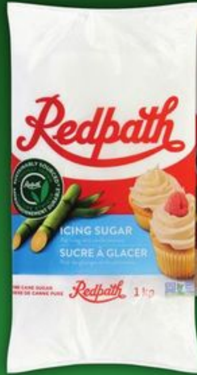
REDPATH BAKING SUGAR 1 KG SELECTED VARIETIES