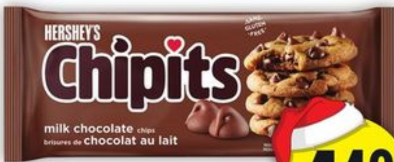
HERSHEY'S CHIPITS 200 - 270 G SELECTED VARIETIES