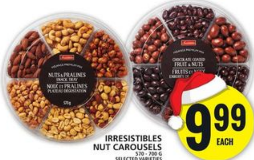
IRRESISTIBLES NUT CAROUSELS 570 - 700 G SELECTED VARIETIES