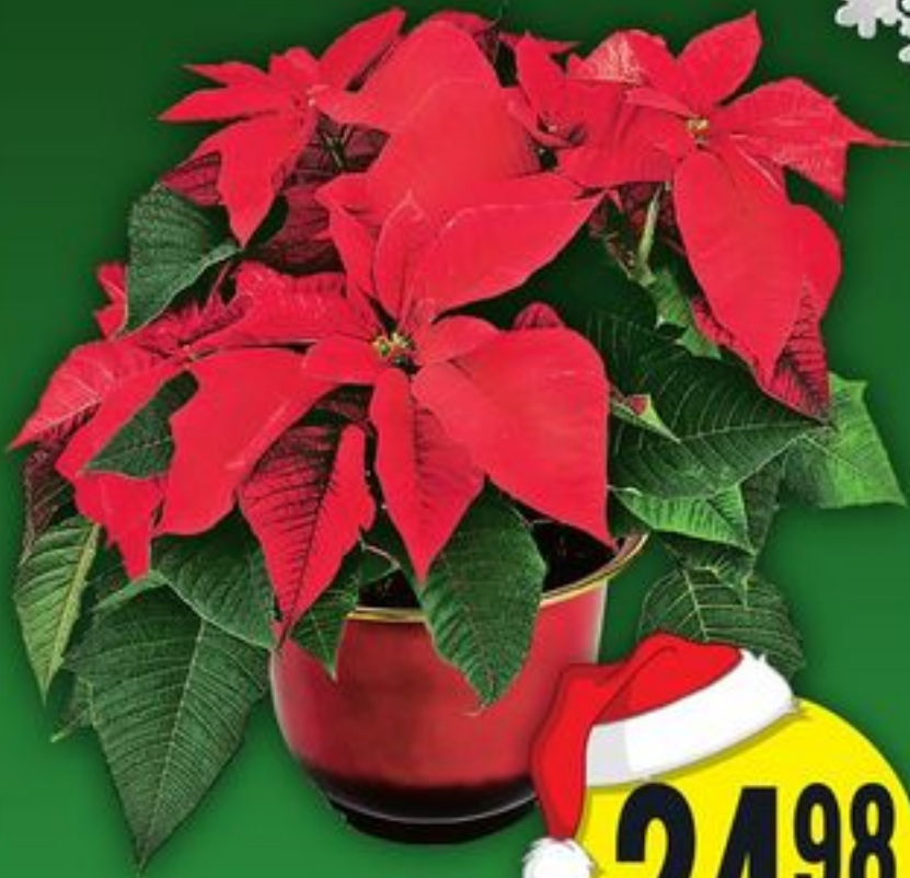
12" POINSETTIAS SELECTED VARIETIES WHILE QUANTITIES LAST