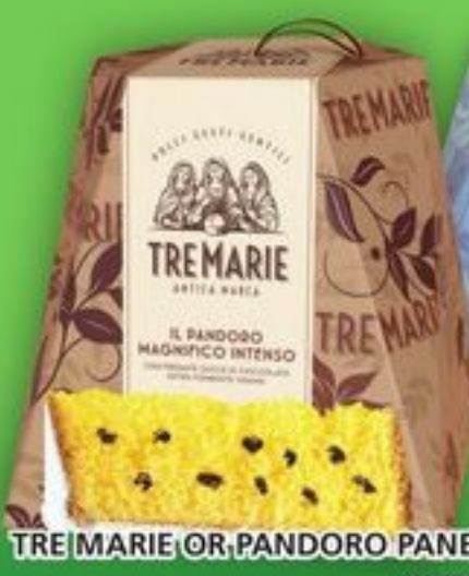
TREMARIE OR PANDORO PANETTONE 800 G/1.1KG SELECTED VARIETIES

ALL AISLES LEAD HOME KITCHENS OF THE WORLD 27.99 EACH