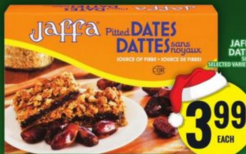
JAFFA DATES 500 G SELECTED VARIETIES