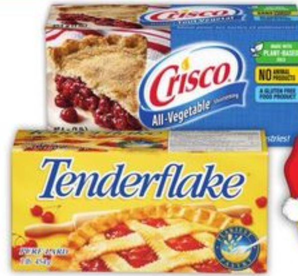
TENDER FLAKE LARD OR CRISCO SHORTENING 454 G SELECTED VARIETIES