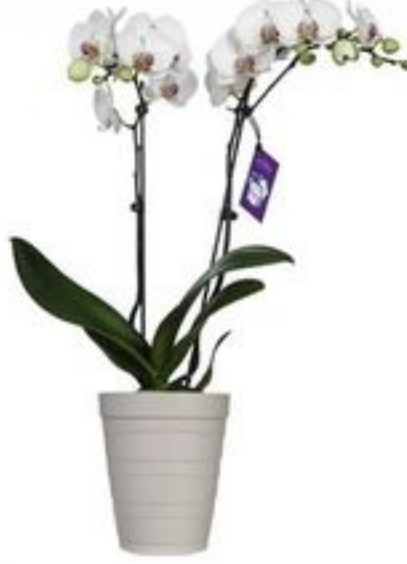
5" PREMIUM ORCHIDS ASSORTED COLOURS WHILE QUANTITIES LAST