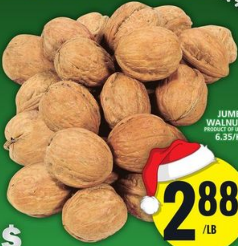
JUMBO WALNUTS PRODUCT OF U.S.A. 6.35/KG