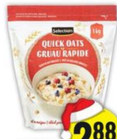
SELECTION QUICK OATS 1 KG SELECTED VARIETIES