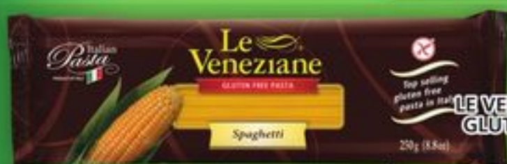
LE VENEZIANE GLUTEN FREE PASTA 250 G SELECTED VARIETIES

ALL AISLES LEAD HOME KITCHENS OF THE WORLD 6.99 EACH