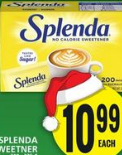
SPLENDA SWEETENER 200 - 275 G SELECTED VARIETIES