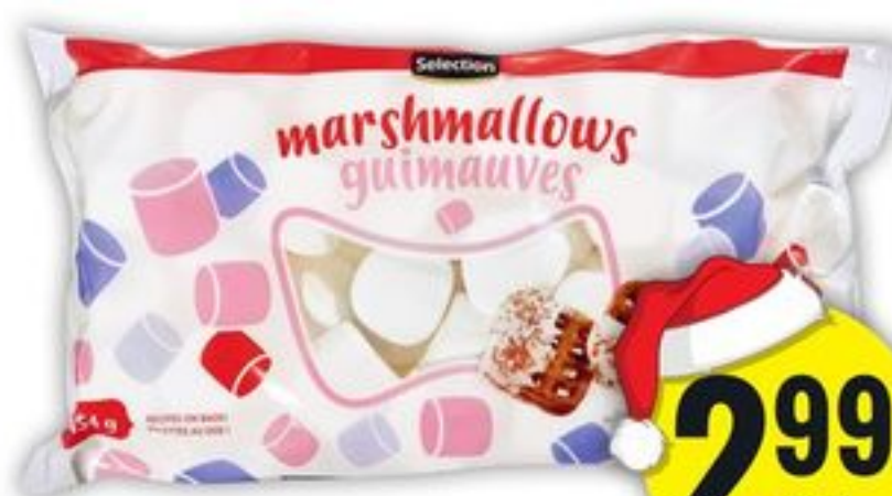
SELECTION MARSHMALLOWS 454 G SELECTED VARIETIES