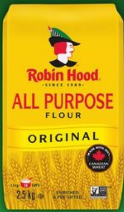
FIVE ROSES OR ROBIN HOOD FLOUR 2.5 KG SELECTED VARIETIES