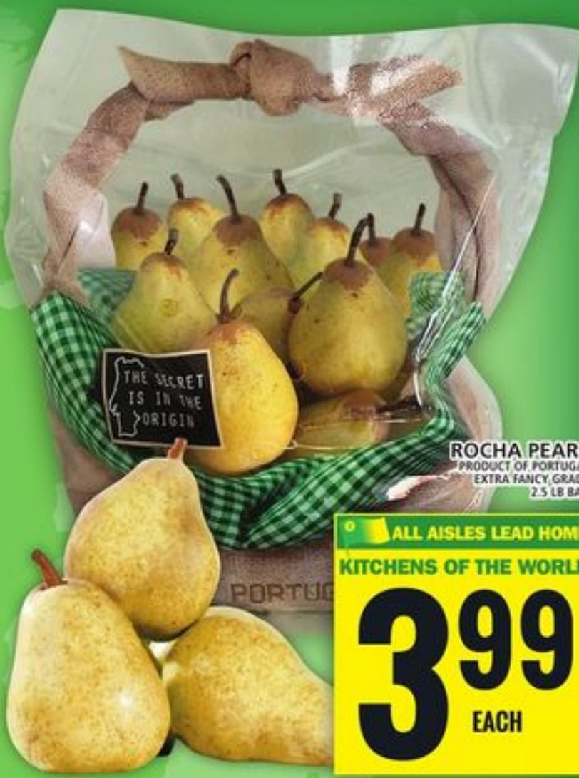
ROCHA PEARS PRODUCT OF PORTUGAL EXTRA FANCY, GRADE 2.5 LB BAG

ALL AISLES LEAD HOME KITCHENS OF THE WORLD 2.99 /LB