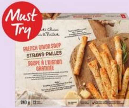
PC® FRENCH ONION SOUP STRAWS FROZEN 240 G 21612011_EA