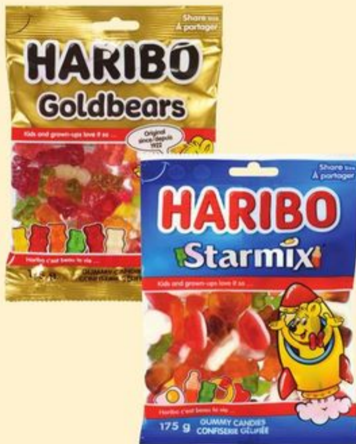
HARIBO GUMMY CANDY SELECTED VARIETIES 170-175 G 21519578_EA/21519517_EA