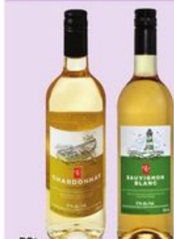
PC® DEALCOHOLIZED WINE SELECTED VARIETIES 750 ML 21045800_EA 21403389_EA