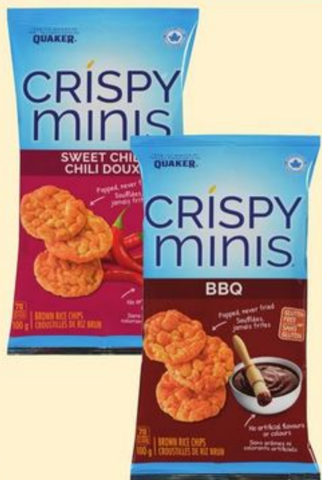
QUAKER CRISPY MINIS OR LARGE RICE CAKES SELECTED VARIETIES 90-173 G 20850854_EA/20850958_EA