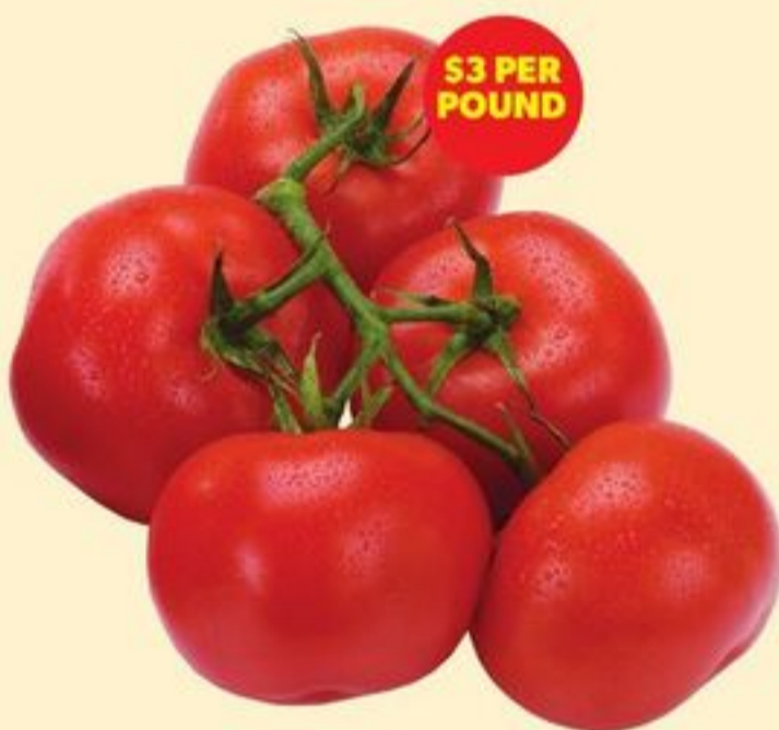
GREENHOUSE TOMATOES ON THE VINE PRODUCT OF CANADA OR MEXICO 6.61/KG 20026703001_KG