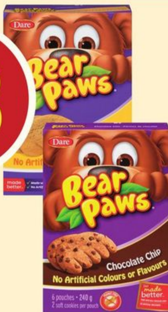
DARE BEAR PAWS COOKIES SELECTED VARIETIES 168-240 G 21080779_EA/21080791_EA