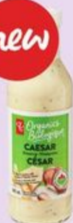
PC® ORGANICS BALSAMIC OR CAESAR DRESSING 350 ML 21609744_EA 21609630_EA