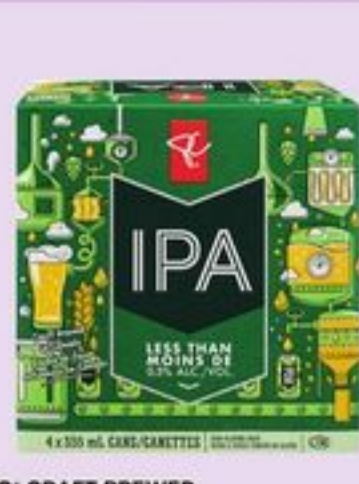
PC® CRAFT BREWED 0.5% LOW-ALCOHOL BEER SELECTED VARIETIES 4X355 ML 21589335_C04 21589408_C04