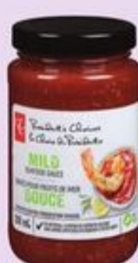
PC® SEAFOOD SAUCE SELECTED VARIETIES 250 ML 20023348001_EA 20023348002_EA