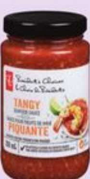
PC® TANGY SAUCE SELECTED VARIETIES 250 ML 20023348001_EA 20023348002_EA