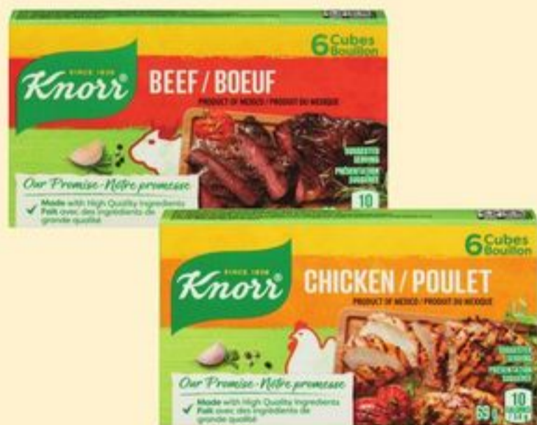
KNORR BOUILLON CUBES SELECTED VARIETIES 39-63 G 20297436001_EA/20297436002_EA