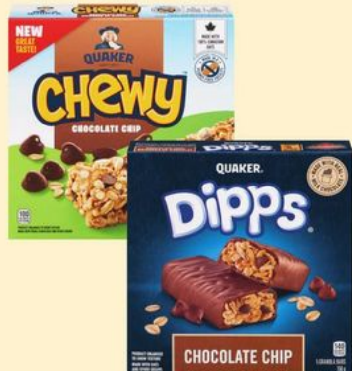
QUAKER DIPPES OR CHEWY GRANOLA BARS SELECTED VARIETIES 120-156 G 21359366_EA/20847582_EA