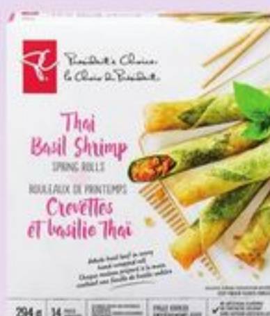
PC® THAI BASIL SHRIMP SPRING ROLLS FROZEN 294 G 20950440_EA