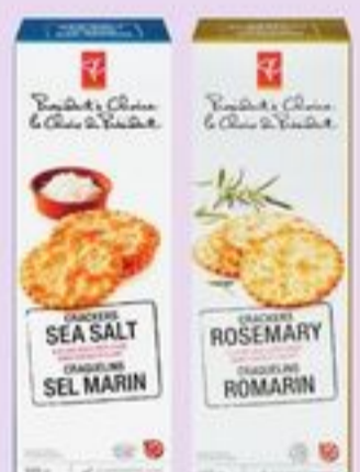
PC® SCALLOPED CRACKERS SELECTED VARIETIES 185 G 20603888002_EA 20603888003_EA