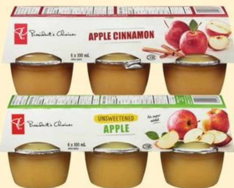
PC® APPLETREET™ APPLE SAUCES SELECTED VARIETIES 6X100 ML 20309701001_EA/20309701002_EA