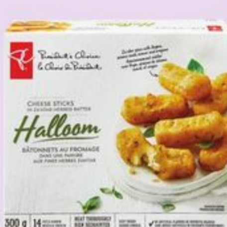
PC® HALLOOM CHEESE STICKS FROZEN 300 G 21393377_EA