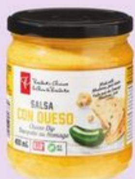
PC® SALSA CON QUESO CHEESE DIP SELECTED VARIETIES 400 ML 21629531_EA