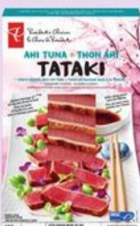
PC® AHI TUNA TATAKI FROZEN 130 G 21616769_EA