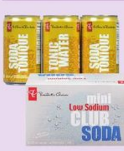
PC® MINI CANS SELECTED VARIETIES 6X222 ML 21094861_C06 21094147_C06