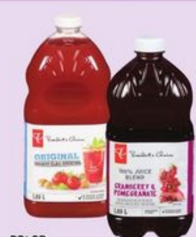
PC® OR BLUE MENU® COCKTAILS SELECTED VARIETIES 1.89 L 20501279_EA 20506849003_EA