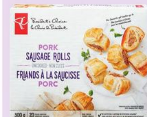
PC® PORK SAUSAGE ROLLS FROZEN 500 G 21538572_EA