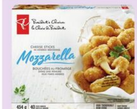
PC® MOZZARELLA CHEESE STICKS FROZEN 454 G 21116020_EA