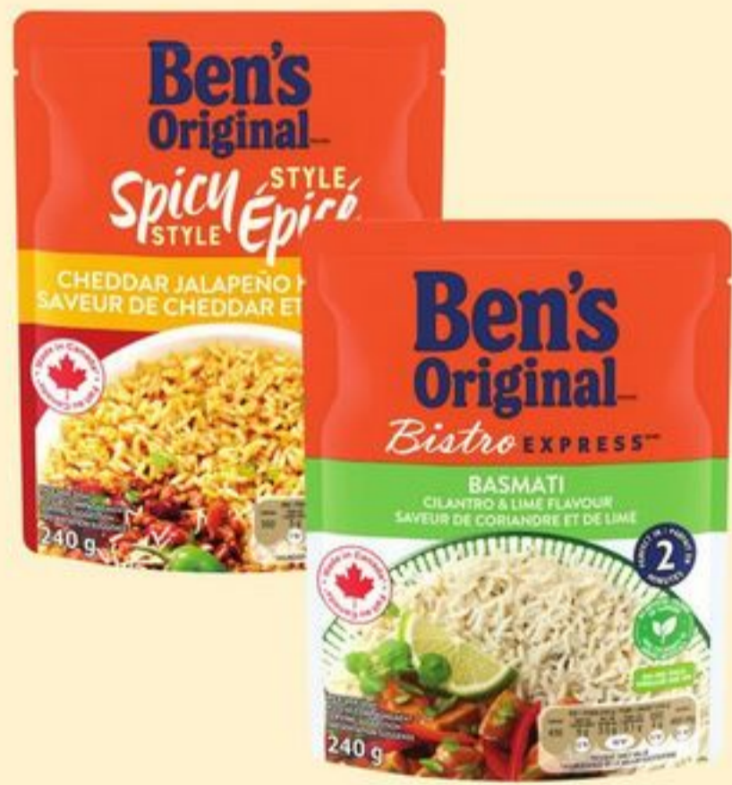
BEN'S BISTRO EXPRESS SELECTED VARIETIES 240/250 G 21404827_EA/21404840_EA