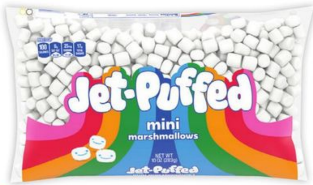
Kraft Jet-Puffed Mini Marshmallows 10-oz. Member Price: $2.00 ea.