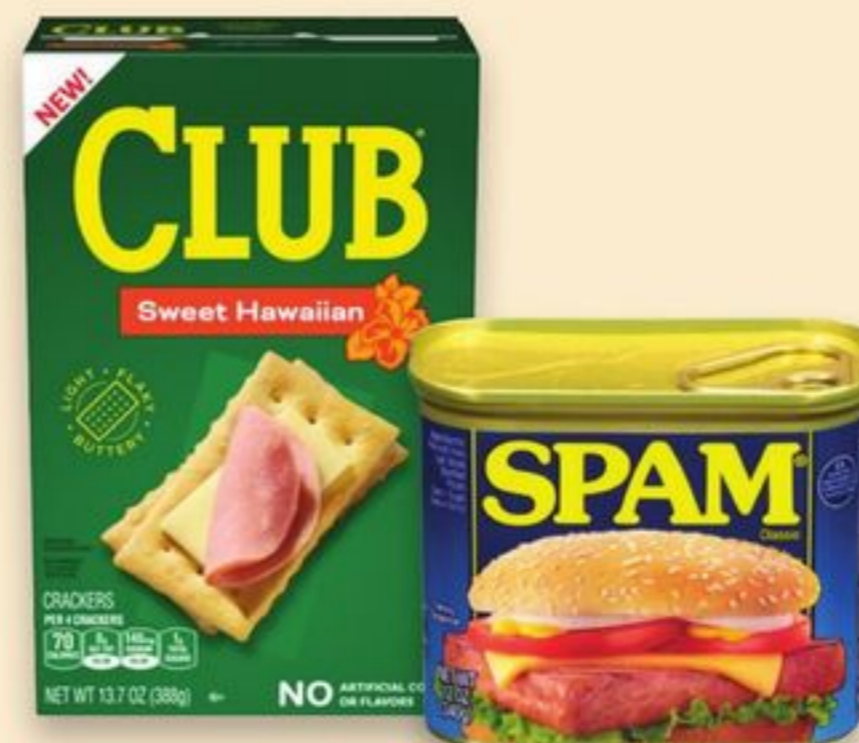
Kellogg's Club Crackers 11 to 13.7-oz. Spam Luncheon Meat 12-oz. Selected varieties.

SAVE $2* when you BUY Kellogg's Club Crackers and Spam Luncheon Meat