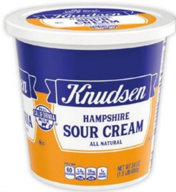
Knudsen Sour Cream 24-oz.