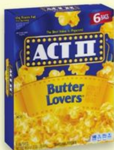
ACT II Butter Popcorn 6-ct. Selected varieties.

Safeway for U® coupon must be downloaded to your account prior to purchase. Must use Safeway for U® account. Expires 12/3/24.