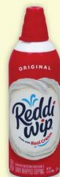
Reddi-Wip Aerosol Whipped Topping 6.5-oz. Selected varieties. Member Price: $3.50 ea.