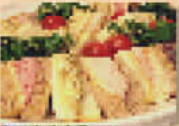
Baked Ham Dinner Starting at $89.99