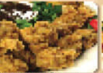
Cornish Hen Dinner Starting at $89.99