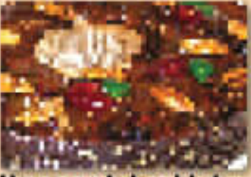
Baked Ham Dinner Starting at $89.99