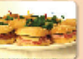
Beef Roast Dinner Starting at $89.99