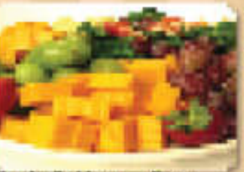
Baked Turkey Dinner Starting at $89.99