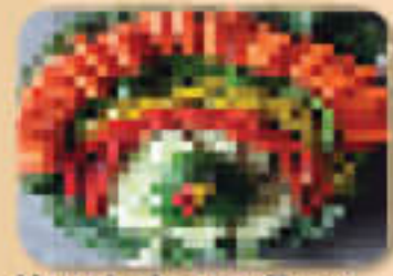
Smoked Turkey Dinner Starting at $89.99

Baked Turkey • Smoked Turkey • Cornish Hen • Baked Glazed Ham • Cornish Hen Beef Roast • Stuffed Chicken Medallions • Rotisserie Chicken • Beef Brisket