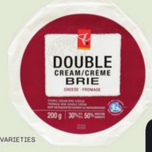
PC® BRIE SELECTED VARIETIES 170-200 G BRIE PC™ 20787327_EA