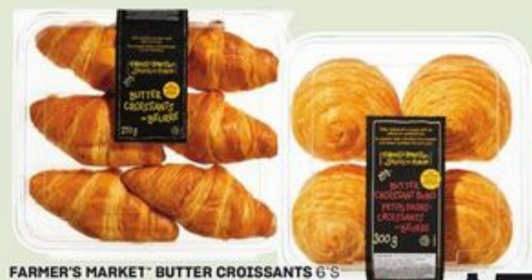
FARMER'S MARKET™ BUTTER CROISSANTS 6'S OR CROISSANT BUNS 4'S SELECTED VARIETIES CROISSANTS AU BEURRE OU PETITS-PAINS CROISSANTS AU BEURRE DÉLICÉS DU MARCHÉ™ 20975943_EA/21577824_EA