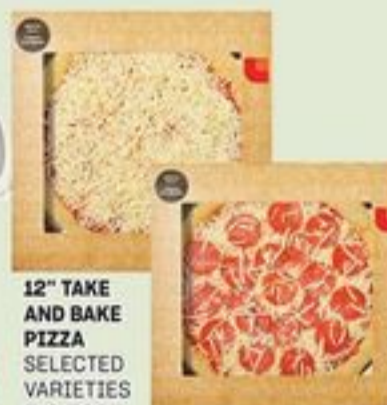
12" TAKE AND BAKE PIZZA SELECTED VARIETIES 510-739 G PIZZA 12 PO CUIRE À LA MAISON 21456393_EA 21456401_EA