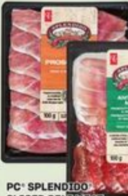
PC® SPLENDIDO™ SLICED DELI MEAT SELECTED VARIETIES 100 G CHARCUTERIES TRANCHÉES PC™ SPLENDIDO™ 21049131_EA/21050405_EA