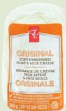
PC® GOAT CHEESE SELECTED VARIETIES 140 G FROMAGE DE CHÈVRE PC™ 20000584_EA/2029631_EA