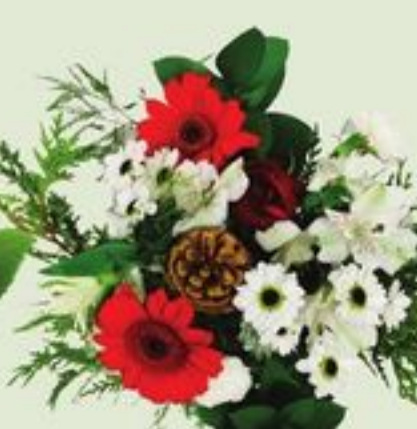
SIGNATURE HOLIDAY BOUQUET BOUQUETS DES FÊTES SIGNATURE 21087812_EA/21087813_EA