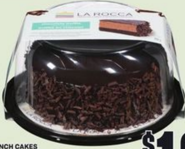
LA ROCCA 6 INCH CAKES SELECTED VARIETIES 600 G GÂTEAUX LA ROCCA, 6 POUCES 20378142_EA