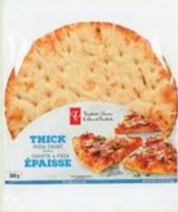
PC® PIZZA CRUST SELECTED VARIETIES 300/440 G CROÛTE À PIZZA PC™ 20896528_EA/21416545_EA