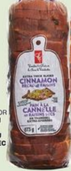
PC® HOT CROSS BUN 8'S OR EXTRA THICK CINNAMON RAISIN BREAD 675 G BRIQUES DE CARÈME OU PAIN À LA CANNELLE AVEC RAISINS EN TRANCHES EXTRA-ÉPAISSES PC™ 20639725_EA/21577822_EA