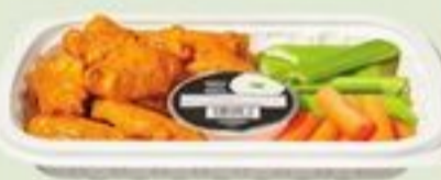
12 PIECE PRE-PACK SAUCED WINGS WITH CELERY AND CARROTS CHILLED 728 G 12 MORCEAUX D'AILES AVEC SAUCE PRÉEMBALLÉS AVEC CÉLERI ET CAROTTES 21532556_EA 21532557_EA