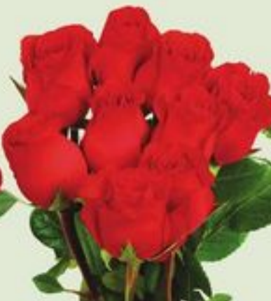
INTERMEDIATE ROSES 9 STEM ROSES INTERMÉDIAIRES 21586298_EA