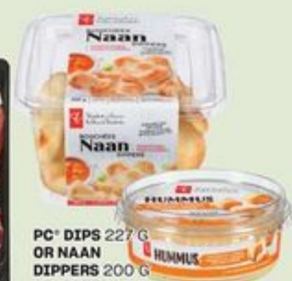
PC® DIPS 227 G OR NAAN DIPPERS 200 G SELECTED VARIETIES TREMPETTES OU BOUCHÉES NAAN PC™ 20584097_EA 21092033_EA