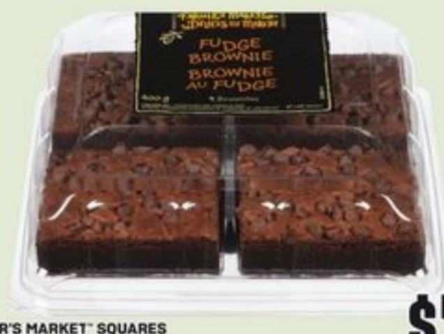
FARMER'S MARKET™ SQUARES SELECTED VARIETIES 400/450 G CARRÉS DÉLICÉS DU MARCHÉ™ 21216499_EA