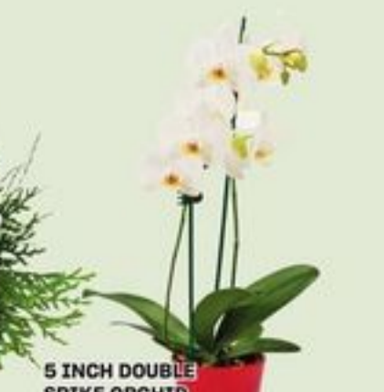
5 INCH DOUBLE SPIKE ORCHID EACH ORCHIDÉE À DEUX TIGES DANS UN POT DE 5 POUCES 20293541_EA