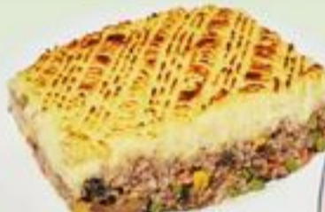
SHEPHERD'S PIE, MEATBALLS, RIB TIPS WITH MASHED POTATOES, MINI SLIDERS OR STUFFED PEPPERS PREPARED IN-STORE 716 G-1.6 KG PÂTE CHINOIS, BOULETTES DE VIANDE, BOUTS DE CÔTES AVEC PURÉE DE POMMES DE TERRE, MINI-BURGERS OU POIVRONS FARCIS 21624670_EA/21624751_EA