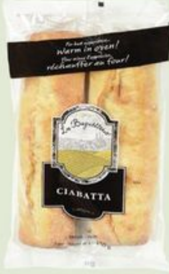
LA BAGUETTERIE DEMI CIABATTA 450 G DEMI-CIABATTA LA BAGUETTERIE 20833789_EA