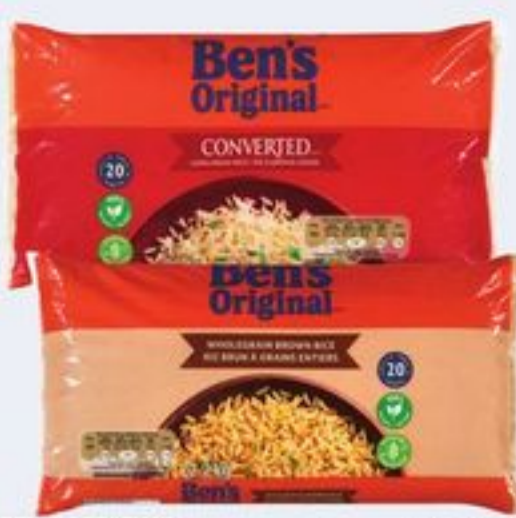
BEN'S ORIGINAL CONVERTED, WHOLE GRAIN OR LONG GRAIN RICE SELECTED VARIETIES 1.6/2.2 KG 21535549_EA 21535571_EA