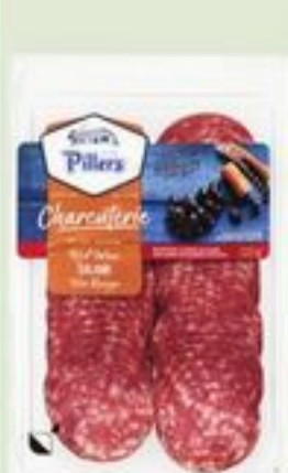
PILLER'S SLICED MEATS 125 G OR CASTELLO HAVARTI, CHEDDAR OR BLUE CHEESE 125-200 G SELECTED VARIETIES 20428574_EA 20574963_EA

GET 2,000 + - $2 Value when you spend "10" on