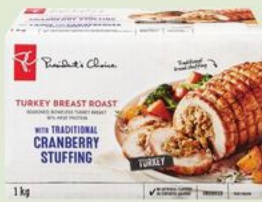
PC ® TURKEY STUFFED ROAST FROZEN 1 KG 20822446_EA