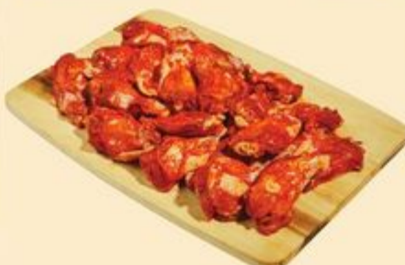
PC® WORLD OF FLAVOURS™ SPLIT CHICKEN WINGS BUFFALO AIR CHILLED, FAMILY SIZE 14.53/KG 21454262_KG