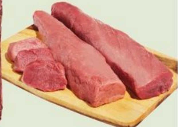
PORK TENDERLOIN CRYOVAC 2'S 8.80/KG 20854535_EA