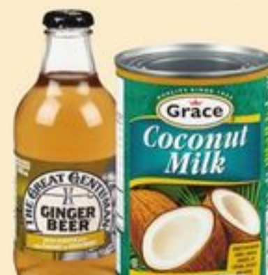
THE GREAT GENTLEMAN DRINKS 250 ML OR GRACE COCONUT MILK 400 ML SELECTED VARIETIES 20047774_EA/21374081_EA