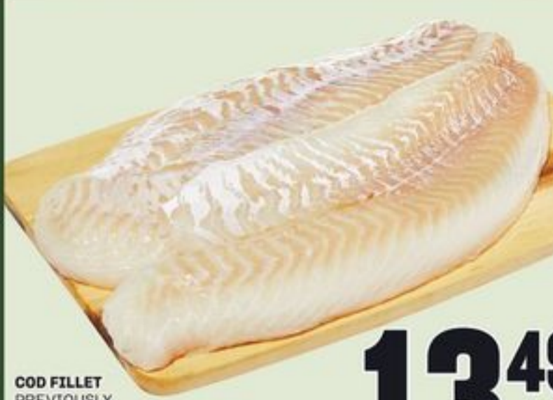
COD FILLET PREVIOUSLY FROZEN 29.74/KG 21210093_KG