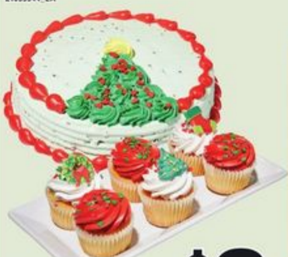
HOLIDAY THEME SINGLE LAYER CAKES OR CUPCAKES WHITE OR CHOCOLATE 6'S 21607143_EA/21642689_EA