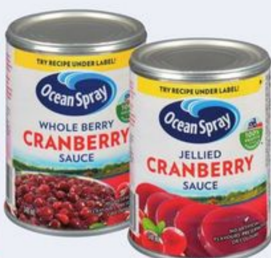
OCEAN SPRAY CRANBERRY SAUCE WHOLE OR JELLIED 348 ML 20022893001_EA/20022893002_EA