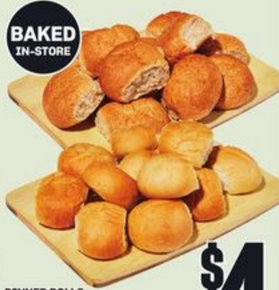
DINNER ROLLS WHITE OR WHEAT 12'S 21392649_EA/21392192_EA