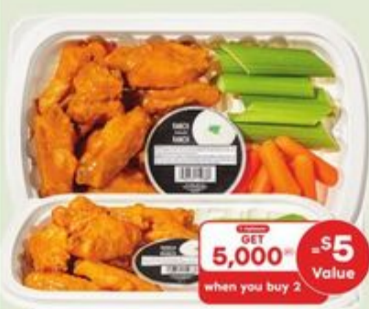
12 PIECE PRE-PACK SAUCED WINGS WITH CELERY AND CARROTS CHILLED 728 G 21532565_EA 21532557_EA