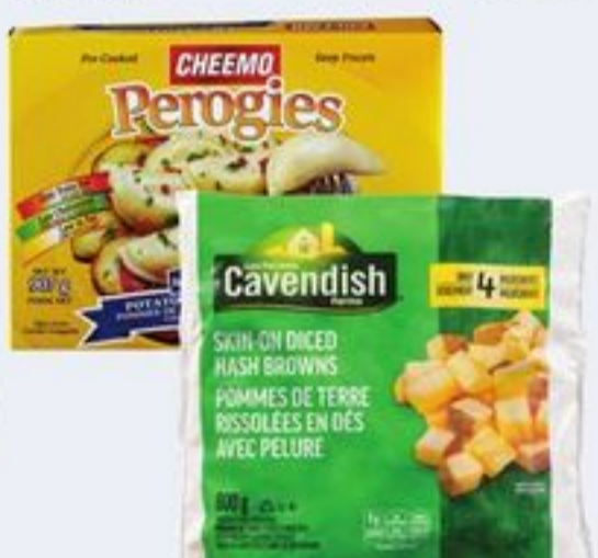
CHEEMO PEROGIES 745-907 G OR CAVENDISH HASHBROWNS 800 G SELECTED VARIETIES FROZEN 20527369_EA/21604103_EA