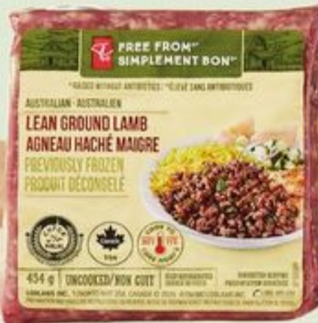
PC ® FREE FROM GROUND LAMB 454 G 21352008_EA