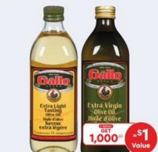
GALLO EXTRA VIRGIN OR LIGHT OLIVE OIL SELECTED VARIETIES 1 L 20069755_EA 20105368_EA