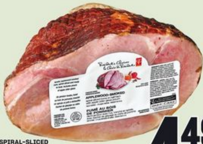
PC ® SPIRAL-SLICED BONE-IN HALF HAM APPLEWOOD OR HICKORY SMOKED 8.80/KG 20857240_KG