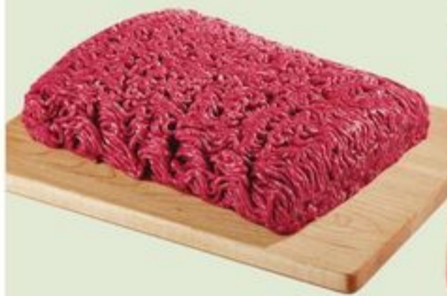
LEAN GROUND BEEF FAMILY SIZE 15.43/KG 20805731_KG