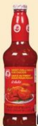
COCK BRAND SWEET CHILLI SAUCE 650 ML 20149074_EA