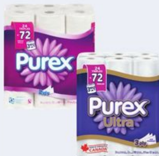
PUREX BATHROOM TISSUE SELECTED VARIETIES 24-72 ROLLS 21189854_EA/21443672_EA