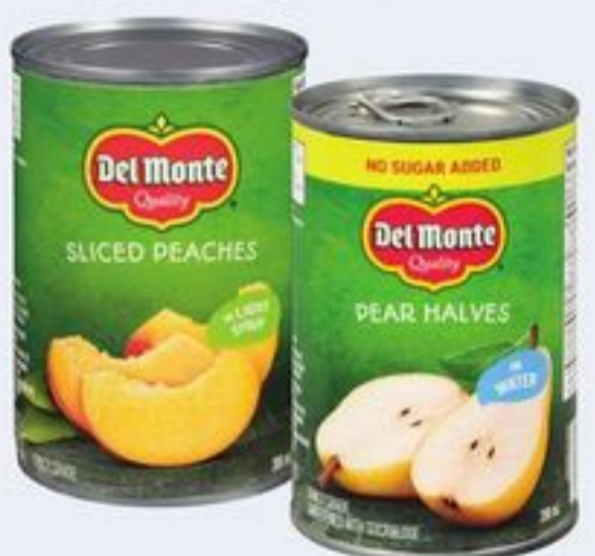
DEL MONTE CANNED FRUIT SELECTED VARIETIES 398 ML 20109862_EA/20296567008_EA