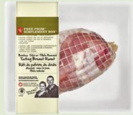
PC ® FREE FROM ™ TURKEY DOUBLE BREAST ROAST 21.99/KG 21124822_KG