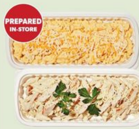
IN-STORE PREPARED PASTA TRAY 1-1.2 KG 21395979_EA 21630204_EA