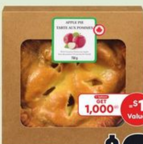
8 INCH PIE SELECTED VARIETIES 635-750 G 21297475_EA