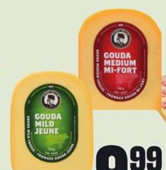
HENRI WILLIG GOUDA 350 G 21345046_EA