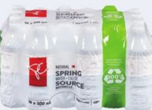
PC® SPRING WATER 24X500 ML 20137898_C24