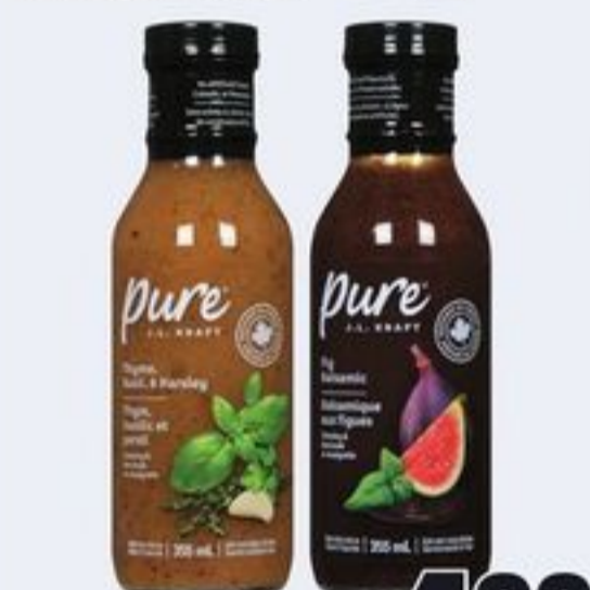
KRAFT PURE SALAD DRESSING 355 ML 21581628_EA