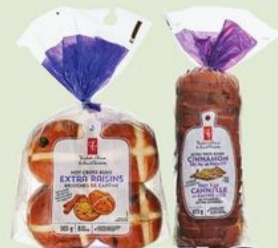
PC ® HOT CROSS BUN OR EXTRA THICK CINNAMON RAISIN BREAD 565/675 G 20639729_EA 21577822_EA