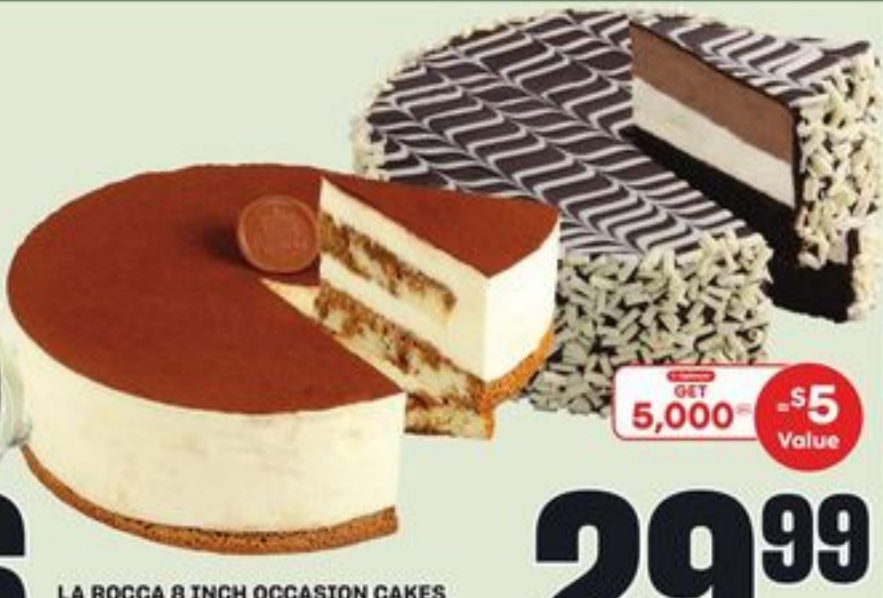
LA ROCCA 8 INCH OCCASION CAKES SELECTED VARIETIES 1.1-1.7 KG 21496165_EA/21624336_EA