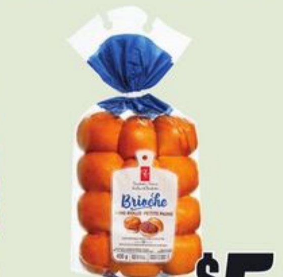
PC ® BRIOCHE MINI ROLLS 400 G 21410779_EA