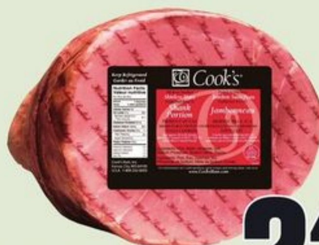
COOK'S PORTION HAM SHANK OR BUTT 5.49/KG 20555641_KG