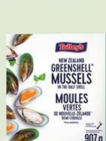
TALLEY'S NEW ZEALAND GREENSHELL MUSSELS FROZEN 907 G 21557953_EA