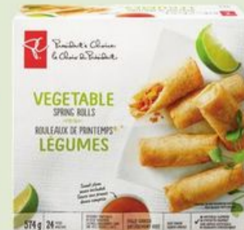
PC ® VEGETABLE SPRING ROLLS FROZEN 574 G 20698096_EA