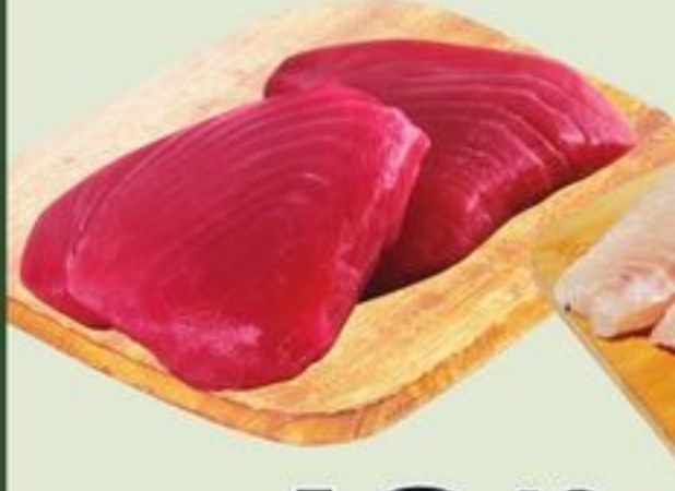
YELLOWFIN TUNA STEAKS PREVIOUSLY FROZEN 29.74/KG 21205360_KG