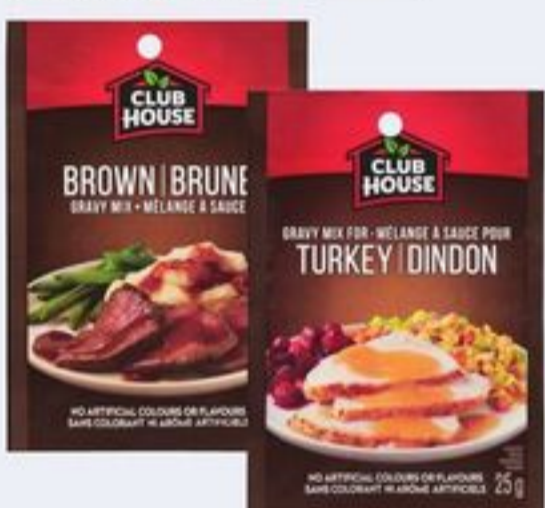
CLUB HOUSE GRAVY OR DRY SAUCE MIXES SELECTED VARIETIES 21-47 G 20302816001_EA 20302816004_EA