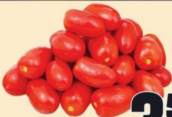
ROMA TOMATOES PRODUCT OF CANADA, MEXICO OR U.S.A. 7.72/KG 29143381001_KG