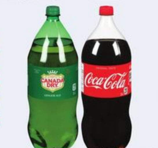
COCA-COLA OR CANADA DRY SOFT DRINKS SELECTED VARIETIES 2 L 20316026002_EA