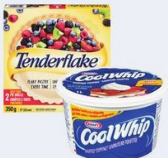
TENDERFLAKE PASTRY 255-397 G OR COOL WHIP DESSERT TOPPING 1 L SELECTED VARIETIES FROZEN 20030369001_EA/20303840001_EA