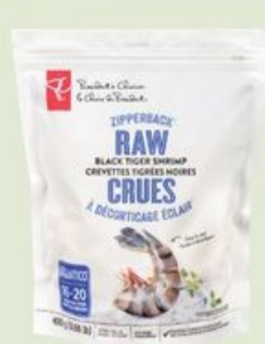
PC® BLACK TIGER SHRIMP RAW ZIPPERBACK® 16-20 PER LB 400 G FROZEN 20801192_EA