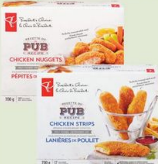
PC ® PUB RECIPE ™ OR GLUTEN-FREE CHICKEN SELECTED VARIETIES FROZEN 600/700 G 21201320_EA/21201321_EA