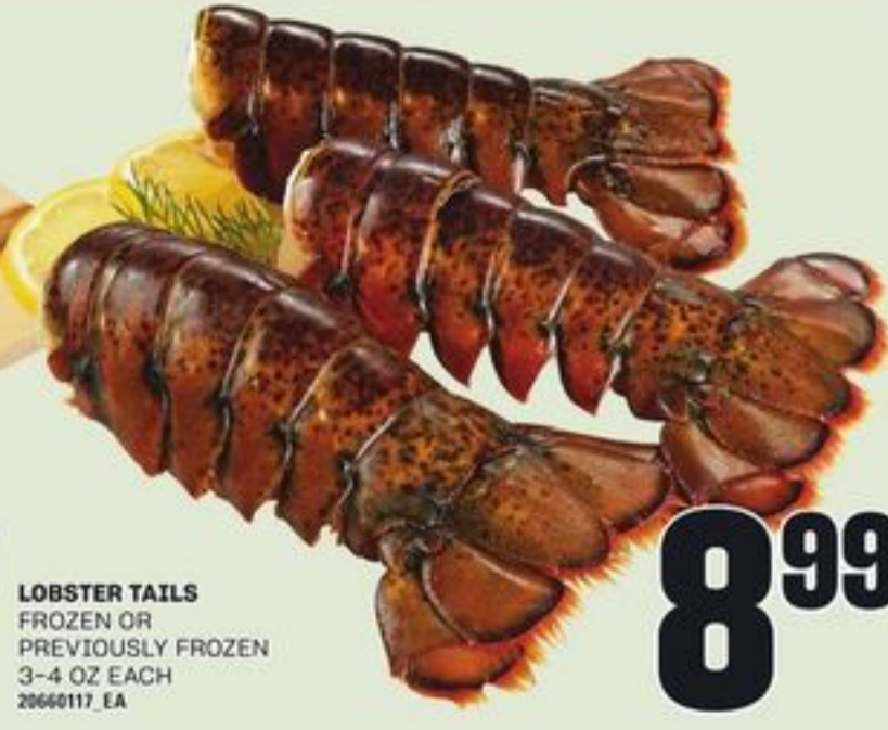
LOBSTER TAILS FROZEN OR PREVIOUSLY FROZEN 3-4 OZ EACH 20660117_EA