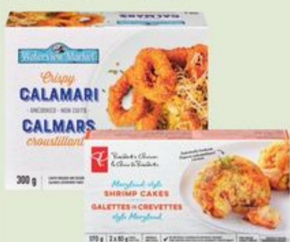
PC® MARYLAND-STYLE SHRIMP CAKES 170 G OR WATERVIEW MARKET CRISPY CALAMARI UNCOOKED 300 G FROZEN 21334615_EA 21454797_EA