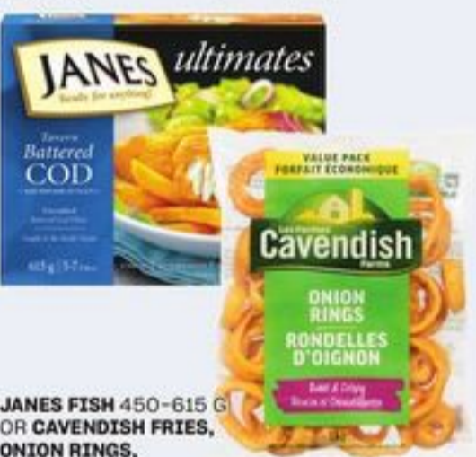
JANES FISH 450-615 G OR CAVENDISH FRIES, ONION RINGS, WEDGES OR HASHBROWNS 1-2.25 KG SELECTED VARIETIES FROZEN 20048538_EA 20827761_EA