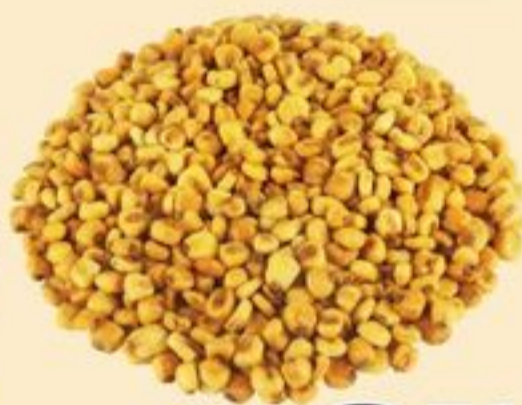
TOASTED CORN NUTS BBQ 2.50/100 G 21564328_KG