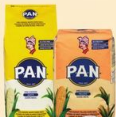
PAN YELLOW OR WHITE FLOUR 1 KG 20945695_EA 20945705_EA