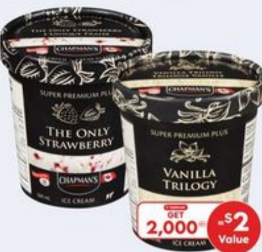
CHAPMAN'S SUPER PREMIUM PLUS ICE CREAM SELECTED VARIETIES FROZEN 500 ML 21511087_EA/21511200_EA