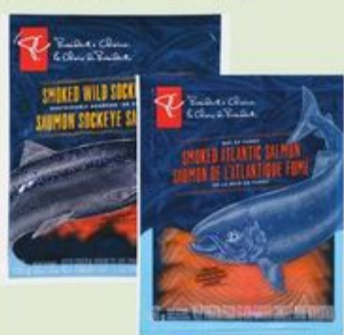
PC® SMOKED SALMON SELECTED VARIETIES FROZEN 125/150 G 20055009_EA 20108286_EA