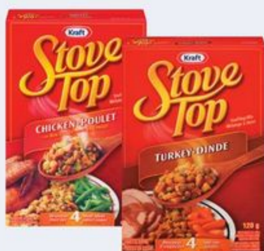
STOVE TOP STUFFING SELECTED VARIETIES 120 G 2009598001_EA/20310507001_EA