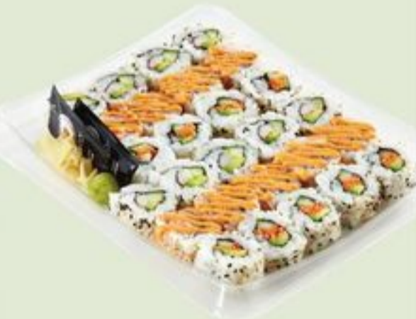
BENTO SUSHI FAMILY PACK SELECTED VARIETIES 545-675 G 20793972_EA