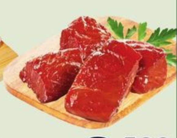
SMOKED SALMON NUGGETS PREVIOUSLY FROZEN 48.48/KG 21513259_KG