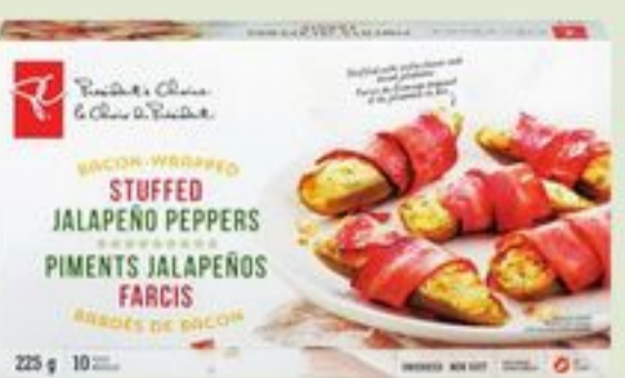
PC ® BACON WRAPPED STUFFED JALAPENO PEPPERS FROZEN 225 G 21048989_EA