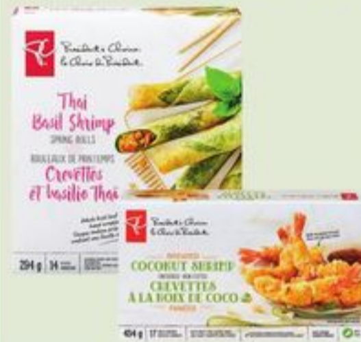
PC® SHRIMP APPETIZERS SELECTED VARIETIES FROZEN 340-454 G 20135874_EA 20950440_EA