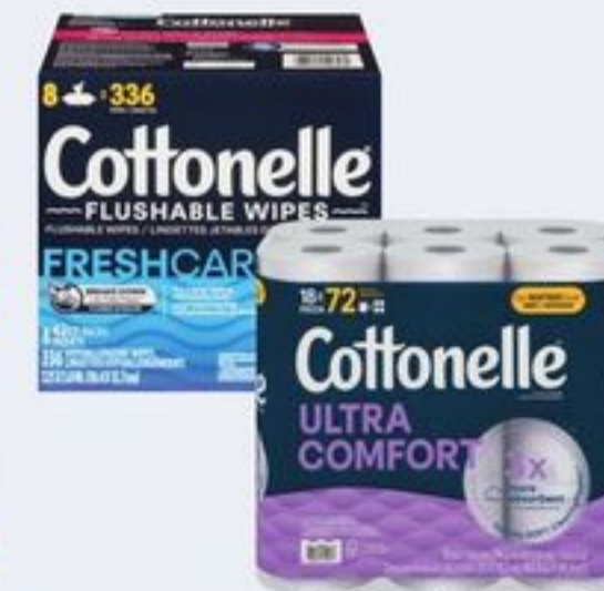
COTTONELLE BATHROOM TISSUE 18-72 ROLLS OR FLUSHABLE WIPES 8'S SELECTED VARIETIES 21315428_EA/21594688_EA