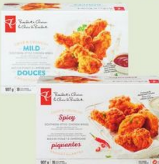
PC ® WINGS SELECTED VARIETIES, FROZEN 700-907 G 20708932_EA/20708933_EA