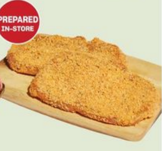
BREADED PORK LOIN SCHNITZEL 300 G 21588065_EA