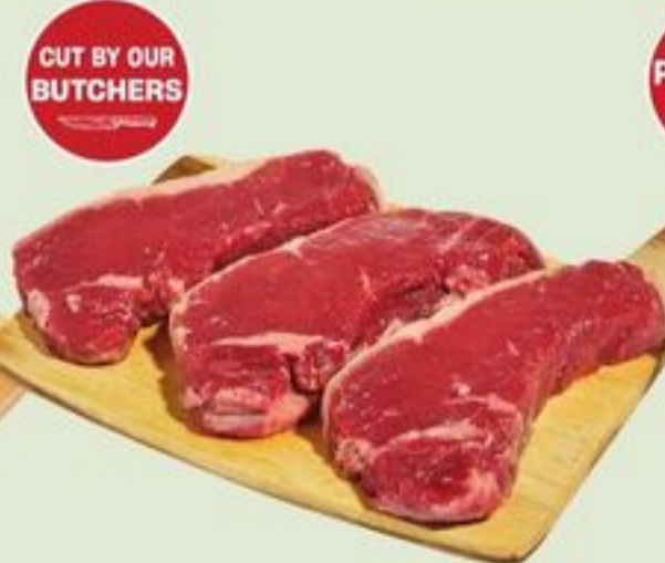
WEST STRIPIOIN GRILLING STEAK FAMILY SIZE, CUT FROM CANADA AAA GRADE WESTERN BEEF 41.87/KG 20821910_KG