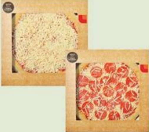
12" TAKE AND BAKE PIZZA SELECTED VARIETIES 510-739 G 21456393_EA 21456401_EA