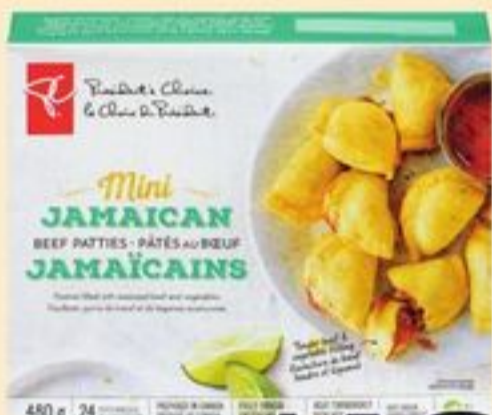
PC® MINI JAMAICAN BEEF PATTIES FROZEN 480 G 20901459_EA