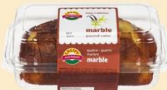
CRISPY POUND CAKE SELECTED VARIETIES 386 G 20814080_EA/21623444_EA

Y-Optimum Members-Only Price 2 99 Non-members 3 99