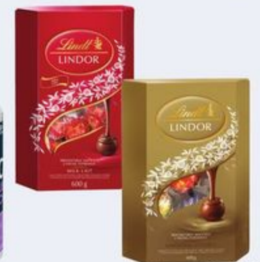
LINDT CORNET SELECTED VARIETIES 600 G 20215793001_EA 20215793002_EA