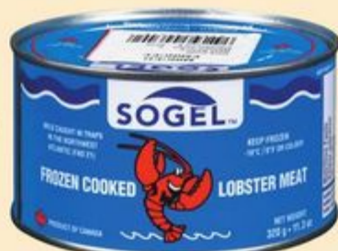
SOGEL COOKED LOBSTER MEAT FROZEN 320 G 20959921_EA