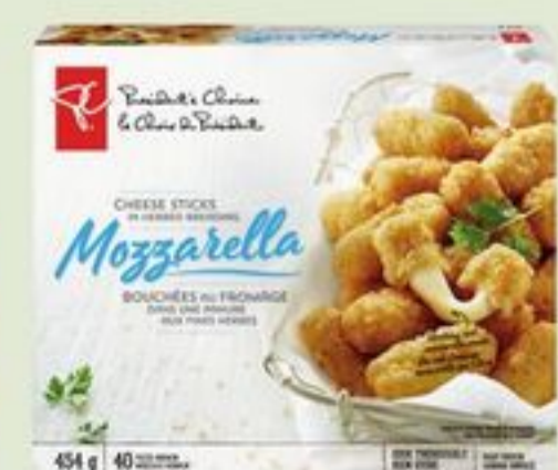
PC ® MOZZARELLA CHEESE STICKS FROZEN 454 G 21116020_EA