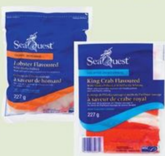
SEAQUEST® CRAB OR LOBSTER FLAVOURED POLLOCK FLAKES OR CHUNKS SELECTED VARIETIES READY-TO-EAT 227 G 20749798_EA/20749901_EA