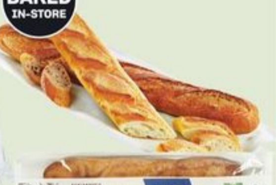
ACE BAKERY BAGUETTE SELECTED VARIETIES 325-400 G 20171171_EA 21314348_EA