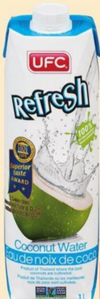
UFC REFRESH COCONUT WATER 1 L 20570506_EA