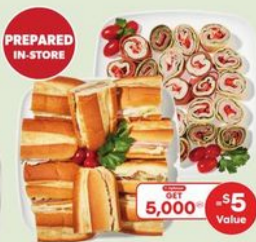
SANDWICH OR WRAP PLATTERS PREPARED IN-STORE 1.2-1.7 KG 21218193_EA 21558135_EA