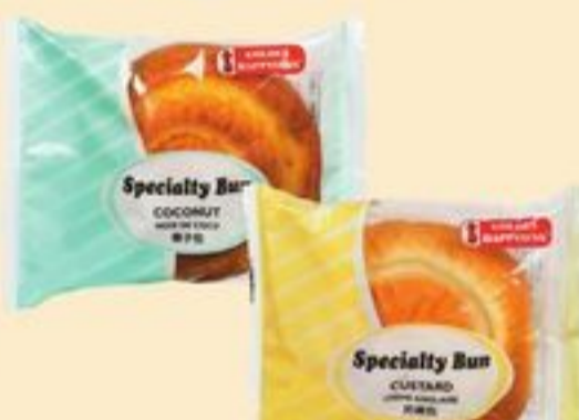
GOLDEN HAPPINESS SWEET GOODS SELECTED VARIETIES 100 G 21297542_EA/21297545_EA