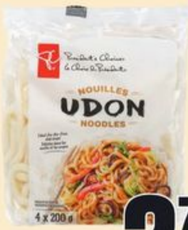
PC® UDON NOODLES 800 G 20354811_EA