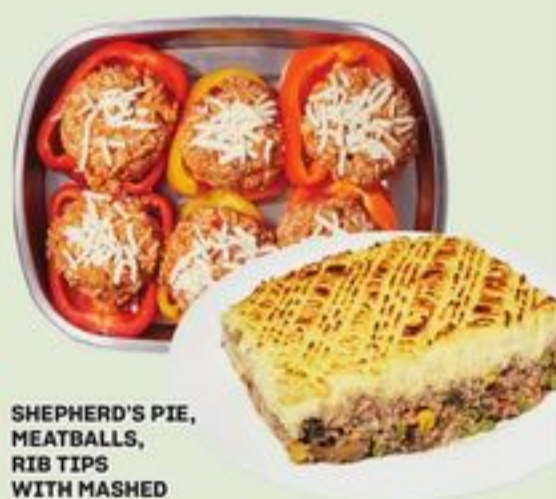
SHEPHERD'S PIE, MEATBALLS, RIB TIPS WITH MASHED POTATOES, MINI SLIDERS OR STUFFED PEPPERS 716 G-1.6 KG 21624670_EA 21624751_EA