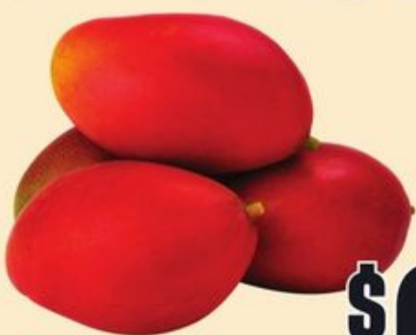
PALMER MANGO PRODUCT OF PERU 20025410001_EA