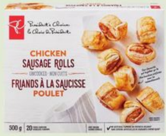
PC ® CHICKEN SAUSAGE ROLLS FROZEN 500 G 21439588_EA