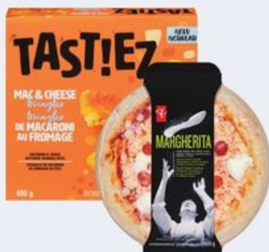
PC® BLACK LABEL PIZZA 370-420 G OR TASTIEZ SHAREABLES 400 G SELECTED VARIETIES FROZEN 21531415_EA/21564489_EA