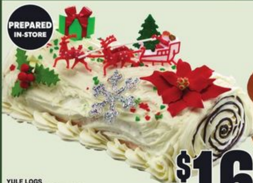
YULE LOGS WHITE OR CHOCOLATE 800 G 21955544_EA