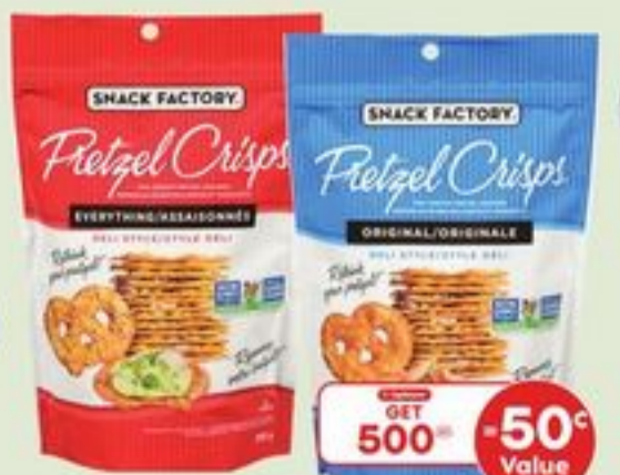
SNACK FACTORY PRETZEL CRISPS SELECTED VARIETIES 200 G 20948904_EA 20948940_EA