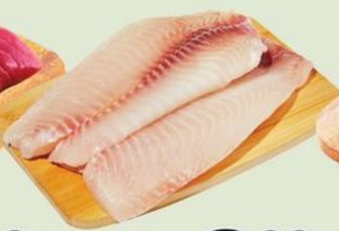
FRESH ASC TILAPIA FILLETS 22.02/KG 20897812_KG