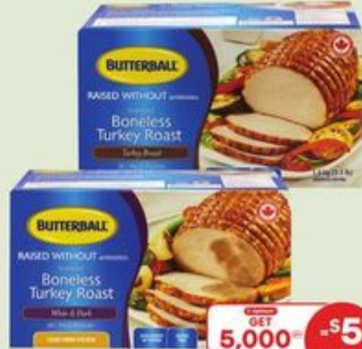
BUTTERBALL BONELESS TURKEY ROAST FROZEN 1.5 KG 20613995_EA/21377745_EA