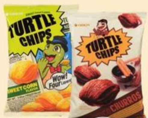
ORION TURTLE CHIPS SELECTED VARIETIES 160 G 21454276_EA/21454281_EA