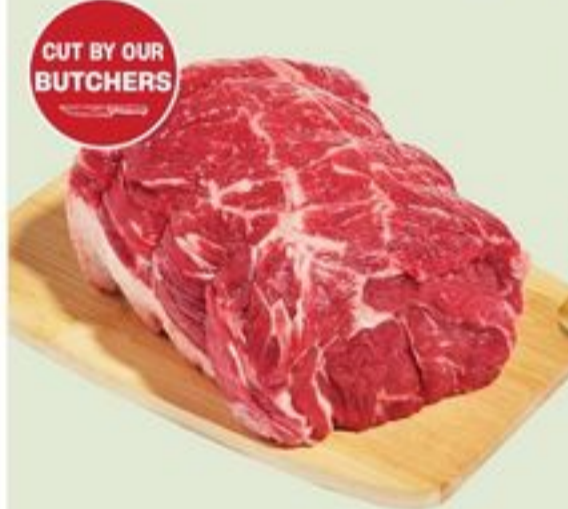
WEST BONELESS BLADE ROAST CUT FROM CANADA AA GRADE WESTERN BEEF OR HIGHER 22.05/KG 20804772_KG