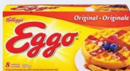
KELLOGG'S EGGO WAFFLES SELECTED VARIETIES FROZEN 8'S 20302779_EA