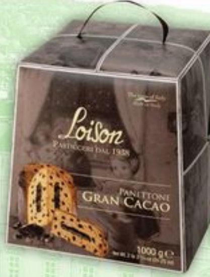
LOISON CLASSIC PANETTONE OR PANDORO 1 KG SELECTED VARIETIES WHILE QUANTITIES LAST

ALL AISLES LEAD HOME KITCHENS OF THE WORLD 20 99 EACH