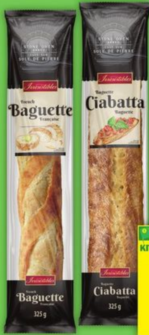
IRRESISTIBLES FRENCH OR CIABATTA BAGUETTE 325 G SELECTED VARIETIES

ALL AISLES LEAD HOME KITCHENS OF THE WORLD 1099 EACH