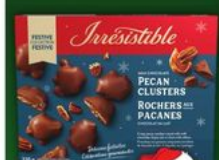
IRRESISTIBLE PECAN CLUSTERS 150 G WHILE QUANTITIES LAST