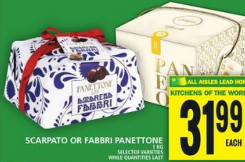
SCARPATO OR FABBRI PANETTONE 1 KG SELECTED VARIETIES WHILE QUANTITIES LAST

ALL AISLES LEAD HOME KITCHENS OF THE WORLD 23 99 EACH