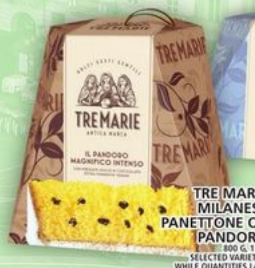
TRE MARIE MILANESE PANETTONE OR PANDORO 800 G, 1 KG SELECTED VARIETIES WHILE QUANTITIES LAST

ALL AISLES LEAD HOME KITCHENS OF THE WORLD 23 99 EACH