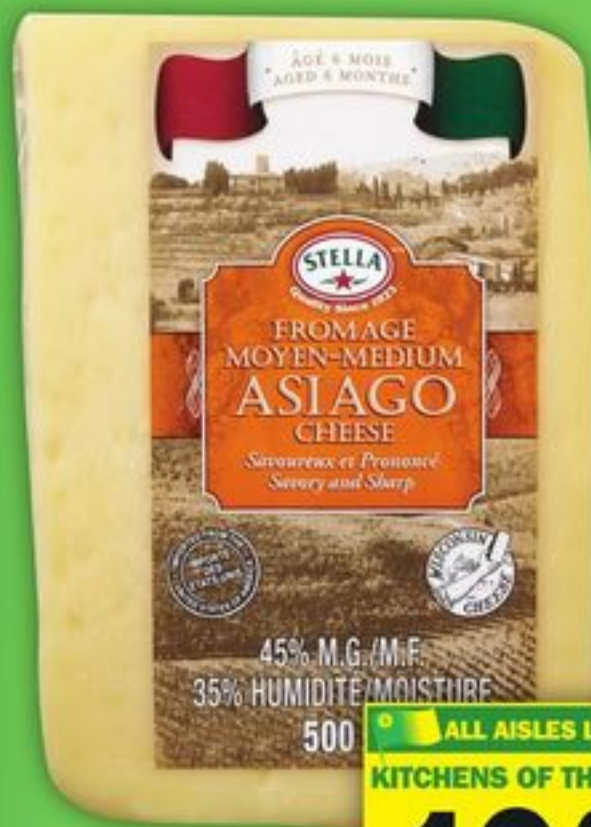
STELLA MEDIUM ASIAGO SELECTED VARIETIES

ALL AISLES LEAD HOME KITCHENS OF THE WORLD 1499 EACH