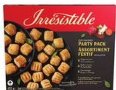
IRRESISTIBLE PARTY PACK PUFF PASTRIES OR GOURMET SAUSAGES APPETIZERS 422 - 488 G FROZEN SELECTED VARIETIES