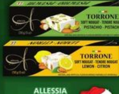
ALESSIA TORRONE 150 G SELECTED VARIETIES WHILE QUANTITIES LAST