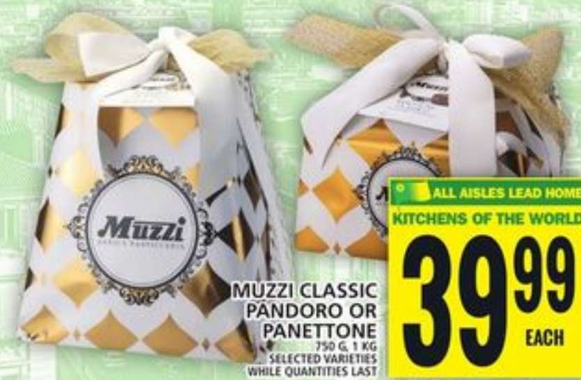
MUZZI CLASSIC PANDORO OR PANETTONE 750 G, 1 KG SELECTED VARIETIES WHILE QUANTITIES LAST

ALL AISLES LEAD HOME KITCHENS OF THE WORLD 44 99 EACH