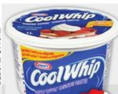
KRAFT COOL WHIP 1.1 L FROZEN SELECTED VARIETIES