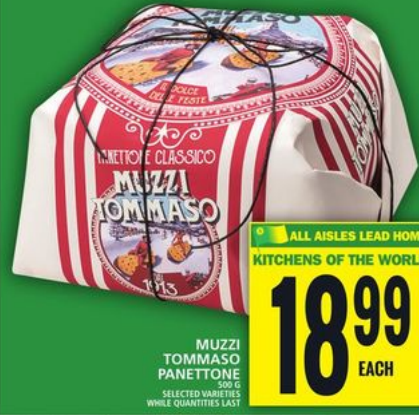
MUZZI TOMMASO PANETTONE 500 G SELECTED VARIETIES WHILE QUANTITIES LAST

ALL AISLES LEAD HOME KITCHENS OF THE WORLD 18 99 EACH