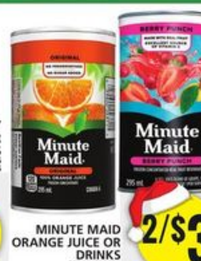
MINUTE MAID ORANGE JUICE OR DRINKS 200 G SELECTED VARIETIES