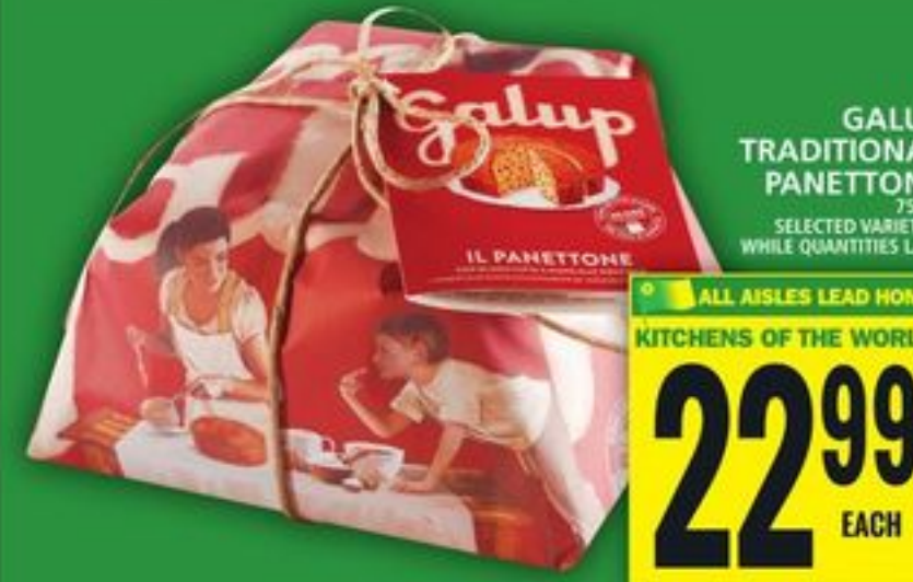
GALUP TRADITIONAL PANETTONE 750 G SELECTED VARIETIES WHILE QUANTITIES LAST

ALL AISLES LEAD HOME KITCHENS OF THE WORLD 23 99 EACH