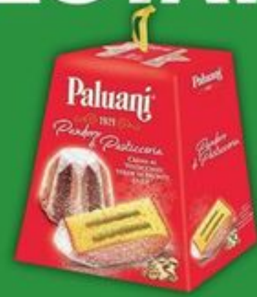
PALUANI FLAVORED PANDORO 750 G SELECTED VARIETIES WHILE QUANTITIES LAST

ALL AISLES LEAD HOME KITCHENS OF THE WORLD 18 99 EACH