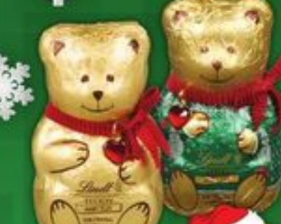
LINDT CHRISTMAS CHOCOLATE TEDDY 100 G SELECTED VARIETIES WHILE QUANTITIES LAST