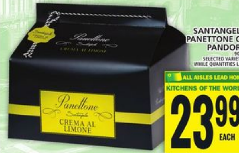
SANTANGELO PANETTONE OR PANDORO 900 G SELECTED VARIETIES WHILE QUANTITIES LAST

ALL AISLES LEAD HOME KITCHENS OF THE WORLD 17 99 EACH