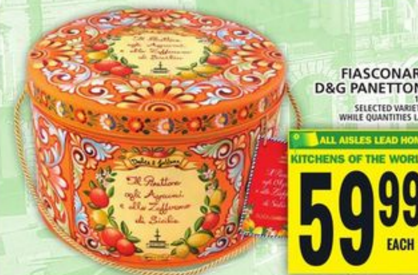
FIASCONARO D&G PANETTONE 1 KG SELECTED VARIETIES WHILE QUANTITIES LAST

ALL AISLES LEAD HOME KITCHENS OF THE WORLD 39 99 EACH