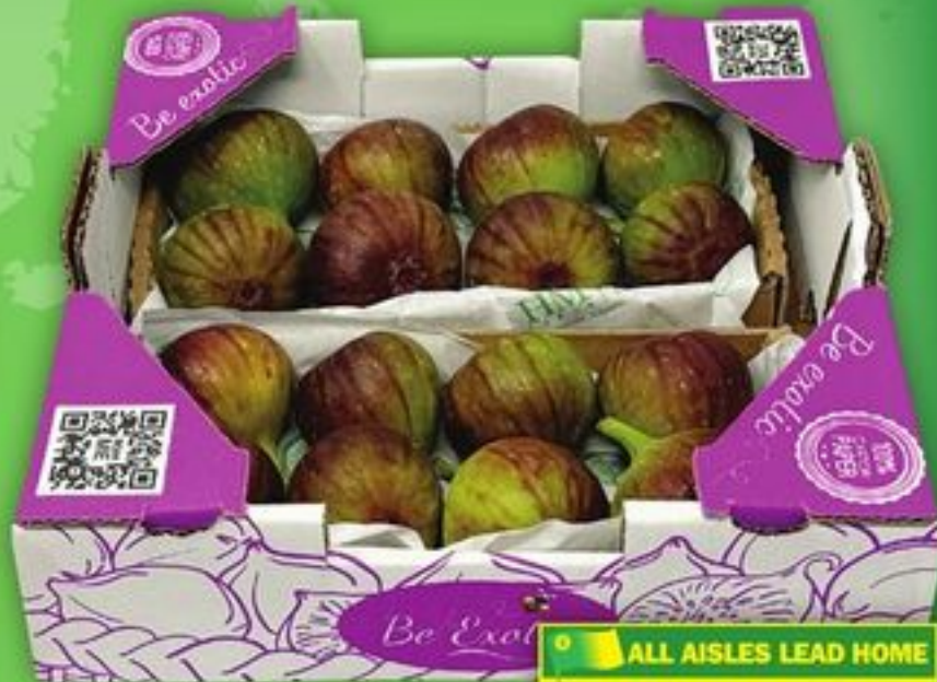
FRESH BROWN FIGS PRODUCT OF BRAZIL 1/2 CASE

ALL AISLES LEAD HOME KITCHENS OF THE WORLD 388 /LB