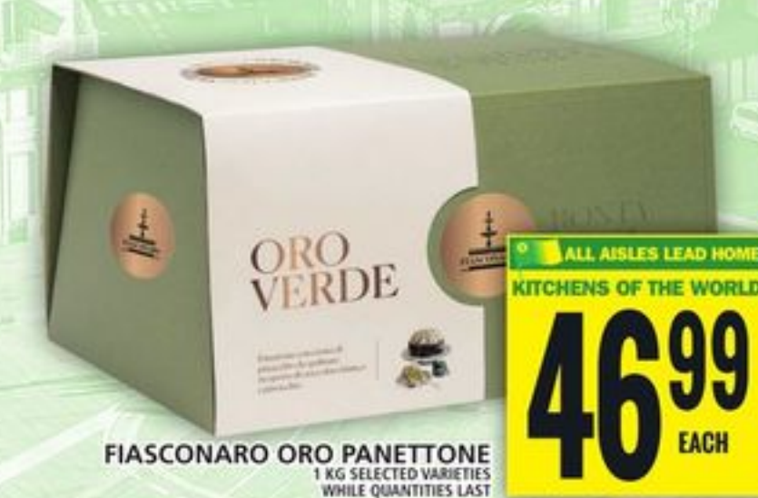
FIASCONARO ORO PANETTONE 1 KG SELECTED VARIETIES WHILE QUANTITIES LAST

ALL AISLES LEAD HOME KITCHENS OF THE WORLD 59 99 EACH