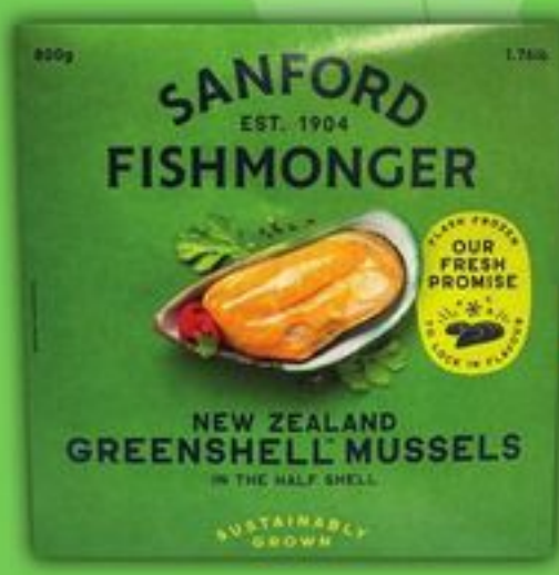
SANFORD GREENSHELL MUSSELS 800 G FROZEN SELECTED VARIETIES

ALL AISLES LEAD HOME KITCHENS OF THE WORLD 1899 EACH