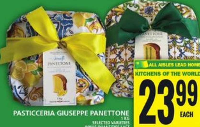
PASTICCERIA GIUSEPPE PANETTONE 1 KG SELECTED VARIETIES WHILE QUANTITIES LAST

ALL AISLES LEAD HOME KITCHENS OF THE WORLD 22 99 EACH