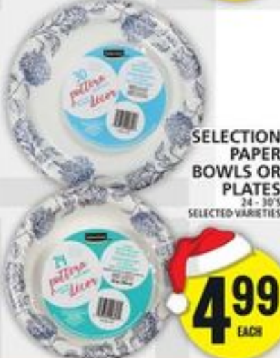
SELECTION PAPER BOWLS OR PLATES 24 - 30'S SELECTED VARIETIES