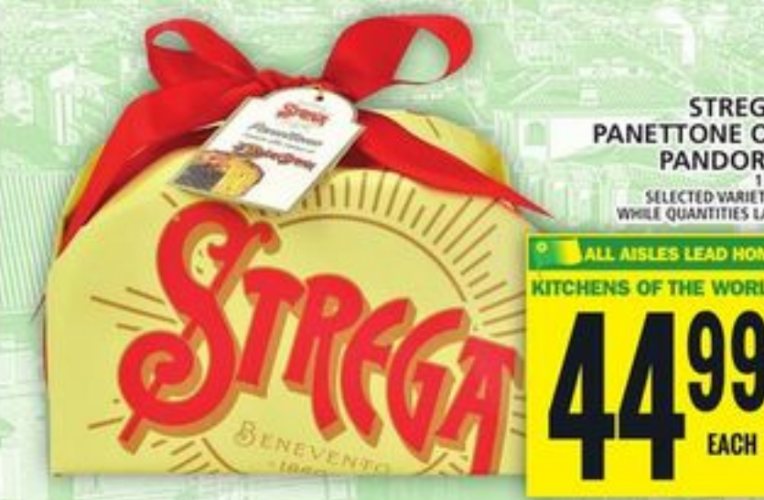
STREGA PANETTONE OR PANDORO 1 KG SELECTED VARIETIES WHILE QUANTITIES LAST

ALL AISLES LEAD HOME KITCHENS OF THE WORLD 27 99 EACH