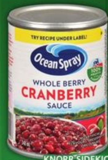
OCEAN SPRAY CRANBERRY SAUCE CAMPBELL'S BROTH 250 - 900 ML SELECTED VARIETIES