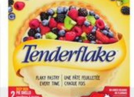
TENDERFLAKE PIE OR TART SHELL CRUST 255 - 230 G FROZEN SELECTED VARIETIES