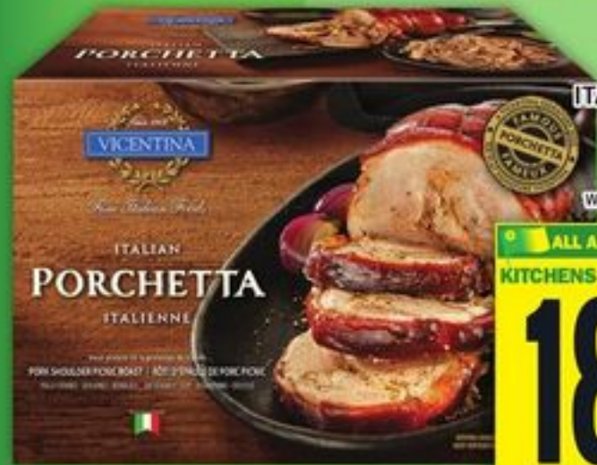
VICENTINA ITALIAN STYLE PORCHETTA ROAST 1.5 KG SELECTED VARIETIES WHILE QUANTITIES LAST

ALL AISLES LEAD HOME KITCHENS OF THE WORLD 1199 EACH