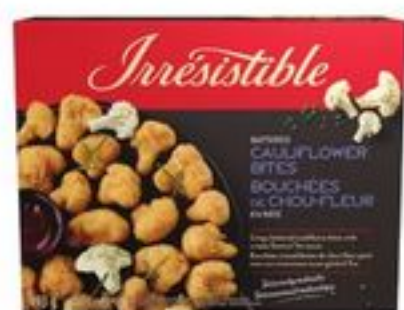
IRRESISTIBLE CAULIFLOWER BITES OR LOADED POTATO TOTS APPETIZERS 258 - 403 G FROZEN SELECTED VARIETIES