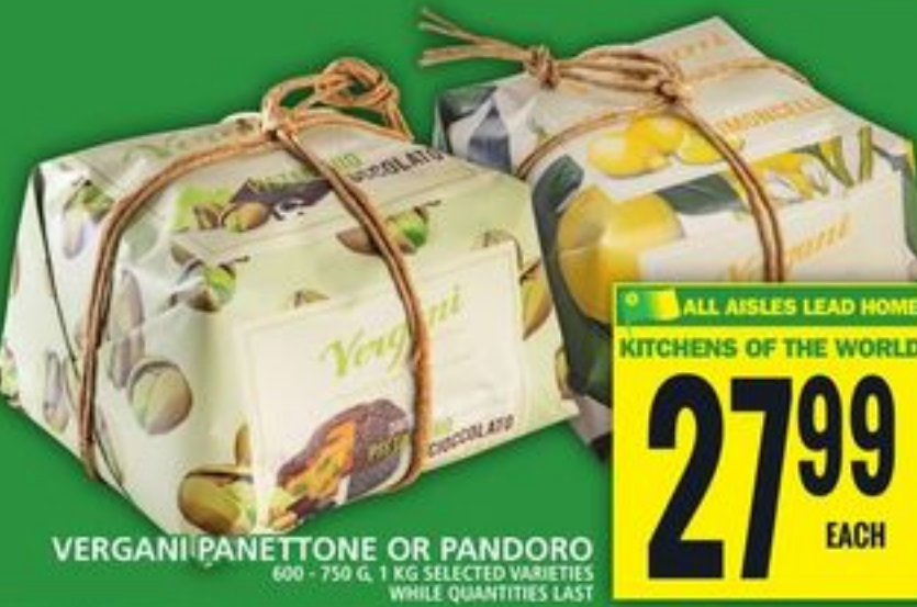
VERGANI PANETTONE OR PANDORO 600 - 750 G, 1 KG SELECTED VARIETIES WHILE QUANTITIES LAST

ALL AISLES LEAD HOME KITCHENS OF THE WORLD 31 99 EACH