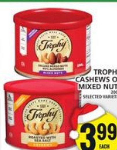
TROPHY CASHEWS OR MIXED NUTS 200 G SELECTED VARIETIES