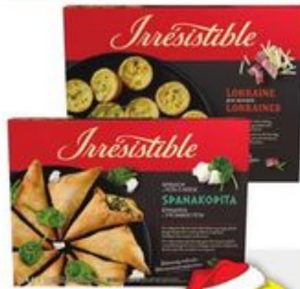
IRRESISTIBLE SPANAKOPITA OR QUICHE APPETIZERS 254 - 300 G FROZEN SELECTED VARIETIES