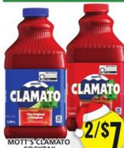
MOTT'S CLAMATO COCKTAIL 1.89 L SELECTED VARIETIES