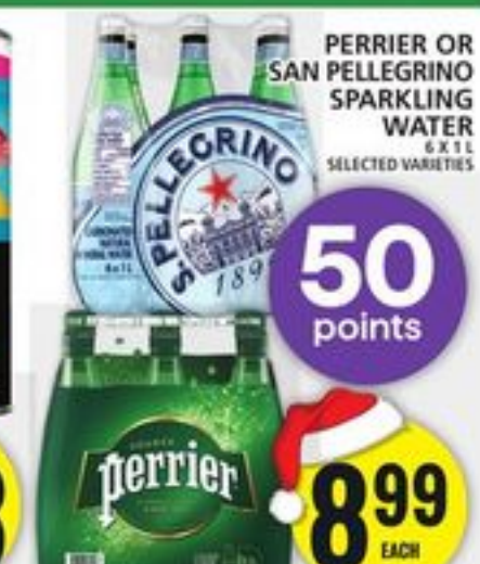
PERRIER OR SAN PELLEGRINO SPARKLING WATER 50 points 1.5 L SELECTED VARIETIES