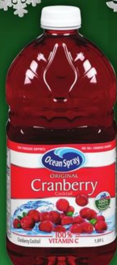
OCEAN SPRAY CRANBERRY COCKTAIL OR JUICE BLENDS 1.77 - 1.83 L SELECTED VARIETIES