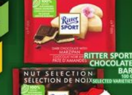
RITTER SPORT NUT SELECTION CHOCOLATE BAR 100 G SELECTED VARIETIES