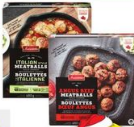
IRRESISTIBLE FULLY COOKED MEATBALLS 500 - 480 G FROZEN SELECTED VARIETIES