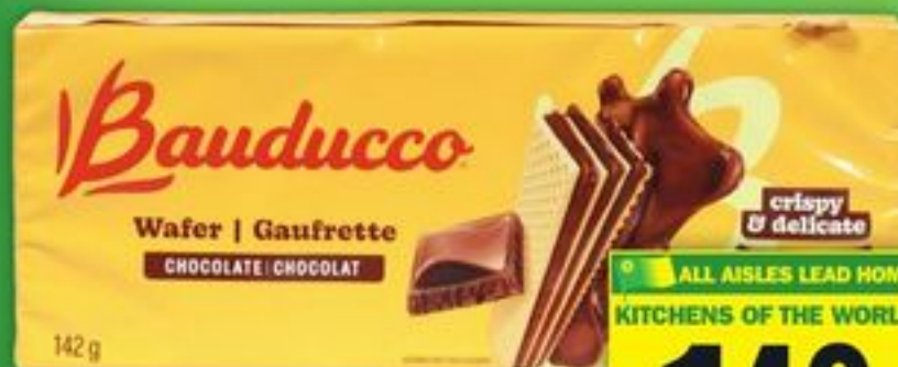
BAUDUCCO WAFERS SELECTED VARIETIES

ALL AISLES LEAD HOME KITCHENS OF THE WORLD 167 EACH