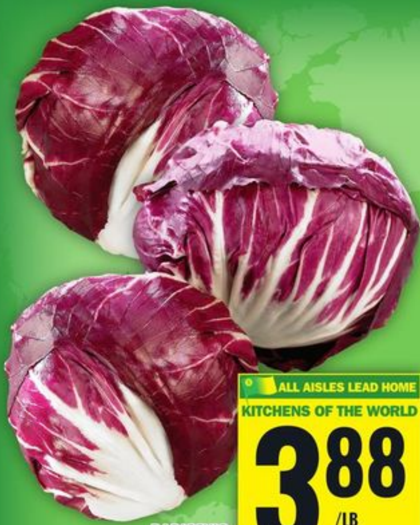
RADICCHIO PRODUCT OF U.S.A. OR MEXICO 8.55/KG

ALL AISLES LEAD HOME KITCHENS OF THE WORLD 388 /LB