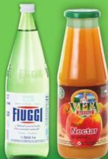
FIUGGI WATER VITA SANA NECTARS 600 ML SELECTED VARIETIES

ALL AISLES LEAD HOME KITCHENS OF THE WORLD 149 EACH