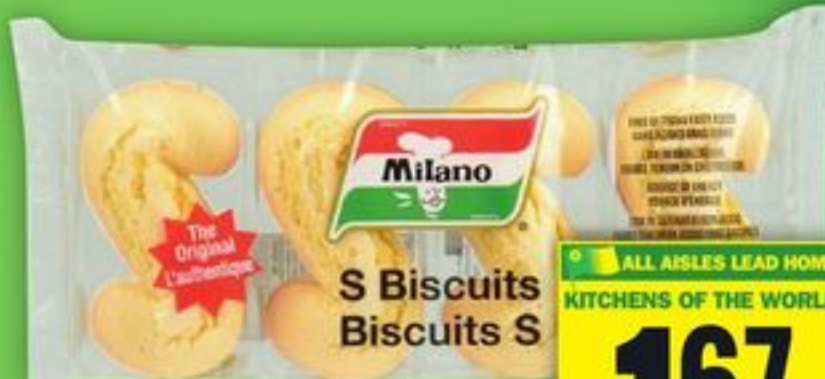
MILANO "S" BISCUITS 200 G SELECTED VARIETIES

ALL AISLES LEAD HOME KITCHENS OF THE WORLD 399 EACH