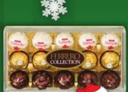
FERRERO CHOCOLATE BOX 156 G SELECTED VARIETIES WHILE QUANTITIES LAST