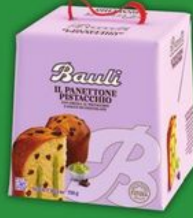
BAULI FLAVORED PANDORO OR PANETTONE 750 - 820 G SELECTED VARIETIES WHILE QUANTITIES LAST

ALL AISLES LEAD HOME KITCHENS OF THE WORLD 17 99 EACH