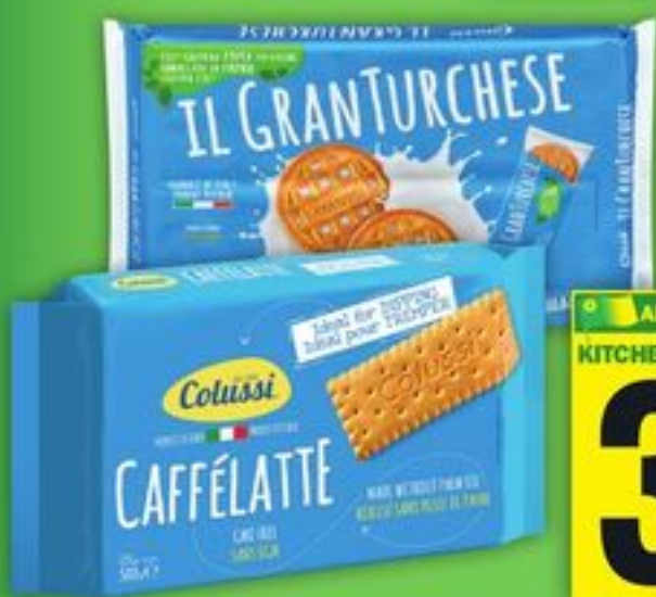
COLUSSI COOKIES 400-500 G SELECTED VARIETIES

ALL AISLES LEAD HOME KITCHENS OF THE WORLD 149 EACH