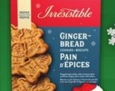
IRRESISTIBLE GINGERBREAD 200 G SELECTED VARIETIES WHILE QUANTITIES LAST