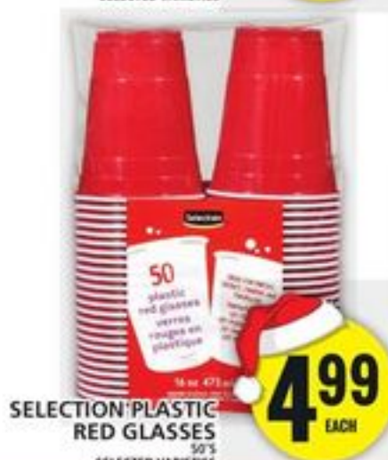
SELECTION PLASTIC RED GLASSES 50 SELECTED VARIETIES