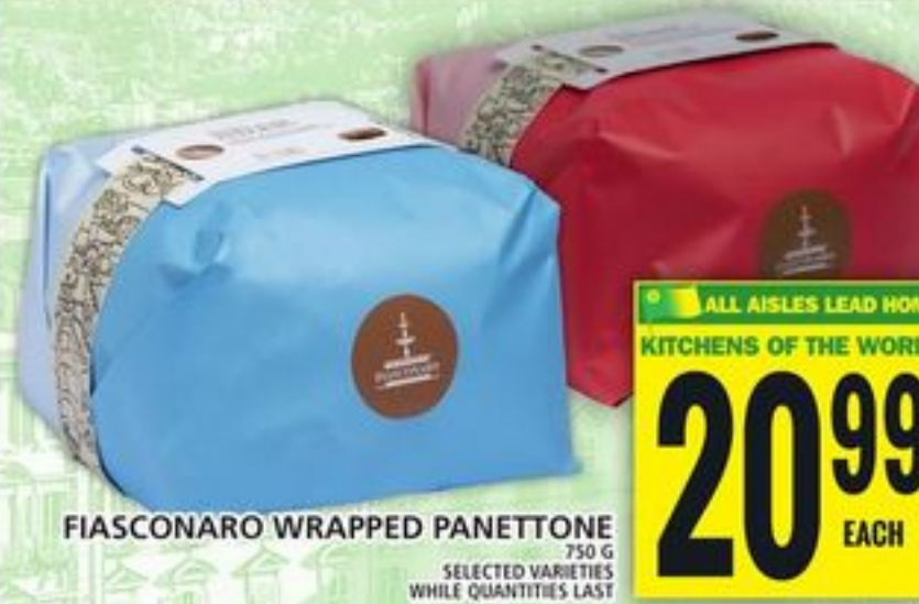
FIASCONARO WRAPPED PANETTONE 750 G SELECTED VARIETIES WHILE QUANTITIES LAST

ALL AISLES LEAD HOME KITCHENS OF THE WORLD 14 99 EACH