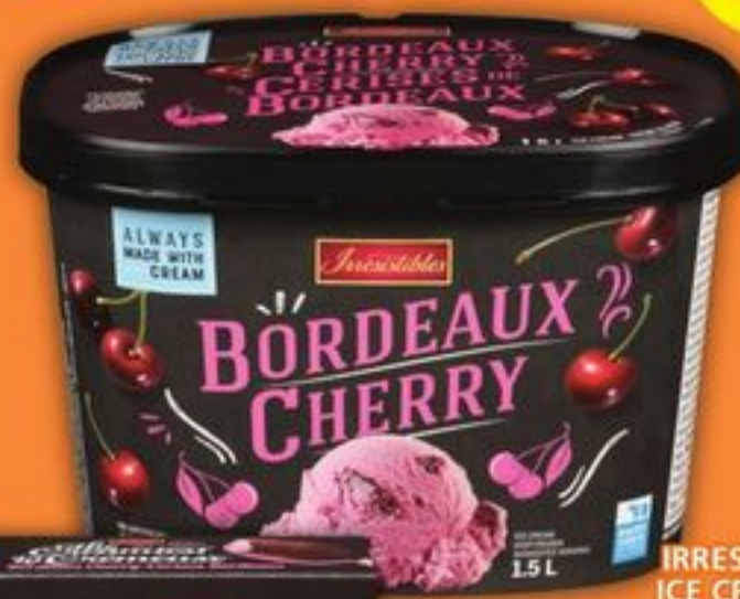
IRRESISTIBLES ICE CREAM 1.5 L NOVELTIES 4-5$ SELECTED VARIETIES