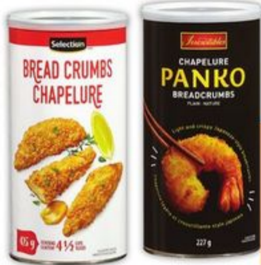
SELECTION OR IRRESISTIBLES BREADCRUMBS 227 - 425 G SELECTED VARIETIES