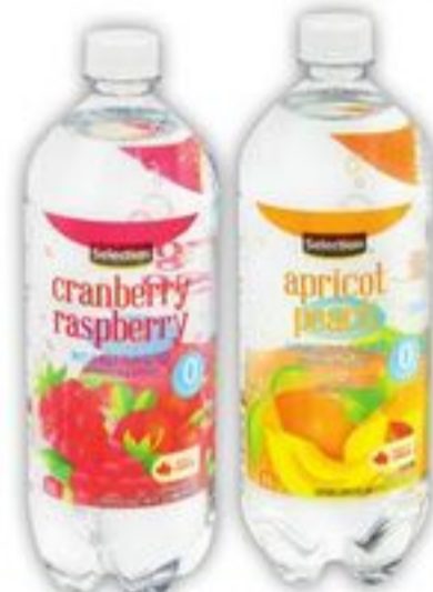
SELECTION SPARKLING WATER 1 L SELECTED VARIETIES