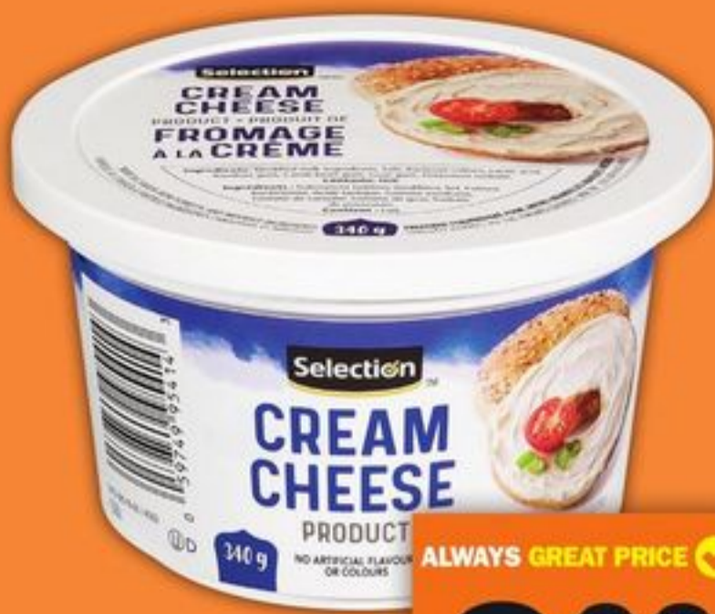
SELECTION CREAM CHEESE PRODUCT 340 G SELECTED VARIETIES