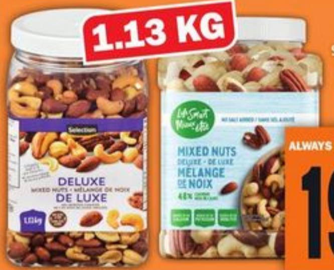
SELECTION OR LIFE SMART DELUXE MIXED NUTS 1.13 KG SELECTED VARIETIES