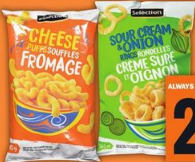
SELECTION SNACKS 265 - 400 G SELECTED VARIETIES