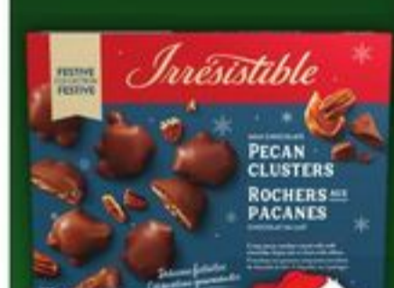
IRRESISTIBLE PECAN CLUSTERS 150 G WHILE QUANTITIES LAST