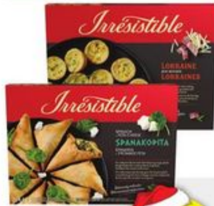
IRRESISTIBLE SPANAKOPITA OR QUICHE APPETIZERS 254 - 300 G FROZEN SELECTED VARIETIES