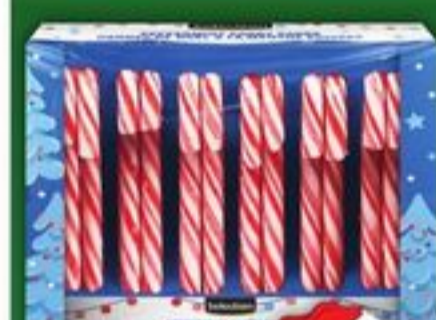
SELECTION CANDY CANS SELECTED VARIETIES WHILE QUANTITIES LAST