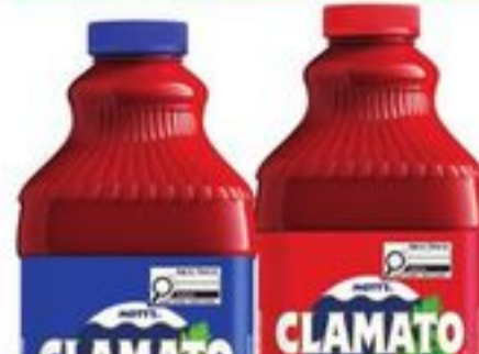
MOTT'S CLAMATO COCKTAIL 1.89 L SELECTED VARIETIES