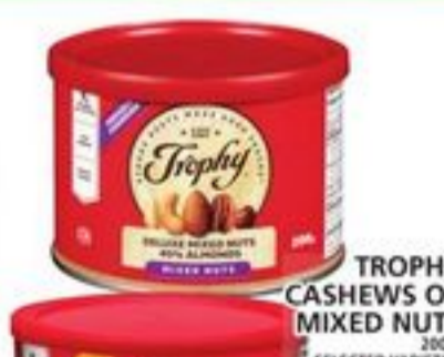
TROPHY CASHEWS OR MIXED NUTS 200 G SELECTED VARIETIES