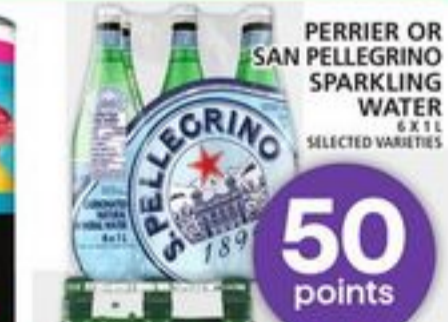
PERRIER OR SAN PELLEGRINO SPARKLING WATER 1.5 L SELECTED VARIETIES