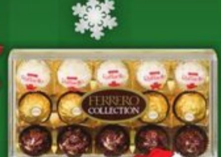
FERRERO CHOCOLATE BOX 156 G SELECTED VARIETIES WHILE QUANTITIES LAST