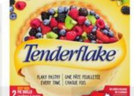
TENDERFLAKE PIE OR TART SHELL CRUST 255 - 230 G FROZEN SELECTED VARIETIES