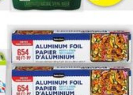
SELECTION ALUMINUM FOIL 300 M SELECTED VARIETIES

ALWAYS FRESH. *ALWAYS IN STOCK. ALWAYS GREAT PRICES.