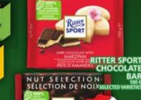
RITTER SPORT NUT SELECTION CHOCOLATE BAR 100 G SELECTED VARIETIES