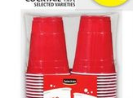
SELECTION PLASTIC RED GLASSES 50 SELECTED VARIETIES