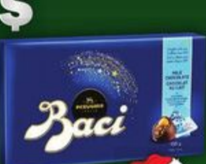
PERUGINA BACI CHOCOLATES SELECTED VARIETIES