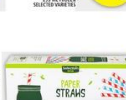
SELECTION ECO STRAWS 20'S SELECTED VARIETIES