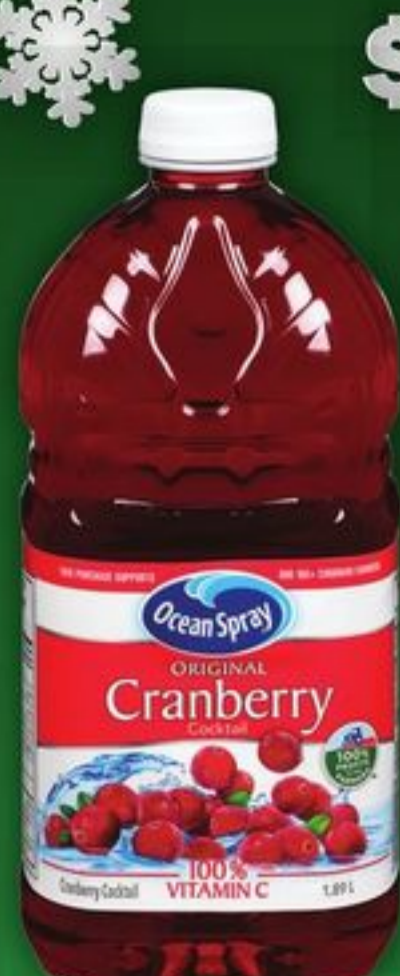
OCEAN SPRAY CRANBERRY COCKTAIL OR JUICE BLENDS 1.77 - 1.83 L SELECTED VARIETIES