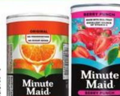
MINUTE MAID ORANGE JUICE OR DRINKS SELECTED VARIETIES