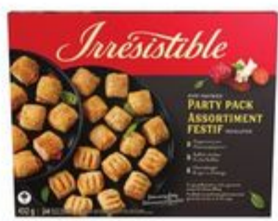
IRRESISTIBLE PARTY PACK PUFF PASTRIES OR GOURMET SAUSAGES APPETIZERS 422 - 488 G FROZEN SELECTED VARIETIES