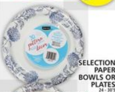
SELECTION PAPER BOWLS OR PLATES 24 - 30'S SELECTED VARIETIES