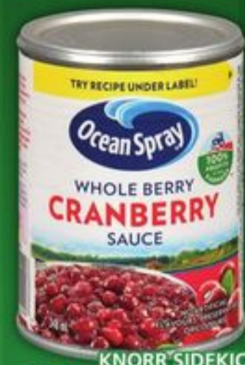
OCEAN SPRAY CRANBERRY SAUCE CAMPBELL'S BROTH 250 - 900 ML SELECTED VARIETIES