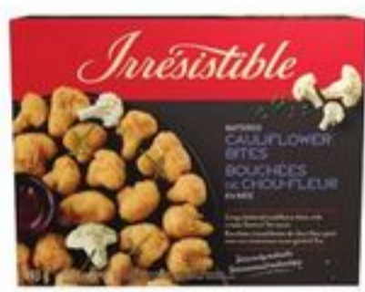
IRRESISTIBLE CAULIFLOWER BITES OR LOADED POTATO TOTS APPETIZERS 258 - 403 G FROZEN SELECTED VARIETIES