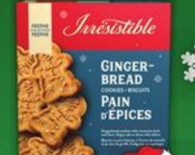
IRRESISTIBLE GINGERBREAD 200 G SELECTED VARIETIES WHILE QUANTITIES LAST