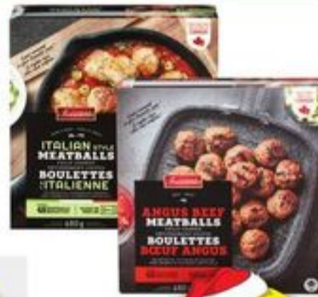
IRRESISTIBLE FULLY COOKED MEATBALLS 500 - 480 G FROZEN SELECTED VARIETIES