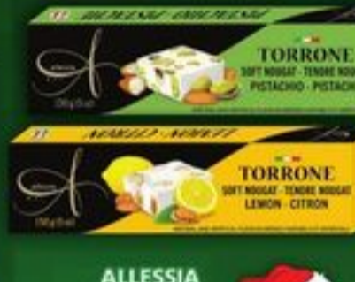
ALESSIA TORRONE 150 G SELECTED VARIETIES WHILE QUANTITIES LAST