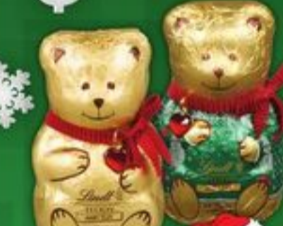
LINDT CHRISTMAS CHOCOLATE TEDDY 100 G SELECTED VARIETIES WHILE QUANTITIES LAST