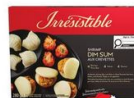
IRRESISTIBLE SHRIMP DIM SUM DUMPLINGS 280 G FROZEN SELECTED VARIETIES