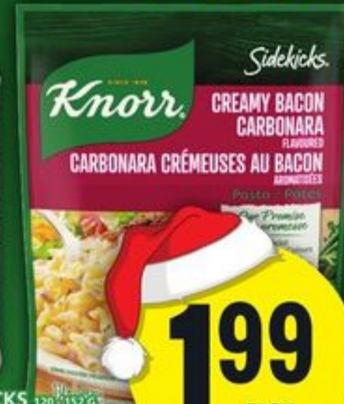
KNORR SIDEKICKS CREAMY BACON CARBONARA 128 - 2152 G SELECTED VARIETIES