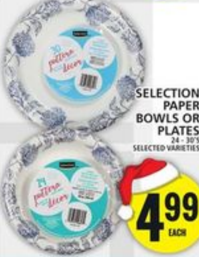
SELECTION PAPER BOWLS OR PLATES 24 - 30'S SELECTED VARIETIES