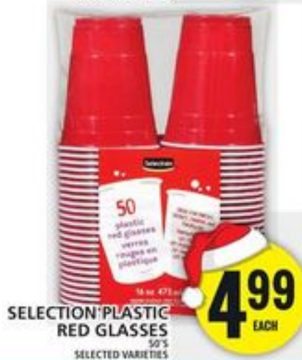
SELECTION PLASTIC RED GLASSES 50 SELECTED VARIETIES