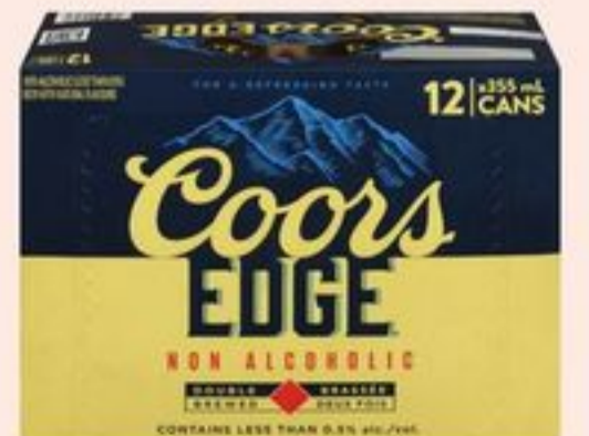
COORS EDGE NON-ALCOHOLIC DOUBLE BREWED SELECTED VARIETIES 12 X 355 ML 21105236_C12