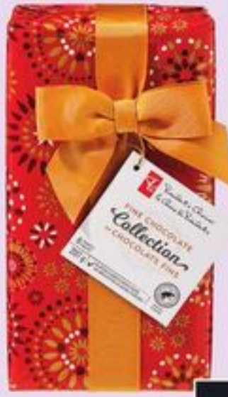
PC FINE CHOCOLATE COLLECTION 207 G 21115030_EA