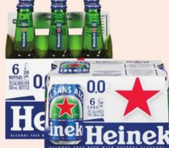
HEINEKEN 0.0% NON-ALCOHOLIC BEER SELECTED VARIETIES 6X330 ML 21099500_C06 21100011_C06