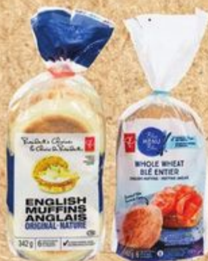
PC ® OR BLUE MENU ® ENGLISH MUFFINS SELECTED VARIETIES 6'S 20810796_EA/21016273_EA