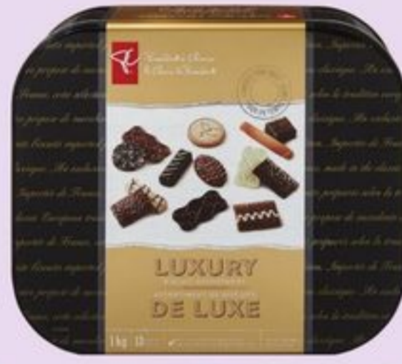
PC LUXURY BISCUIT TIN 1 KG 21456468_EA