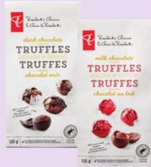
PC MILK OR DARK CHOCOLATE COVERED TRUFFLES SELECTED VARIETIES 155 G 21405210_EA 21405235_EA