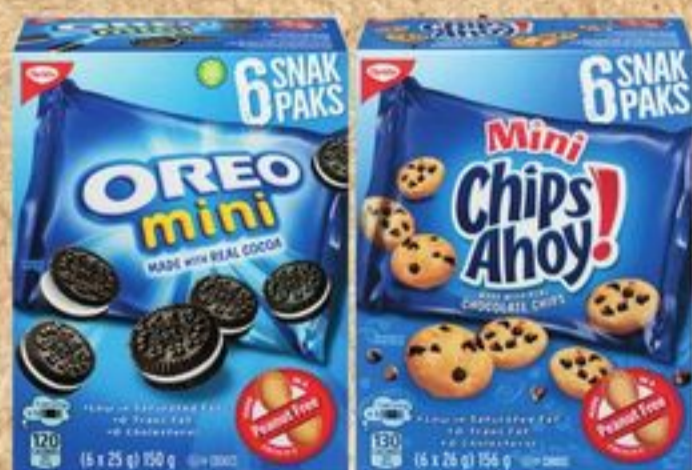
CHRISTIE MINI COOKIES OR MINI SNACK PACKS SELECTED VARIETIES 150-200 G 21584976_EA/21585155_EA