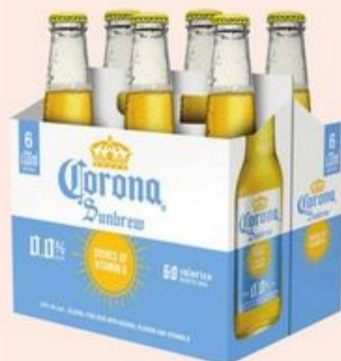
CORONA SUNBREW 0.0% ALCOHOL SELECTED VARIETIES 6X330 ML 21433615_C06