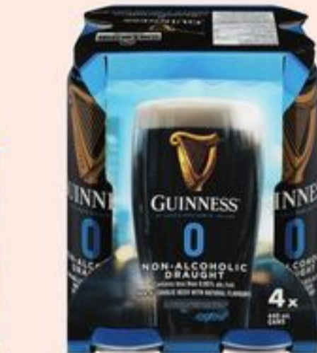
GUINNESS NON-ALCOHOLIC DRAUGHT 0.05% SELECTED VARIETIES 4X440 ML 21567137_C04