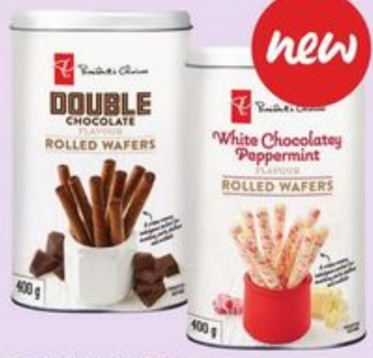
PC DOUBLE CHOCOLATE OR WHITE CHOCOLATE PEPPERMINT FLAVOURED ROLLED WAFERS 400 G 21601215_EA 21601372_EA