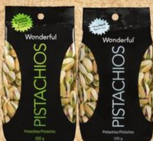
WONDERFUL PISTACHIOS SALTED OR UNSALTED PRODUCT OF U.S.A. 225 G 21085963001_EA/21018439_EA