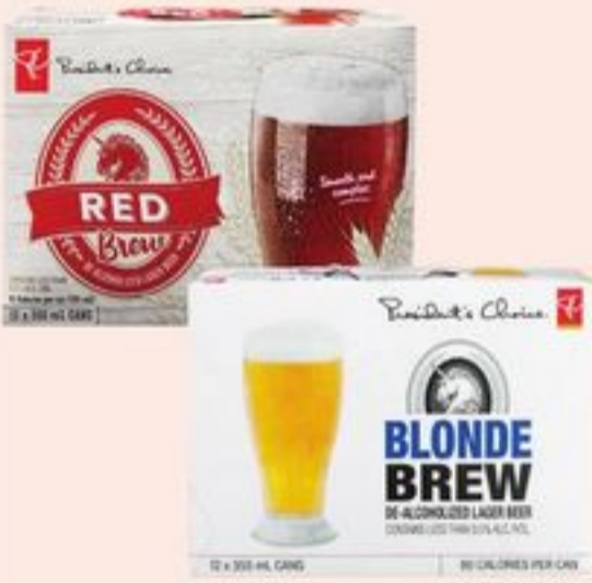
PC DE-ALCOHOLIZED BEER SELECTED VARIETIES 12X355 ML 20121729_C12 20325253_C12