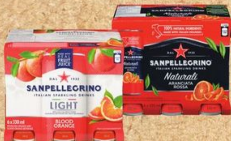
SANPELLEGRINO NATURALI OR ITALIAN SPARKING DRINKS LIGHT SPARKLING WATER SELECTED VARIETIES 6X330 ML 21433206_C06/21590961_C06