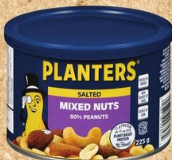
PLANTERS SALTED MIXED NUTS SELECTED VARIETIES 225 G 21620001_EA