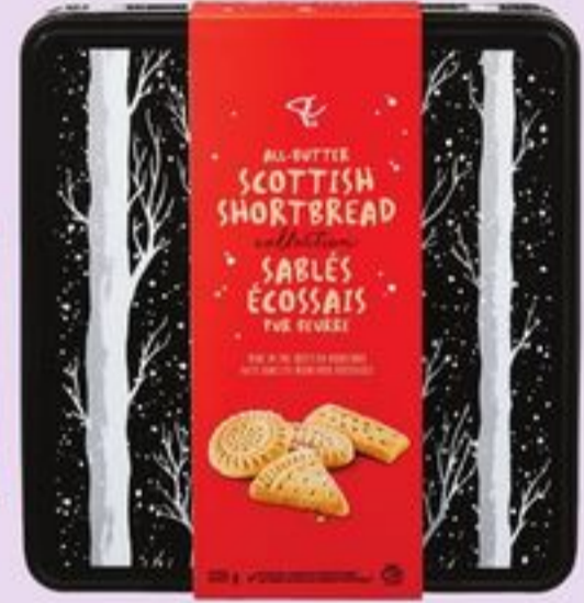
PC ALL-BUTTER SCOTTISH SHORTBREAD 320 G 21540781_EA