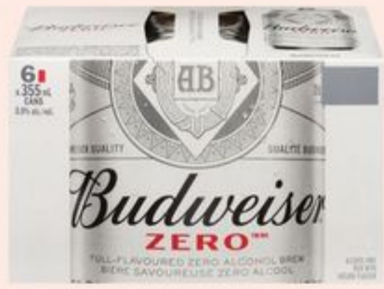
BUDWEISER ZERO FULL-FLAVOURED ZERO ALCOHOL BREW SELECTED VARIETIES 6X355 ML 21313108_EA