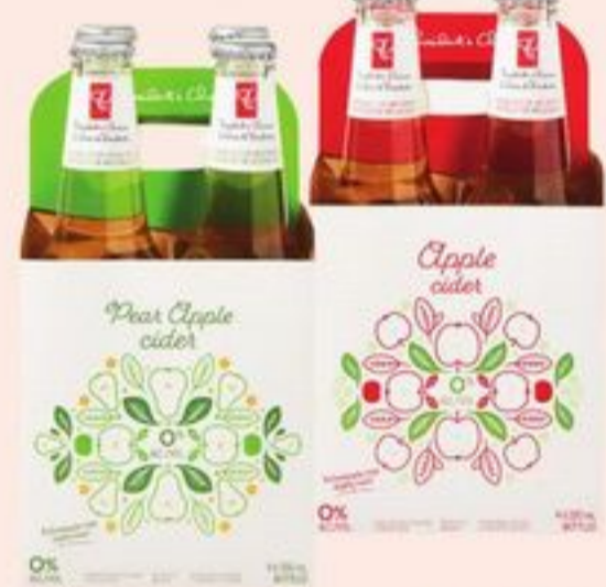
PC SPARKLING DEALCOHOLIZED CIDER BEVERAGE 4X330 ML 21588256_EA 21588277_EA