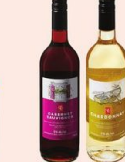
PC DEALCOHOLIZED WINE SELECTED VARIETIES 750 ML 21045800_EA 21403385_EA