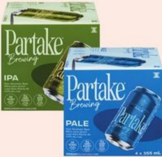
PARTAKE NON-ALCOHOLIC BEER SELECTED VARIETIES 4X355 ML 21208552_C04 21208553_C04