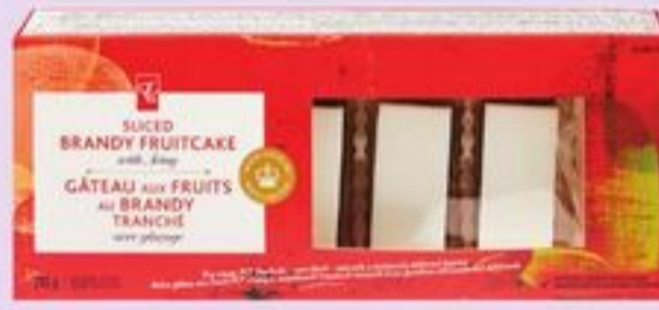
PC FRUITCAKE SLICED 210 G 21599272_EA