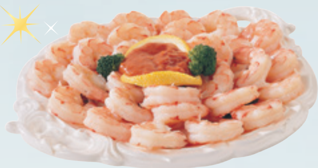
Peeled & Deveined Cooked Shrimp 2 Lb., 31-40 Ct.