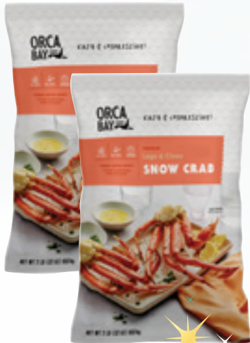
Orca Bay Snow Crab Cluster 2 Lb.