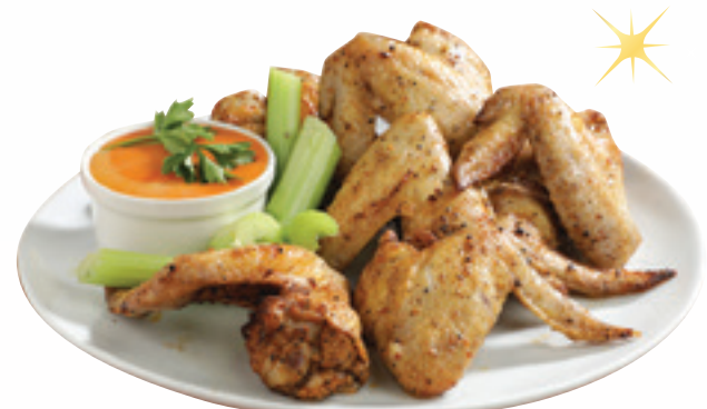
Value Pack Chicken Wings