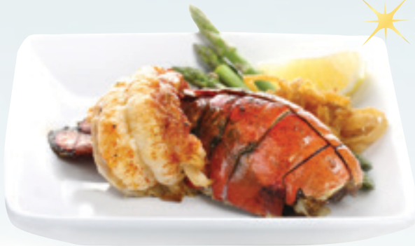
Lobster Tail 8 Oz.