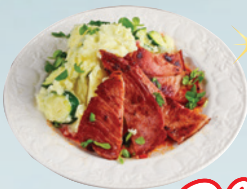
Smoked Pork Jowls