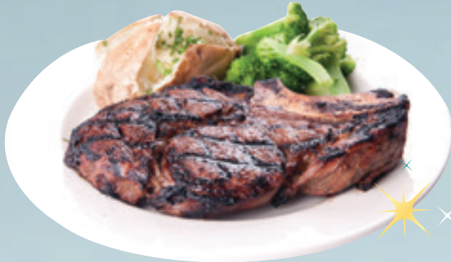
Value Pack USDA Select Bone-In Ribeye Steaks