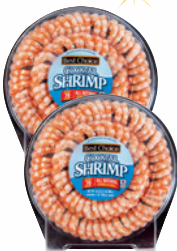
Best Choice Cocktail Shrimp Platter 32 Oz.