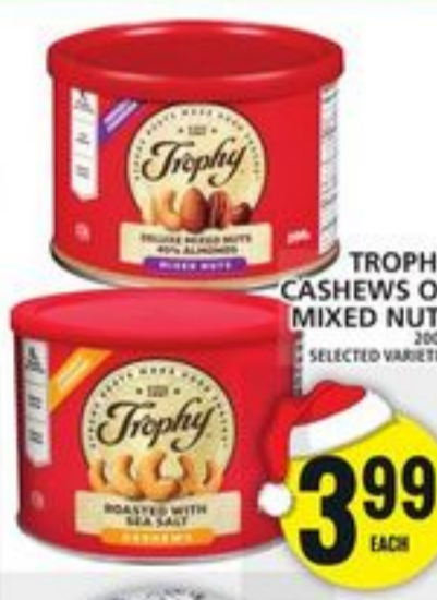
TROPHY CASHEWS OR MIXED NUTS 200 G SELECTED VARIETIES