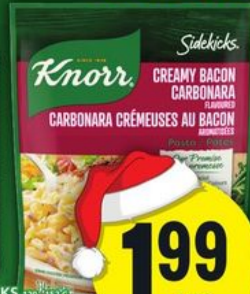
KNORR SIDEKICKS CREAMY BACON CARBONARA 128 - 2152 G SELECTED VARIETIES