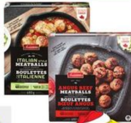
IRRESISTIBLE FULLY COOKED MEATBALLS 500 - 480 G SELECTED VARIETIES