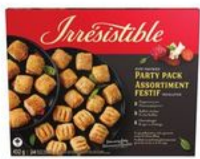
IRRESISTIBLE PARTY PACK PUFF PASTRIES OR GOURMET SAUSAGES APPETIZERS 422 - 488 G SELECTED VARIETIES