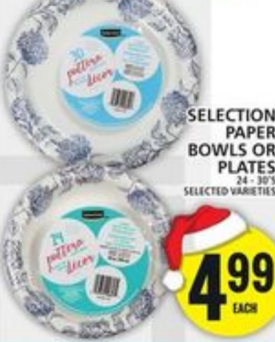
SELECTION PAPER BOWLS OR PLATES 24 - 30'S SELECTED VARIETIES