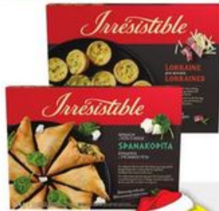
IRRESISTIBLE SPANAKOPITA OR QUICHE APPETIZERS 254 - 300 G SELECTED VARIETIES