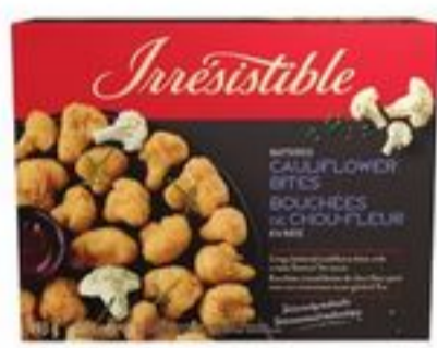
IRRESISTIBLE CAULIFLOWER BITES OR LOADED POTATO TOTS APPETIZERS 278 - 403 G SELECTED VARIETIES