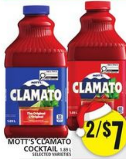
MOTT'S CLAMATO COCKTAIL 1.89 L SELECTED VARIETIES