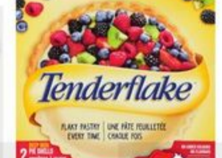
TENDERFLAKE PIE OR TART SHELL CRUST 255 - 230 G SELECTED VARIETIES