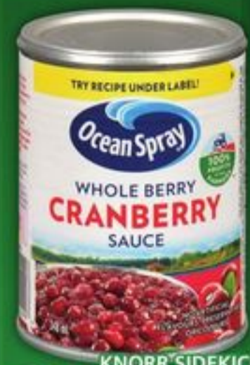
OCEAN SPRAY WHOLE BERRY CRANBERRY SAUCE 250 - 900 ML SELECTED VARIETIES