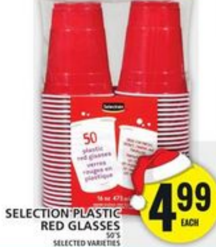
SELECTION PLASTIC RED GLASSES 50 G SELECTED VARIETIES