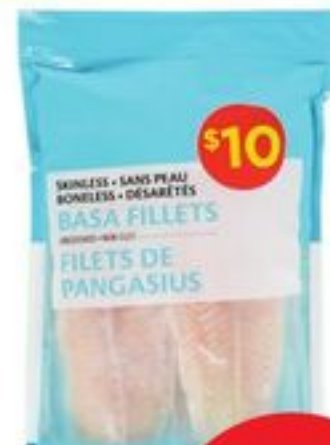
BASA FILLETS FROZEN 908 G 21473748_EA