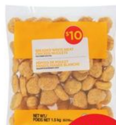
CHICKEN NUGGETS FROZEN 1.5 KG 21447595_EA