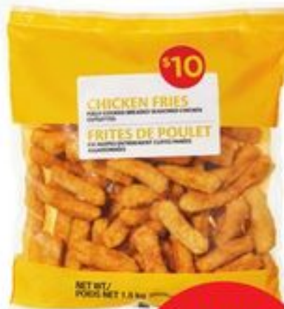
CHICKEN FRIES FROZEN 1.5 KG 21326279_EA