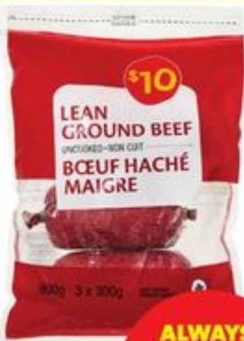
LEAN GROUND BEEF FROZEN 900 G 21326018_EA