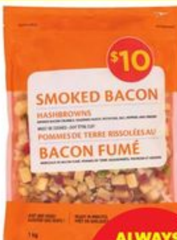
SMOKED BACON HASHBROWNS FROZEN 1 KG 21526663_EA