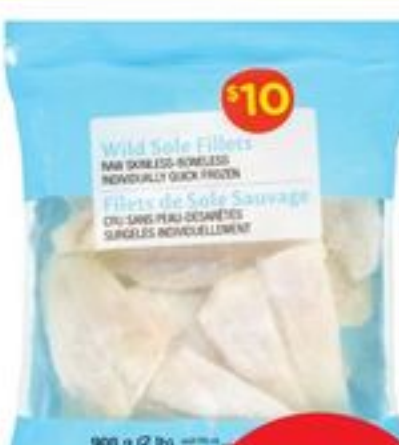
WILD SOLE FILLETS FROZEN 908 G 2109511_EA