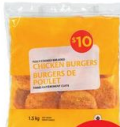
BREADED CHICKEN BURGER FROZEN 1.5 KG 21444441_EA