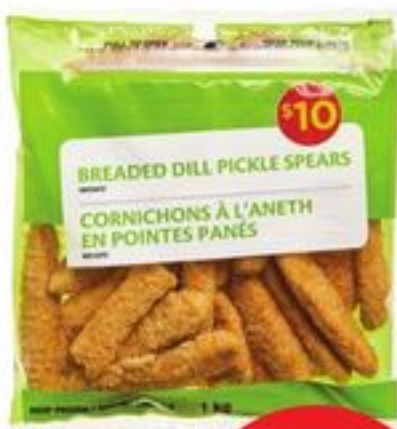
BREADED PICKLE SPEARS FROZEN 1 KG 21323060_EA