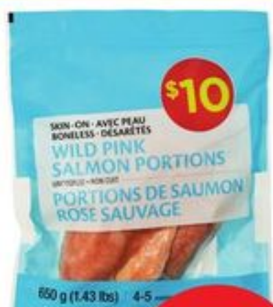
PINK SALMON FILLETS FROZEN 650 G 21473104_EA