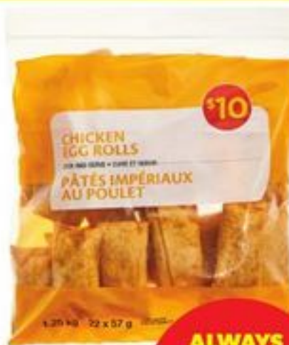
CHICKEN EGGROLL FROZEN 1.25 KG 21444997_EA