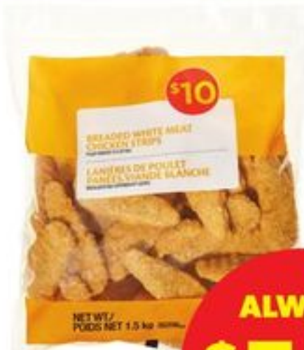
CHICKEN STRIPS FROZEN 1.5 KG 21447187_EA