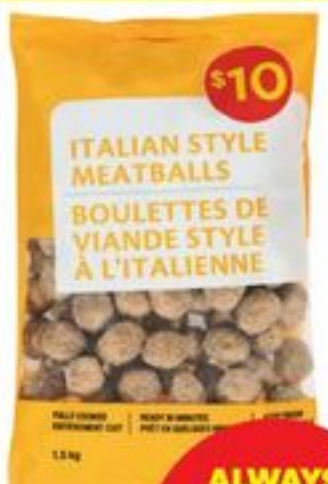
ITALIAN STYLE MEATBALLS FROZEN 1.5 KG 21526930_EA