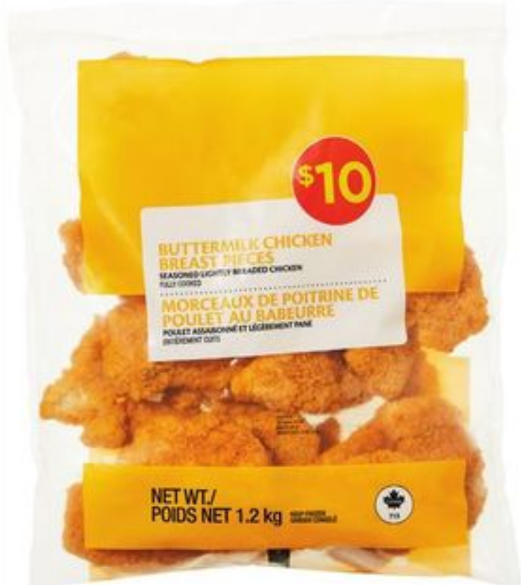
BUTTERMILK CHICKEN BREAST PIECES FROZEN 1.2 KG 21372692_EA