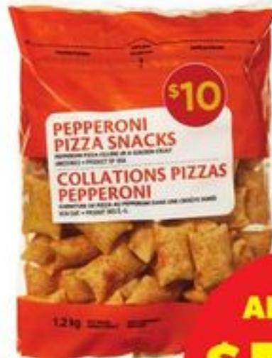
PEPPERONI PIZZA SNACKS FROZEN 1.2 KG 21569713_EA