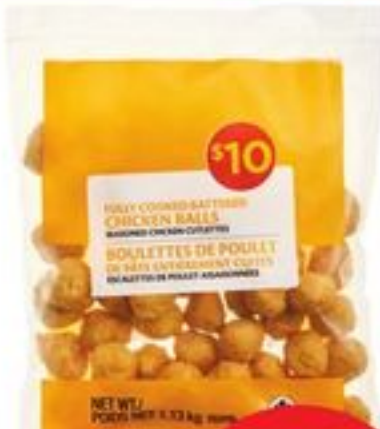
CHICKEN BALLS FROZEN 1.13 KG 21469297_EA