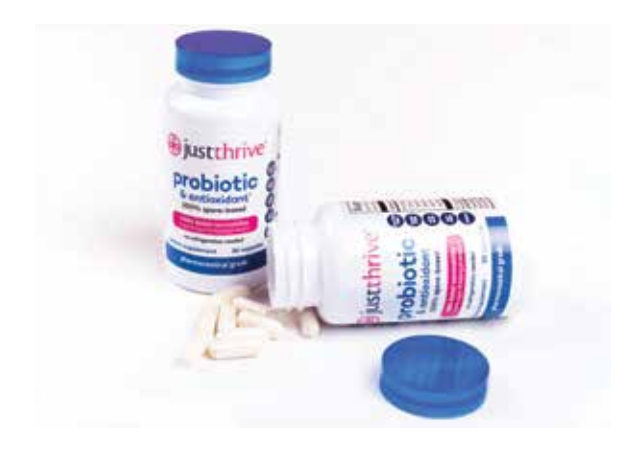
Just Thrive ALL DIGESTIVE HEALTH SUPPLEMENTS 25% OFF