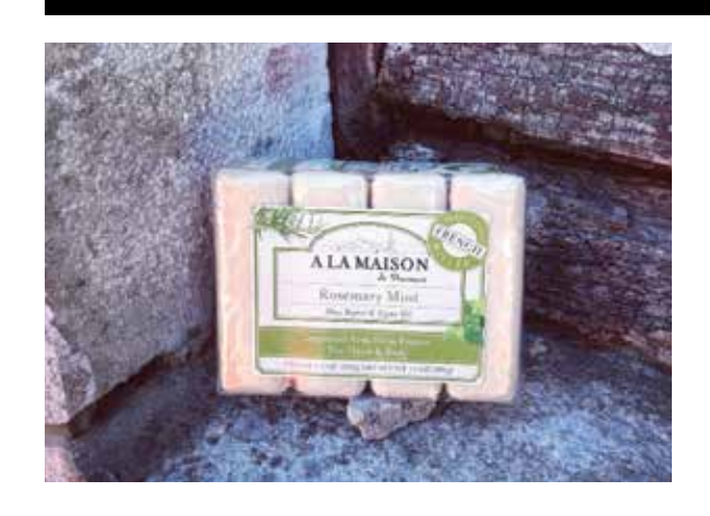
A La Maison BAR & LIQUID SOAP 25% OFF