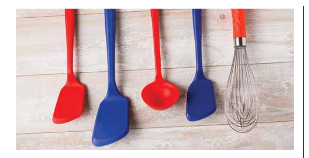
GIR KITCHEN GADGETS 20% OFF Save up to $4.00