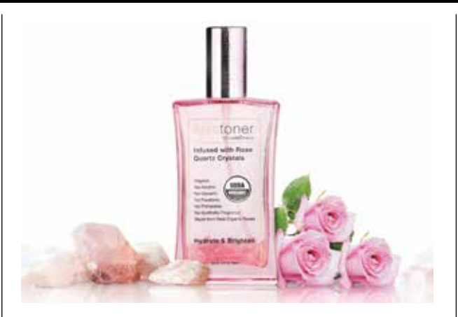
ALL SKIN CARE 20% OFF