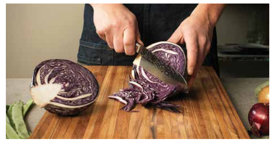
Teakhaus CUTTING BOARDS 20% OFF Save up to $39.80