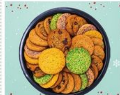
36 COUNT Cookie Party Tray $19 99