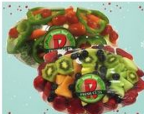
FRESH MADE IN OUR PRODUCE DEPARTMENT Vegetable or Fruit Luau Bowl $6 79 LB