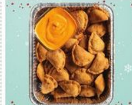
25 COUNT Mini Meat Pies Tray $25 99