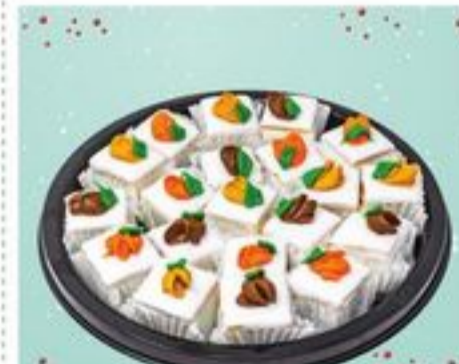
LARGE 20 CT White Almond Petit Fours $24 99