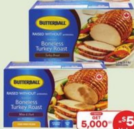
BUTTERBALL BONELESS TURKEY ROAST FROZEN 1.5 KG 20613995_EA/21377745_EA