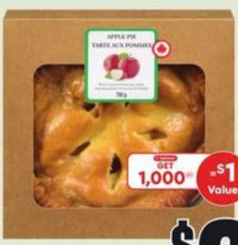
8 INCH PIE SELECTED VARIETIES 635-750 G 21297475_EA