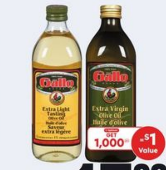
GALLO EXTRA VIRGIN OR LIGHT OLIVE OIL SELECTED VARIETIES 1 L 20069755_EA 20105368_EA