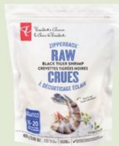
PC® BLACK TIGER SHRIMP RAW ZIPPERBACK® 16-20 PER LB 400 G FROZEN 20801192_EA