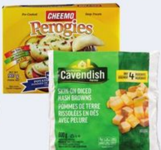
CHEEMO PEROGIES 745-907 G OR CAVENDISH HASHBROWNS 800 G SELECTED VARIETIES FROZEN 20527369_EA/21604103_EA