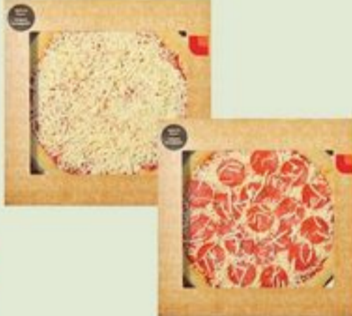
12" TAKE AND BAKE PIZZA SELECTED VARIETIES 510-739 G 21456393_EA 21456401_EA