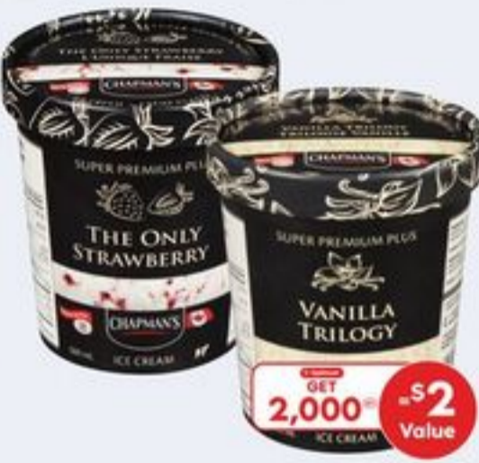
CHAPMAN'S SUPER PREMIUM PLUS ICE CREAM SELECTED VARIETIES FROZEN 500 ML 21511087_EA/21511200_EA