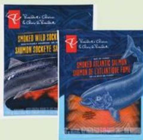
PC® SMOKED SALMON SELECTED VARIETIES FROZEN 125/150 G 20055009_EA 20108286_EA