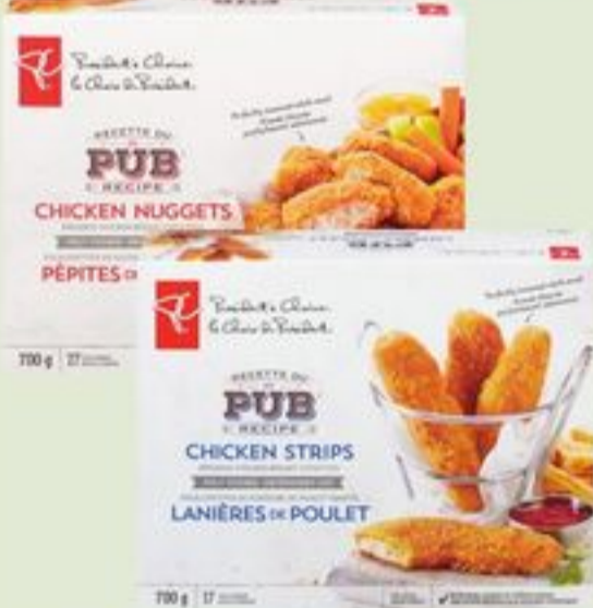
PC ® PUB RECIPE ™ OR GLUTEN-FREE CHICKEN SELECTED VARIETIES FROZEN 600/700 G 21201320_EA/21201321_EA