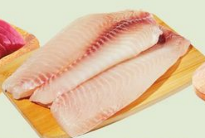
FRESH ASC TILAPIA FILLETS 22.02/KG 20897812_KG