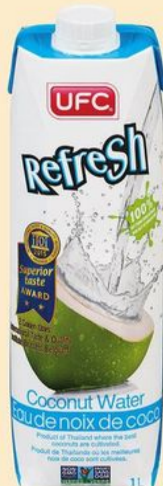
UFC REFRESH COCONUT WATER 1 L 20570506_EA