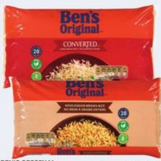
BEN'S ORIGINAL CONVERTED, WHOLE GRAIN OR LONG GRAIN RICE SELECTED VARIETIES 1.6/2.2 KG 21535549_EA 21535571_EA