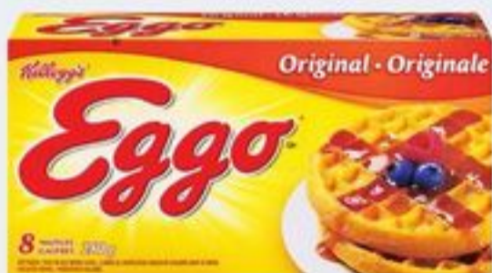
KELLOGG'S EGGO WAFFLES SELECTED VARIETIES FROZEN 8'S 20302779_EA