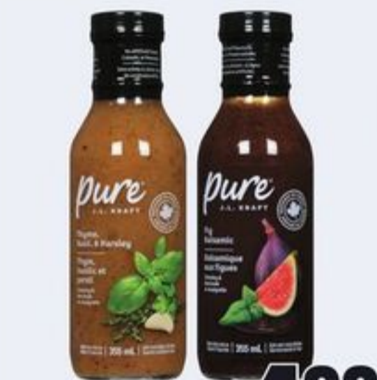
KRAFT PURE SALAD DRESSING 355 ML 21581628_EA