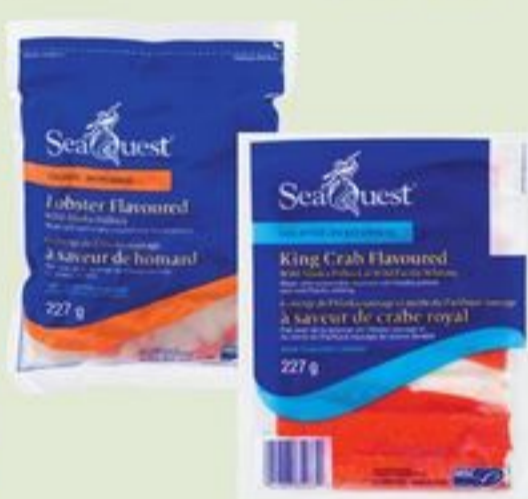
SEAQUEST® CRAB OR LOBSTER FLAVOURED POLLOCK FLAKES OR CHUNKS SELECTED VARIETIES READY-TO-EAT 227 G 20749798_EA/20749901_EA