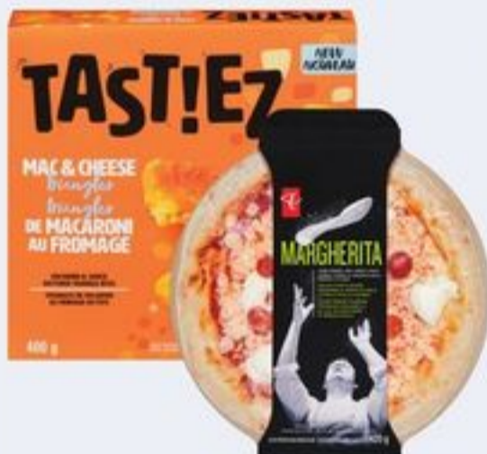
PC® BLACK LABEL PIZZA 370-420 G OR TASTIEZ SHAREABLES 400 G SELECTED VARIETIES FROZEN 21531415_EA/21564489_EA