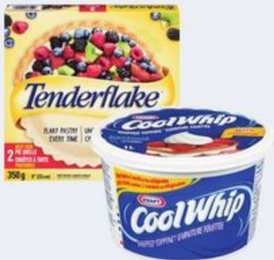
TENDERFLAKE PASTRY 255-397 G OR COOL WHIP DESSERT TOPPING 1 L SELECTED VARIETIES FROZEN 20030369001_EA/20303840001_EA