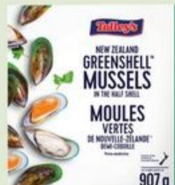
TALLEY'S NEW ZEALAND GREENSHELL MUSSELS FROZEN 907 G 21557953_EA