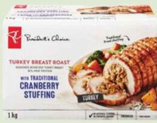
PC ® TURKEY STUFFED ROAST FROZEN 1 KG 20822446_EA