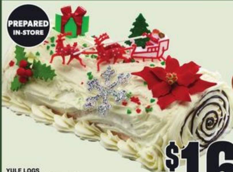
YULE LOGS WHITE OR CHOCOLATE 800 G 21955544_EA