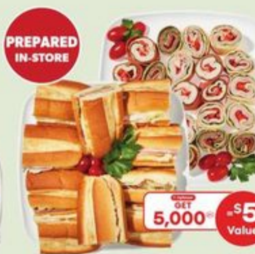
SANDWICH OR WRAP PLATTERS PREPARED IN-STORE 1.2-1.7 KG 21218193_EA 21558135_EA