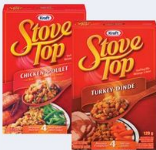
STOVE TOP STUFFING SELECTED VARIETIES 120 G 2009598001_EA/20310507001_EA