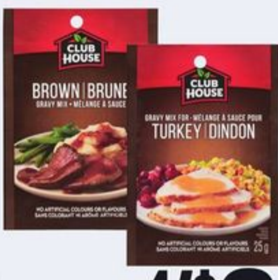
CLUB HOUSE GRAVY OR DRY SAUCE MIXES SELECTED VARIETIES 21-47 G 20302816001_EA 20302816004_EA