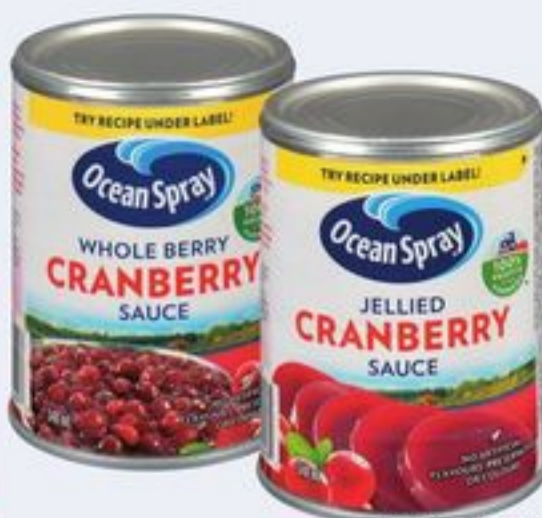
OCEAN SPRAY CRANBERRY SAUCE WHOLE OR JELLIED 348 ML 20022893001_EA/20022893002_EA