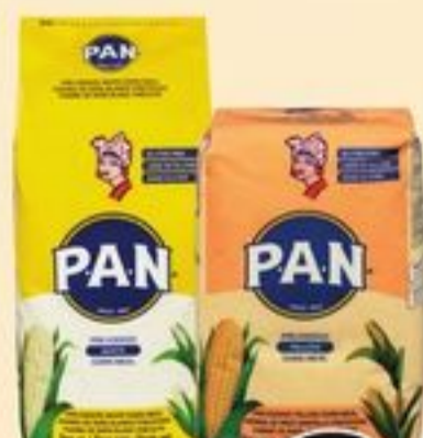
PAN YELLOW OR WHITE FLOUR 1 KG 20945695_EA 20945705_EA