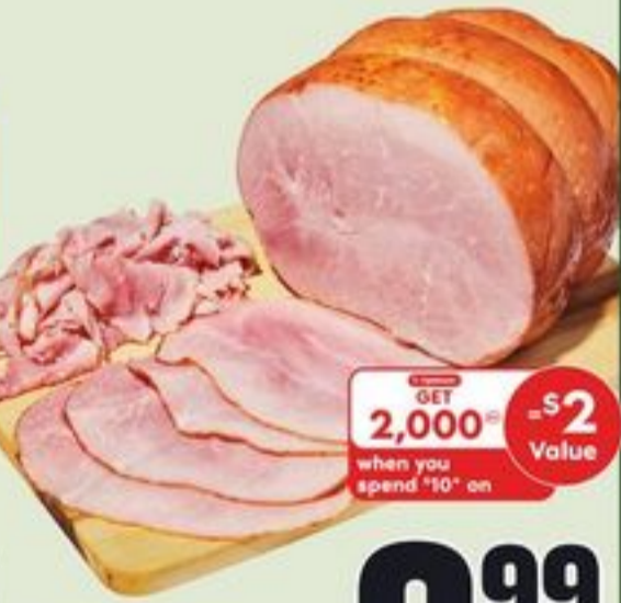
FROM OUR CHEFS SERVICE CASE HAMS SELECTED VARIETIES 29.92/KG 20974491_KG