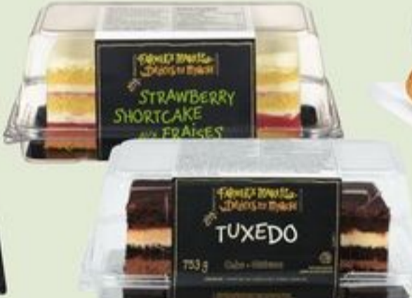
FARMER'S MARKET BAR CAKES SELECTED VARIETIES 675-770 G 21500612_EA 21500763_EA