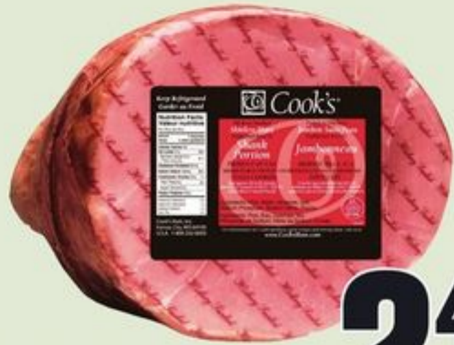
COOK'S PORTION HAM SHANK OR BUTT 5.49/KG 20555641_KG