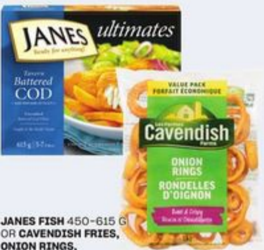
JANES FISH 450-615 G OR CAVENDISH FRIES, ONION RINGS, WEDGES OR HASHBROWNS 1-2.25 KG SELECTED VARIETIES FROZEN 20048538_EA 20827761_EA