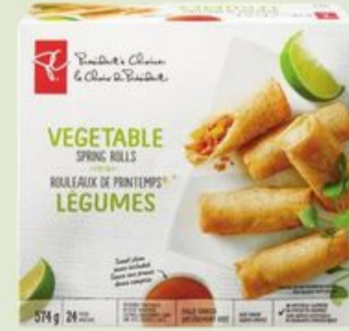
PC ® VEGETABLE SPRING ROLLS FROZEN 574 G 20698096_EA