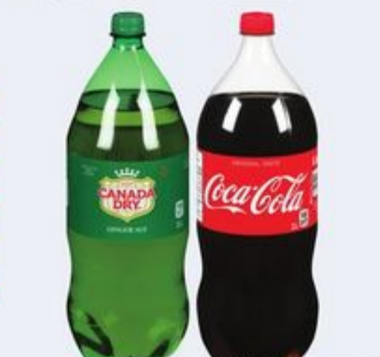
COCA-COLA OR CANADA DRY SOFT DRINKS SELECTED VARIETIES 2 L 20316026002_EA