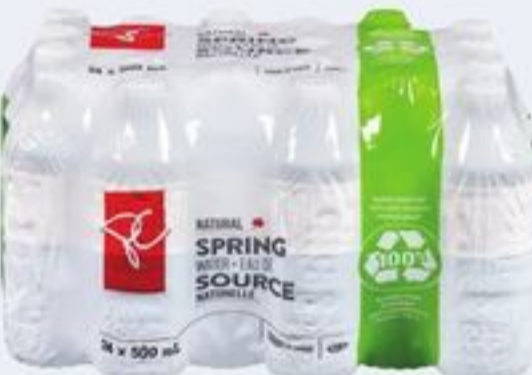
PC® SPRING WATER 24X500 ML 20137898_C24