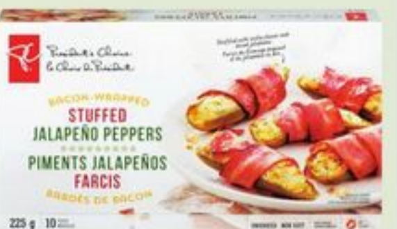
PC ® BACON WRAPPED STUFFED JALAPENO PEPPERS FROZEN 225 G 21048989_EA