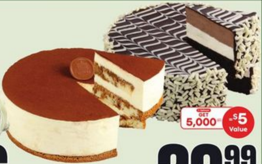
LA ROCCA 8 INCH OCCASION CAKES SELECTED VARIETIES 1.1-1.7 KG 21496165_EA/21624336_EA