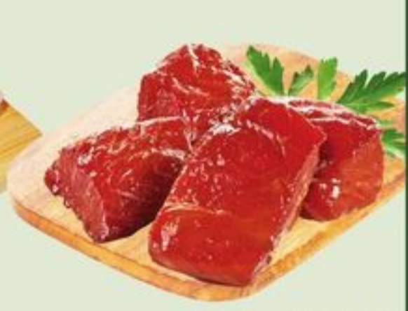
SMOKED SALMON NUGGETS PREVIOUSLY FROZEN 48.48/KG 21513259_KG