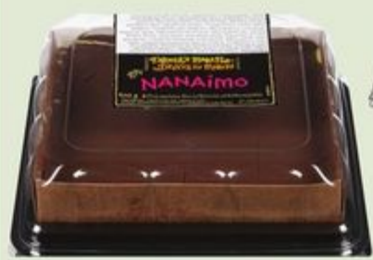
FARMER'S MARKET SQUARES SELECTED VARIETIES 400/450 G 21216501_EA