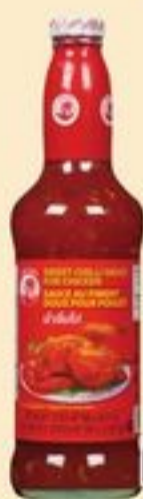
COCK BRAND SWEET CHILLI SAUCE 650 ML 20149074_EA