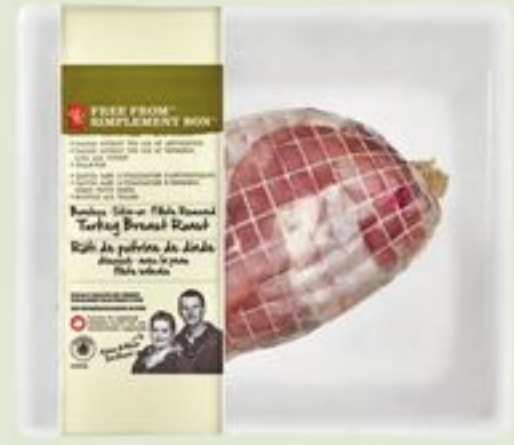
PC ® FREE FROM ™ TURKEY DOUBLE BREAST ROAST 21.99/KG 21124822_KG