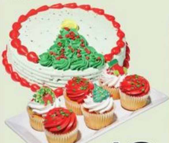
HOLIDAY THEME SINGLE LAYER CAKES OR CUPCAKES WHITE OR CHOCOLATE 6'S 21607143_EA/21642689_EA