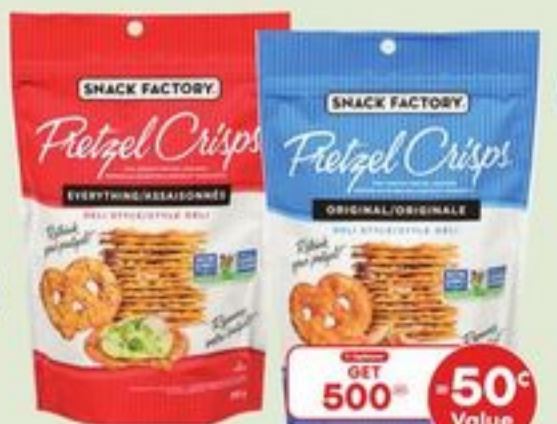
SNACK FACTORY PRETZEL CRISPS SELECTED VARIETIES 200 G 20948904_EA 20948940_EA