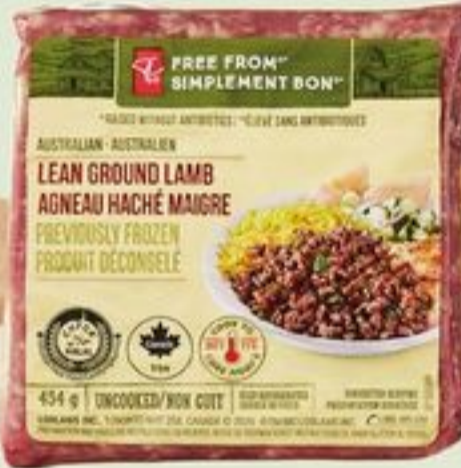
PC ® FREE FROM GROUND LAMB 454 G 21352008_EA