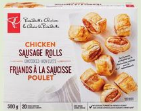
PC ® CHICKEN SAUSAGE ROLLS FROZEN 500 G 21439588_EA