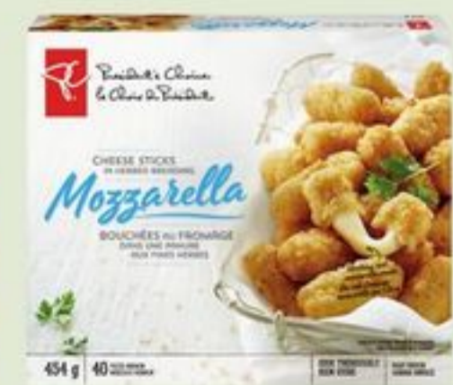
PC ® MOZZARELLA CHEESE STICKS FROZEN 454 G 21116020_EA