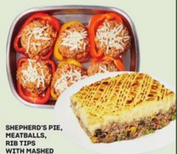
SHEPHERD'S PIE, MEATBALLS, RIB TIPS WITH MASHED POTATOES, MINI SLIDERS OR STUFFED PEPPERS 716 G-1.6 KG 21624670_EA 21624751_EA