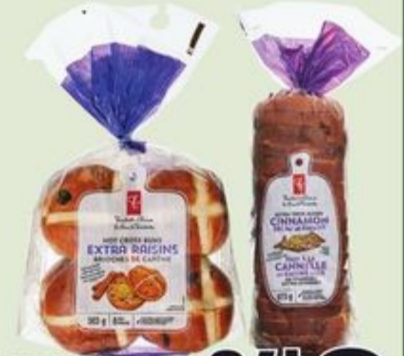
PC HOT CROSS BUN OR EXTRA THICK CINNAMON RAISIN BREAD 565/675 G 20639729_EA 21577822_EA