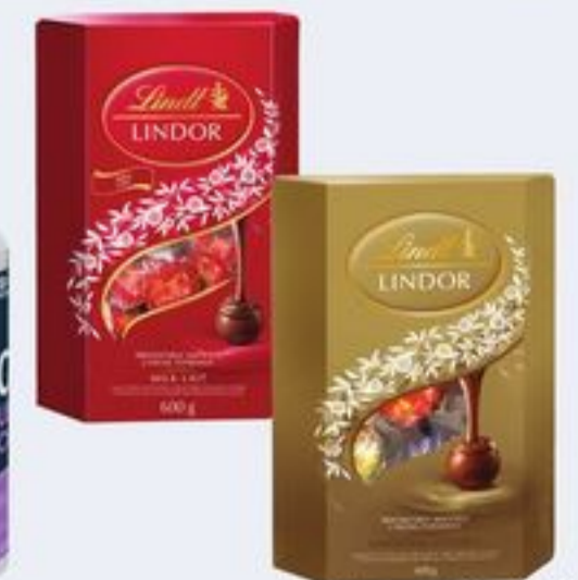
LINDT CORNET SELECTED VARIETIES 600 G 20215793001_EA 20215793002_EA