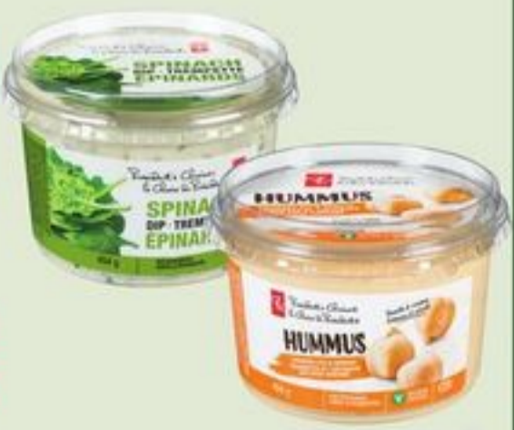
PC DIPS OR HUMMUS SELECTED VARIETIES 454 G 20584098_EA 20583725_EA