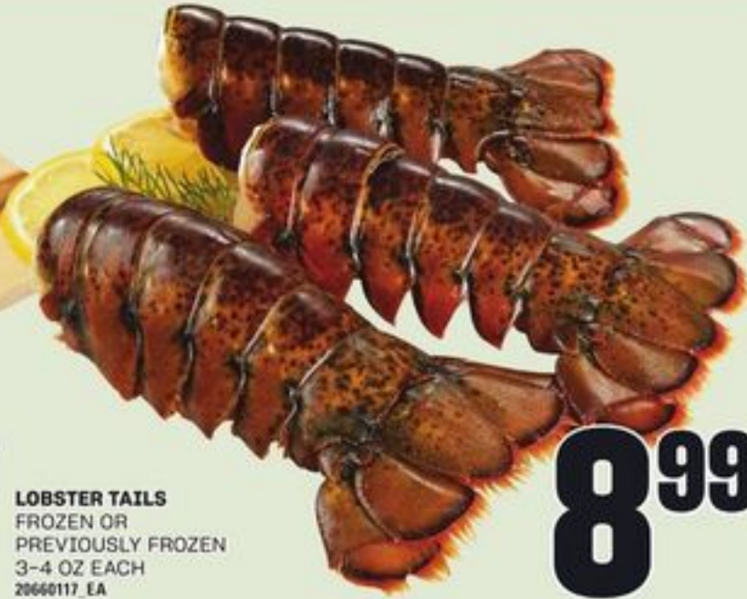
LOBSTER TAILS FROZEN OR PREVIOUSLY FROZEN 3-4 OZ EACH 20660117_EA