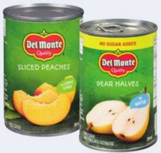
DEL MONTE CANNED FRUIT SELECTED VARIETIES 398 ML 20109862_EA/20296567008_EA