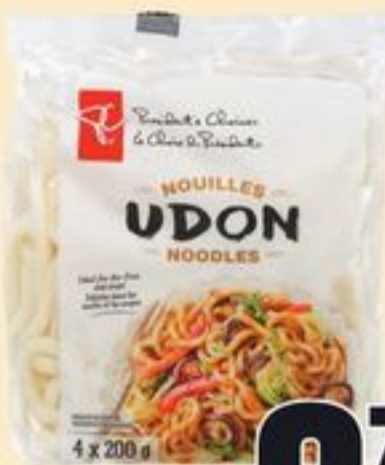
PC® UDON NOODLES 800 G 20354811_EA