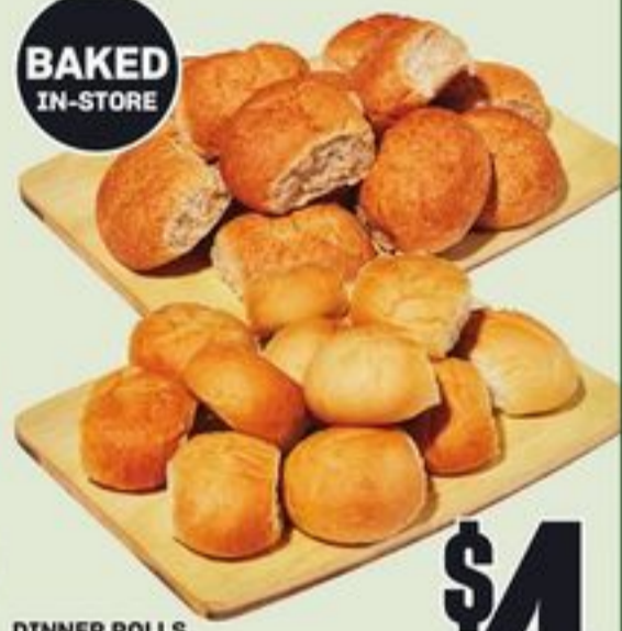
DINNER ROLLS WHITE OR WHEAT 12'S 21392649_EA/21392192_EA