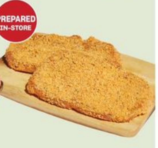
BREADED PORK LOIN SCHNITZEL 300 G 21588065_EA