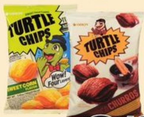
ORION TURTLE CHIPS SELECTED VARIETIES 160 G 21454276_EA/21454281_EA