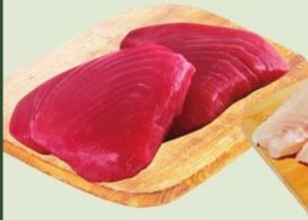
YELLOWFIN TUNA STEAKS PREVIOUSLY FROZEN 29.74/KG 21205360_KG