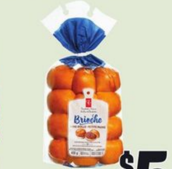
PC BRIOCHE MINI ROLLS 400 G 21410779_EA