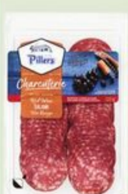
PILLER'S SLICED MEATS 125 G OR CASTELLO HAVARTI, CHEDDAR OR BLUE CHEESE 125-200 G SELECTED VARIETIES 20428574_EA 20574963_EA

GET 2,000 + - $2 Value when you spend "10" on