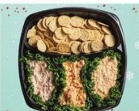
FEATURES SALMON, SHRIMP & CAJUN KRAB DIPS Seafood Dip Platter $28 99