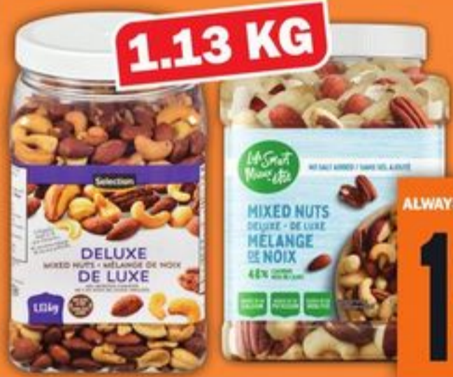
SELECTION OR LIFE SMART DELUXE MIXED NUTS 1.13 KG SELECTED VARIETIES