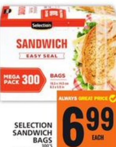
SELECTION SANDWICH BAGS SELECTED VARIETIES