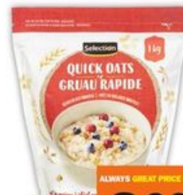
SELECTION OATS 1 KG INSTANT OATMEAL SELECTED VARIETIES