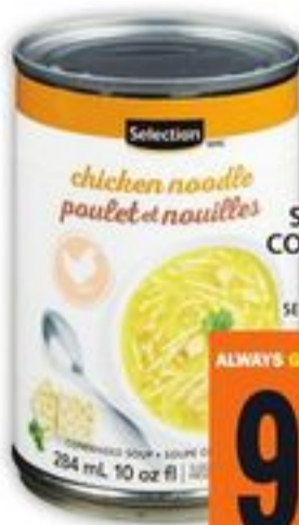
SELECTION CONDENSED SOUP 284 ML SELECTED VARIETIES