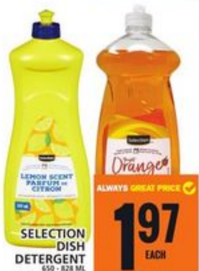
SELECTION DISH DETERGENT 450 - 528 ML SELECTED VARIETIES