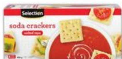
SELECTION SODA CRACKERS 454 G SELECTED VARIETIES