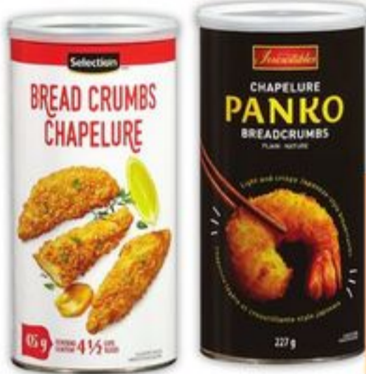
SELECTION OR IRRESISTIBLES BREADCRUMBS 227 - 425 G SELECTED VARIETIES