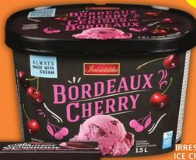
IRRESISTIBLES ICE CREAM 1.5 L NOVELTIES 4-5$ SELECTED VARIETIES