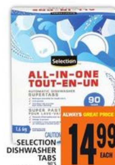
SELECTION DISHWASHER TABS 90'S SELECTED VARIETIES