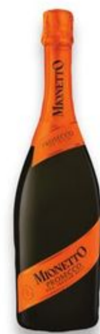
Mionetto Prosecco 750 ml $16.99