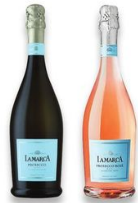
La Marca Prosecco or Prosecco Rose 750 ml $15.99