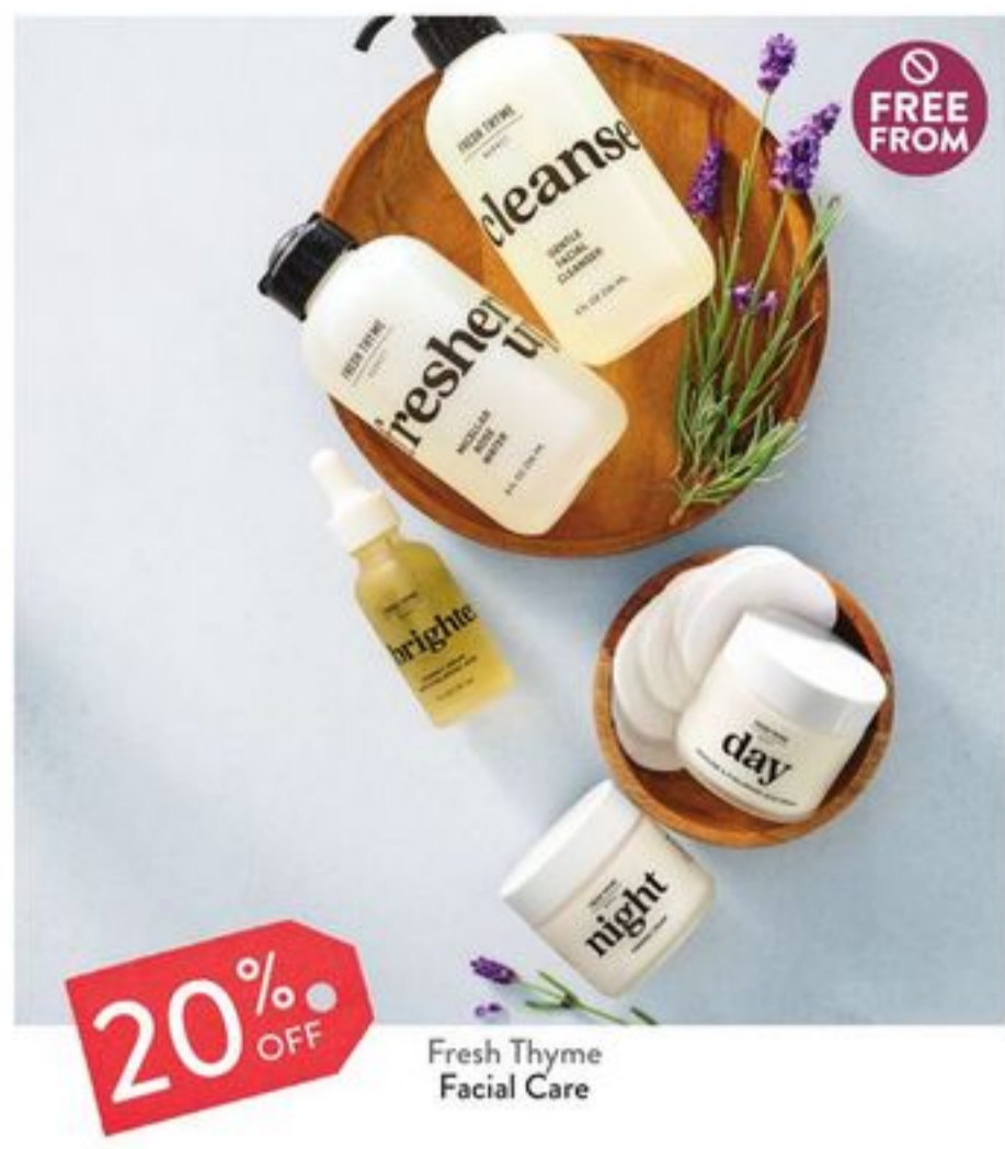
20% OFF Fresh Thyme Facial Care