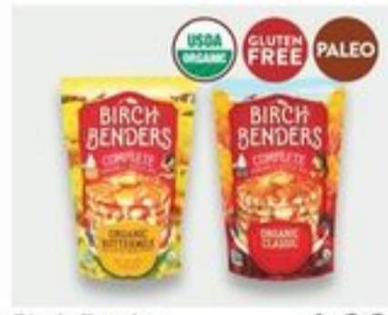
Birch Benders Organic, Gluten Free or Vegan Pancake & Waffle Mixes 12-16 oz 4.99