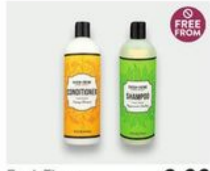
Fresh Thyme Hair Care select varieties 3.99