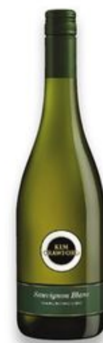
Kim Crawford Sauvignon Blanc 750 ml $13.99