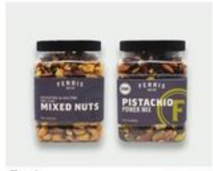
Ferris Nut and Snack Canisters 16 oz 8.99