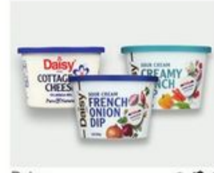
Daisy Cottage Cheese, French Onion or Ranch Dip 16 oz 2/$6