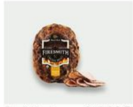
Boar's Head Flame-Grilled Chicken Breast 9.99LB