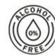
TOST Non-Alcoholic Sparkling Beverage select varieties, 750 ml $6.99