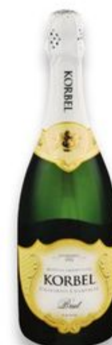
Korbel Brut 750 ml $11.99