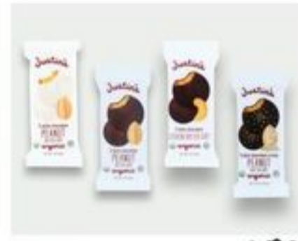
Justin's Peanut Butter Cups 1.38-1.4 oz 4/$9