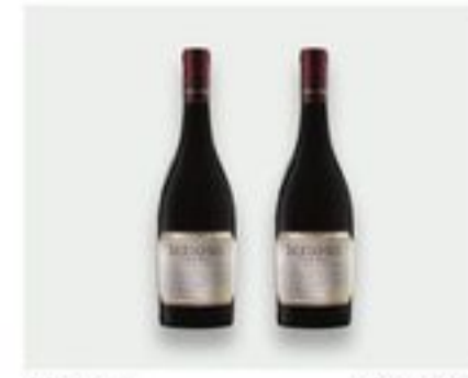
Meiomi Pinot Noir 750 ml 18.99