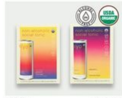
HIYO Non Alcoholic Social Tonic 4 pk, 12 oz 11.99