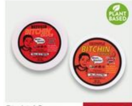
Bitchin' Sauce Plant Based Spreads 7-8 oz BOGO buy one get one free