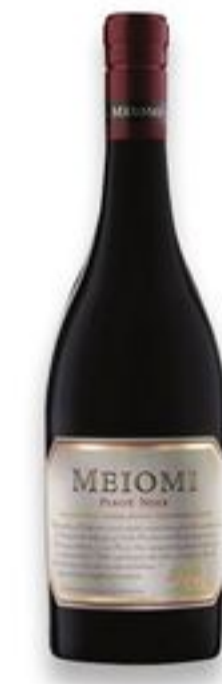
Meiomi Pinot Noir 750 ml $18.99