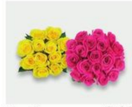
Dozen Roses 9.99