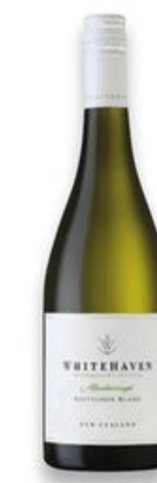
Whitehaven Sauvignon Blanc 750 ml $21.99