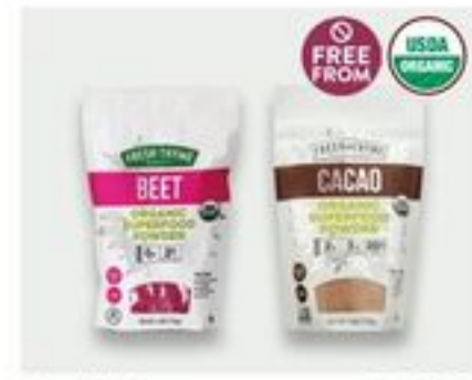
Fresh Thyme Organic Superfood Powder select varieties 5.99