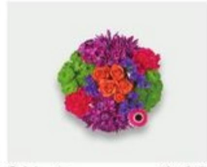
Celebration Bouquet 8.99