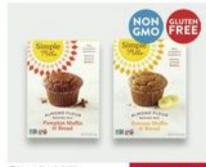
Simple Mills Baking Mixes 9-12.9 oz BOGO buy one get one free