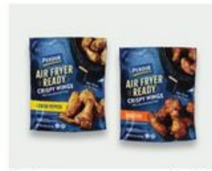
Perdue Air Fryer Ready Crispy Wings roasted or lemon pepper 22 oz 8.99