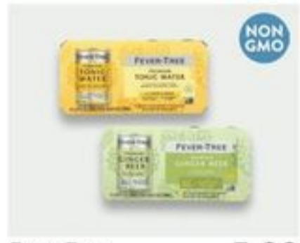
Fever-Tree Mixers 8 pk, 5.07 oz 5.99