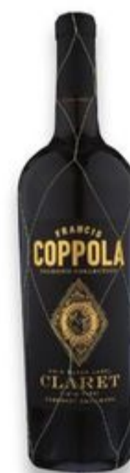
Coppola Claret 750 ml $17.99