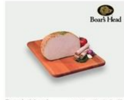
Boar's Head Mesquite Wood Smoked Turkey 10.99LB Boar's Head Smoked Gouda..... 9.99LB