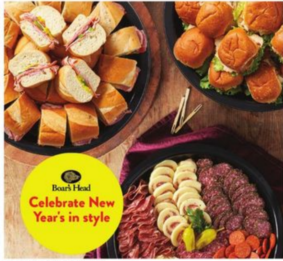
Boar's Head Party Platters orders require 48 hour notice