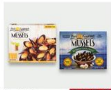
Pier 33 Gourmet Fully Cooked Mussels white wine, butter garlic or tomato garlic 16 oz BOGO buy one get one free