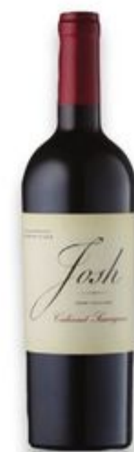
Josh Cellars Cabernet Sauvignon 750 ml $12.99