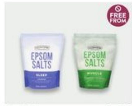
Fresh Thyme Epsom Salt 2 lb 4.99