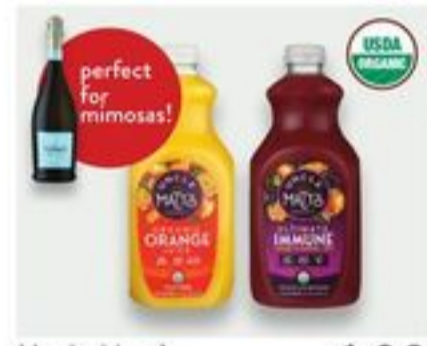
Uncle Matt's Organic Juice 52 oz LaMerca Prosecco 750 ml 6.99