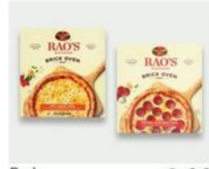
Rao's Frozen Pizza 18.3-20.8 oz 8.99