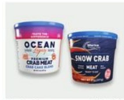
Marine Treasures Snow Crab Meat or Ocean Legacy Crab Cake Blend 8 oz 13.99