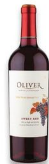
Oliver Sweet Red 750 ml $8.99