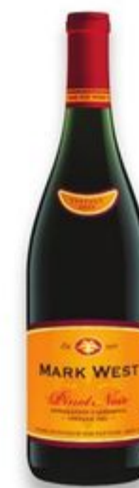
Mark West Pinot Noir 750 ml $10.99