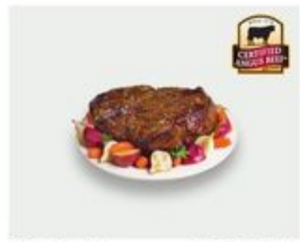
Certified Angus Beef® Boneless Chuck Roast 5.99LB