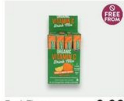
Fresh Thyme Vitamin C Effervescent 30 ct 9.99