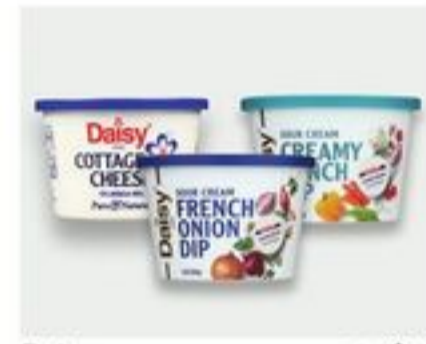
Daisy Cottage Cheese, French Onion or Ranch Dip 16 oz 2/$6