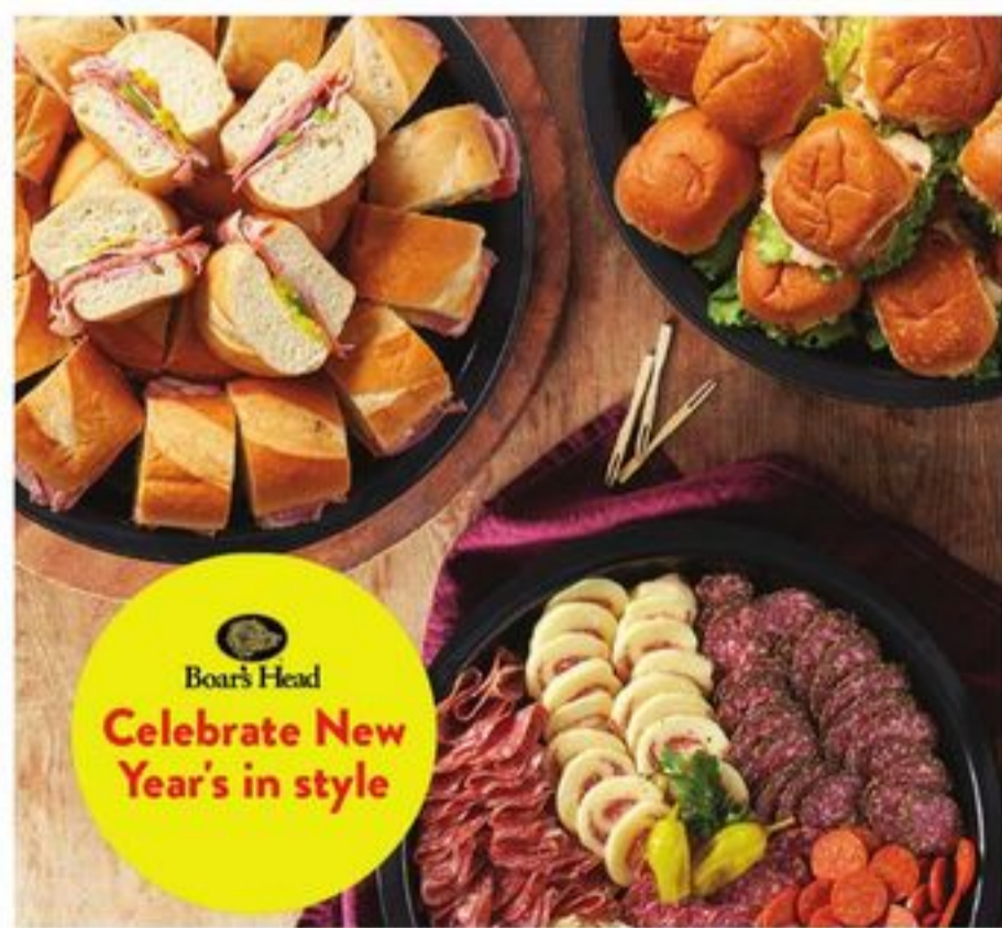
Boar's Head Party Platters orders require 48 hour notice