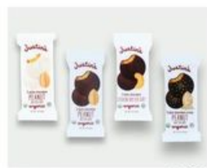
Justin's Peanut Butter Cups 1.38-1.4 oz 4/$9