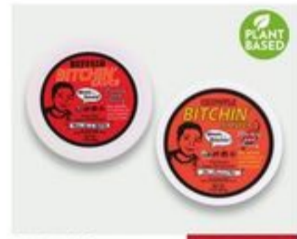
Bitchin' Sauce Plant Based Spreads 7-8 oz BOGO buy one get one free