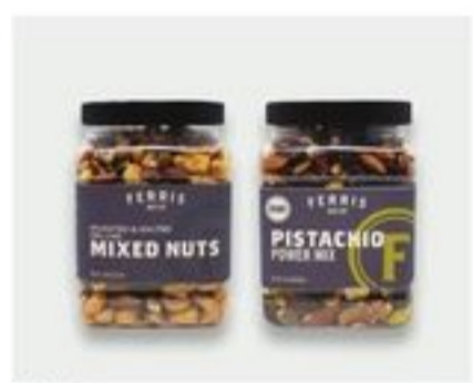
Ferris Nut and Snack Canisters 16 oz 8.99