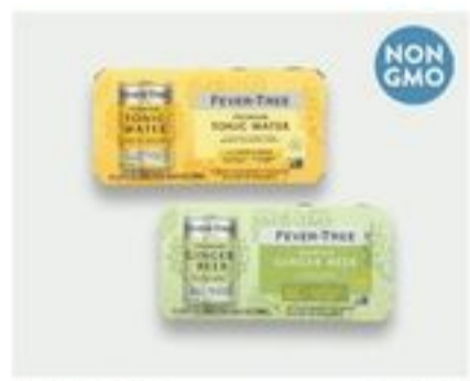
Fever-Tree Mixers 8 pk, 5.07 oz 5.99