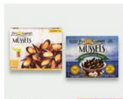
Pier 33 Gourmet Fully Cooked Mussels white wine, butter garlic or tomato garlic 16 oz BOGO buy one get one free