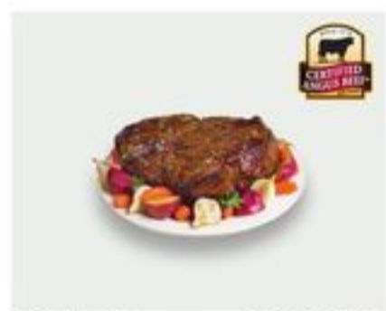
Certified Angus Beef® Boneless Chuck Roast 5.99LB