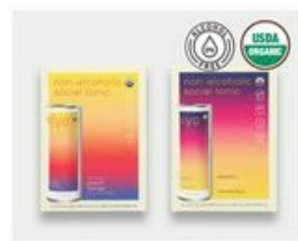
HIYO Non Alcoholic Social Tonic 4 pk, 12 oz 11.99