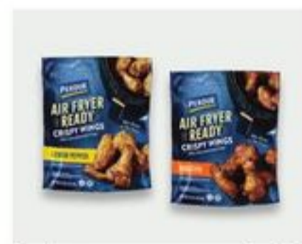
Perdue Air Fryer Ready Crispy Wings roasted or lemon pepper 22 oz 8.99