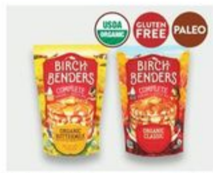
Birch Benders Organic, Gluten Free or Vegan Pancake & Waffle Mixes 12-16 oz 4.99