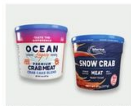
Marine Treasures Snow Crab Meat or Ocean Legacy Crab Cake Blend 8 oz 13.99