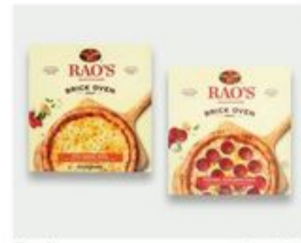
Rao's Frozen Pizza 18.3-20.8 oz 8.99