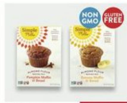
Simple Mills Baking Mixes 9-12.9 oz BOGO buy one get one free