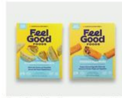
Feel Good Foods Frozen Appetizers 8.2-10 oz 7.49