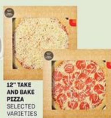
12" TAKE AND BAKE PIZZA SELECTED VARIETIES 510-739 G PIZZA 12 PO CUIRE À LA MAISON 21456393_EA 21456401_EA