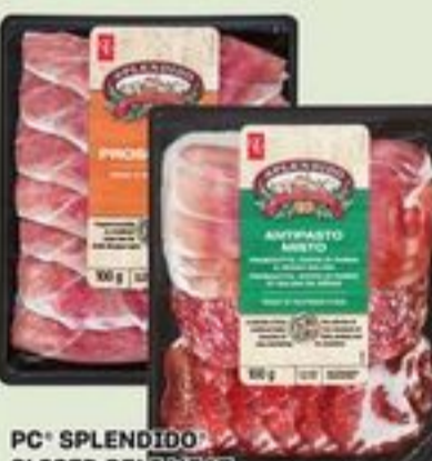
PC® SPLENDIDO™ SLICED DELI MEAT SELECTED VARIETIES 100 G CHARCUTERIES TRANCHÉES PC™ SPLENDIDO™ 21049131_EA/21050405_EA