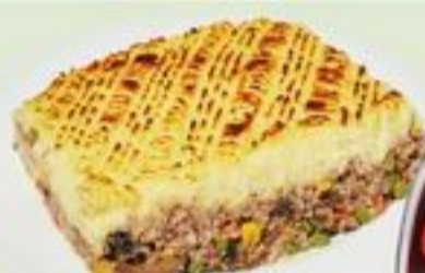
SHEPHERD'S PIE, MEATBALLS, RIB TIPS WITH MASHED POTATOES, MINI SLIDERS OR STUFFED PEPPERS PREPARED IN-STORE 716 G-1.6 KG PÂTE CHINOIS, BOULETTES DE VIANDE, BOUTS DE CÔTES AVEC PURÉE DE POMMES DE TERRE, MINI-BURGERS OU POIVRONS FARCIS 21624670_EA/21624751_EA