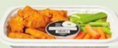
12 PIECE PRE-PACK SAUCED WINGS WITH CELERY AND CARROTS CHILLED 728 G 12 MORCEAUX D'AILES AVEC SAUCE PRÉEMBALLÉS AVEC CÉLERI ET CAROTTES 21532556_EA 21532557_EA