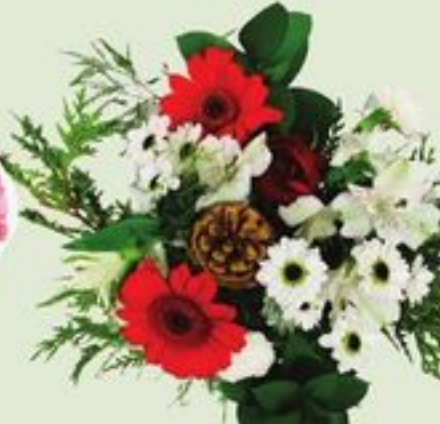
SIGNATURE HOLIDAY BOUQUET BOUQUETS DES FÊTES SIGNATURE 21087812_EA/21087813_EA