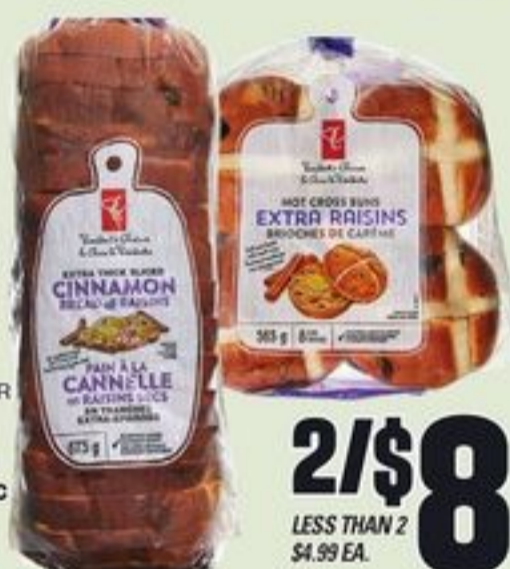
PC® HOT CROSS BUN 8'S OR EXTRA THICK CINNAMON RAISIN BREAD 675 G BRIQUES DE CARÈME OU PAIN À LA CANNELLE AVEC RAISINS EN TRANCHES EXTRA-ÉPAISSES PC™ 20639725_EA/21577822_EA