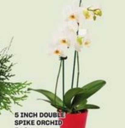
5 INCH DOUBLE SPIKE ORCHID EACH ORCHIDÉE À DEUX TIGES DANS UN POT DE 5 POUÇES 20293541_EA