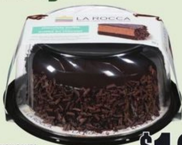
LA ROCCA 6 INCH CAKES SELECTED VARIETIES 600 G GÂTEAUX LA ROCCA, 6 POUÇES 20378142_EA