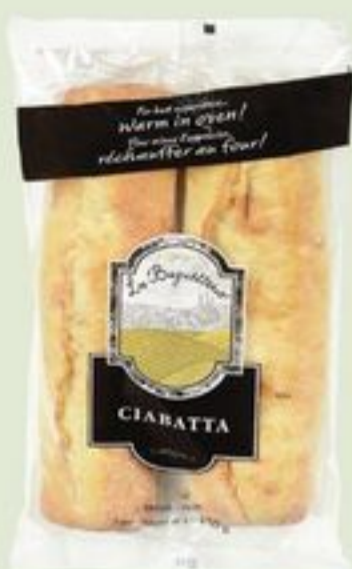
LA BAGUETTERIE DEMI CIABATTA 450 G DEMI-CIABATTA LA BAGUETTERIE 20833789_EA