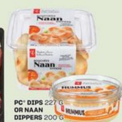
PC® DIPS 227 G OR NAAN DIPPERS 200 G SELECTED VARIETIES TREMPETTES OU BOUCHÉES NAAN PC™ 20584097_EA 21092033_EA