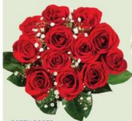
DOZEN ROSES ASSORTED COLOURS DOUZAINES DE ROSES 20581781_EA