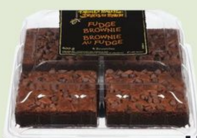
FARMER'S MARKET™ SQUARES SELECTED VARIETIES 400/450 G CARRÉS DÉLICÉS DU MARCHÉ™ 21216499_EA