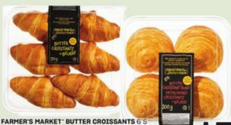
FARMER'S MARKET™ BUTTER CROISSANTS 6'S OR CROISSANT BUNS 4'S SELECTED VARIETIES CROISSANTS AU BEURRE OU PETITS-PAINS CROISSANTS AU BEURRE DÉLICÉS DU MARCHÉ™ 20975943_EA/21577824_EA