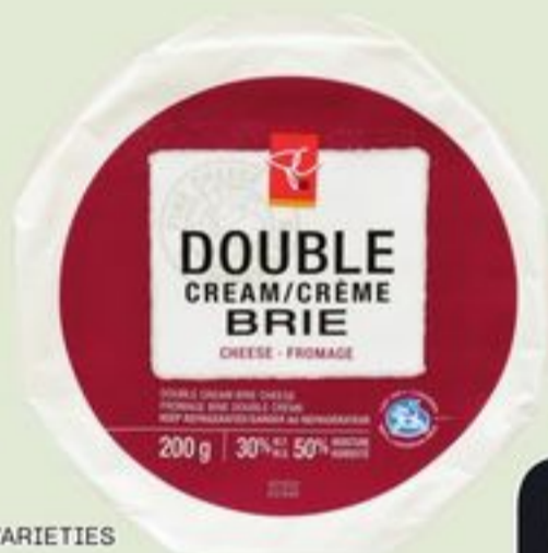
PC® BRIE SELECTED VARIETIES 170-200 G BRIE PC™ 20787327_EA