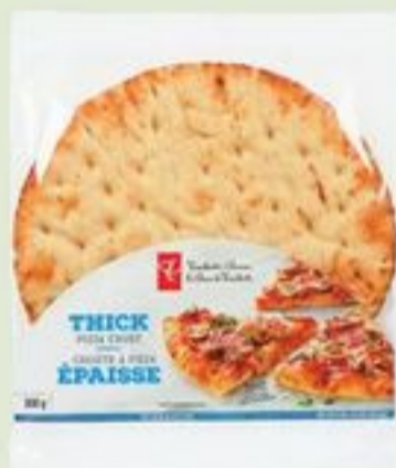
PC® PIZZA CRUST SELECTED VARIETIES 300/440 G CROÛTE À PIZZA PC™ 20896528_EA/21416545_EA