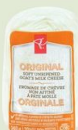
PC® GOAT CHEESE SELECTED VARIETIES 140 G FROMAGE DE CHÈVRE PC™ 20000584_EA/20296631_EA