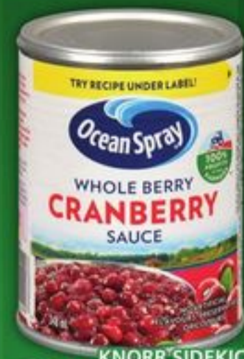
OCEAN SPRAY CRANBERRY SAUCE CAMPBELL'S BROTH 250 - 900 ML SELECTED VARIETIES