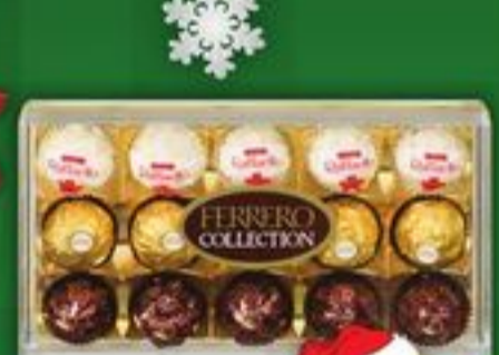
FERRERO CHOCOLATE BOX 156 G SELECTED VARIETIES WHILE QUANTITIES LAST