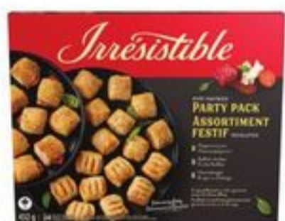
IRRESISTIBLE PARTY PACK PUFF PASTRIES OR GOURMET SAUSAGES APPETIZERS 422 - 488 G FROZEN SELECTED VARIETIES