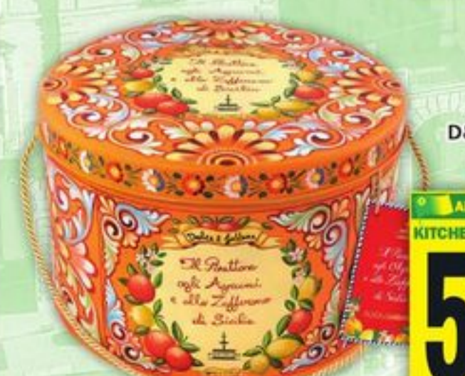
FIASCONARO D&G PANETTONE 1 KG SELECTED VARIETIES WHILE QUANTITIES LAST

ALL AISLES LEAD HOME KITCHENS OF THE WORLD 39 99 EACH