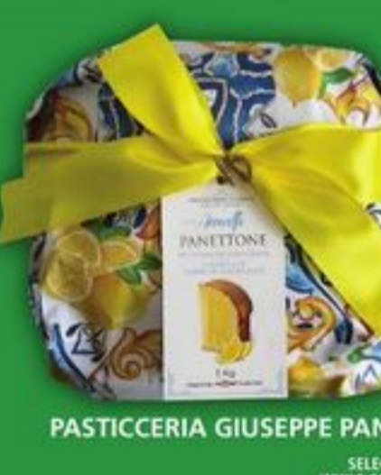
PASTICCERIA GIUSEPPE PANETTONE 1 KG SELECTED VARIETIES WHILE QUANTITIES LAST

ALL AISLES LEAD HOME KITCHENS OF THE WORLD 22 99 EACH