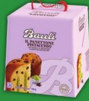
BAULI FLAVORED PANDORO OR PANETTONE 750 - 820 G SELECTED VARIETIES WHILE QUANTITIES LAST

ALL AISLES LEAD HOME KITCHENS OF THE WORLD 17 99 EACH