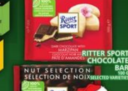
RITTER SPORT NUT SELECTION CHOCOLATE BAR 100 G SELECTED VARIETIES