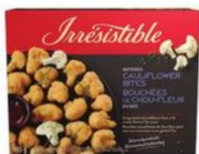
IRRESISTIBLE CAULIFLOWER BITES OR LOADED POTATO TOTS APPETIZERS 258 - 403 G FROZEN SELECTED VARIETIES