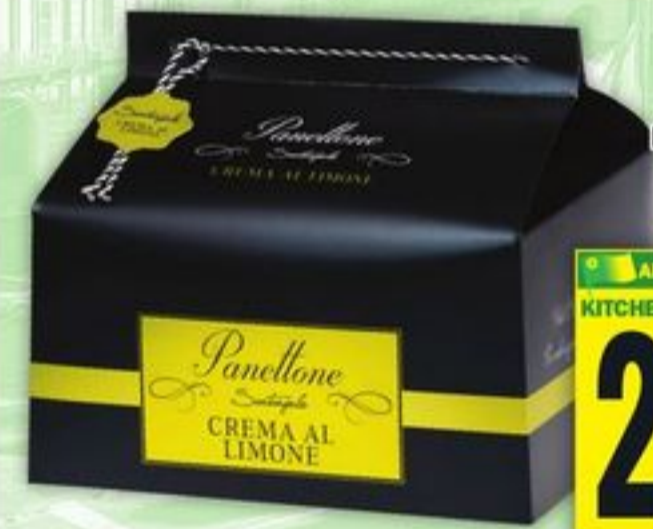
SANTANGELO PANETTONE OR PANDORO 900 G SELECTED VARIETIES WHILE QUANTITIES LAST

ALL AISLES LEAD HOME KITCHENS OF THE WORLD 17 99 EACH