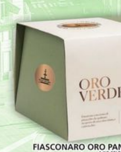
FIASCONARO ORO PANETTONE 1 KG SELECTED VARIETIES WHILE QUANTITIES LAST

ALL AISLES LEAD HOME KITCHENS OF THE WORLD 59 99 EACH