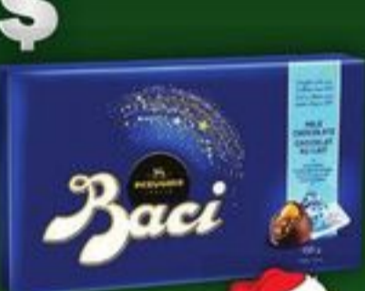
PERUGINA BACI CHOCOLATES SELECTED VARIETIES