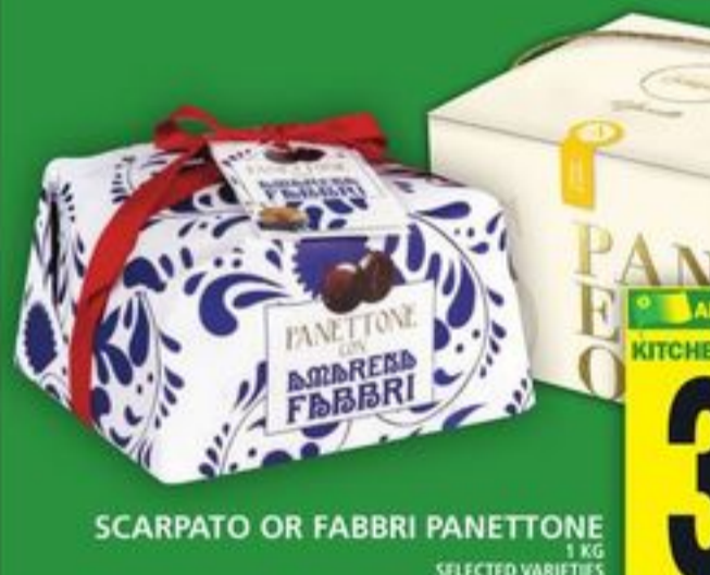
SCARPATO OR FABBRI PANETTONE 1 KG SELECTED VARIETIES WHILE QUANTITIES LAST

ALL AISLES LEAD HOME KITCHENS OF THE WORLD 23 99 EACH