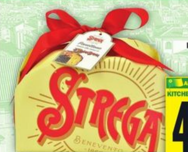
STREGA PANETTONE OR PANDORO 1 KG SELECTED VARIETIES WHILE QUANTITIES LAST

ALL AISLES LEAD HOME KITCHENS OF THE WORLD 27 99 EACH