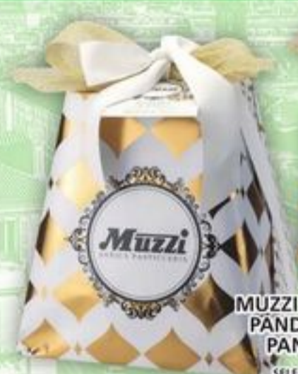
MUZZI CLASSIC PANDORO OR PANETTONE 750 G, 1 KG SELECTED VARIETIES WHILE QUANTITIES LAST

ALL AISLES LEAD HOME KITCHENS OF THE WORLD 44 99 EACH