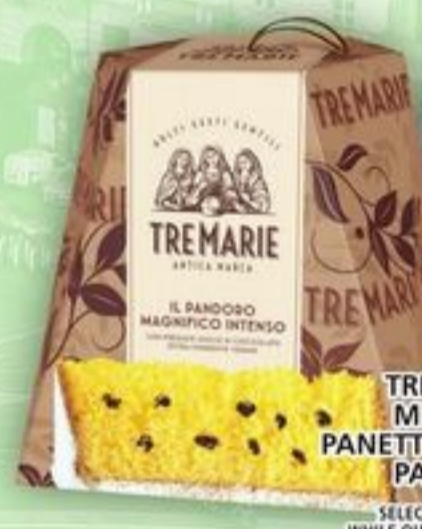
TRE MARIE MILANESE PANETTONE OR PANDORO 800 G, 1 KG SELECTED VARIETIES WHILE QUANTITIES LAST

ALL AISLES LEAD HOME KITCHENS OF THE WORLD 23 99 EACH