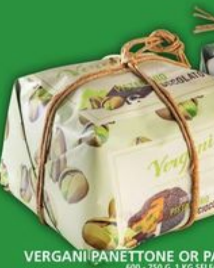
VERGANI PANETTONE OR PANDORO 600 - 750 G, 1 KG SELECTED VARIETIES WHILE QUANTITIES LAST

ALL AISLES LEAD HOME KITCHENS OF THE WORLD 31 99 EACH