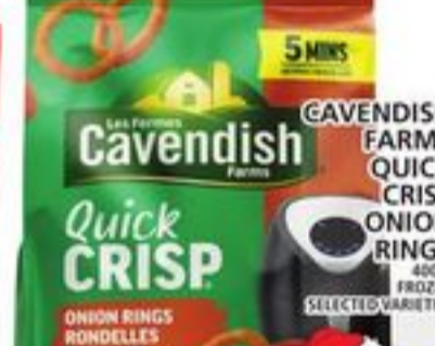
CAVENDISH QUICK CRISP ONION RINGS 400 G FROZEN SELECTED VARIETIES