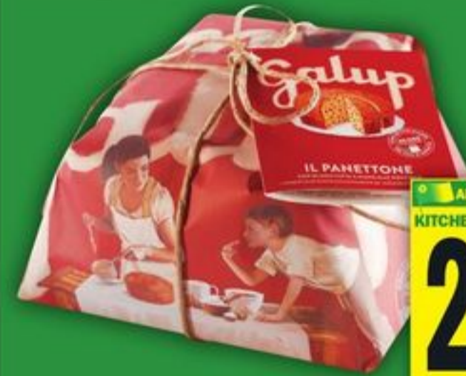
GALUP TRADITIONAL PANETTONE 750 G SELECTED VARIETIES WHILE QUANTITIES LAST

ALL AISLES LEAD HOME KITCHENS OF THE WORLD 23 99 EACH