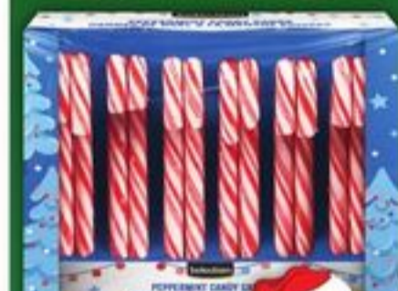
SELECTION CANDY CANS SELECTED VARIETIES WHILE QUANTITIES LAST