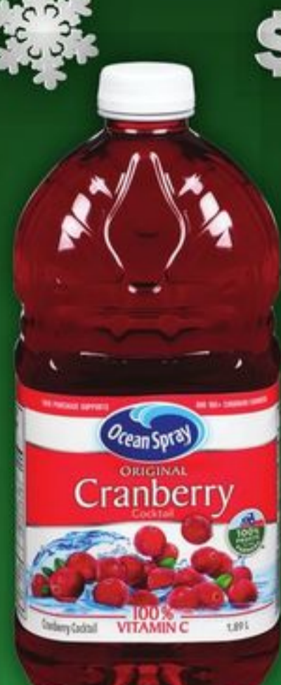
OCEAN SPRAY CRANBERRY COCKTAIL OR JUICE BLENDS 1.77 - 1.83 L SELECTED VARIETIES