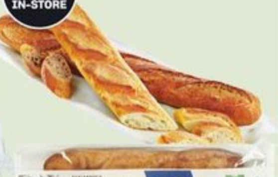
ACE BAKERY BAGUETTE SELECTED VARIETIES 325-400 G 26171171_EA 21314348_EA