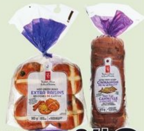
PC HOT CROSS BUN OR EXTRA THICK CINNAMON RAISIN BREAD 565/675 G 20639729_EA 21577822_EA