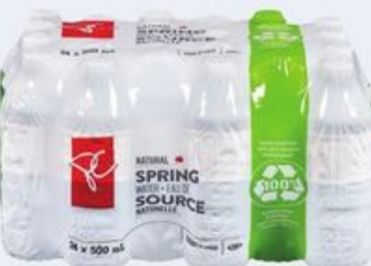
PC® SPRING WATER 24X500 ML 20137898_C24