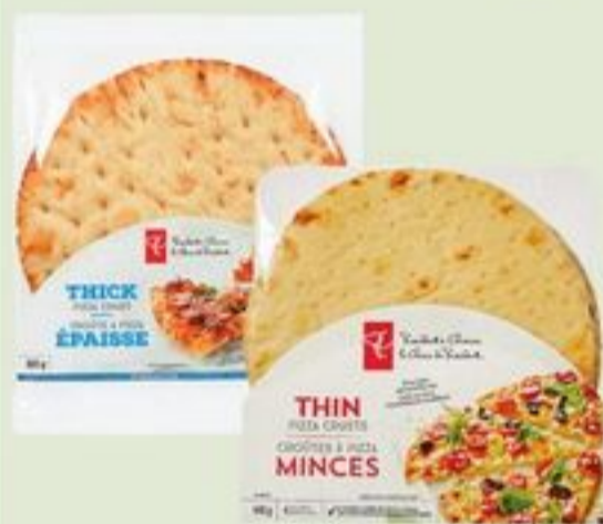
PC PIZZA CRUST SELECTED VARIETIES 300/440 G 20896528_EA 21416545_EA