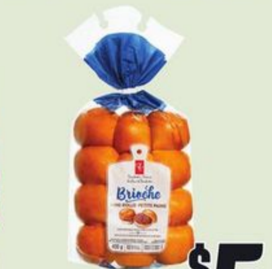
PC BRIOCHE MINI ROLLS 400 G 21410779_EA