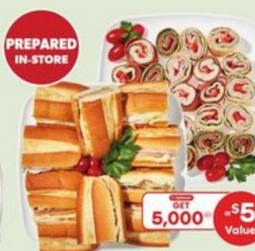
SANDWICH OR WRAP PLATTERS PREPARED IN-STORE 1.2-1.7 KG 21218193_EA 21558135_EA