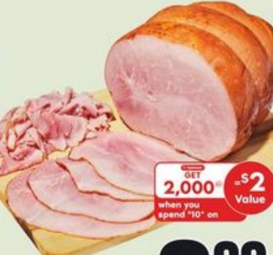
FROM OUR CHEFS SERVICE CASE HAMS SELECTED VARIETIES 29.92/KG 20974491_KG