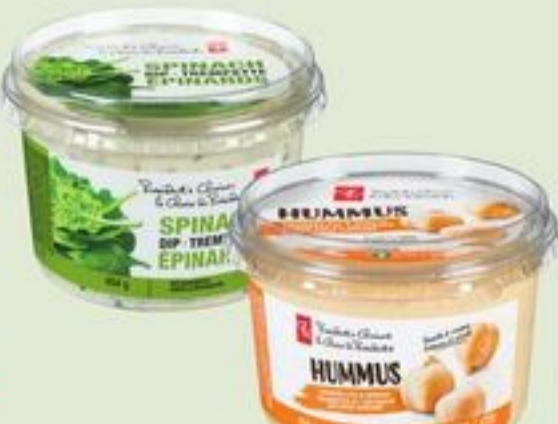
PC DIPS OR HUMMUS SELECTED VARIETIES 454 G 20584098_EA 20583725_EA