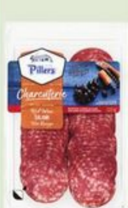
PILLER'S SLICED MEATS 125 G OR CASTELLO HAVARTI, CHEDDAR OR BLUE CHEESE 125-200 G SELECTED VARIETIES 20428574_EA 20574963_EA

GET 2,000 + Value when you spend "10" on