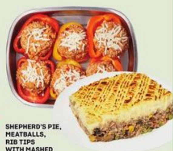
SHEPHERD'S PIE, MEATBALLS, RIB TIPS WITH MASHED POTATOES, MINI SLIDERS OR STUFFED PEPPERS 716 G-1.6 KG 21624670_EA 21624751_EA