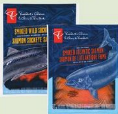
PC® SMOKED SALMON SELECTED VARIETIES FROZEN 125/150 G 20055009_EA 20108286_EA