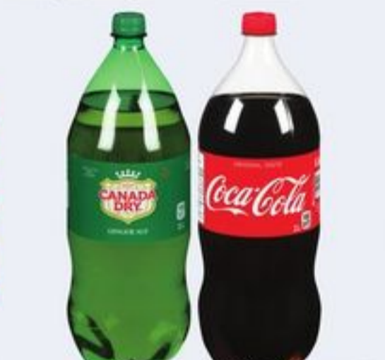
COCA-COLA OR CANADA DRY SOFT DRINKS SELECTED VARIETIES 2 L 20316026002_EA