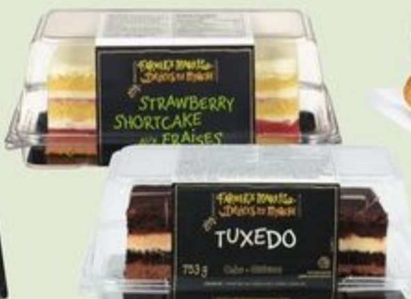
FARMER'S MARKET BAR CAKES SELECTED VARIETIES 675-770 G 21500612_EA 21500763_EA