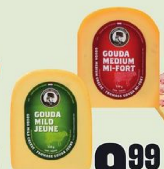
HENRI WILLIG GOUDA 350 G 21345046_EA