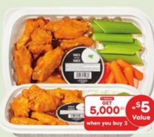
12 PIECE PRE-PACK SAUCED WINGS WITH CELERY AND CARROTS CHILLED 728 G 21532565_EA 21532557_EA