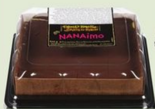
FARMER'S MARKET SQUARES SELECTED VARIETIES 400/450 G 21216501_EA