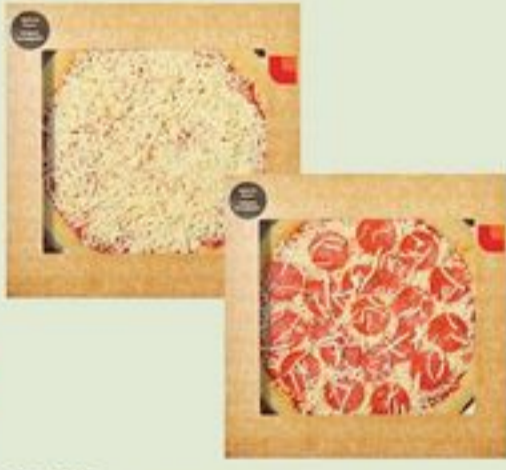
12" TAKE AND BAKE PIZZA SELECTED VARIETIES 510-739 G 21456393_EA 21456401_EA