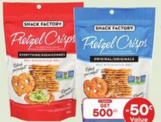
SNACK FACTORY PRETZEL CRISPS SELECTED VARIETIES 200 G 20948904_EA 20948940_EA