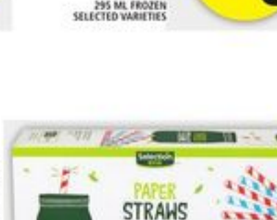
SELECTION ECO STRAWS 100'S SELECTED VARIETIES