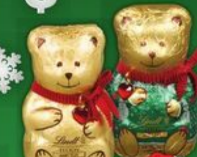
LINDT CHRISTMAS CHOCOLATE TEDDY 100 G SELECTED VARIETIES WHILE QUANTITIES LAST