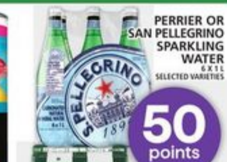
PERRIER OR SAN PELLEGRINO SPARKLING WATER 500 ML SELECTED VARIETIES