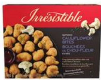
IRRESISTIBLE CAULIFLOWER BITES OR LOADED POTATO TOTS APPETIZERS 278 - 403 G FROZEN SELECTED VARIETIES