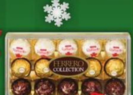
FERRERO CHOCOLATE BOX 156 G SELECTED VARIETIES WHILE QUANTITIES LAST