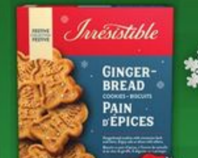
IRRESISTIBLE GINGERBREAD 200 G SELECTED VARIETIES WHILE QUANTITIES LAST