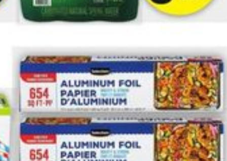
SELECTION ALUMINUM FOIL 300 M SELECTED VARIETIES

ALWAYS FRESH. *ALWAYS IN STOCK. ALWAYS GREAT PRICES.