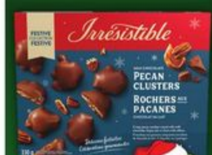
IRRESISTIBLE PECAN CLUSTERS 150 G WHILE QUANTITIES LAST