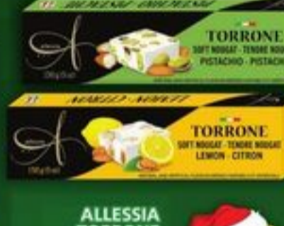
ALESSIA TORRONE 125 G SELECTED VARIETIES WHILE QUANTITIES LAST