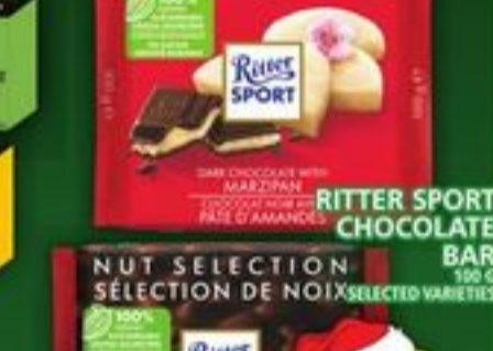
RITTER SPORT NUT SELECTION CHOCOLATE BAR 100 G SELECTED VARIETIES