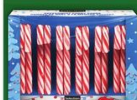
SELECTION CANDY CANS 100 G SELECTED VARIETIES WHILE QUANTITIES LAST