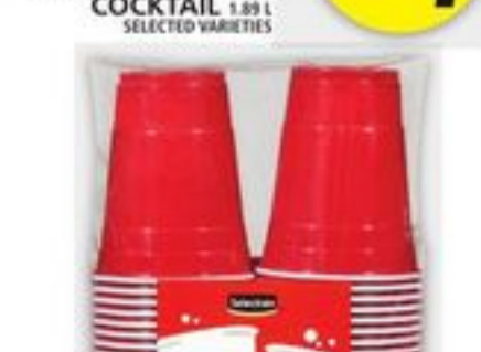
SELECTION PLASTIC RED GLASSES 50 SELECTED VARIETIES