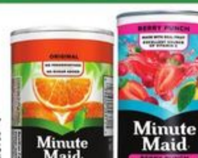
MINUTE MAID ORANGE JUICE OR DRINKS 200 G SELECTED VARIETIES