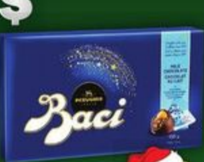
PERUGINA BACI CHOCOLATES 150 G SELECTED VARIETIES