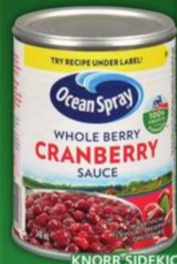
OCEAN SPRAY WHOLE BERRY CRANBERRY SAUCE 250 - 900 ML SELECTED VARIETIES