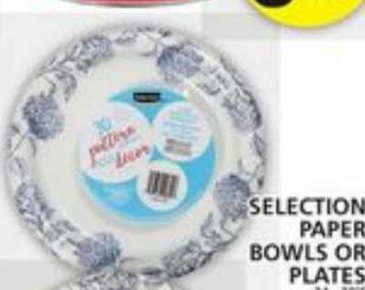
SELECTION PAPER BOWLS OR PLATES 24 - 30'S SELECTED VARIETIES