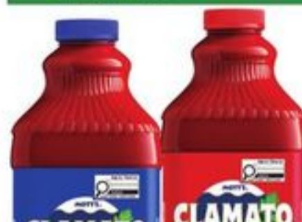
MOTT'S CLAMATO COCKTAIL 1.89 L SELECTED VARIETIES