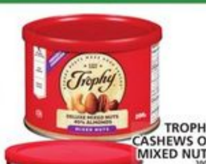
TROPHY CASHEWS OR MIXED NUTS 200 G SELECTED VARIETIES