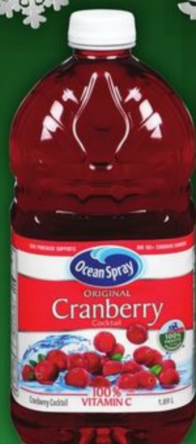
OCEAN SPRAY CRANBERRY COCKTAIL OR JUICE BLENDS 1.77 - 1.83 L SELECTED VARIETIES